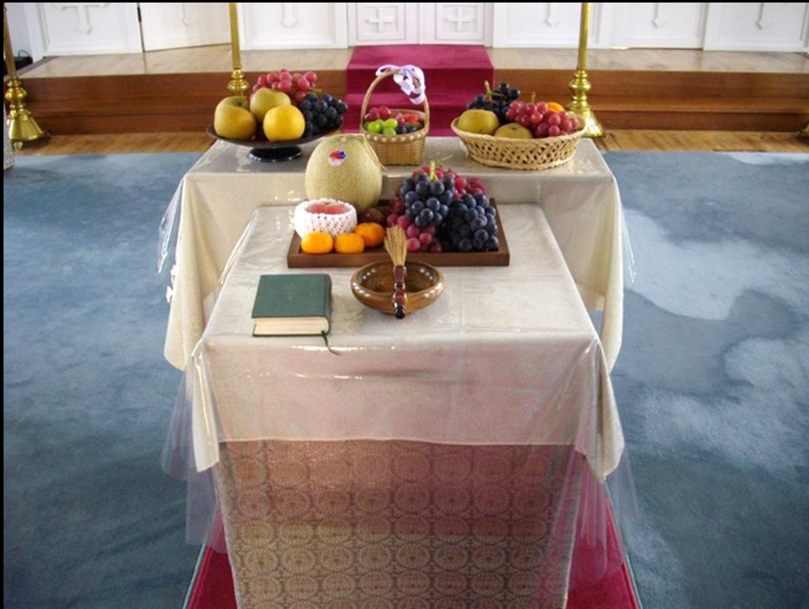
Altar Offering of First Fruits, Japanese Orthodox Holy Resurrection Cathedral, Tokyo, Japan