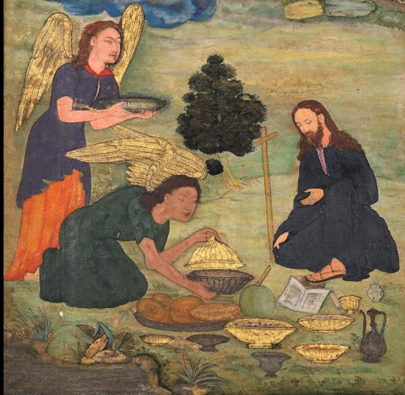
Angels Bring Bread to Jesus in the Wilderness -- India, early 17 th c.