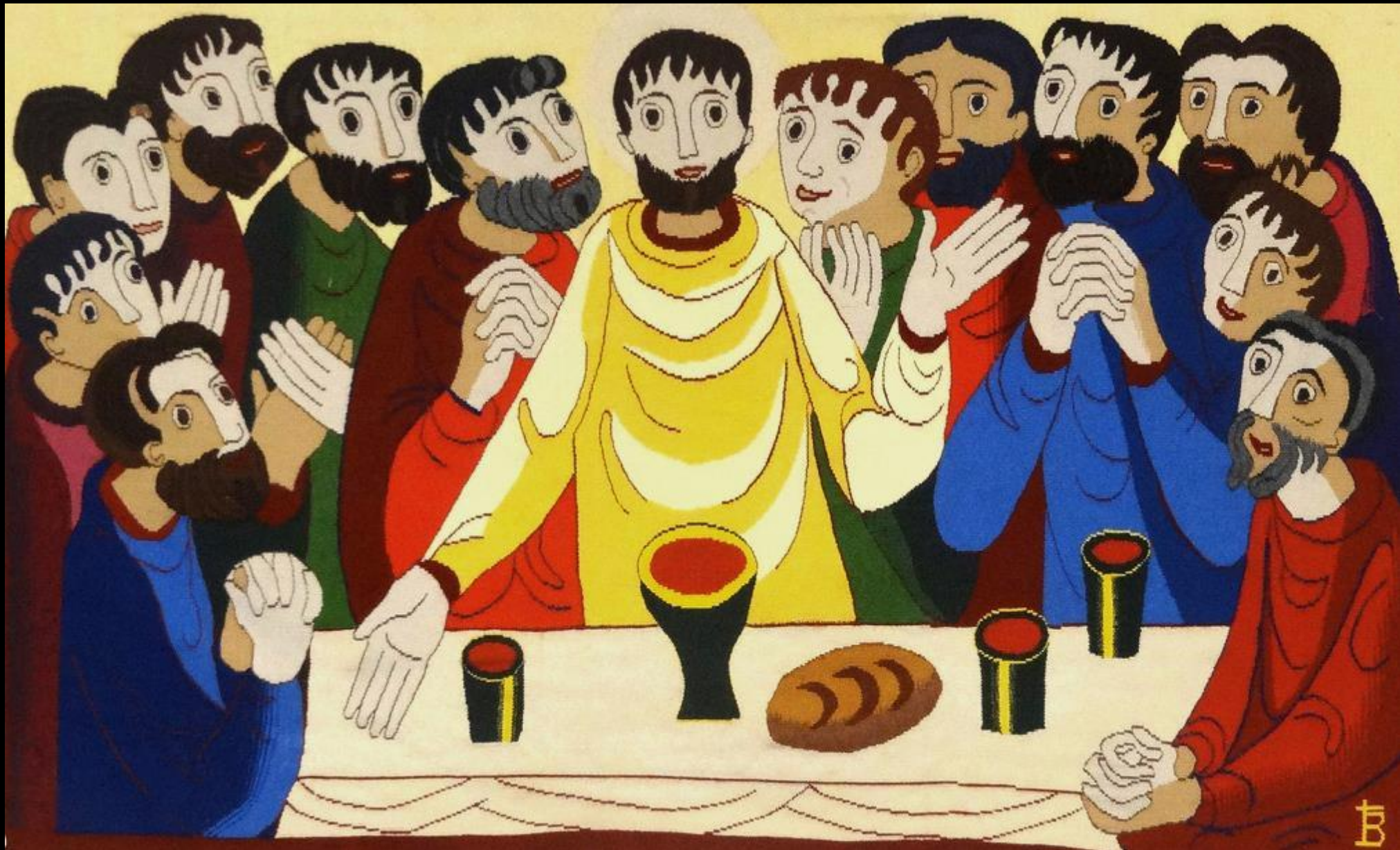
The Last Supper -- Bose Monastery, Bose, Italy