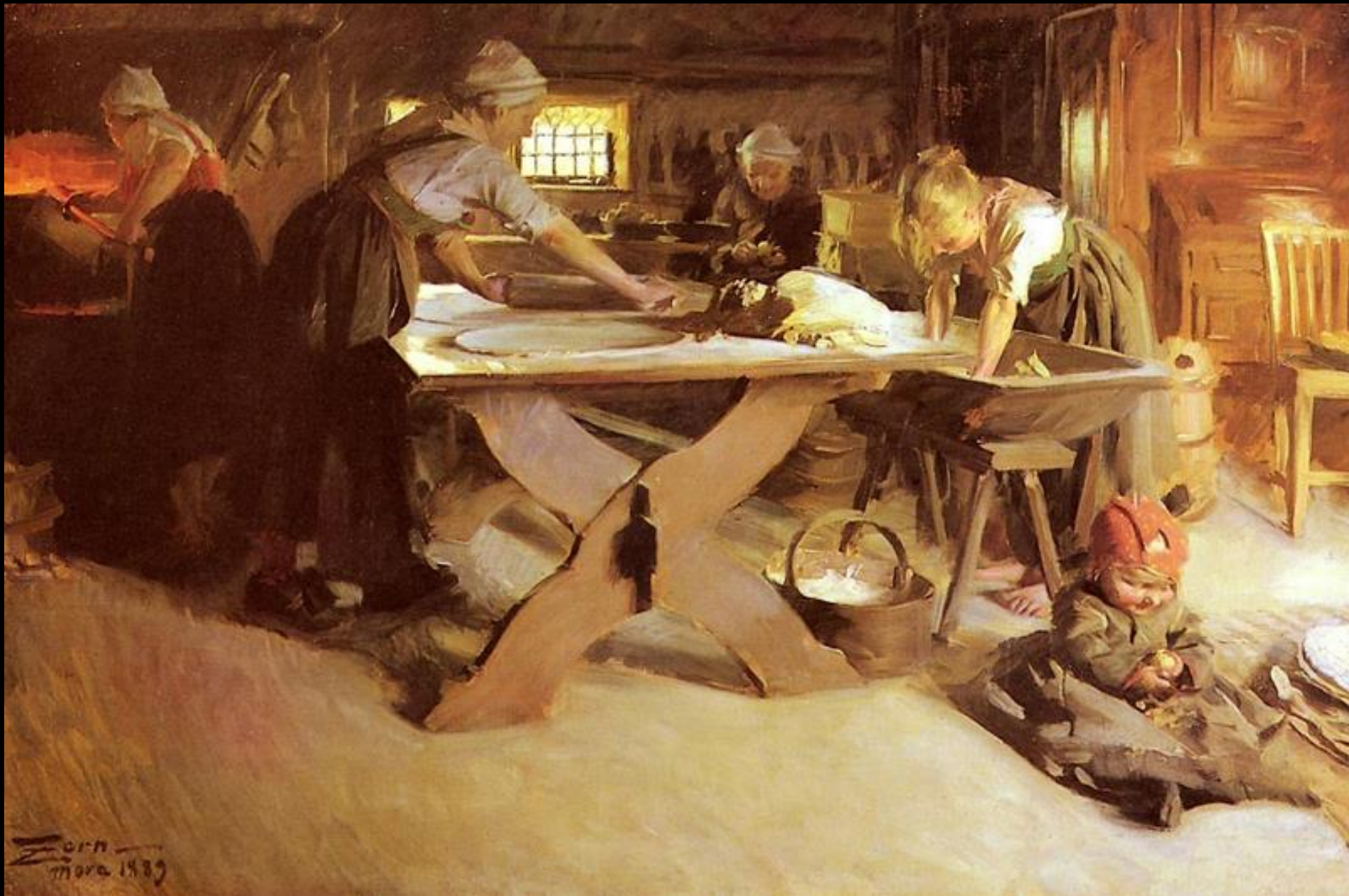
Bread Baking -- Anders Zorn