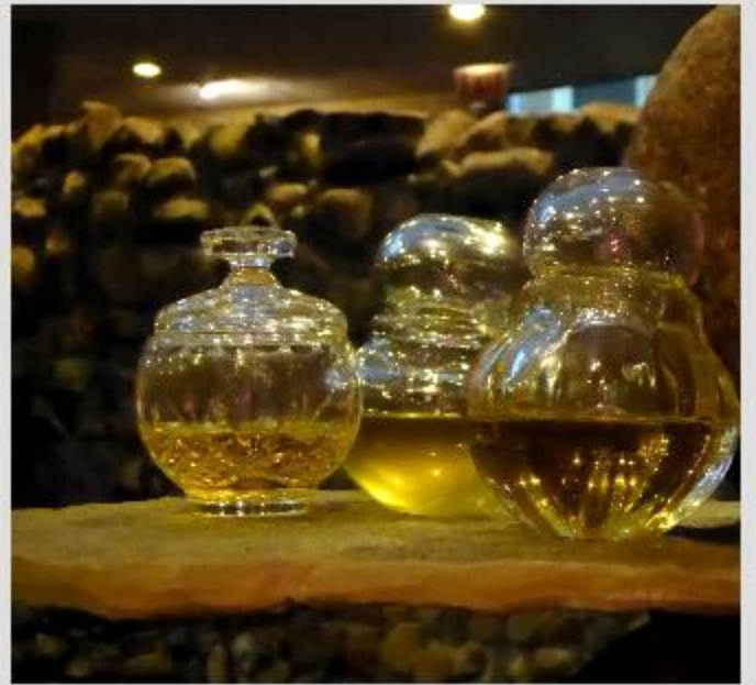
St. Benedict the African Catholic Church, Chicago, IL