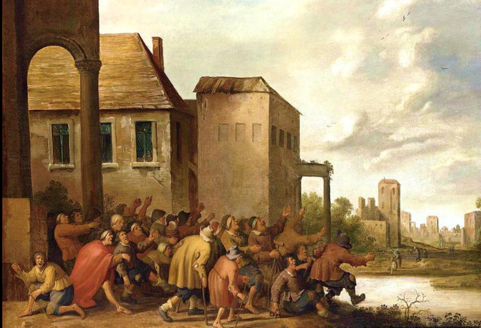
The Pool of Bethesda -- Joost Cornelisz Droochsloot, 1645