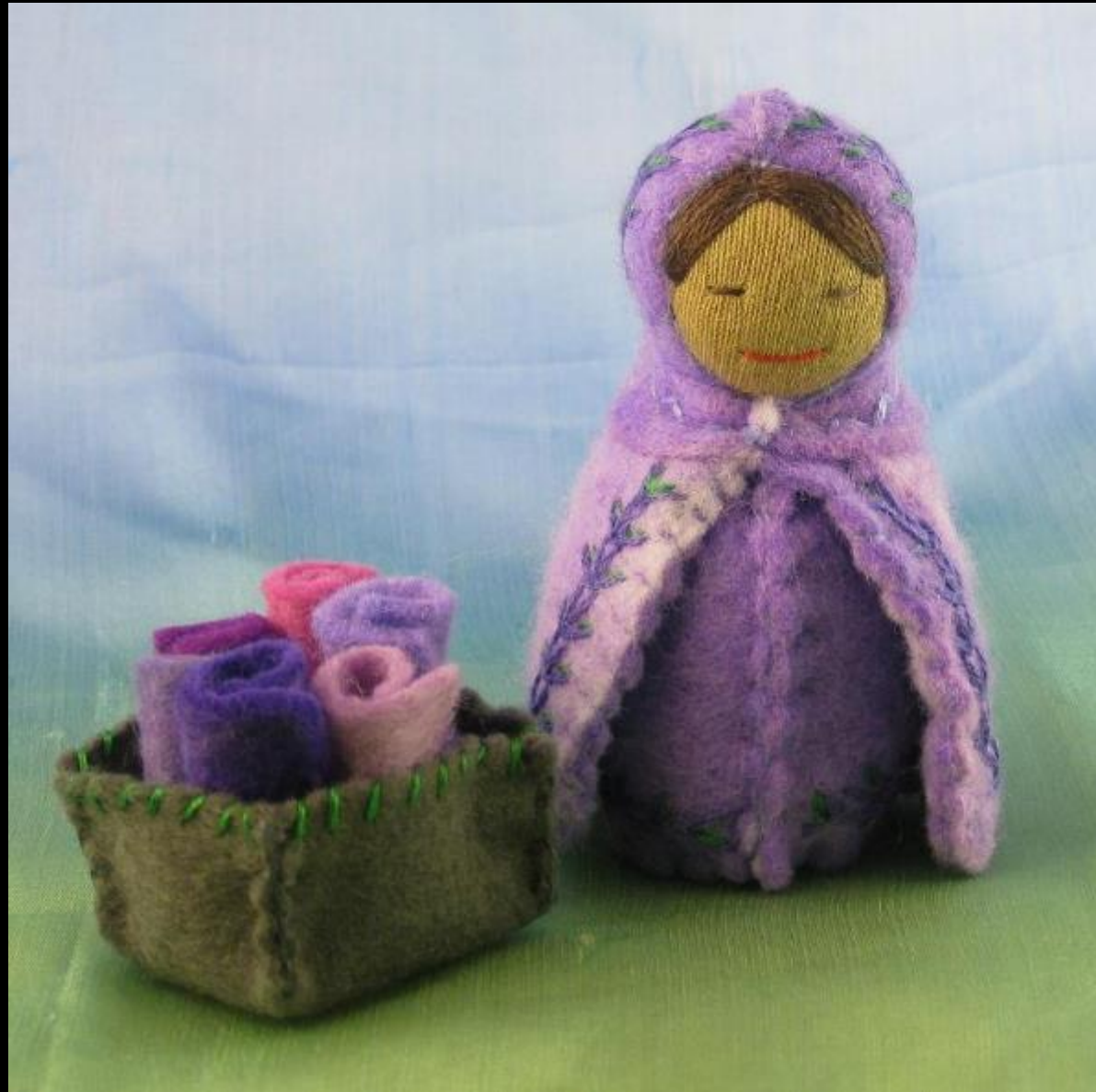
Lydia with Purple Cloth