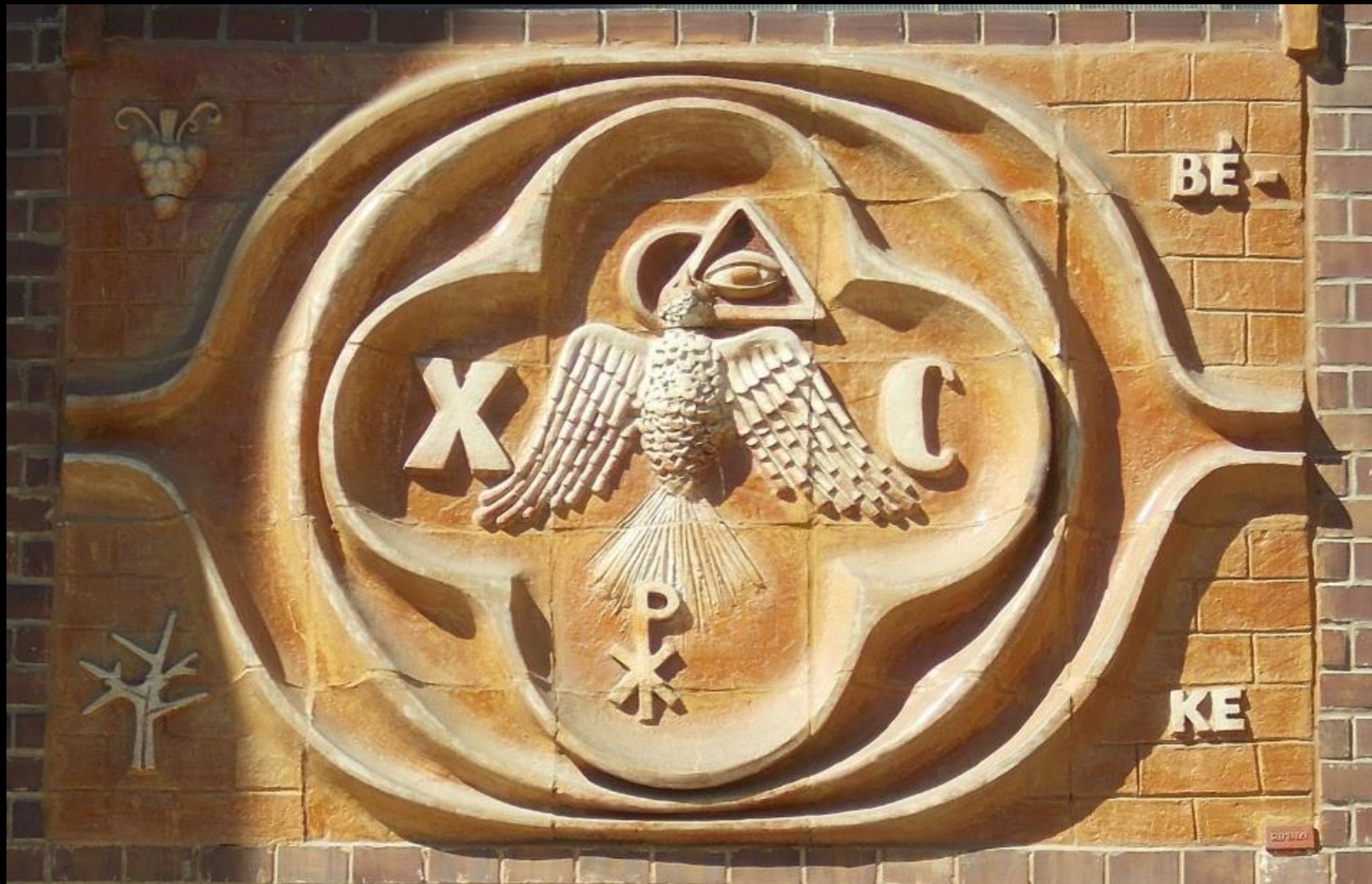
Symbol of Peace with Eye of Providence -- Sacred Heart Church, Komarom, Hungary