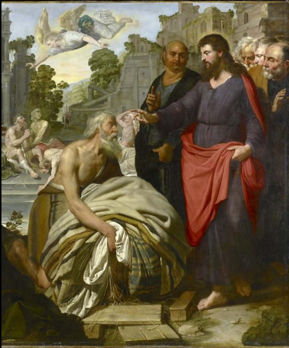
Christ at the Pool of Bethesda

Artus Wolffort Art Gallery of Ontario Toronto, Canada