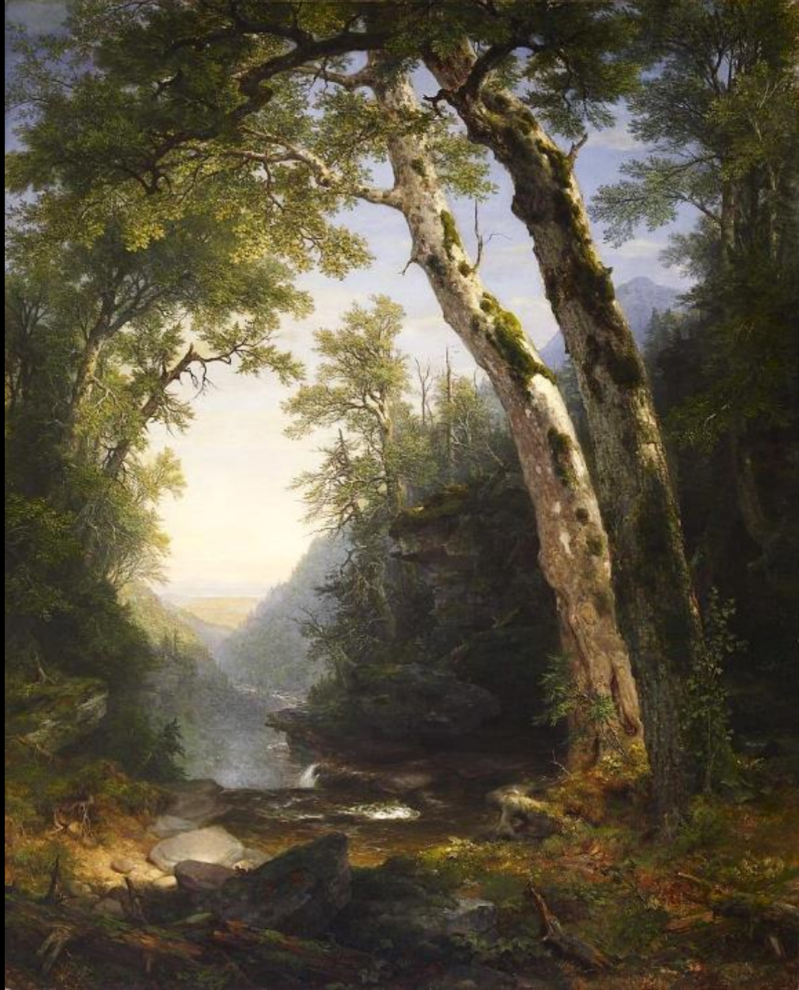
The Catskills Asher Durand Walters Art Museum Baltimore, MD