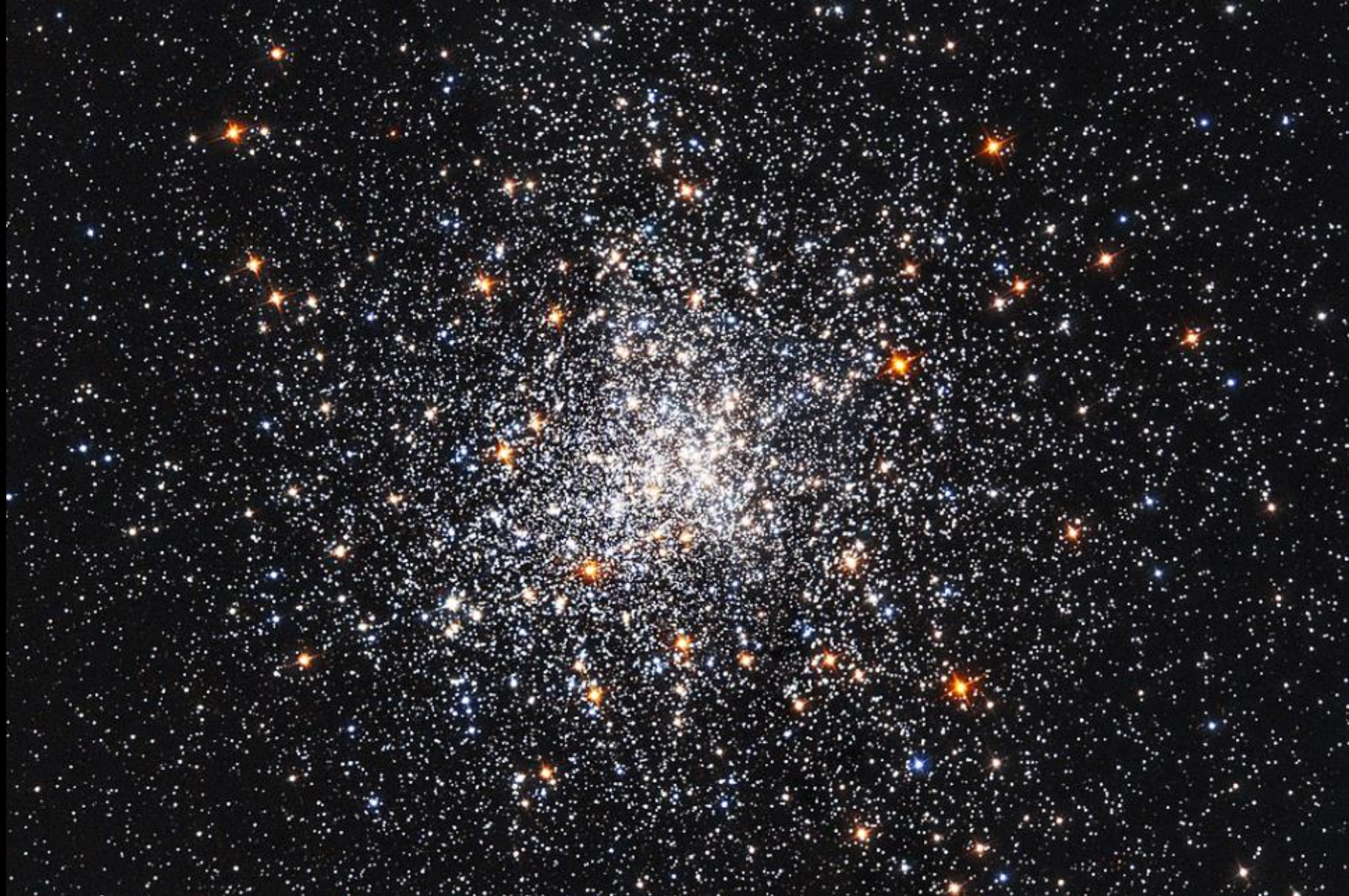
A Snowstorm of Stars -- NASA, Hubble Space Telescope, 2017