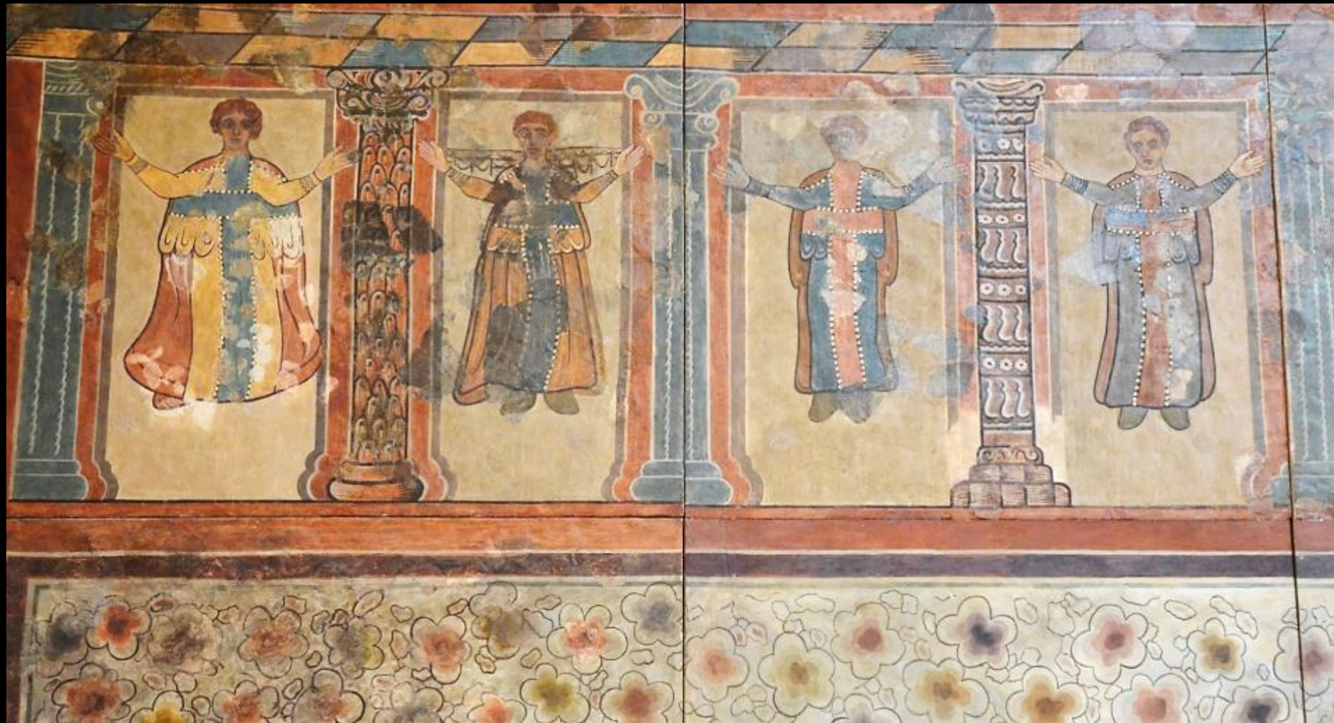
Early Christian Praying Figures -- 4 th century, Lullinstone Villa, Kent, England