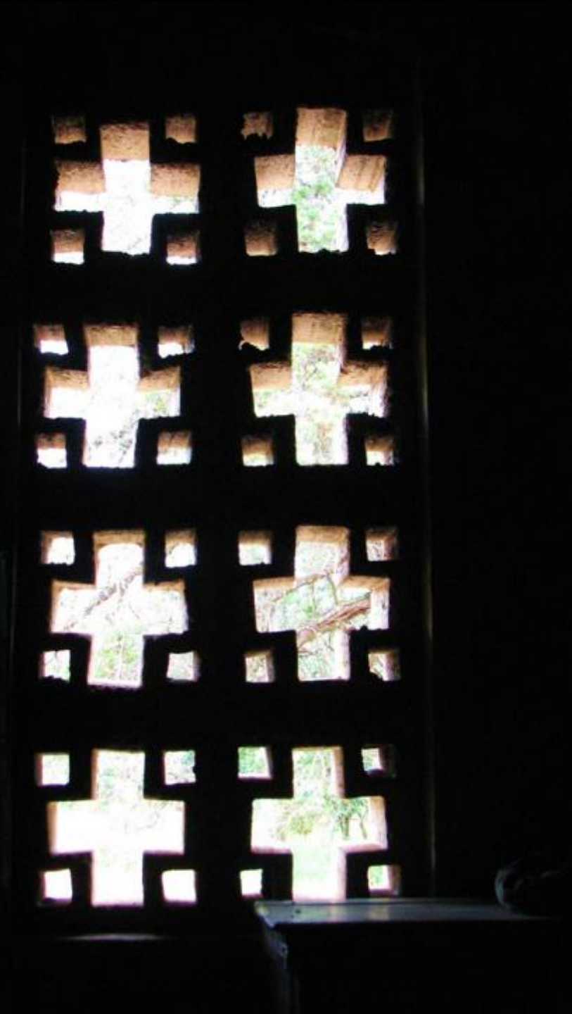
Church Window Church of Mwenzo Mission Nakonde, Zambia