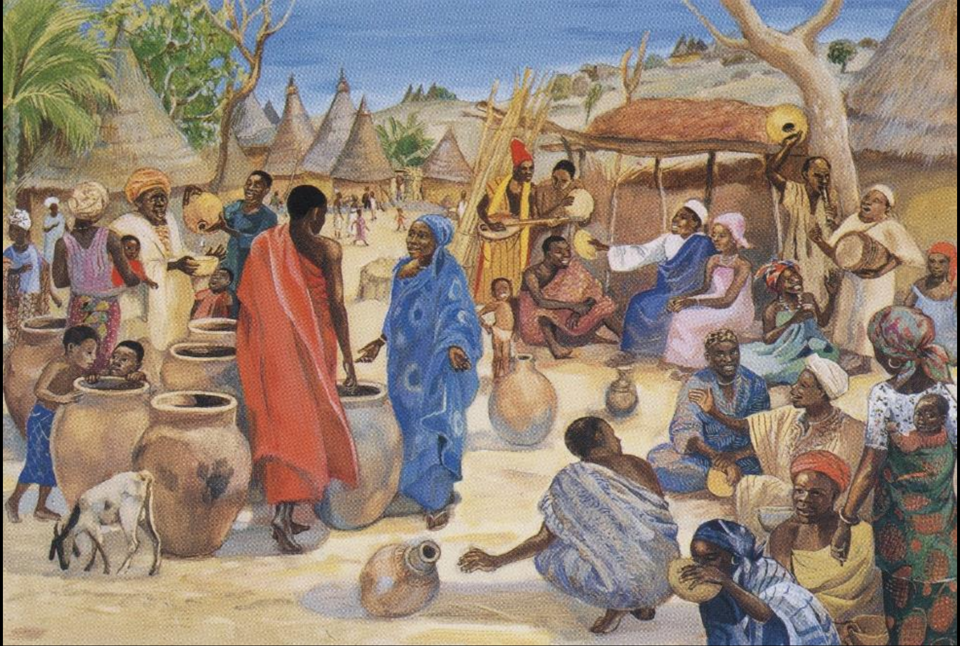
Marriage at Cana -- Duccio, Museo dell'Opera del Duomo, Siena, Italy