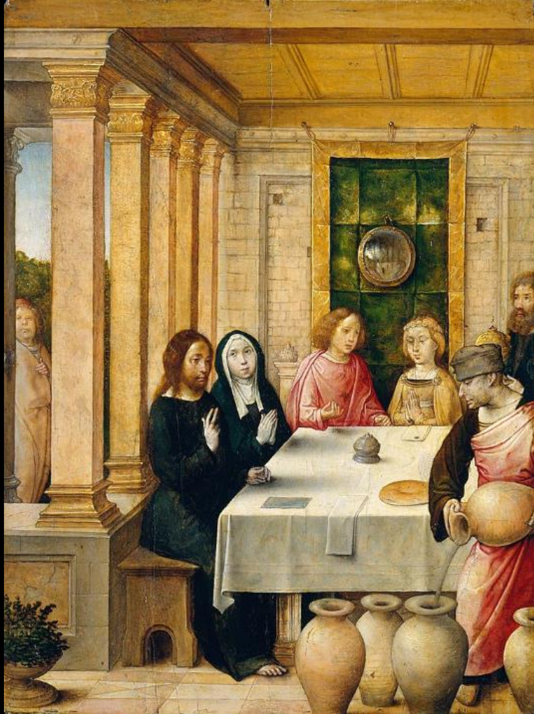
The Marriage Feast at Cana Juan de Flandes Metropolitan Museum of Art New York, NY