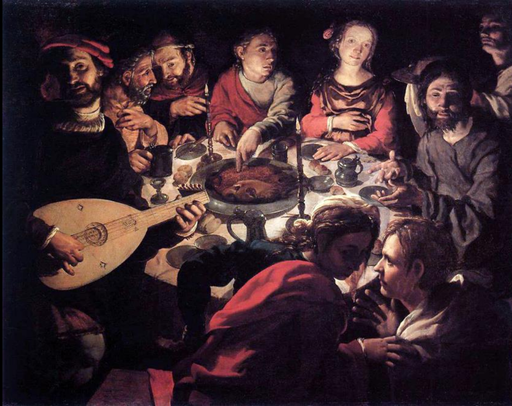
Calling of John During the Marriage at Cana -- Jan Vermeyen, Bonnefanten Museum, Maastricht, NL