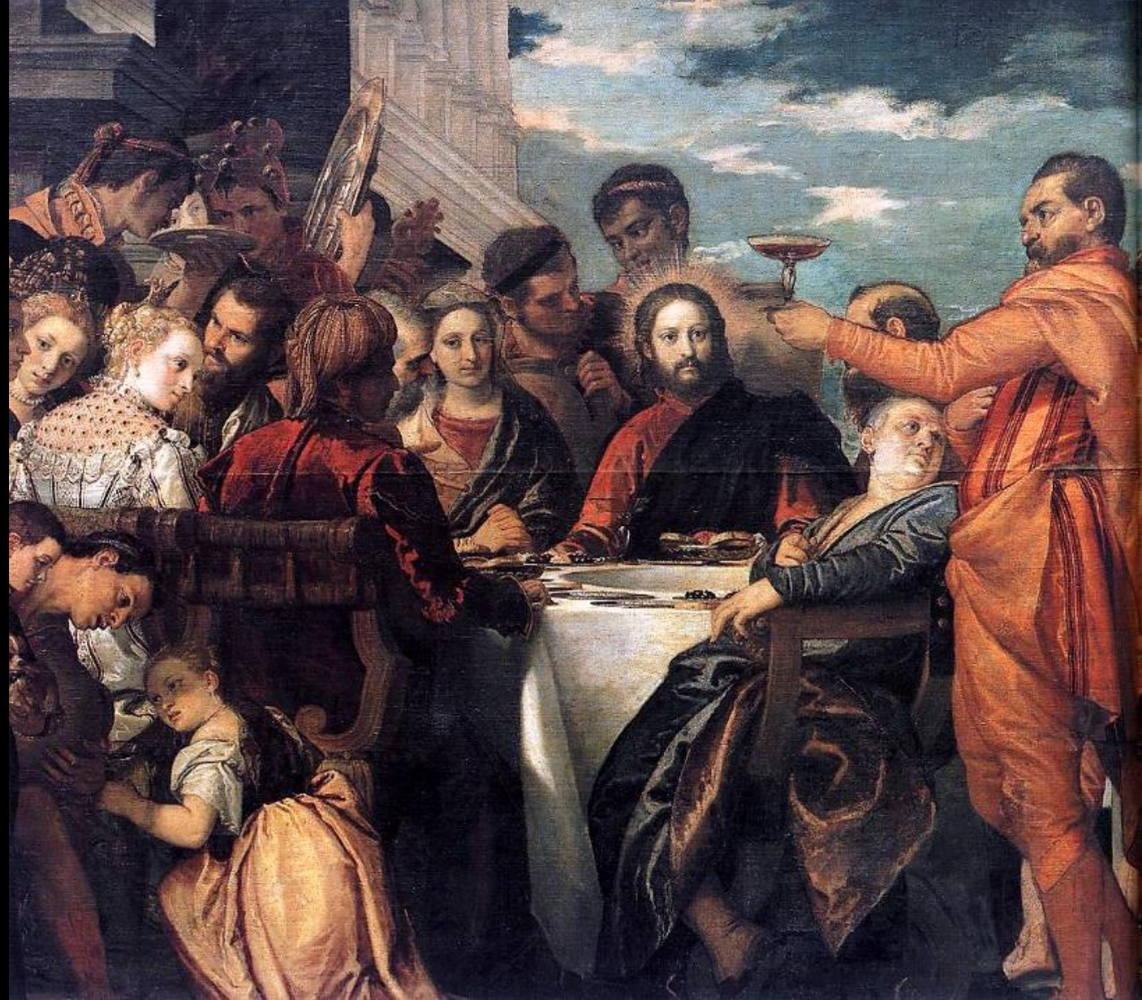
The Wedding at Cana (detail)

Paolo Veronese Gemälde-galerie Alte Meister Dresden, Germany