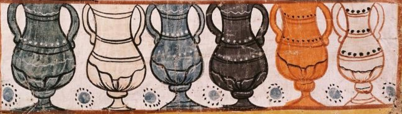
The Marriage in Cana