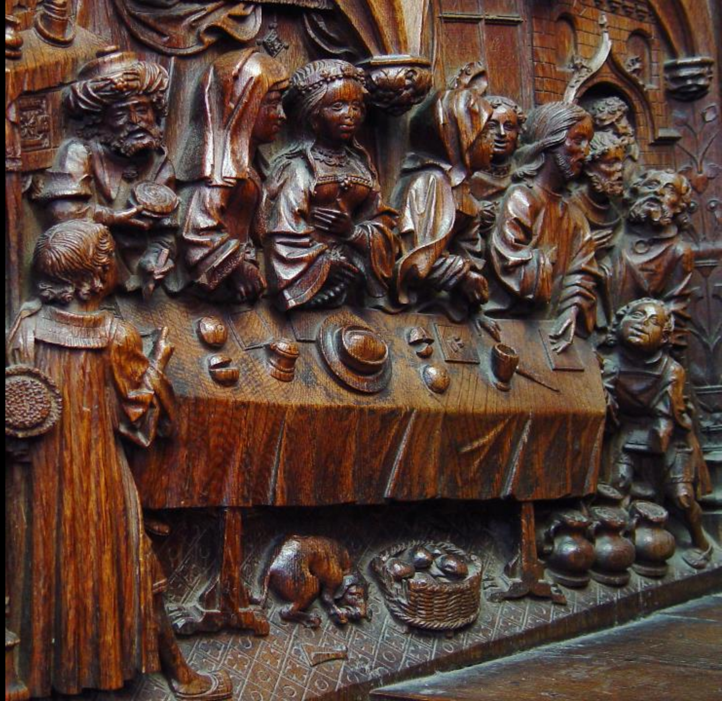
The Marriage Feast at Cana Choirstall woodcarving Amiens Cathedral Amiens, France