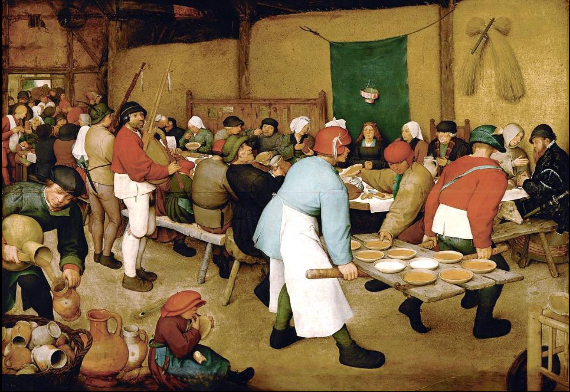
The Peasant Wedding -- Pieter Bruegel the Elder, Kunsthistorisches Museum, Vienna, Austria