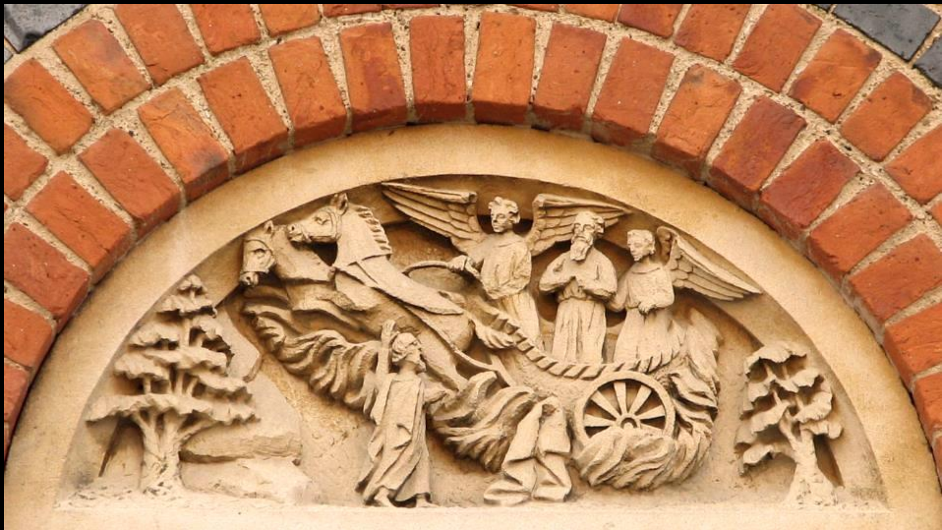
Elijah and Elisha -- Tympanum of Home on Walton Well Road, Oxford, England