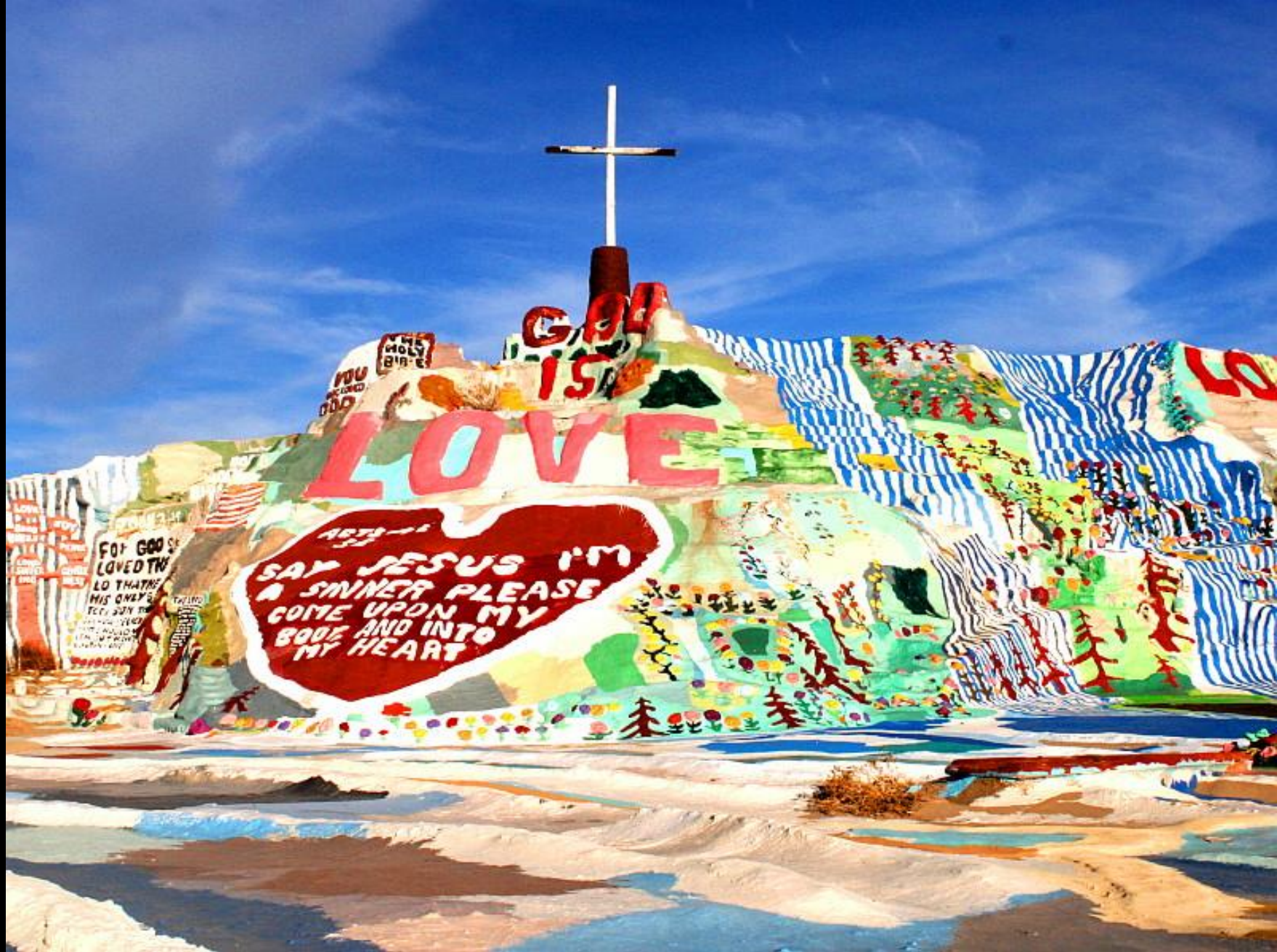
Salvation Mountain -- Leonard Knight, Imperial County, CA