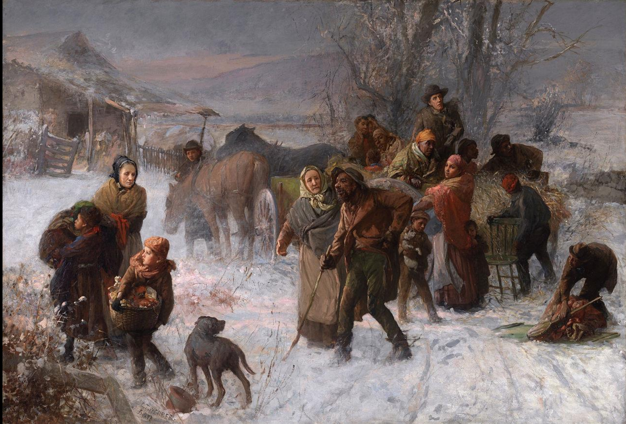
Underground Railroad -- Charles Webber, Cincinnati Art Museum, Cincinnati, OH