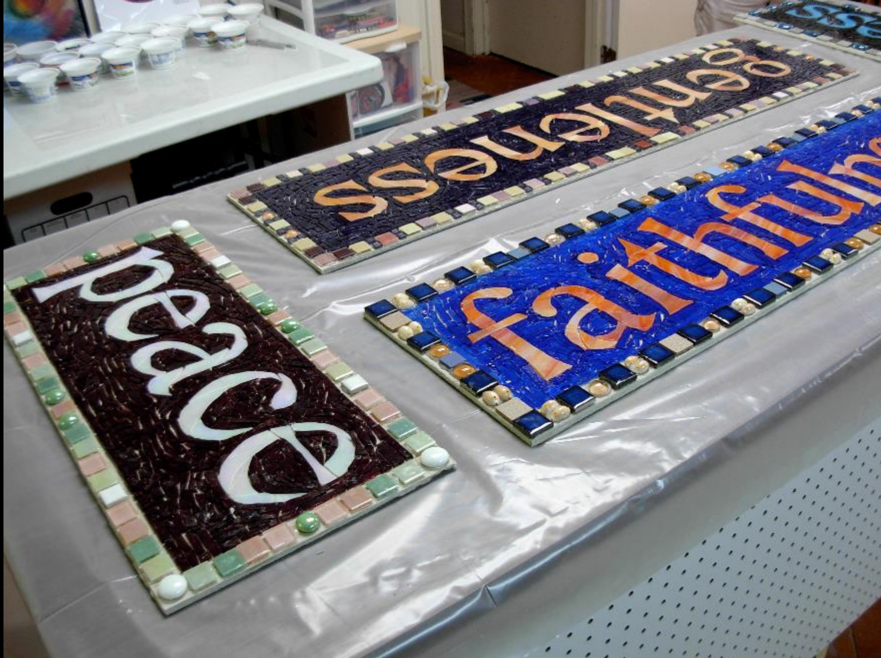
Ready to grout – Fruit of the Spirit mosaic commission -- Suzanne Halstead