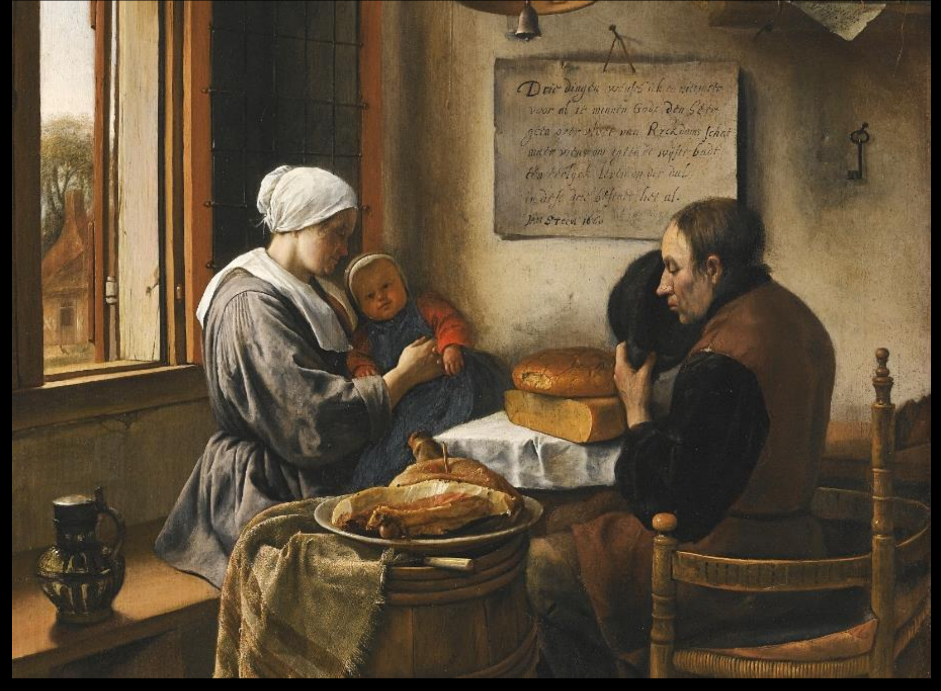
The Prayer Before the Meal -- Jan Steen, 1660