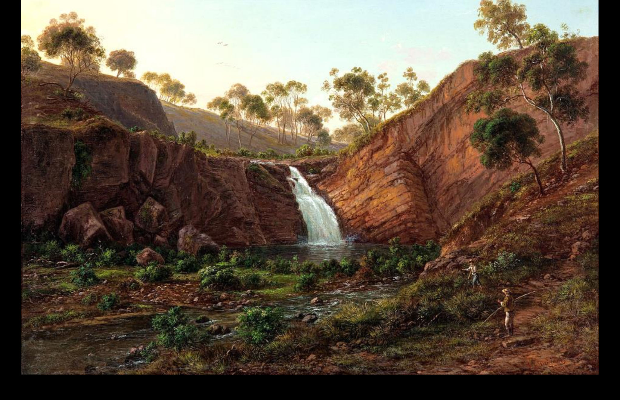
Waterfall on the Clyde River, Tasmania -- Eugene von Guerard, Art Gallery of South Australia, Adelaide