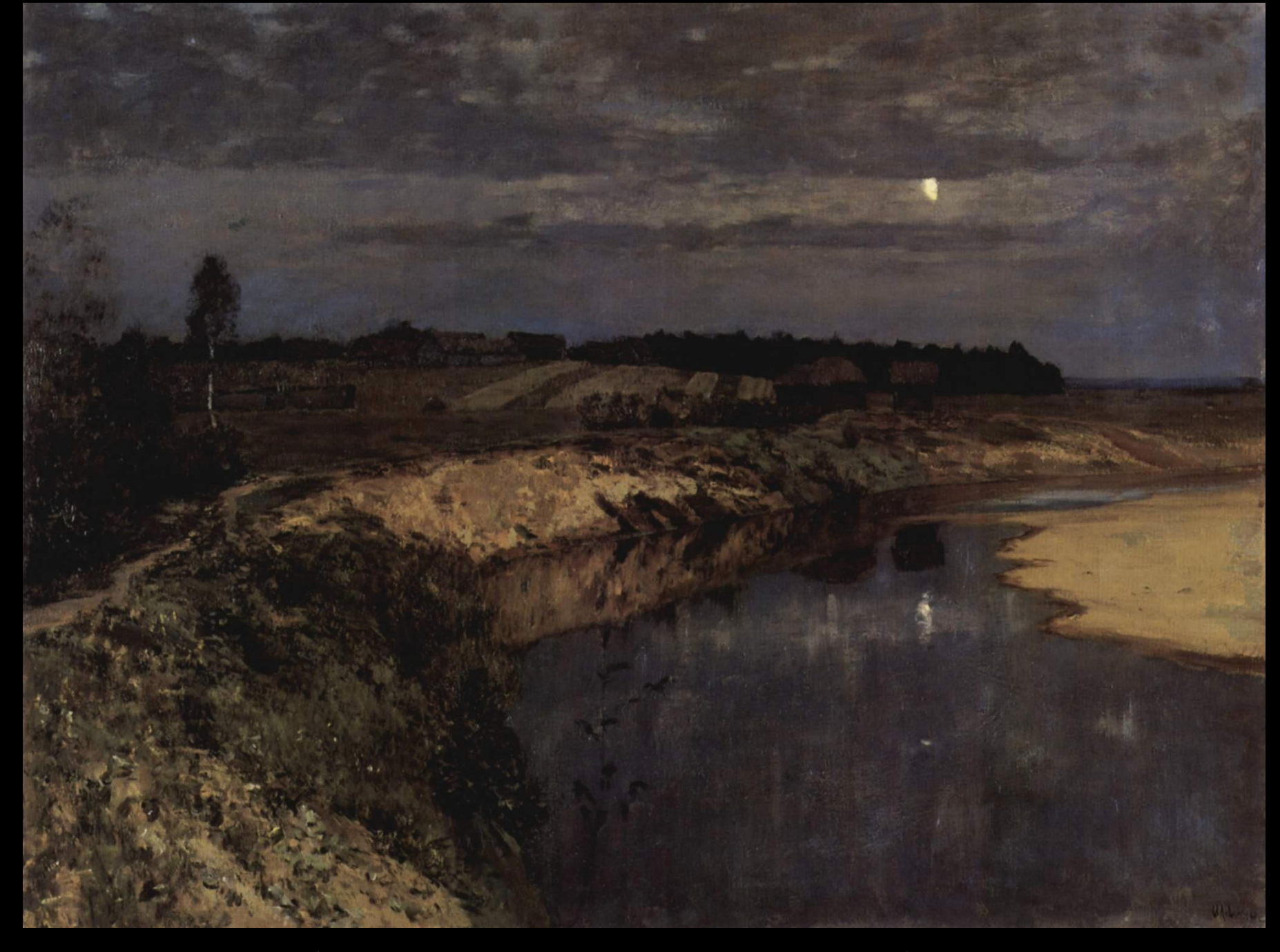
Silence -- Isaac Levitan, State Russian Museum, St. Petersburg