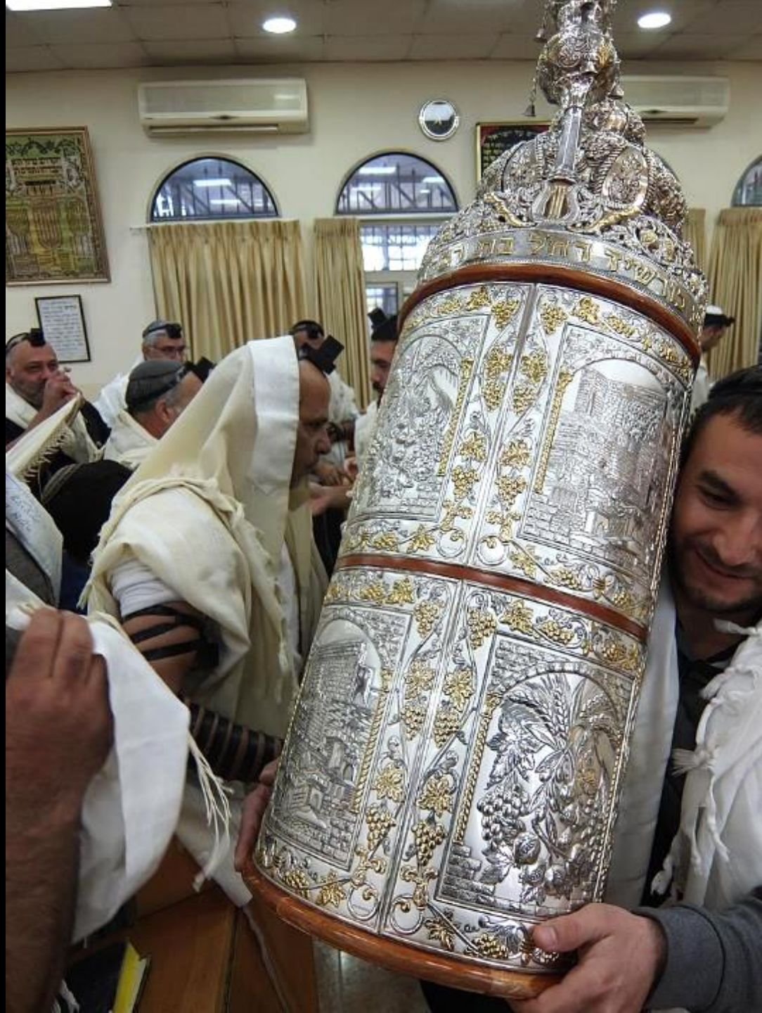
Silver and Gold Torah Case