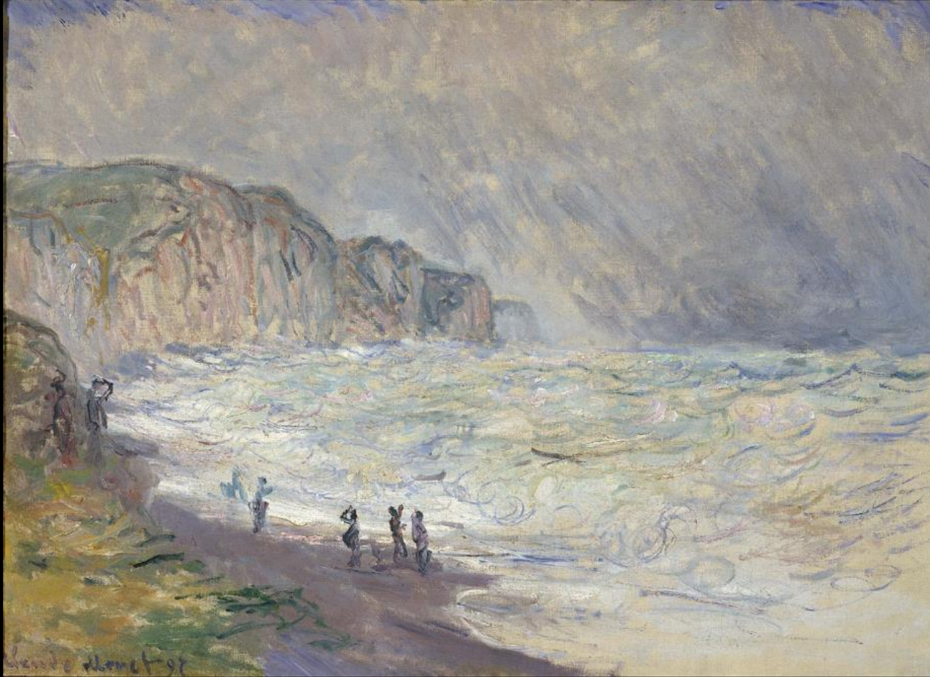
Heavy Sea at Pourville -- Claude Monet, National Museum of Western Art, Tokyo, Japan