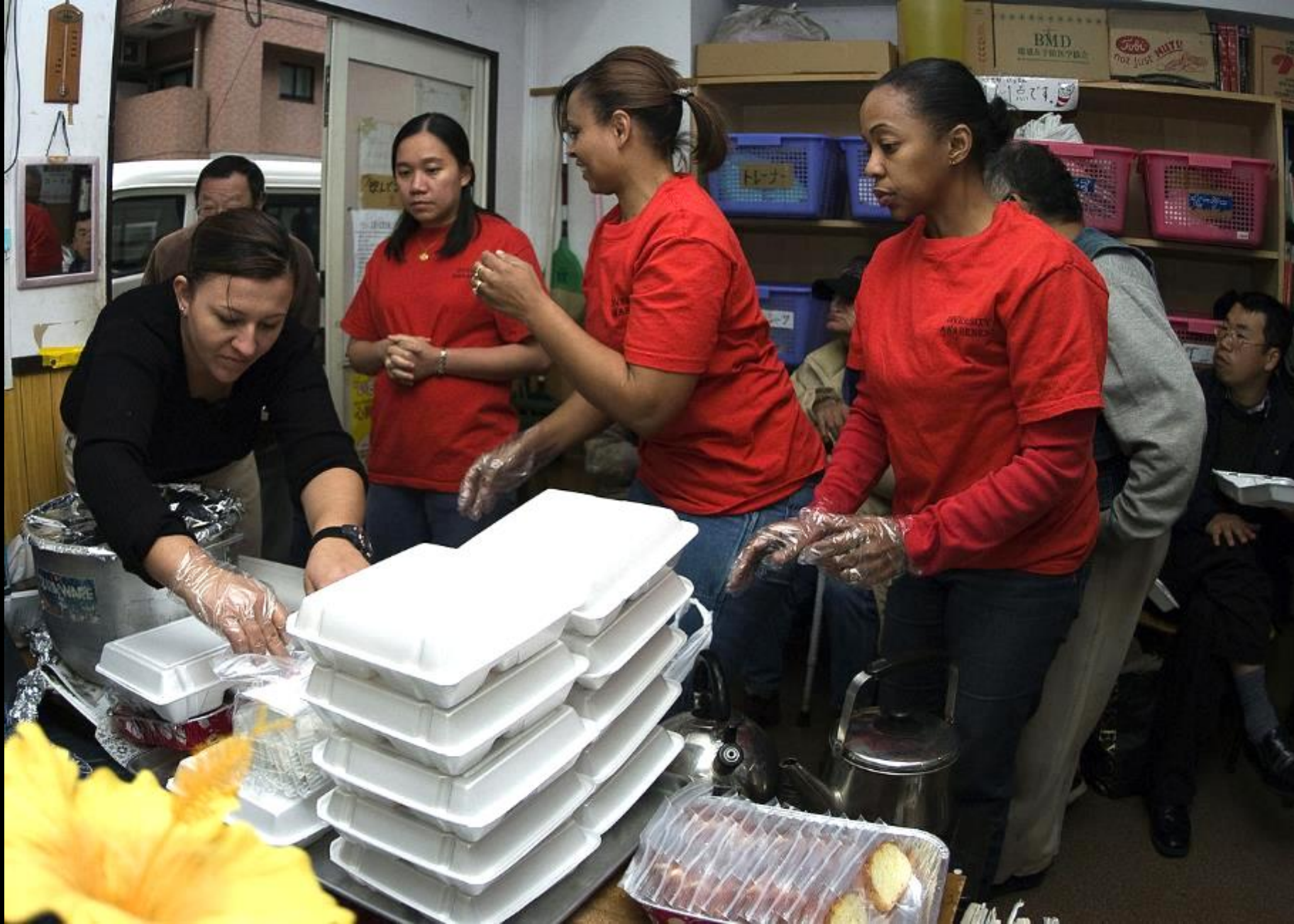
Preparing Meals for the Homeless -- U. S. Navy volunteers, Sanagi-tachi Shelter, Yokohama, Japan