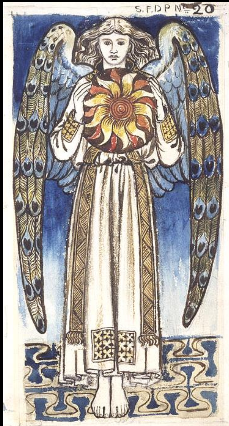
Day: Angel Holding the Sun

William Morris Museum of Fine Arts Houston, TX