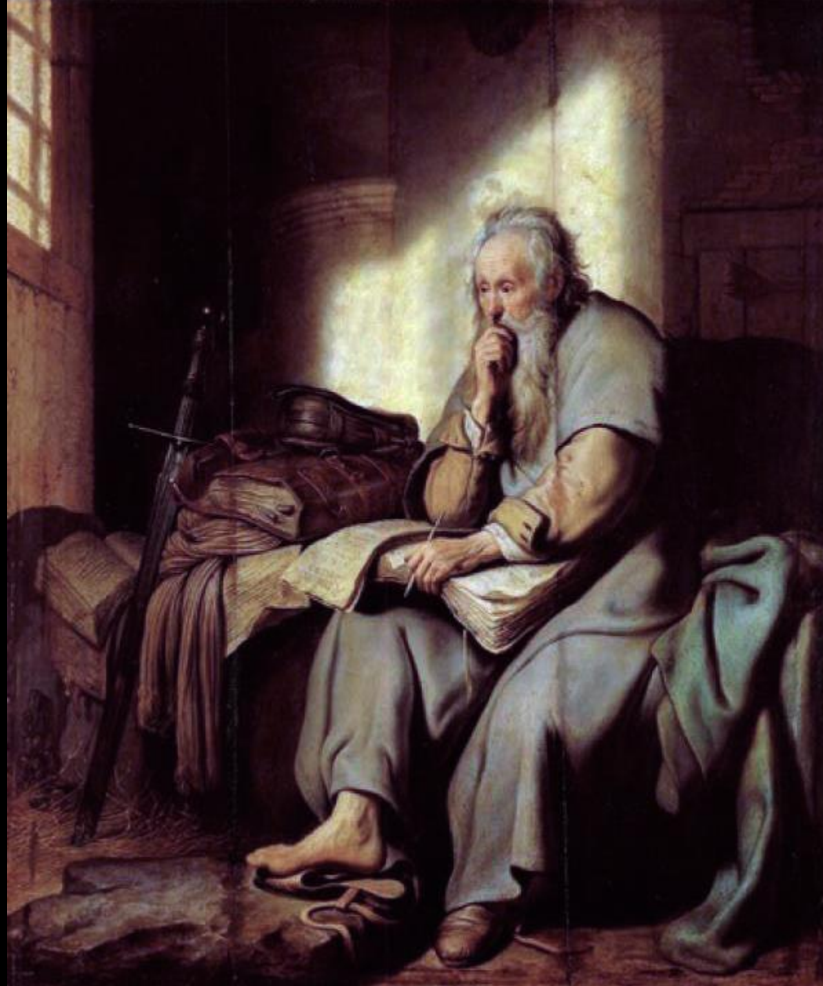
Paul in Prison Rembrandt Staatsgalerie Stuttgart Stuttgart, Germany