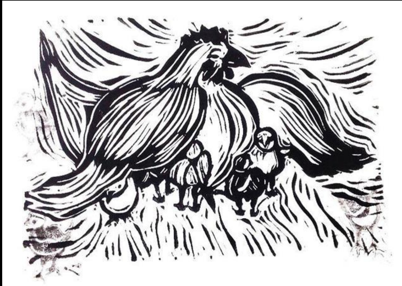
Hen Protecting Chicks -- Cara Hochhalter, liturgical artist