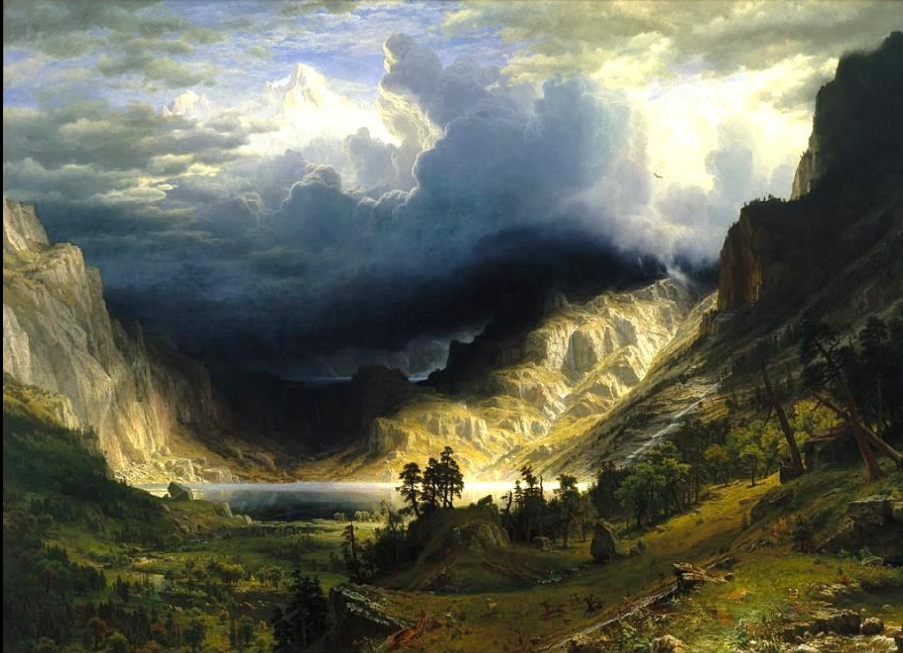
Storm in the Rocky Mountains -- Albert Bierstadt, Brooklyn Museum, New York, NY