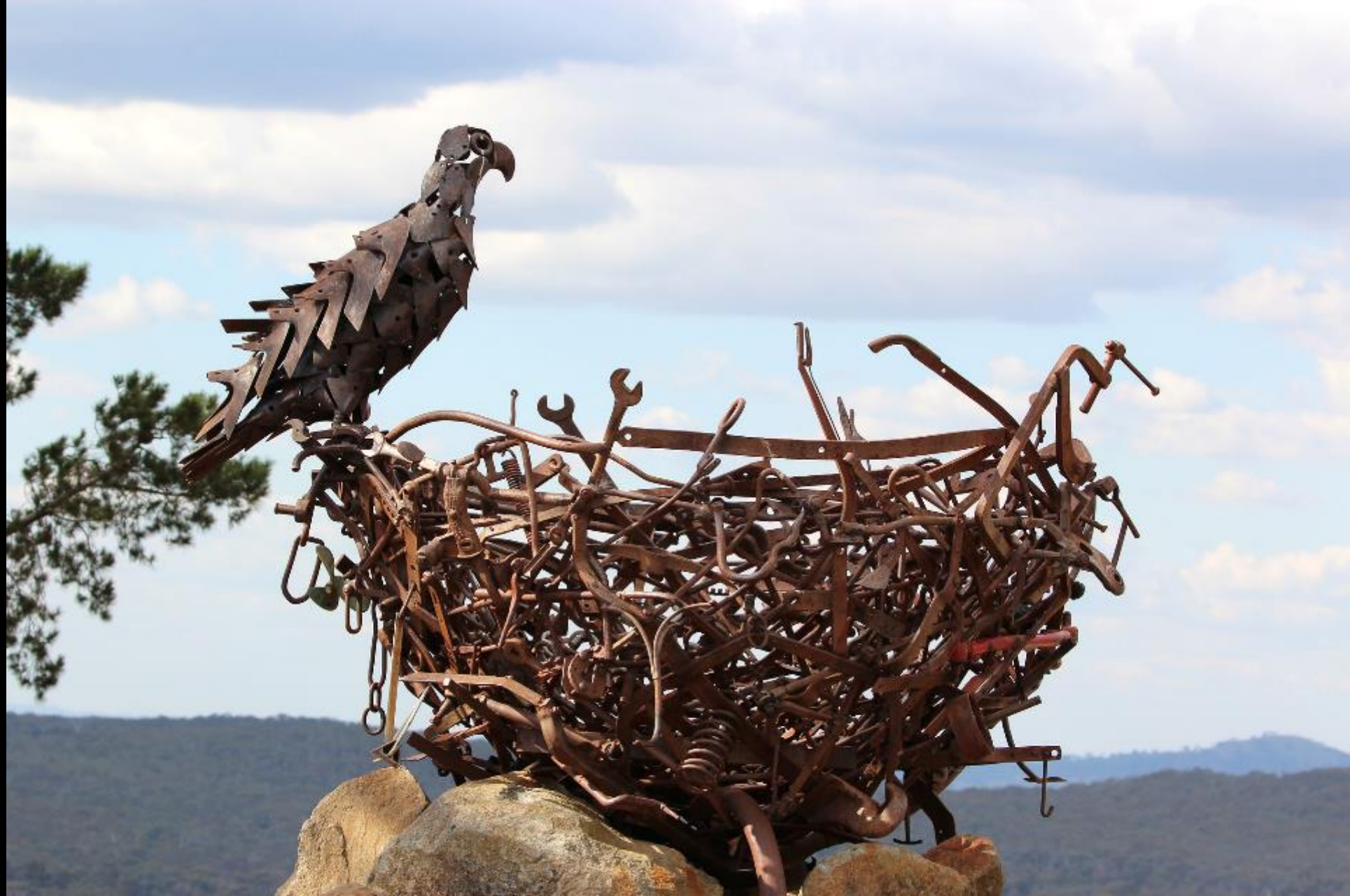
Eagle Protecting It's Nest -- National Arboretum, Canberra, Australia