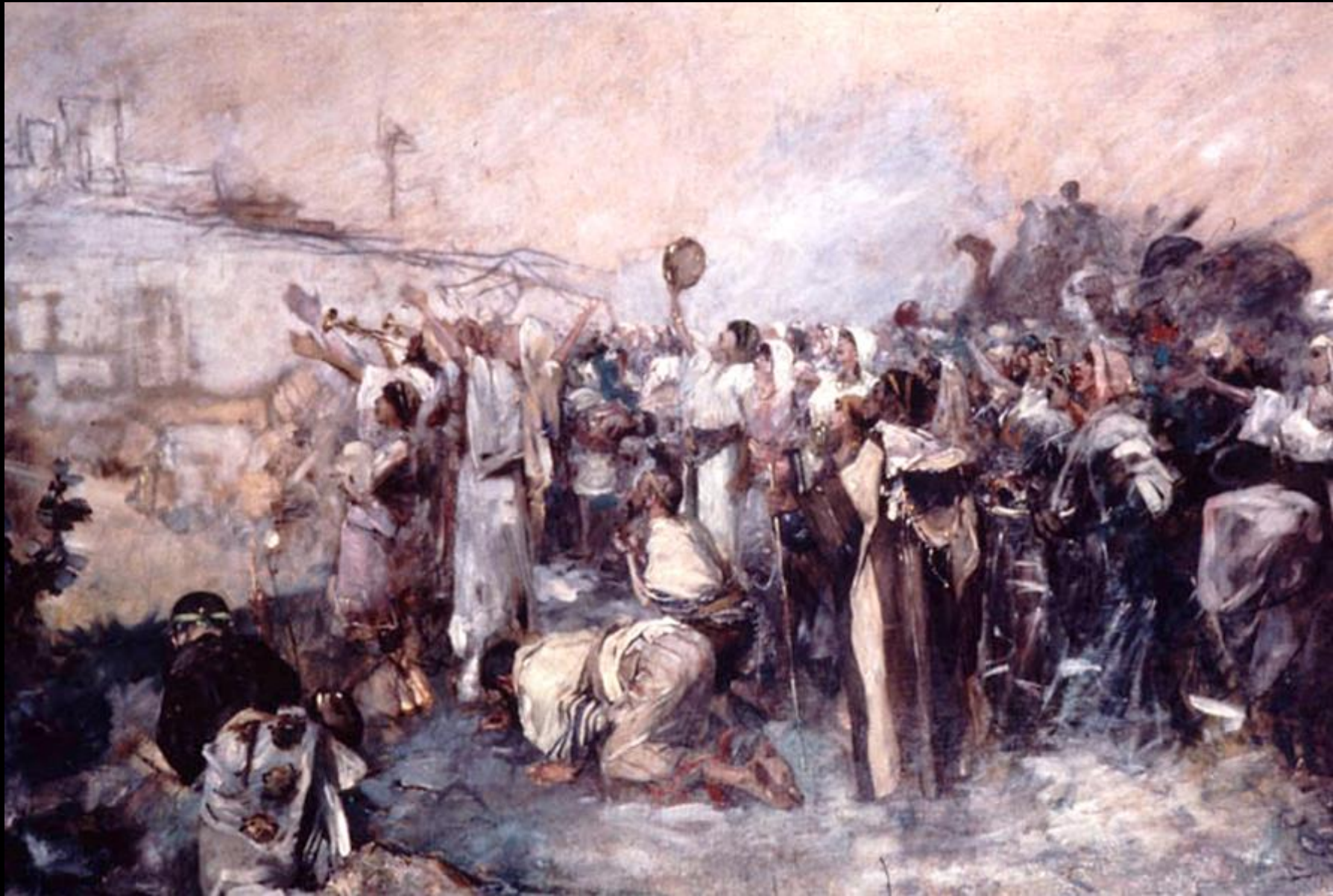
Miriam's Song after the Exodus from Egypt -- Samuel Hirszenberg, Yeshiva Museum, New York, NY