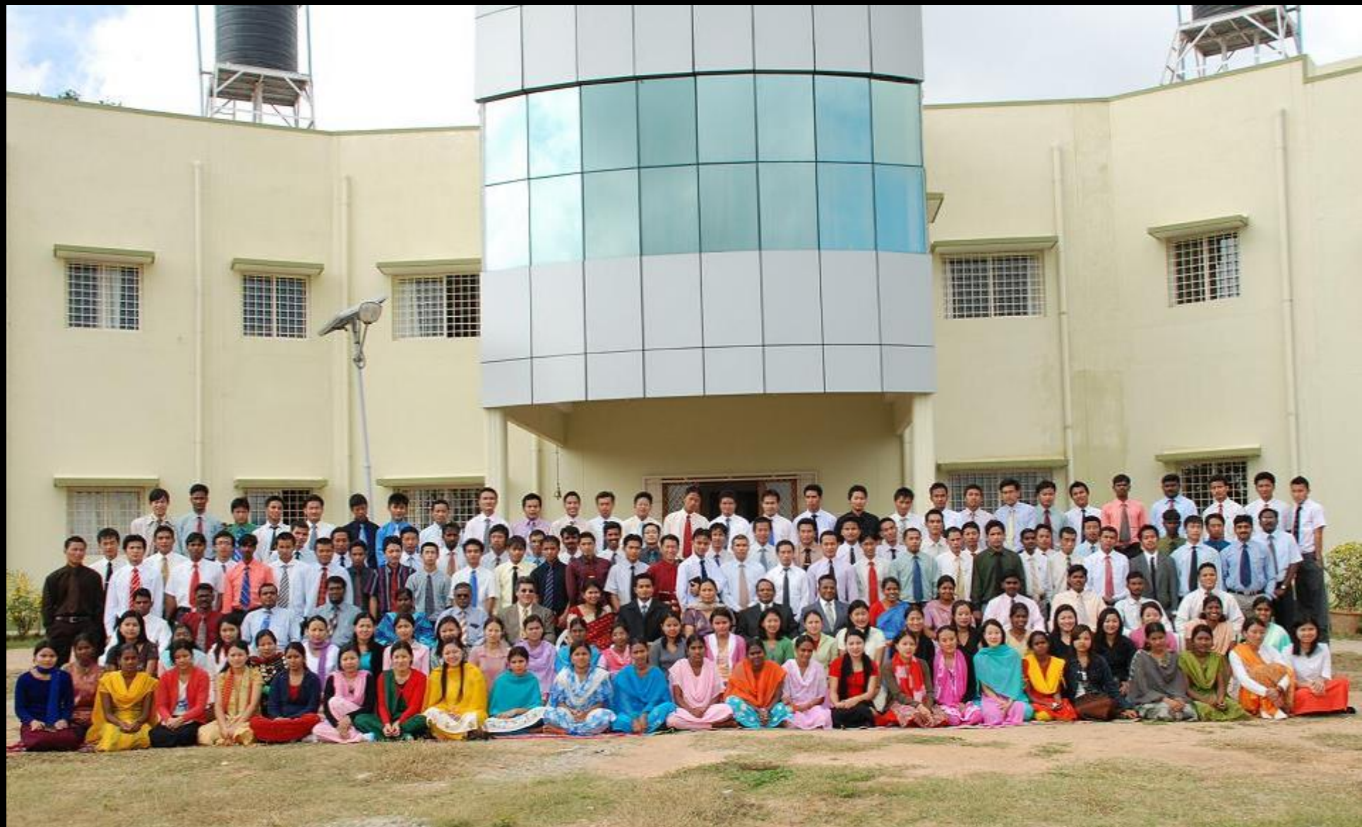
Maranatha Baptist Bible College and Seminary, Bangalore, India