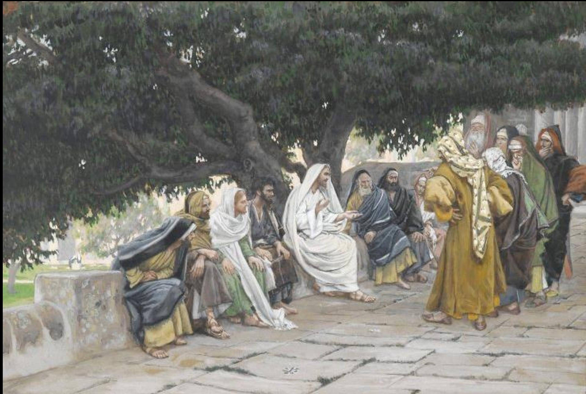
Pharisees and Sadducees Question Jesus -- James Tissot, Brooklyn Museum, New York, NY