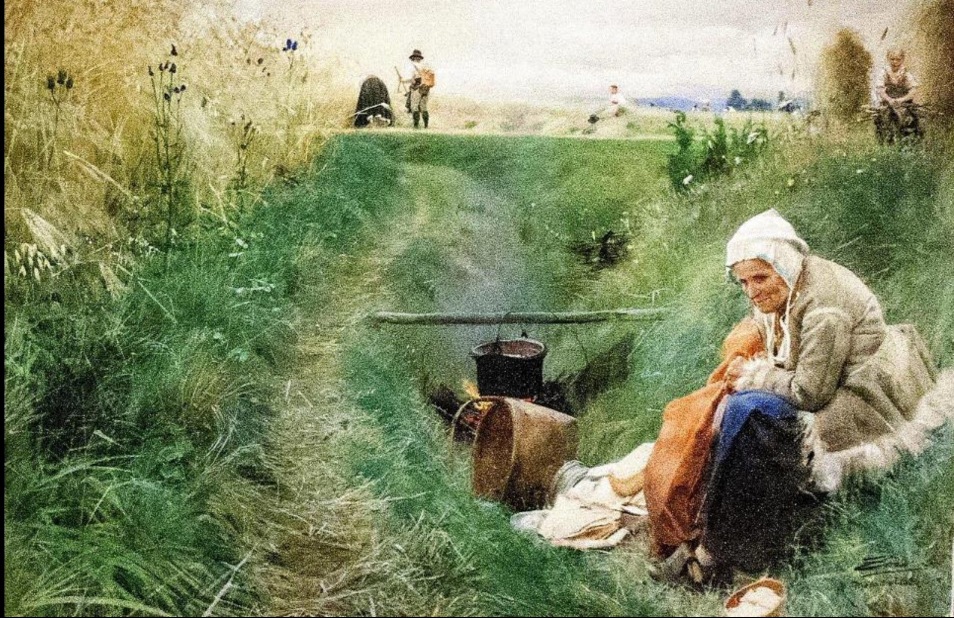
Our Daily Bread -- Anders Zorn, Nationalmuseum, Stockholm, Sweden