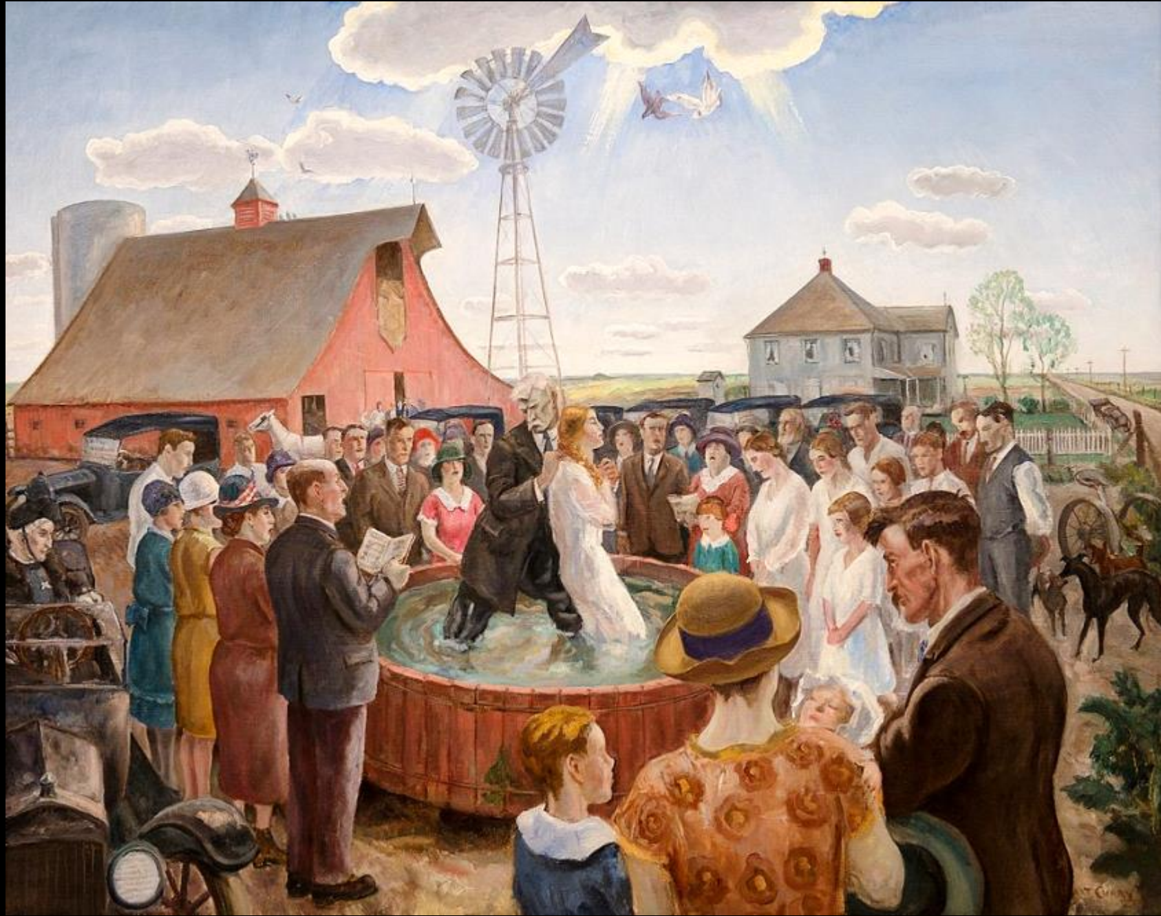
Baptism in Kansas -- John Steuart Curry, Whitney Museum, New York, NY