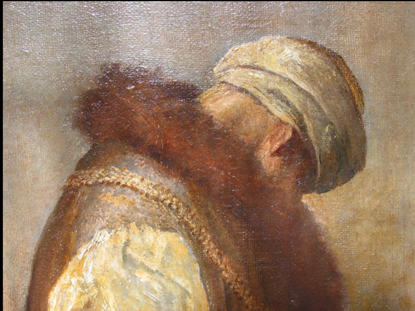
For He Had Great Possessions -- George Watts, Tate Britain, London, UK