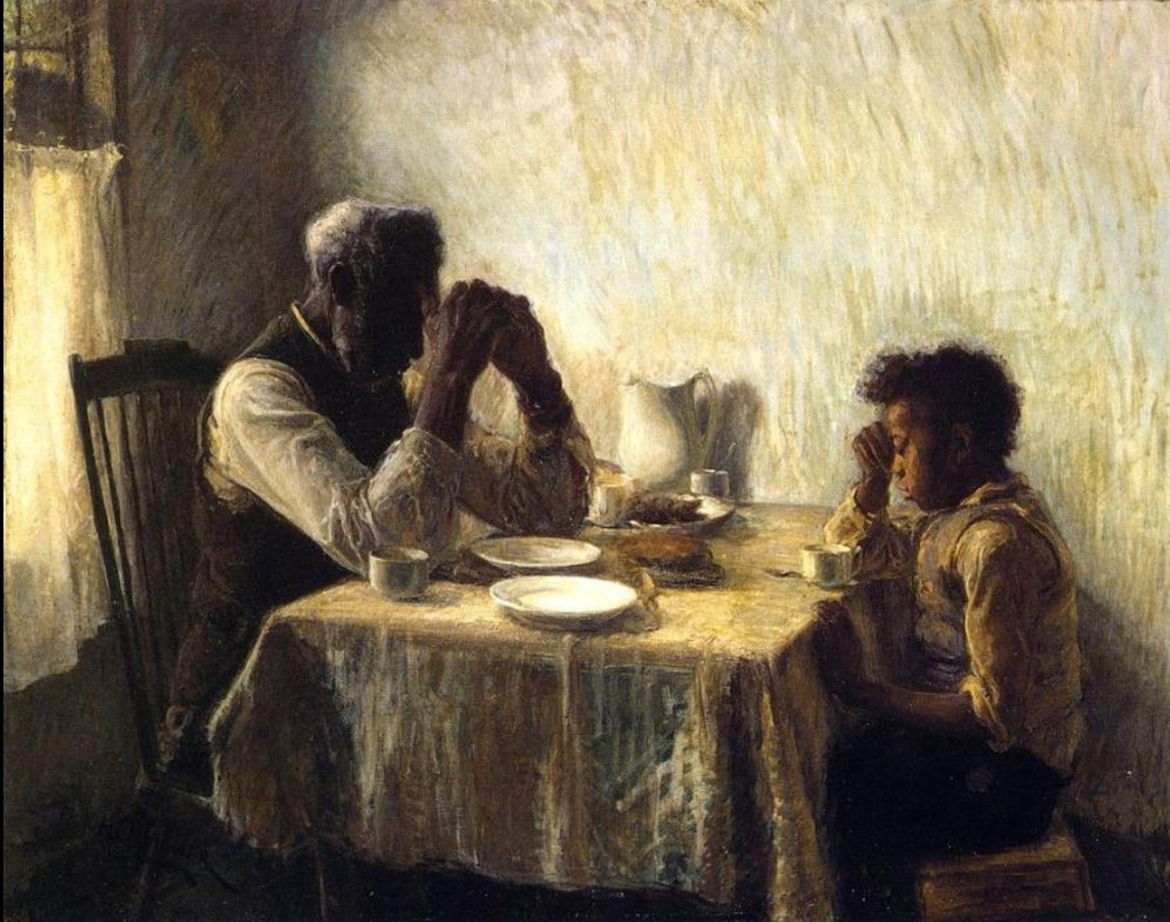
Thankful -- Henry Ossawa Tanner, 1894