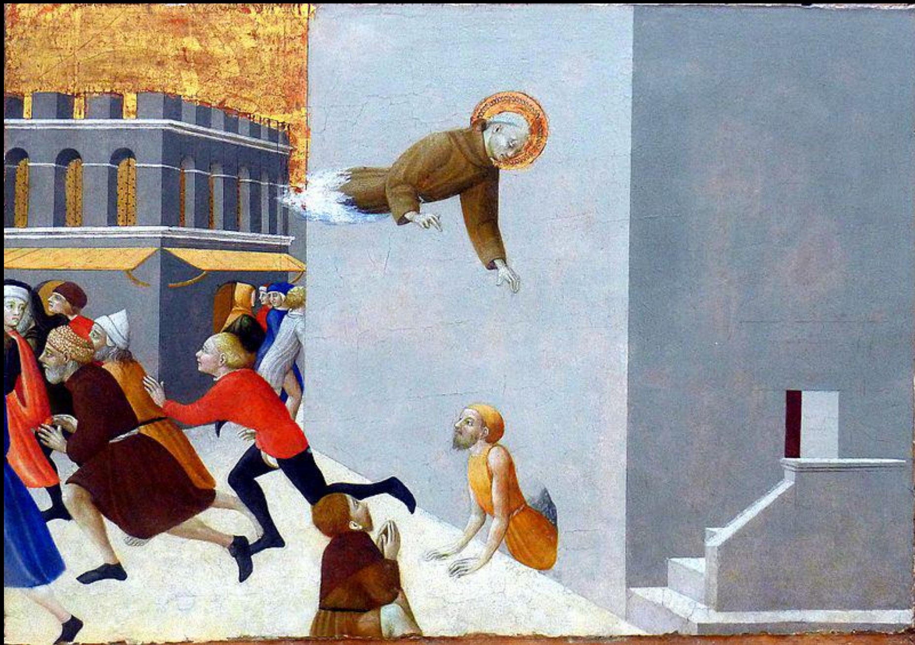
Saint Ranerius Frees the Poor From Prison -- Sassetta, Louvre Museum, Paris, France