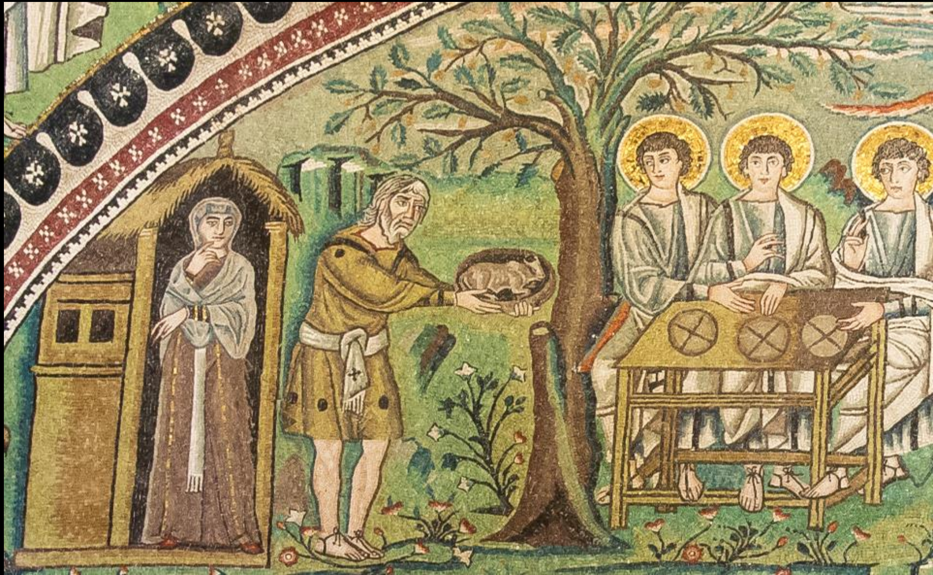
Sarah and Abraham Offer Hospitality to the Visitors -- Basilica of San Vitale, Ravenna, Italy