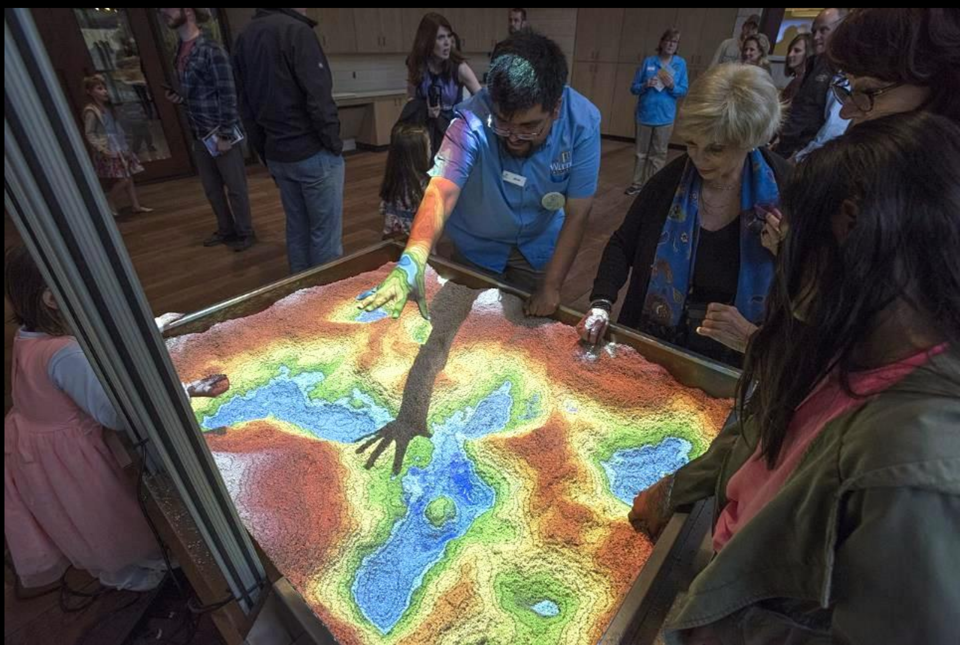
Land Stewardship Lab -- Witte Museum, San Antonio, TX