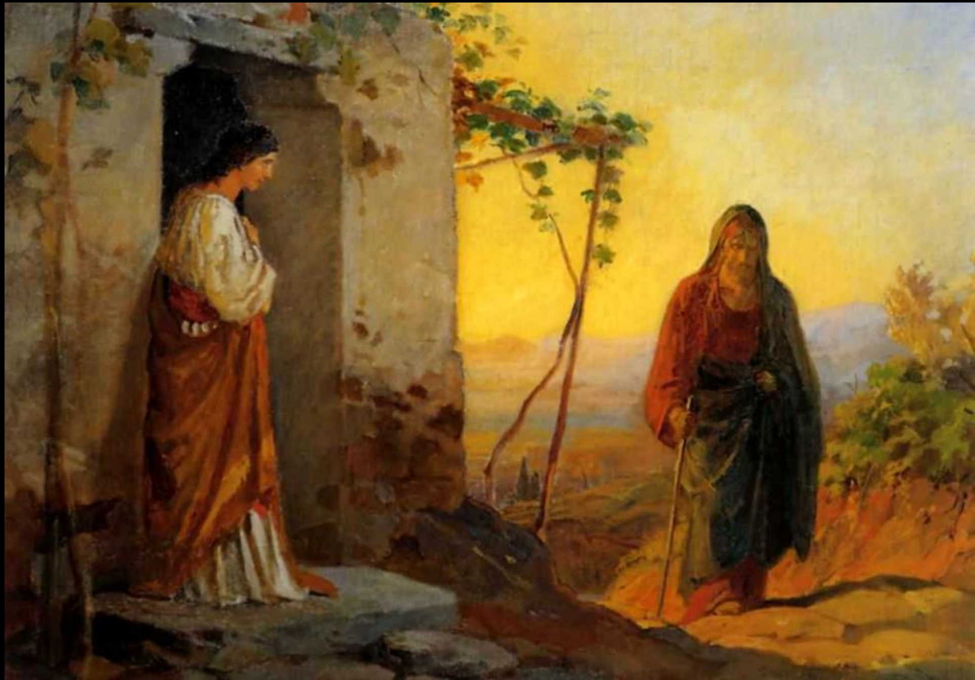
Mary, Sister of Lazarus, Welcomes Jesus Into Her Home -- Nikolai Ge