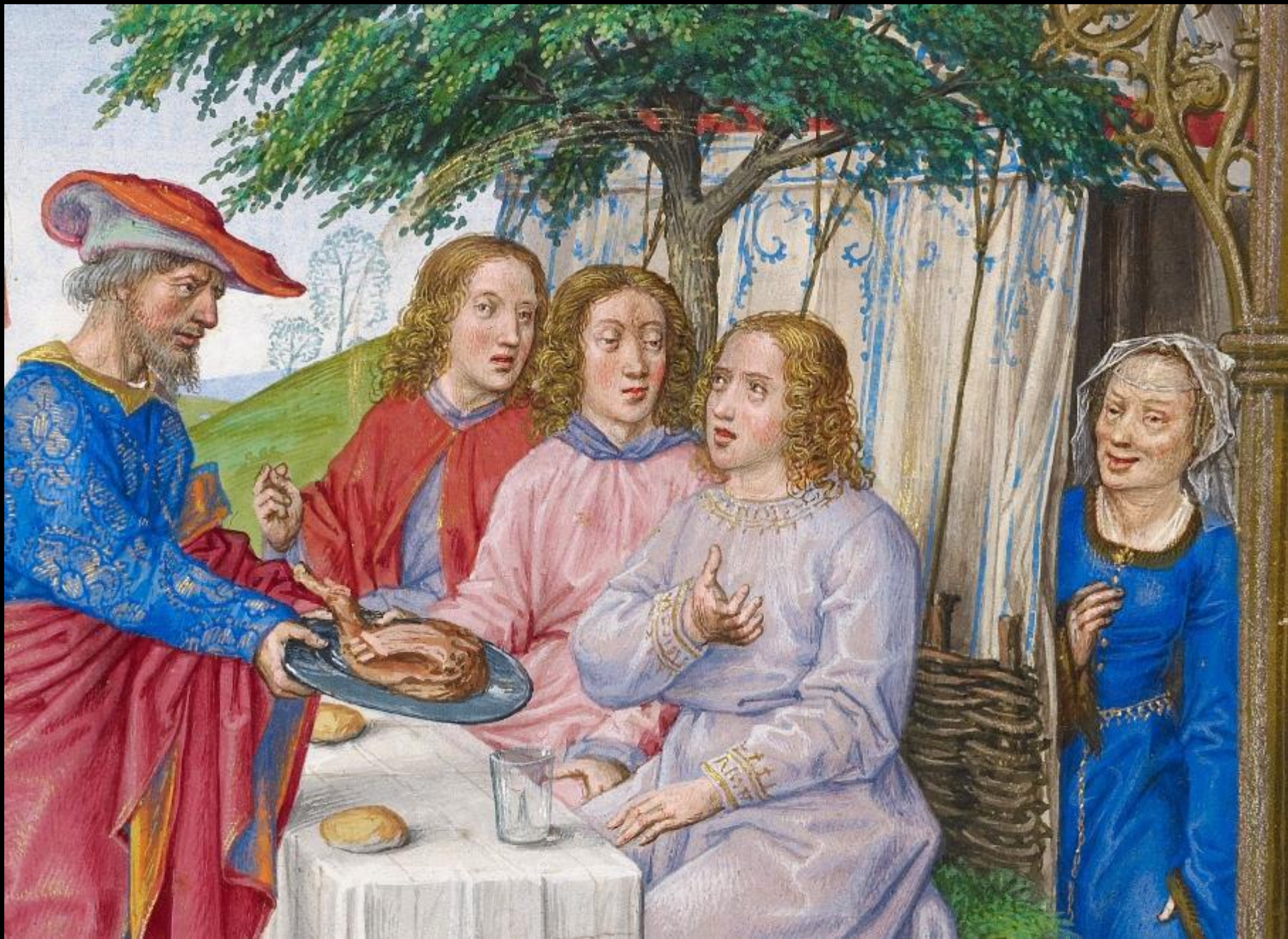
Sarah Hears the Visitor's Promise -- Master of James IV of Scotland, Getty Center, Los Angeles, CA