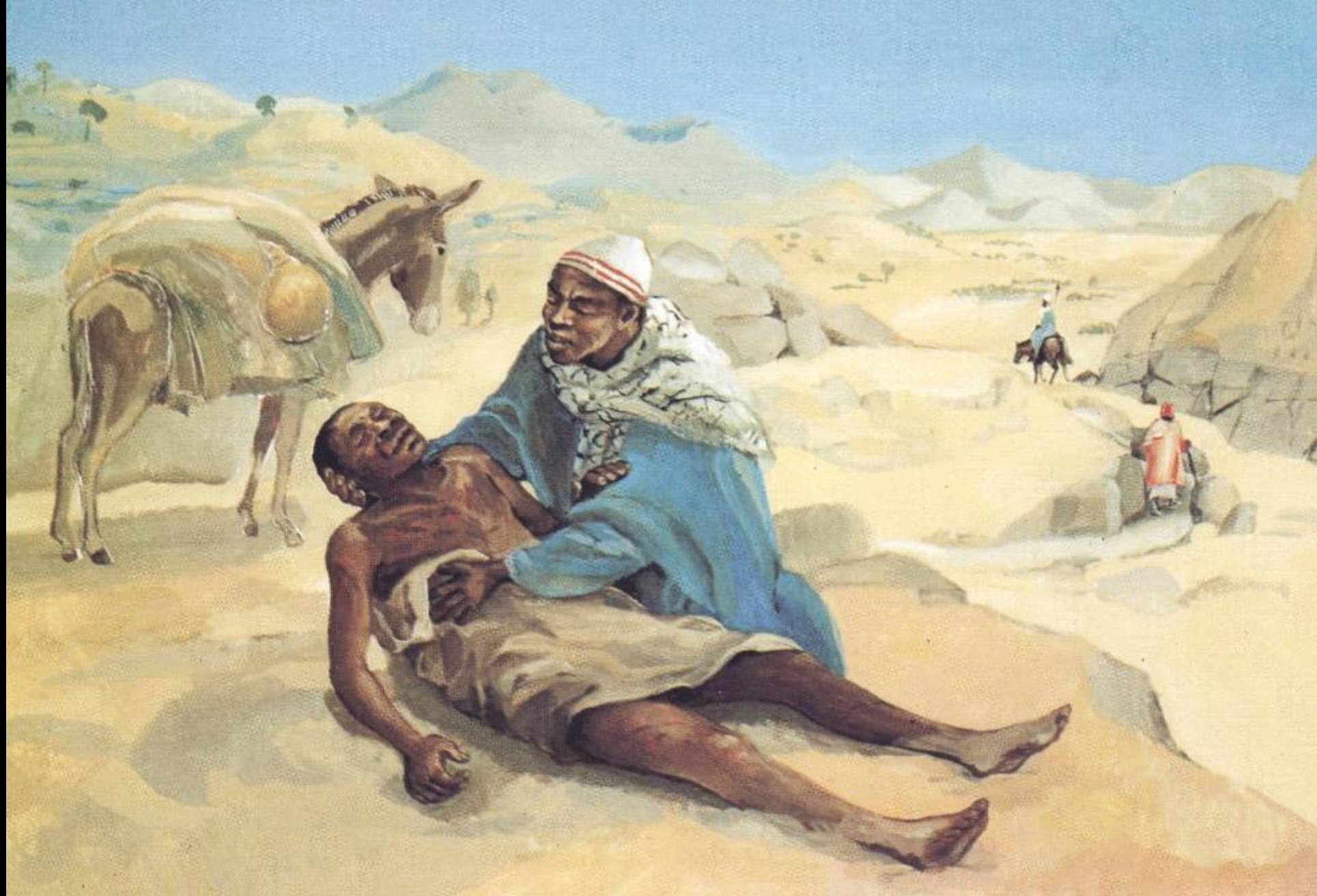
The Good Samaritan -- JESUS MAFA, Cameroon