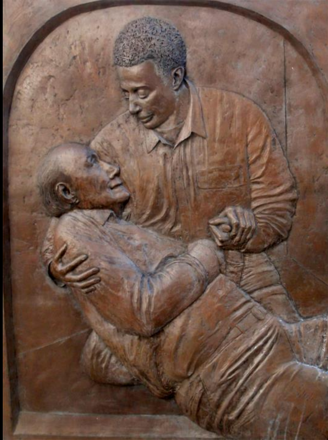
The Good Samaritan Monument