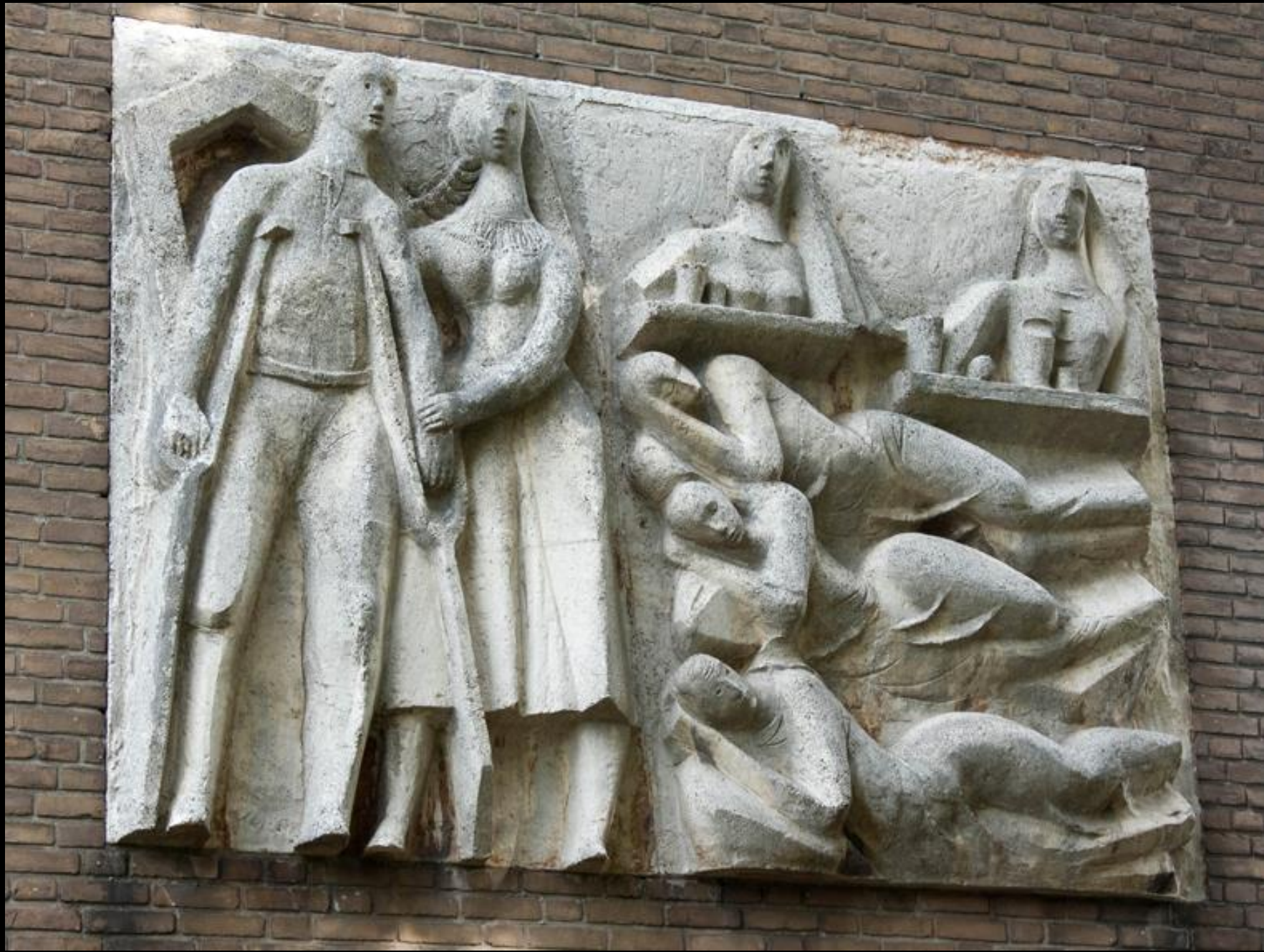
The Good Samaritan Cared for at the Inn -- Charles Eyck, Wageningen, Netherlands