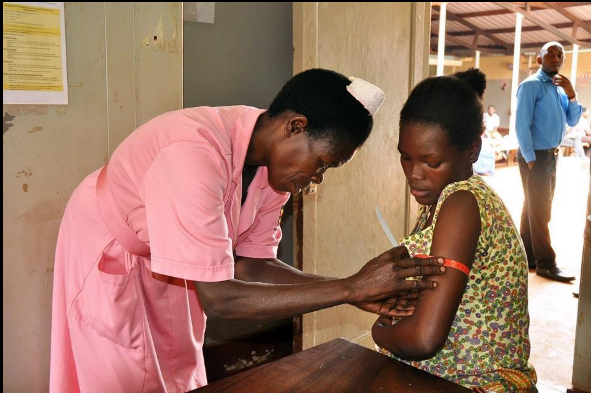
Maternal Health Checkup -- Jinja Regional Referral Hospital, Jinja, Uganda