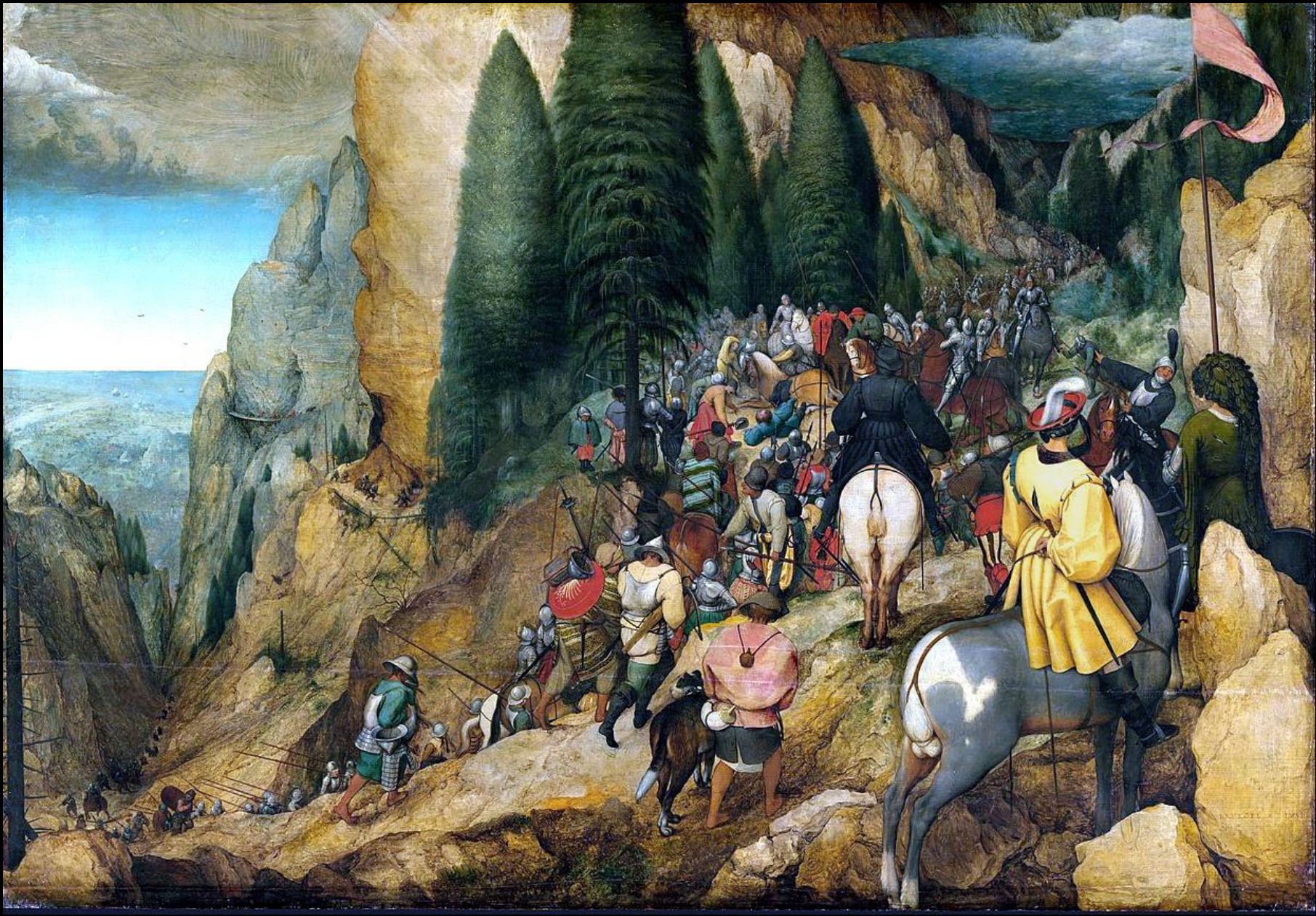
Conversion of Paul, Pieter Bruegel, 1567