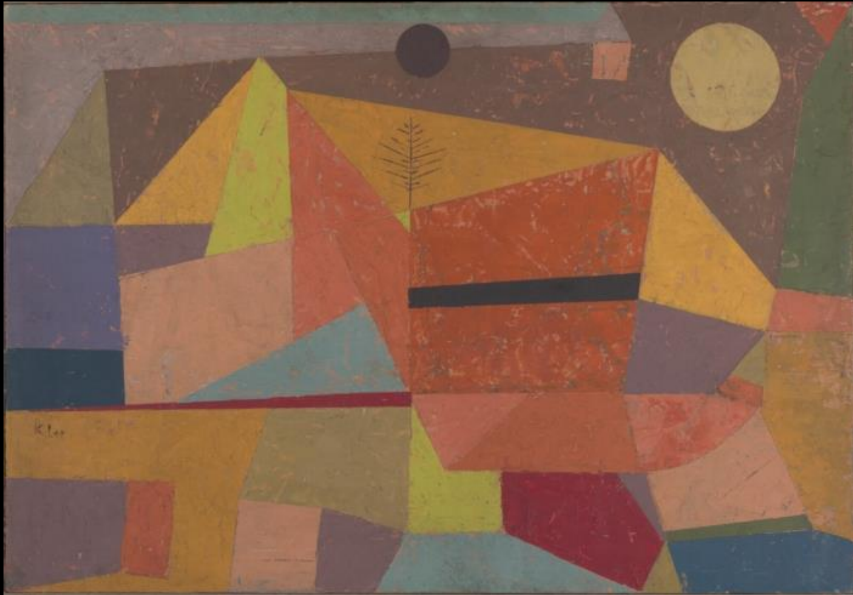
Joyful Mountain Landscape, Paul Klee, 1929