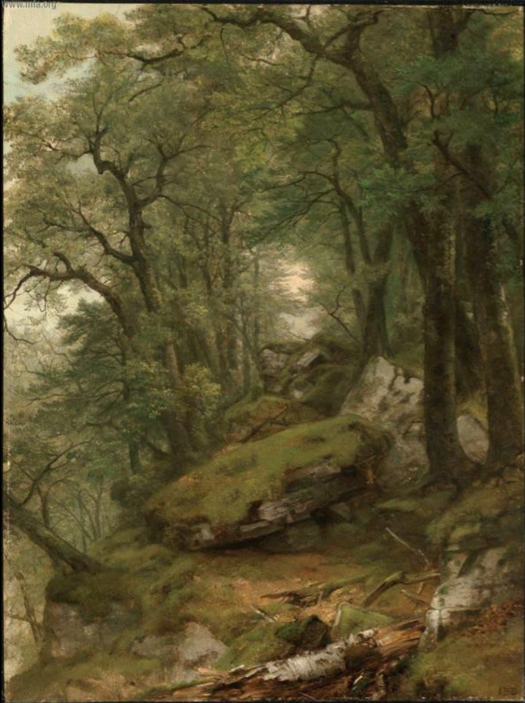
Woodland Interior A.B. Durand, 1855