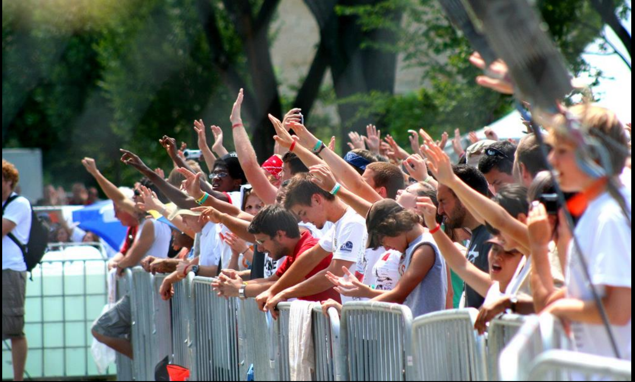
Unite Washington DC, 2008