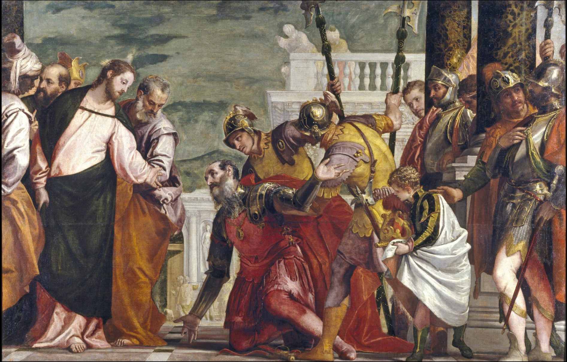
Jesus Heals the Centurion's Servant, Veronese, ca. 1571