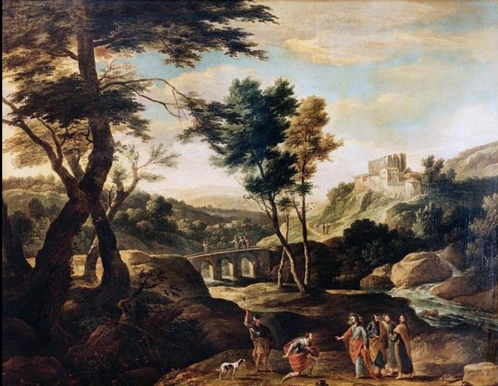
Jesus Heals the Centurion's Servant