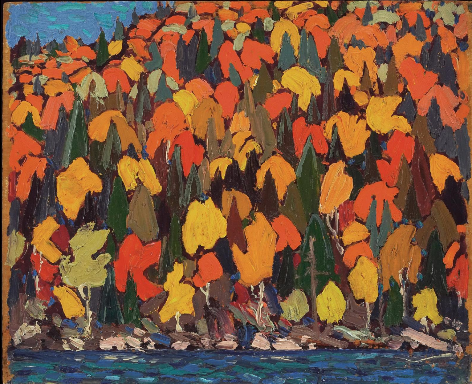
Autumn Foliage, Thomas John Thomson, 1915