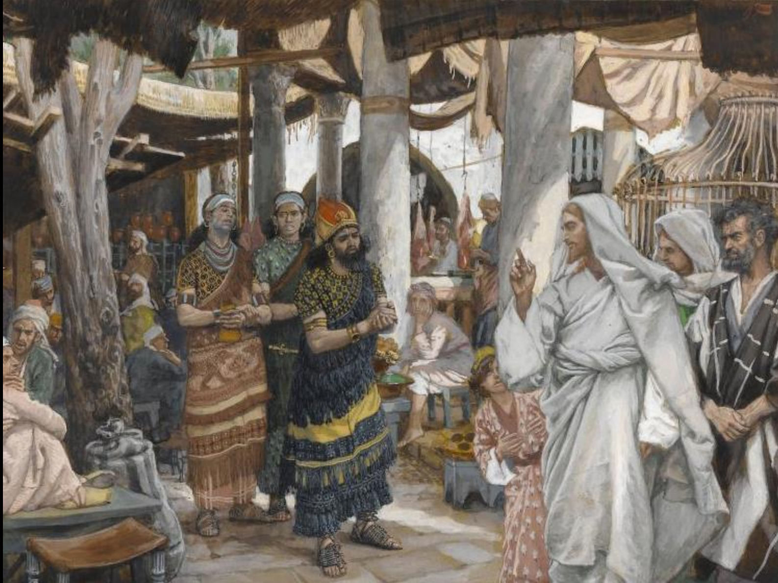
Jesus Heals the Centurion's Servant, James Tissot, ca. 1886-1894