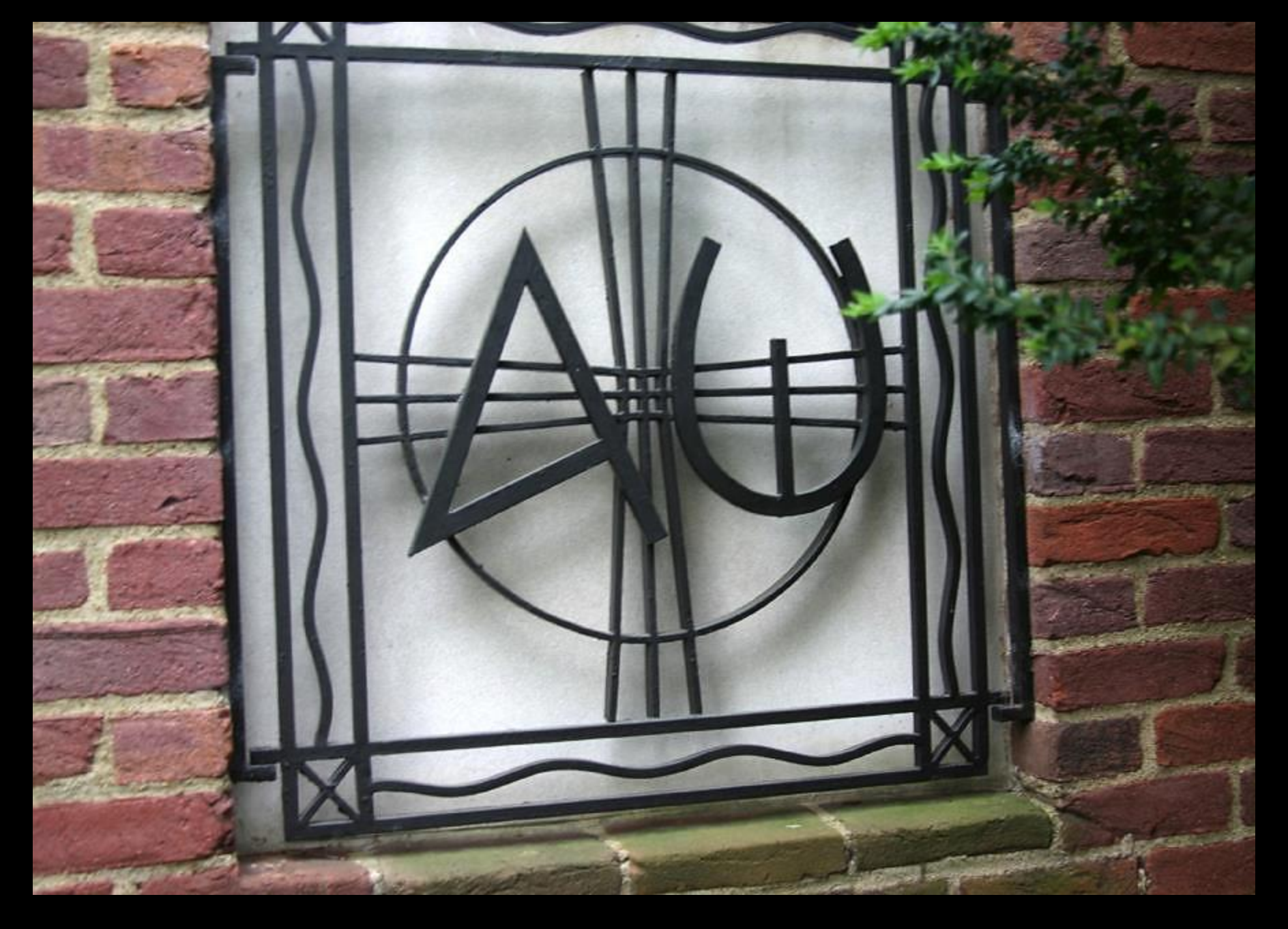
Alpha and Omega -- Metalwork, Benton Chapel, Vanderbilt University, Nashville, TN