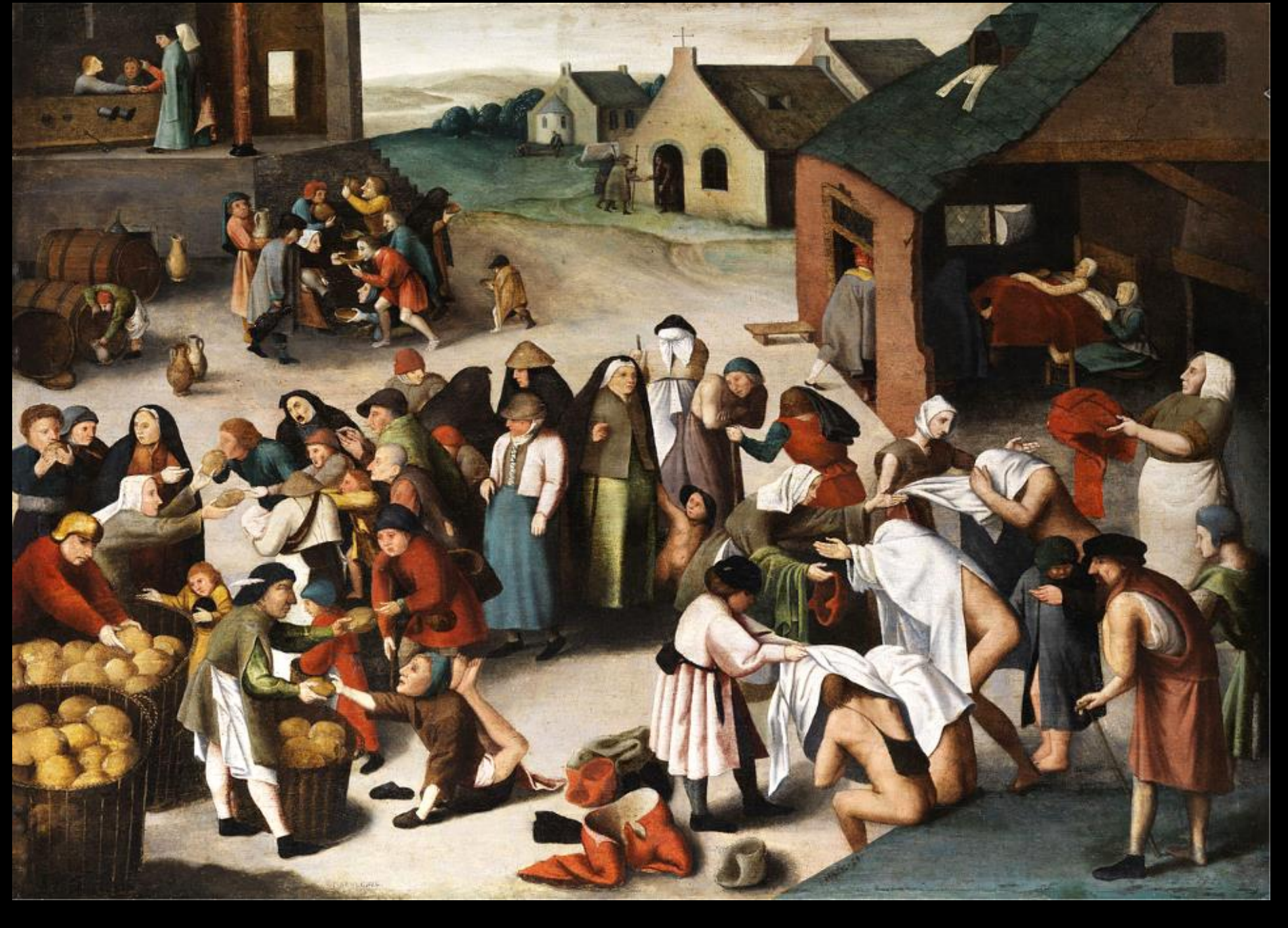
Works of Mercy -- by (after) Pieter Brueghel The Younger