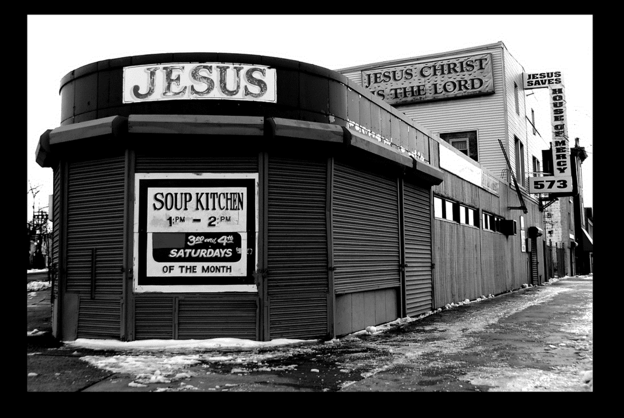
Soup Kitchen at the House of Mercy Church, Winter 2009