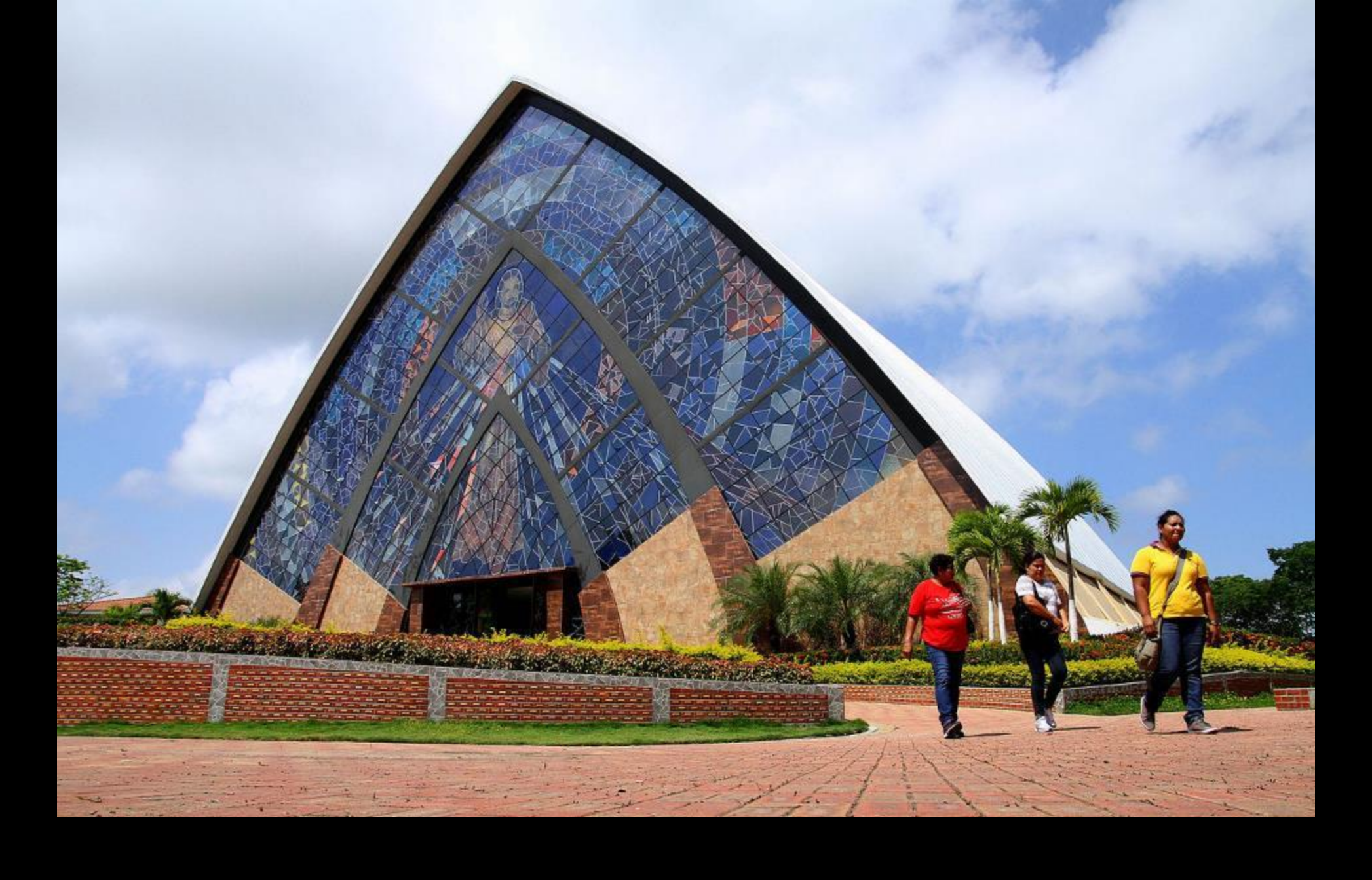
Sanctuary of the Divine Works of Mercy -- Guayaquil, Ecuador