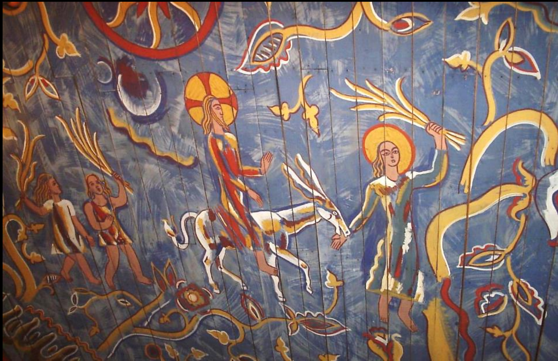
Christ on the Colt -- Church of Saint Matthew, Methodist Assembly, Goteborg, Sweden