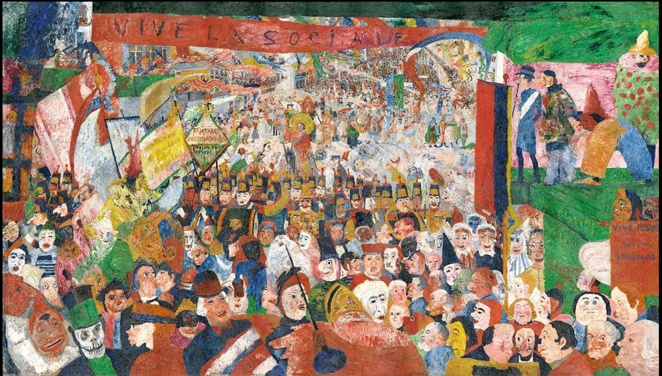
Christ's Entry into Brussels, 1889 -- James Ensor, Getty Museum, Los Angeles, CA