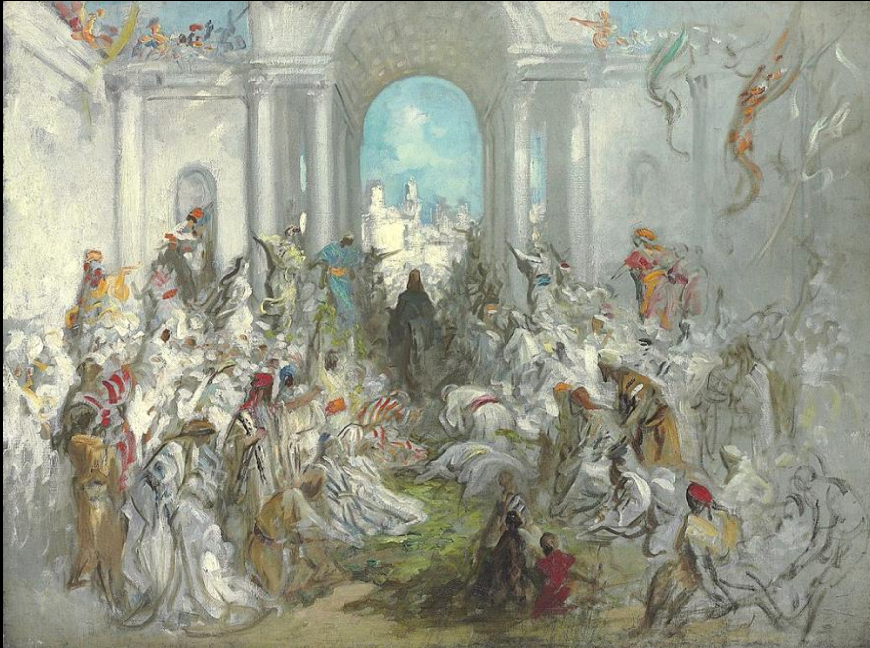
Entry into Jerusalem -- Gustave Dore, Clark Art Institute, Williamstown, MA