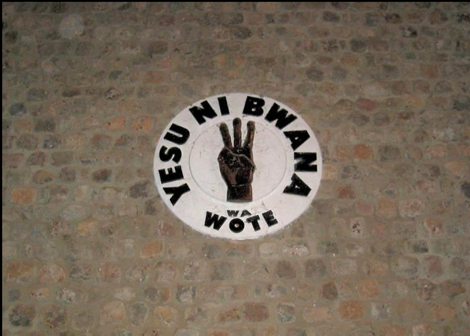
Jesus is Lord of All -- Panel in Chapel, Mulungwishi Mission, D. R. Congo