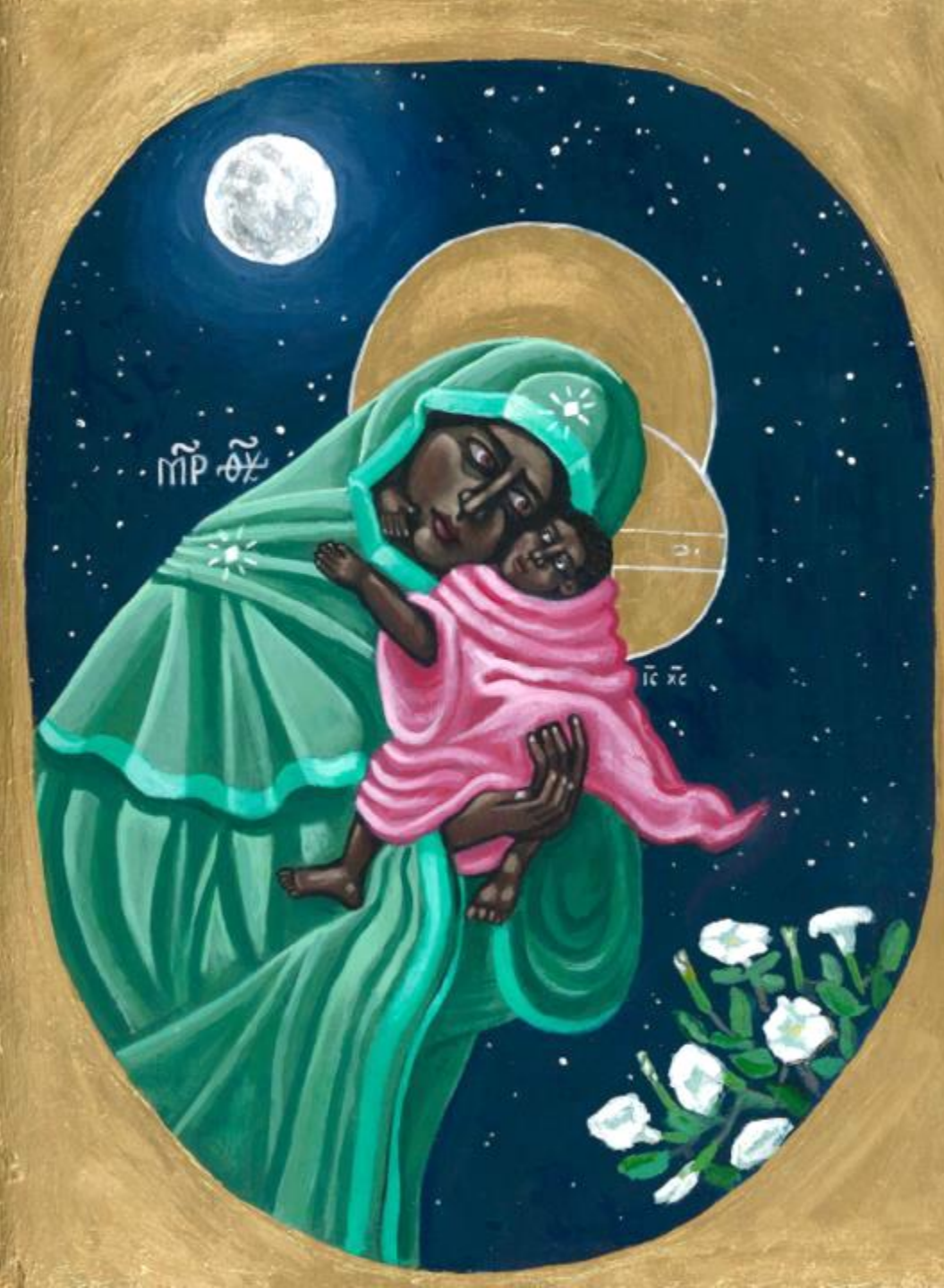
Mary and Jesus