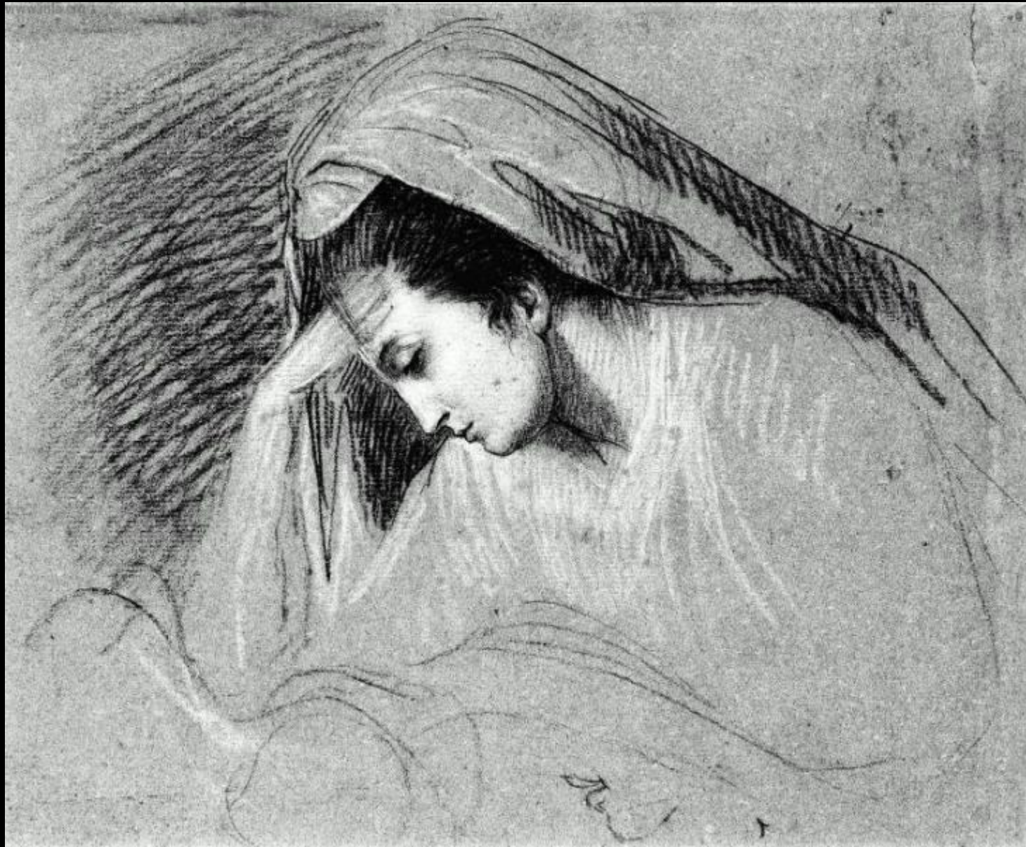
Study for the Head of the Virgin -- John Singleton Copley, Museum of Fine Arts, Boston, MA