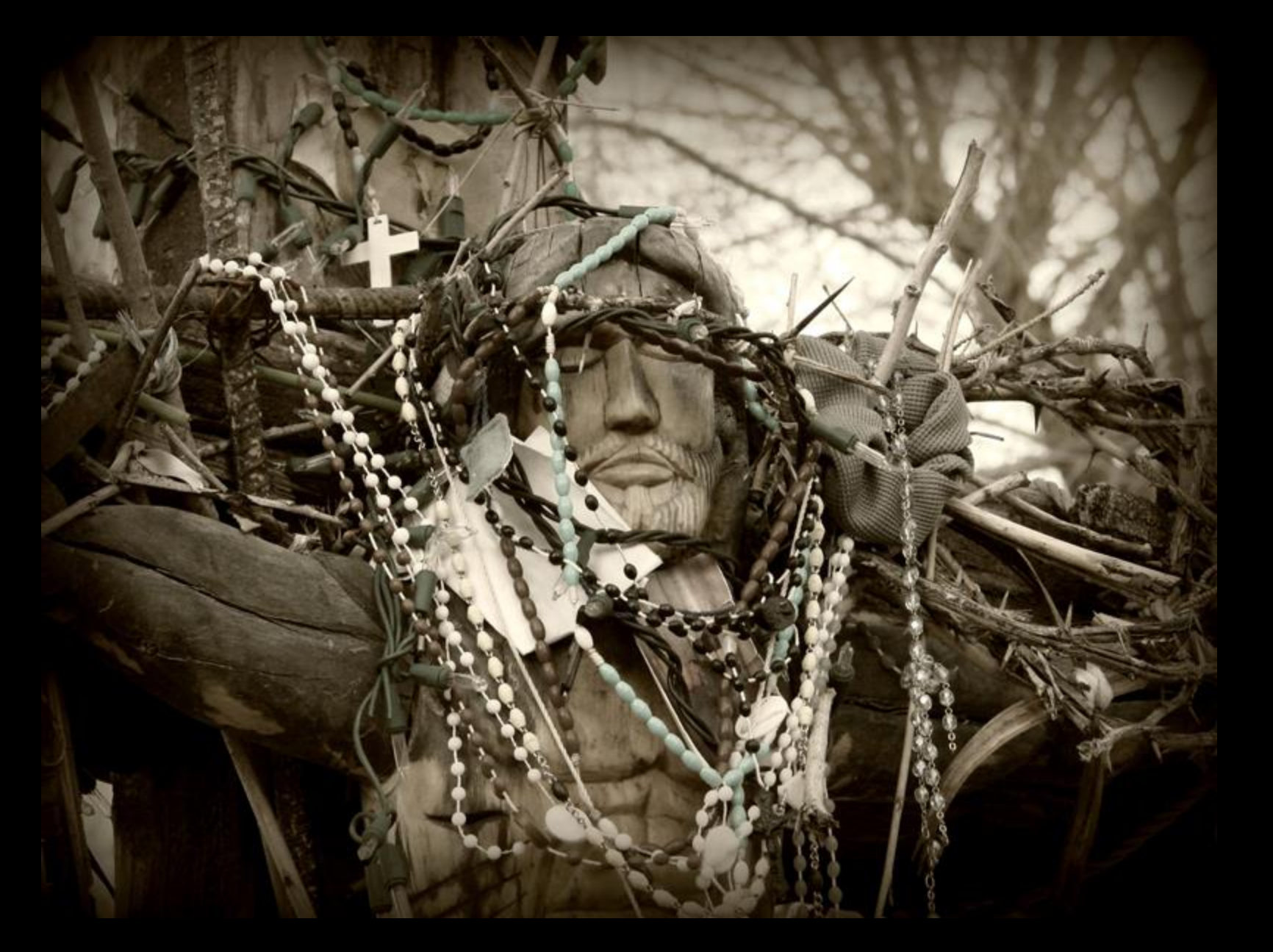
Crucifixion -- Chimayo, New Mexico