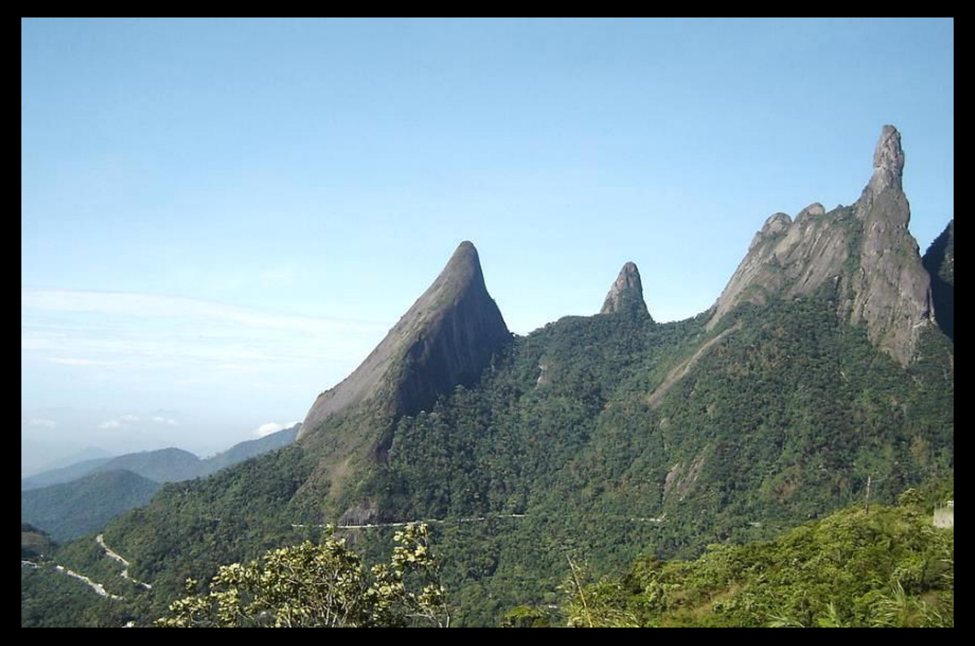
The Finger of God Rock Formation -- Teresopolis, Brazil