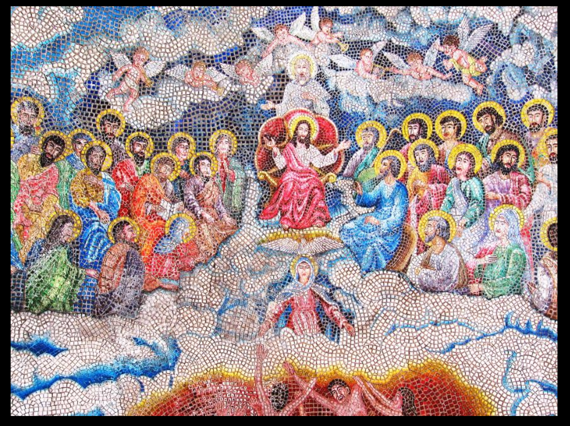
Heaven-- Tigbauan Church, Iloilo, Philippines