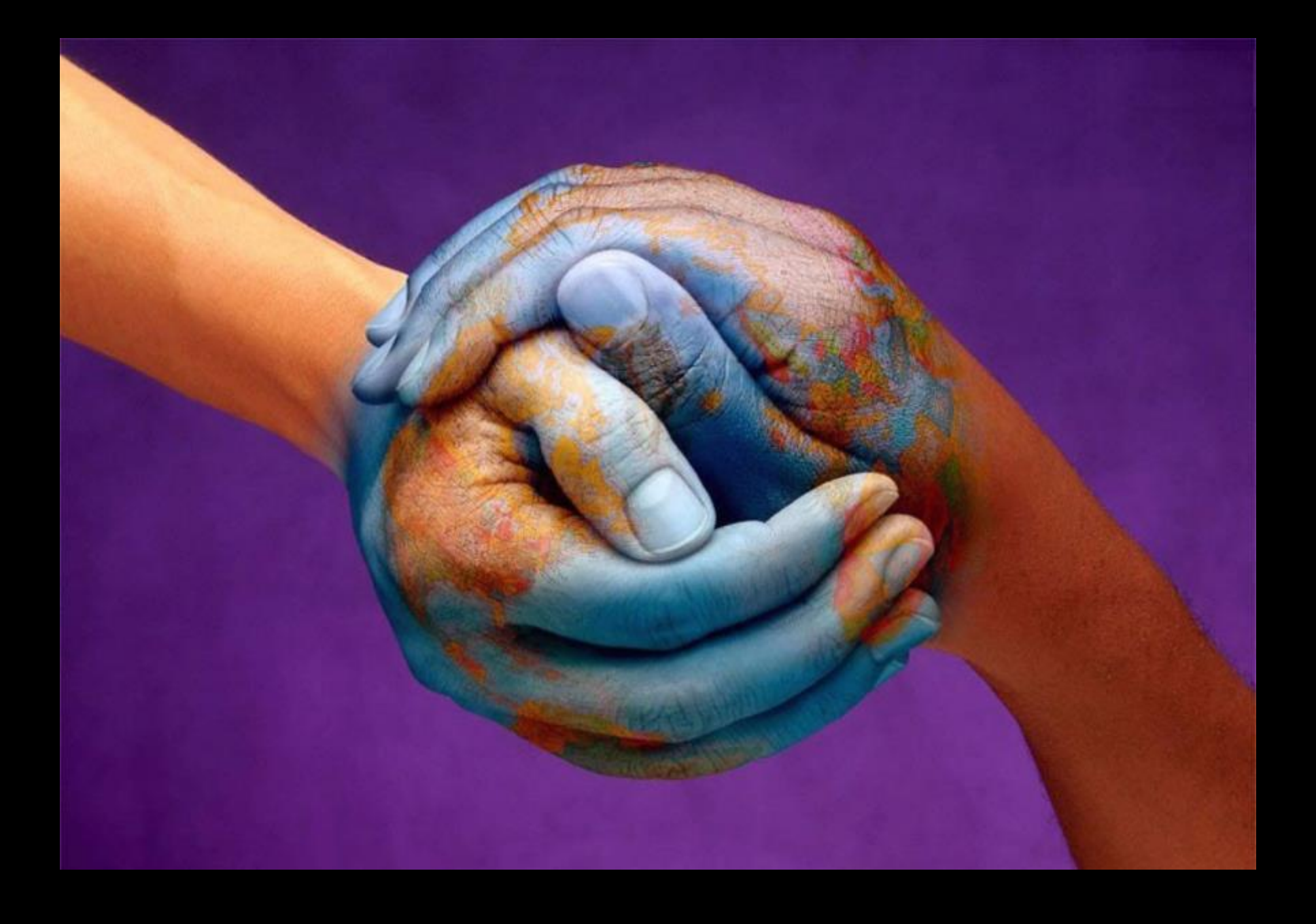
Hands of the World -- Non-profit "Movement for Peace" graphic