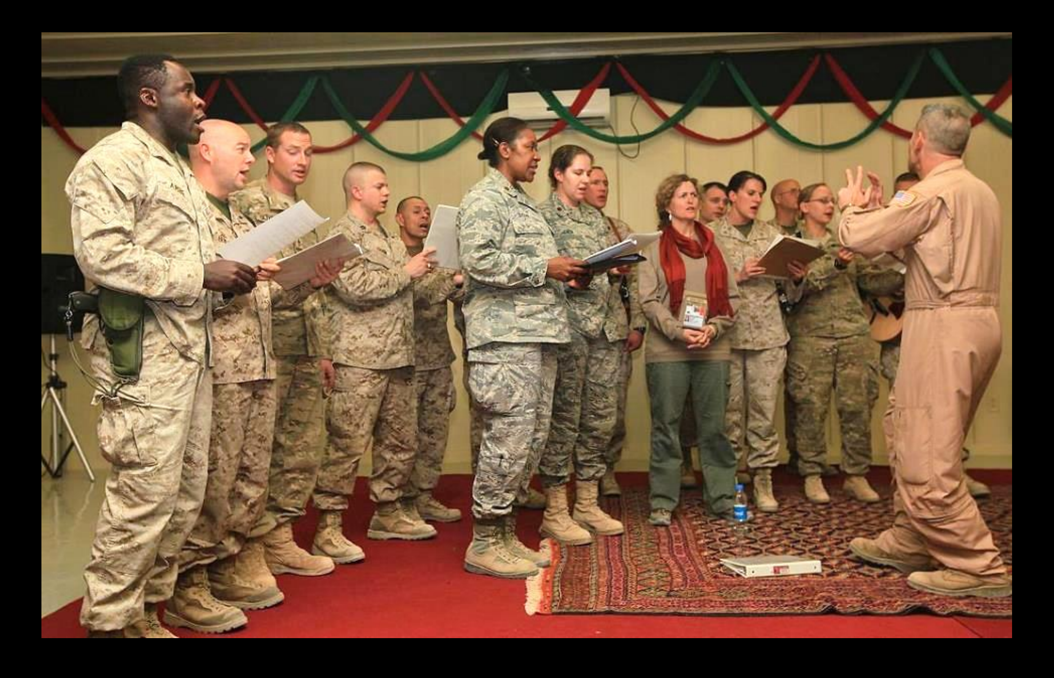
Christmas Choir, US Armed Forces -- Afghan Cultural Center, Helmand, Afghanistan