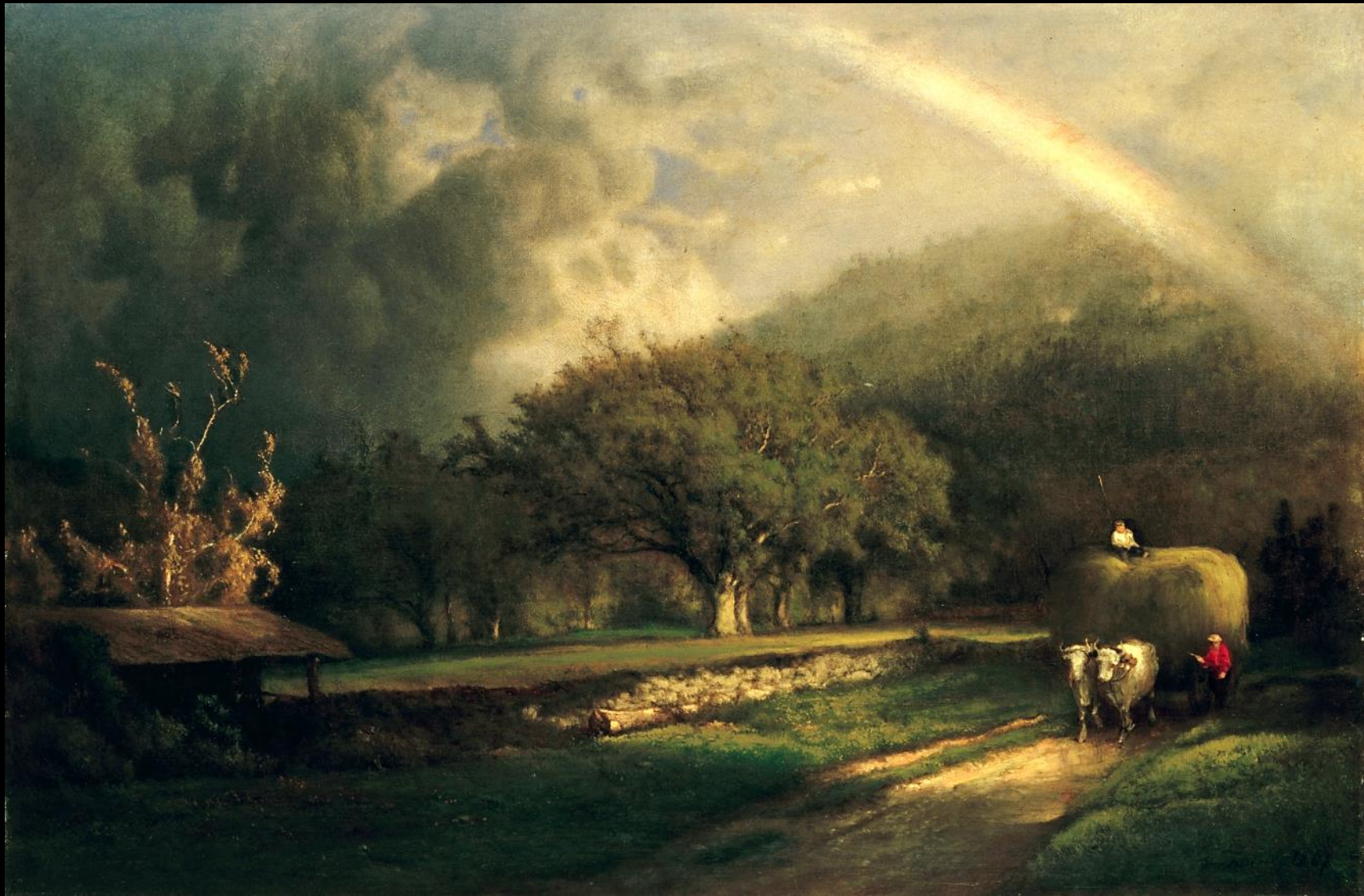
Rainbow in the Berkshire Hills George Inness, 1869