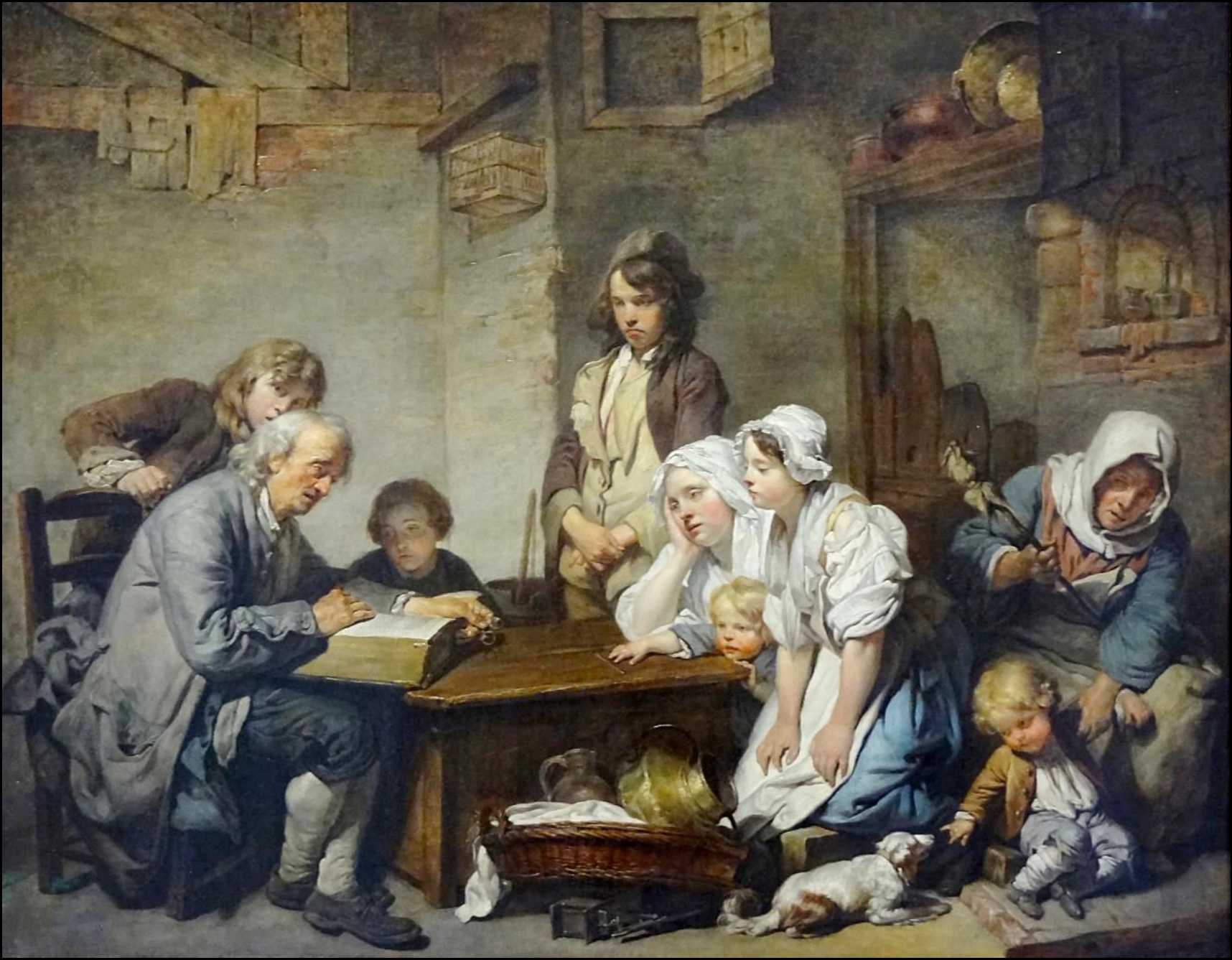
Reading the Bible -- Jean-Baptiste Greuze, Louvre, Paris, France