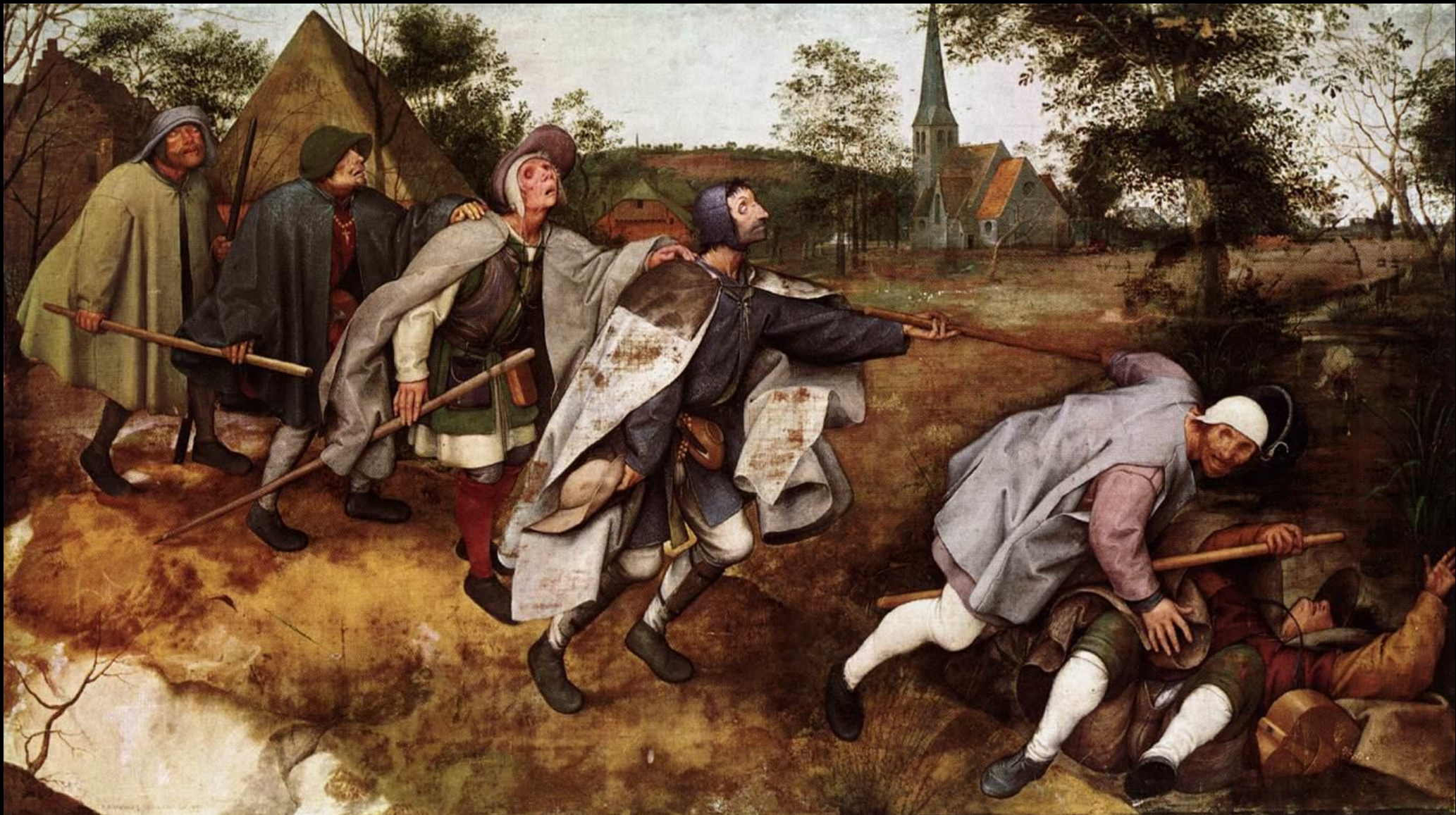
Calling of the Disciples -- JESUS MAFA, Cameroon