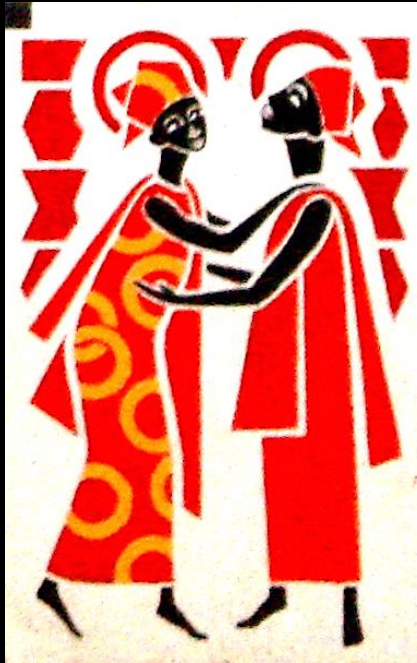
Visit of Mary to Elizabeth Keur Moussa Abbey Senegal