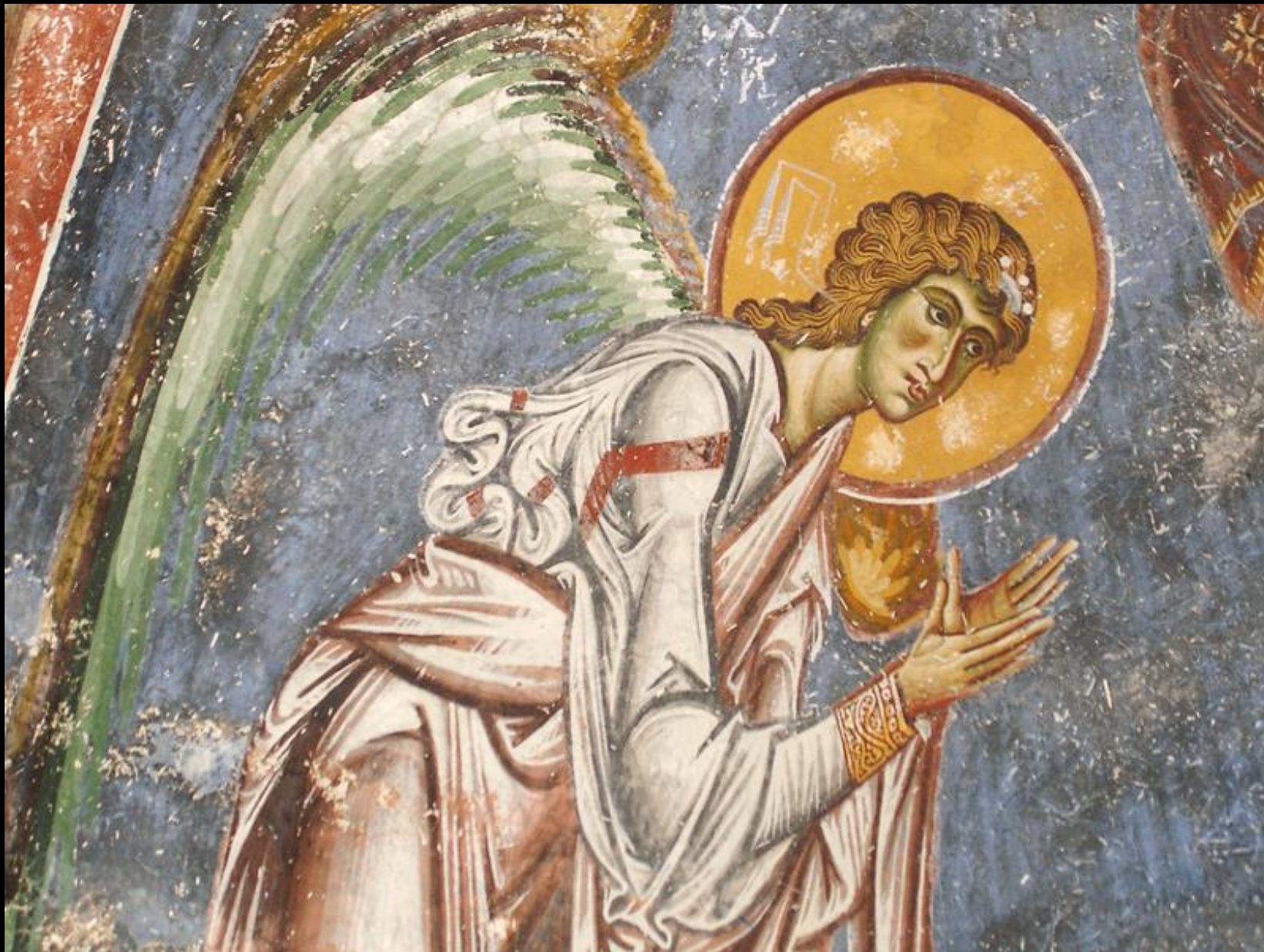
Gabriel -- St. George Church, Kurbinovo, Macedonia