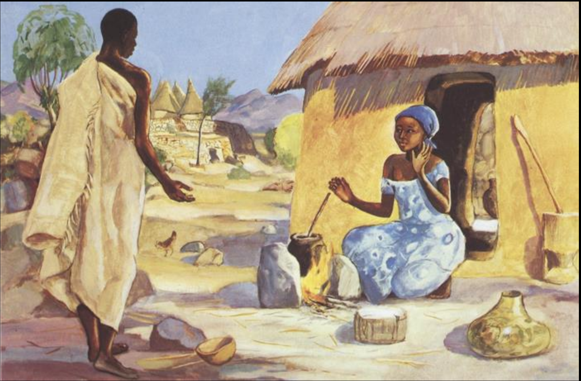
Annunciation -- JESUS MAFA, Cameroon