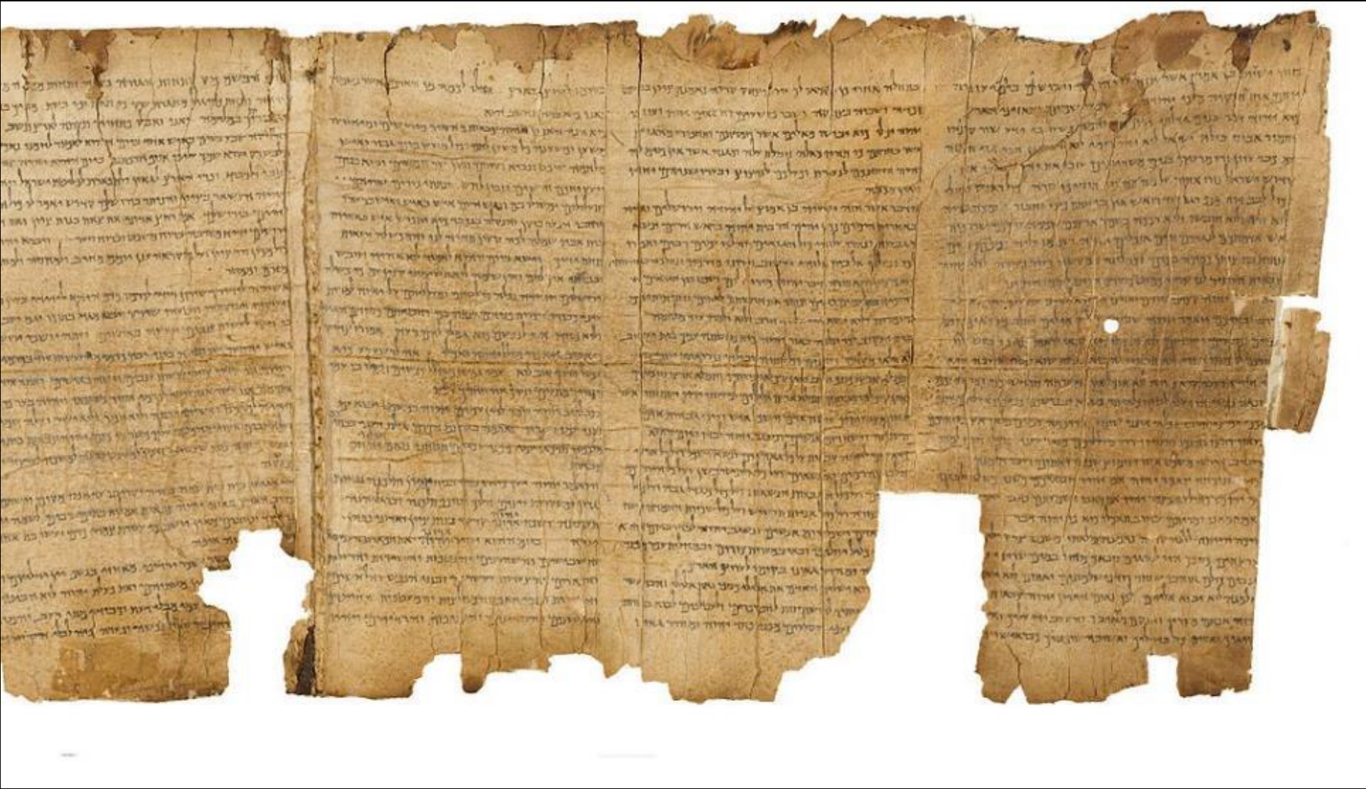
Great Isaiah Scroll -- Qumran, Israel Museum, Jerusalem, Israel