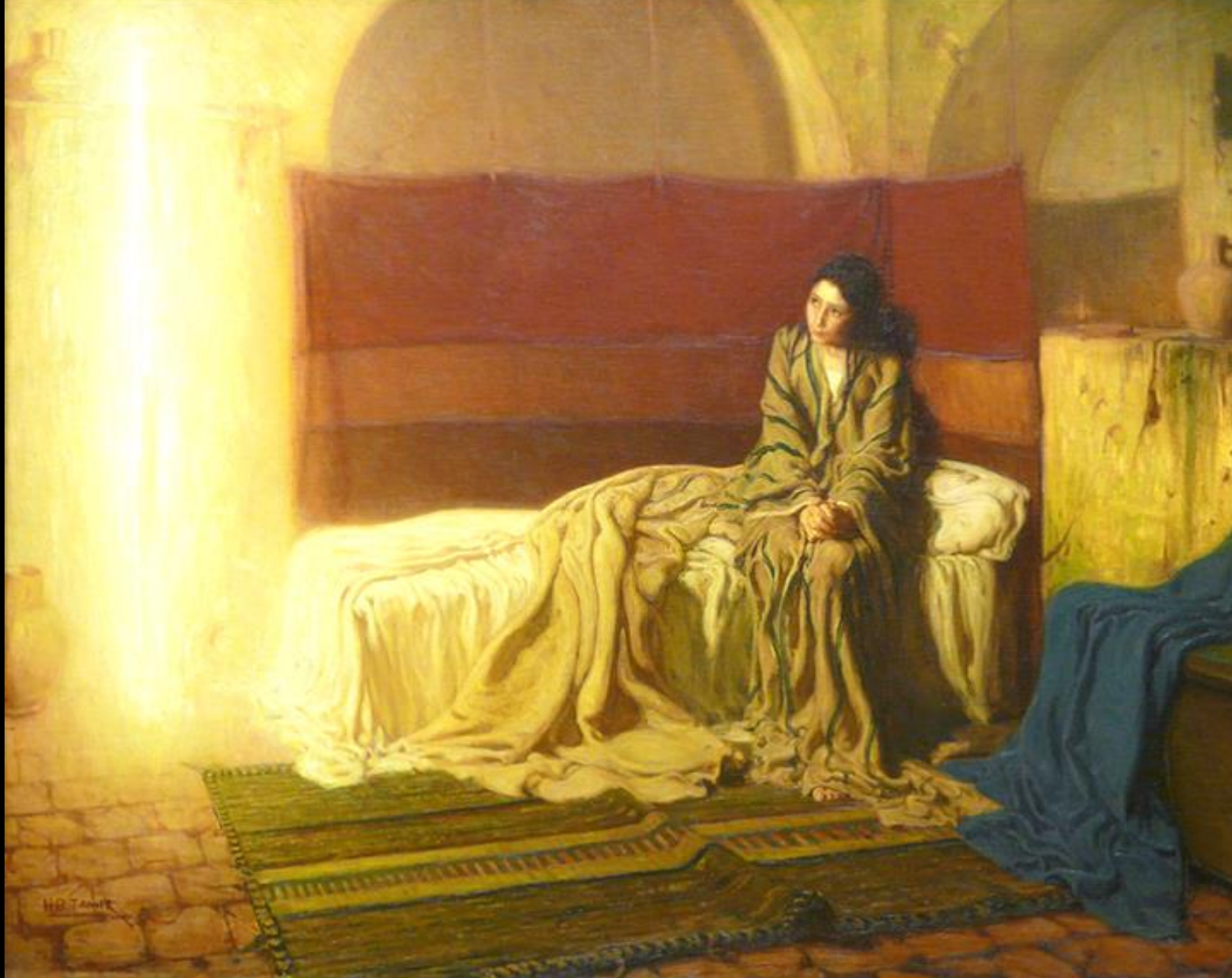
Annunciation -- Henry Ossawa Tanner, Philadelphia Museum of Art, Philadelphia, PA