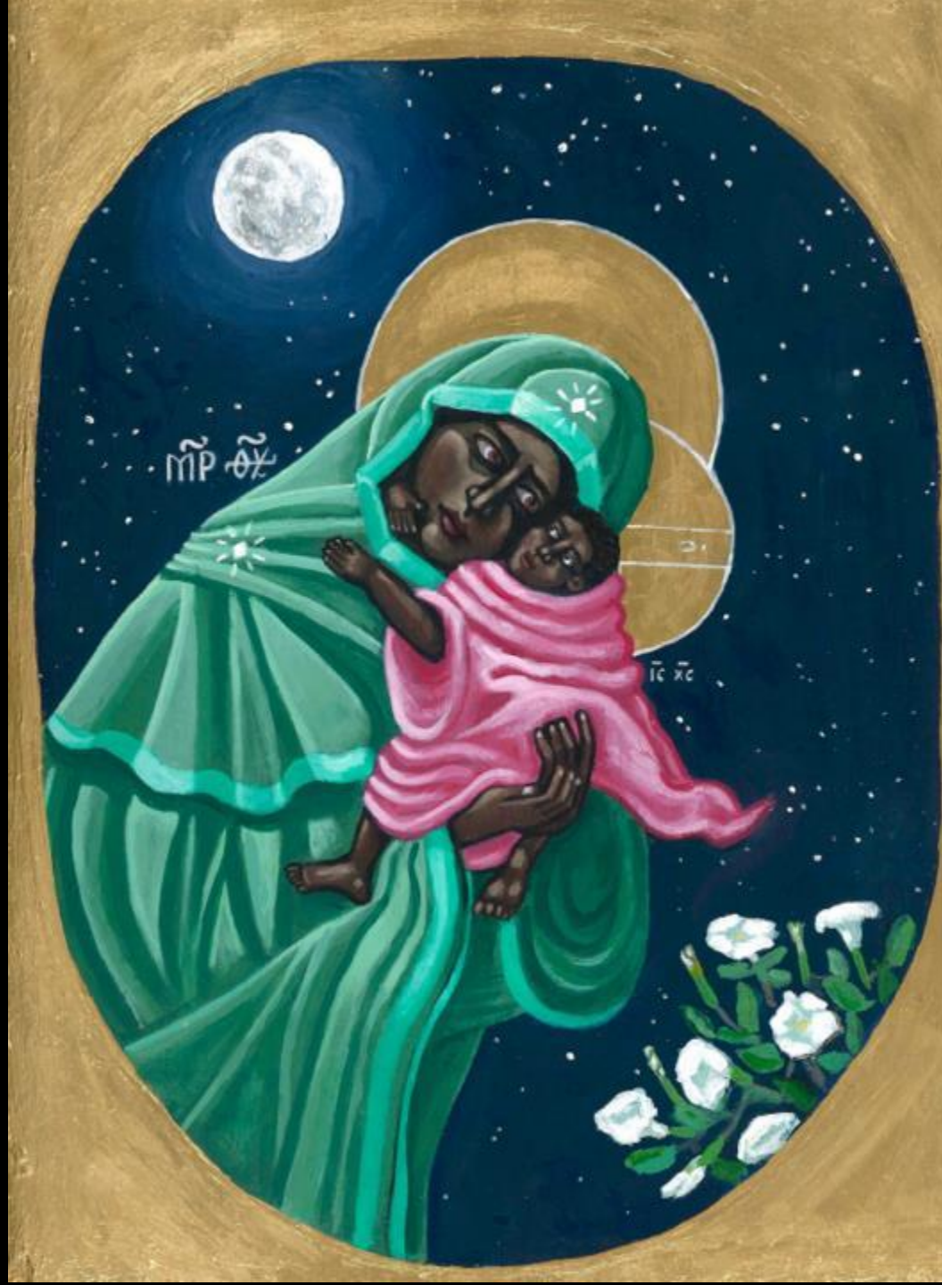
Madonna and Child