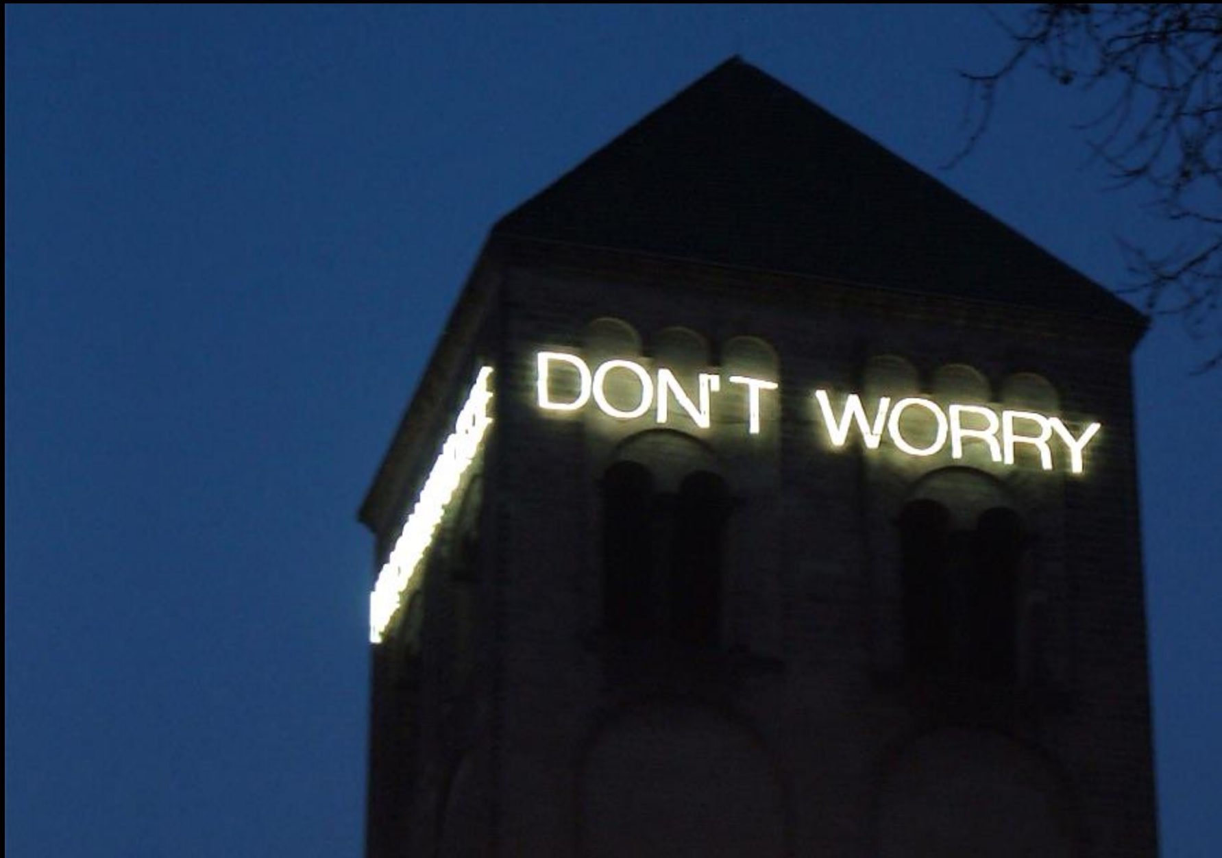
Don't Worry -- Martin Creed, permanent installation, St. Peter's Cathedral, Cologne, Germany