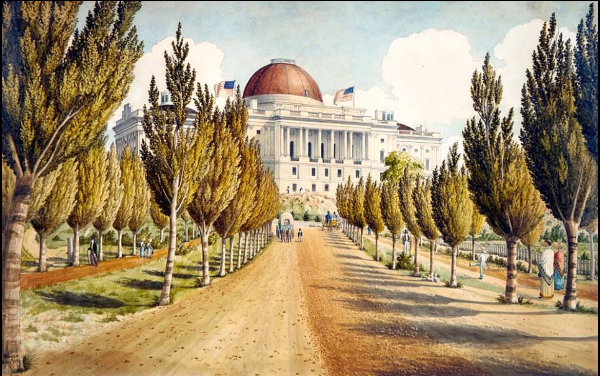
View of the United States Capitol -- watercolor, 1824, Metropolitan Museum of Art, New York, NY