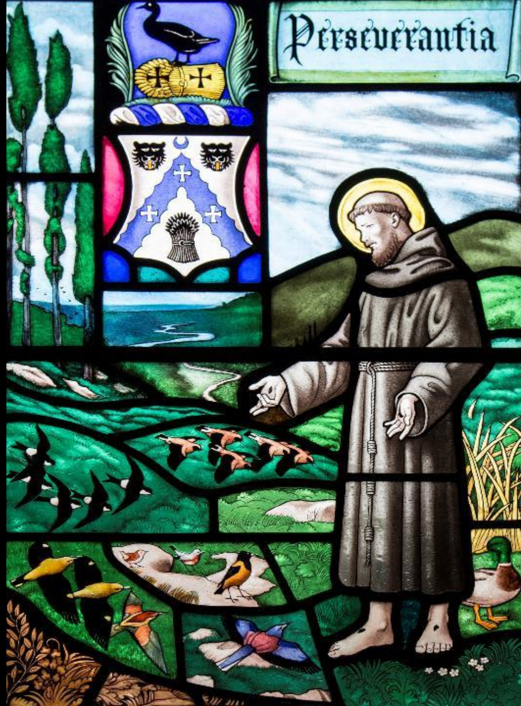
St. Francis and the Birds