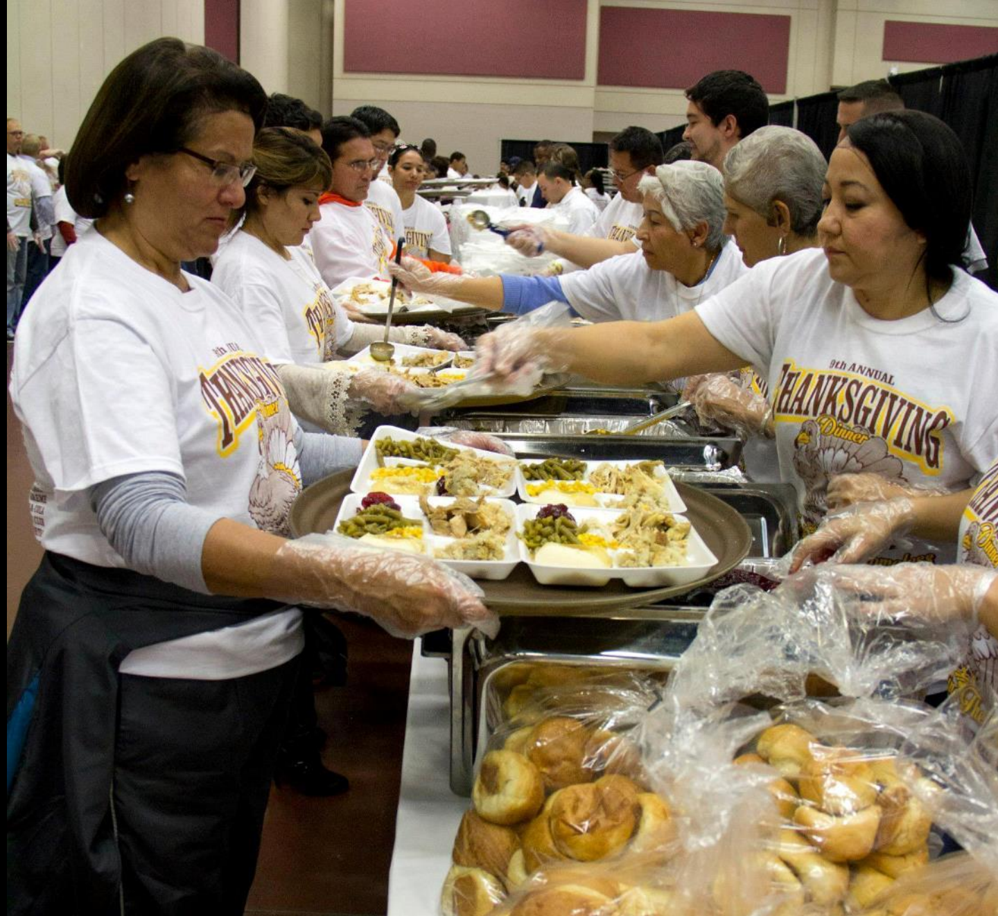
Preparing Thanksgiving for Homeless Community -- El Paso, TX