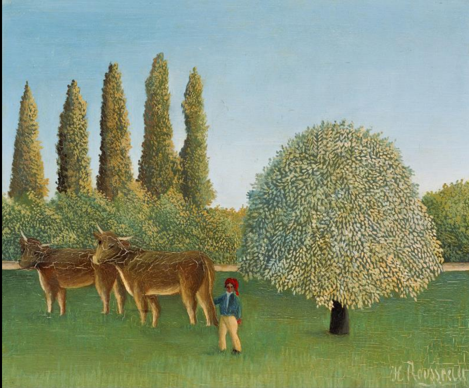
Meadowland -- Henri Rousseau, Bridgestone Museum of Art, Tokyo, Japan