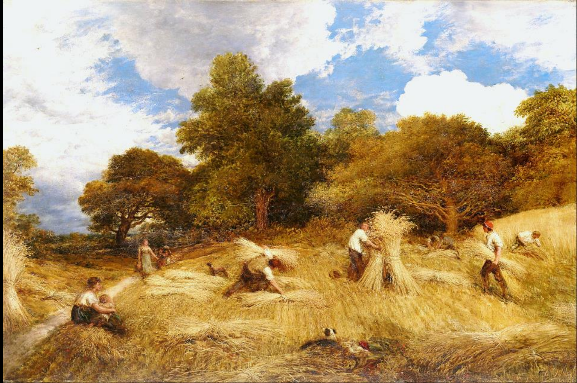
Wheat -- John Linnell, National Gallery of Victoria, Melbourne, Australia