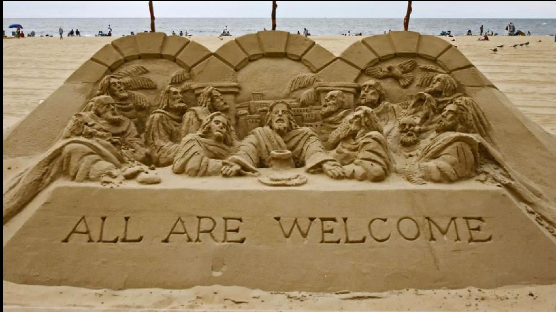
All Are Welcome in the Kingdom of God -- Sand sculpture, Ocean City, MD