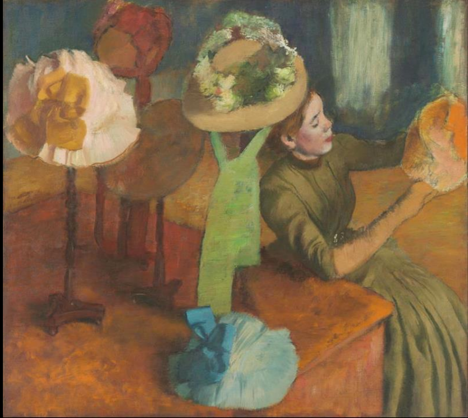
The Millinery Shop

Edgar Degas Art Institute of Chicago Chicago, IL