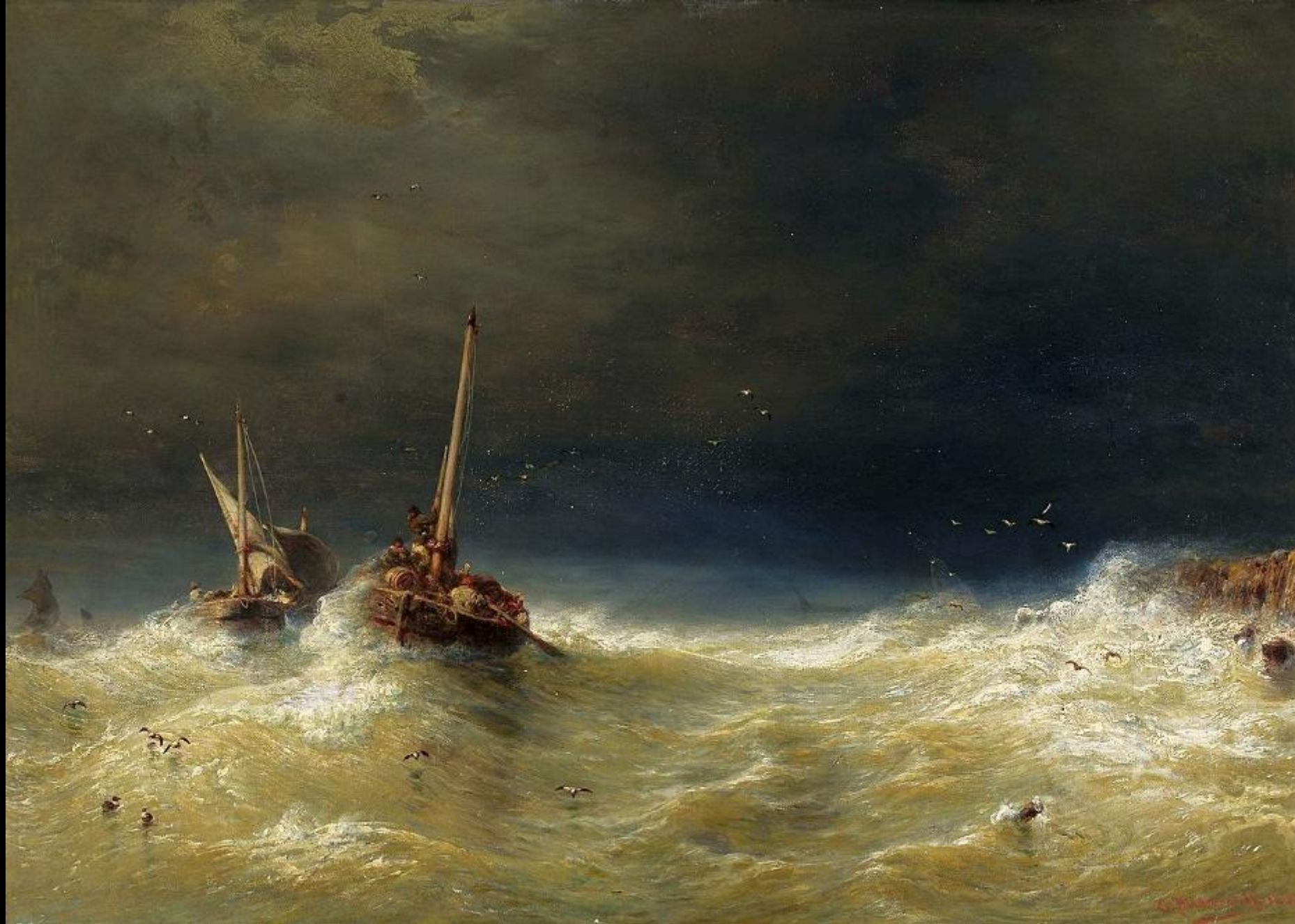
Sea Storm -- Eduard Hildebrandt, National Museum in Warsaw, Warsaw, Poland