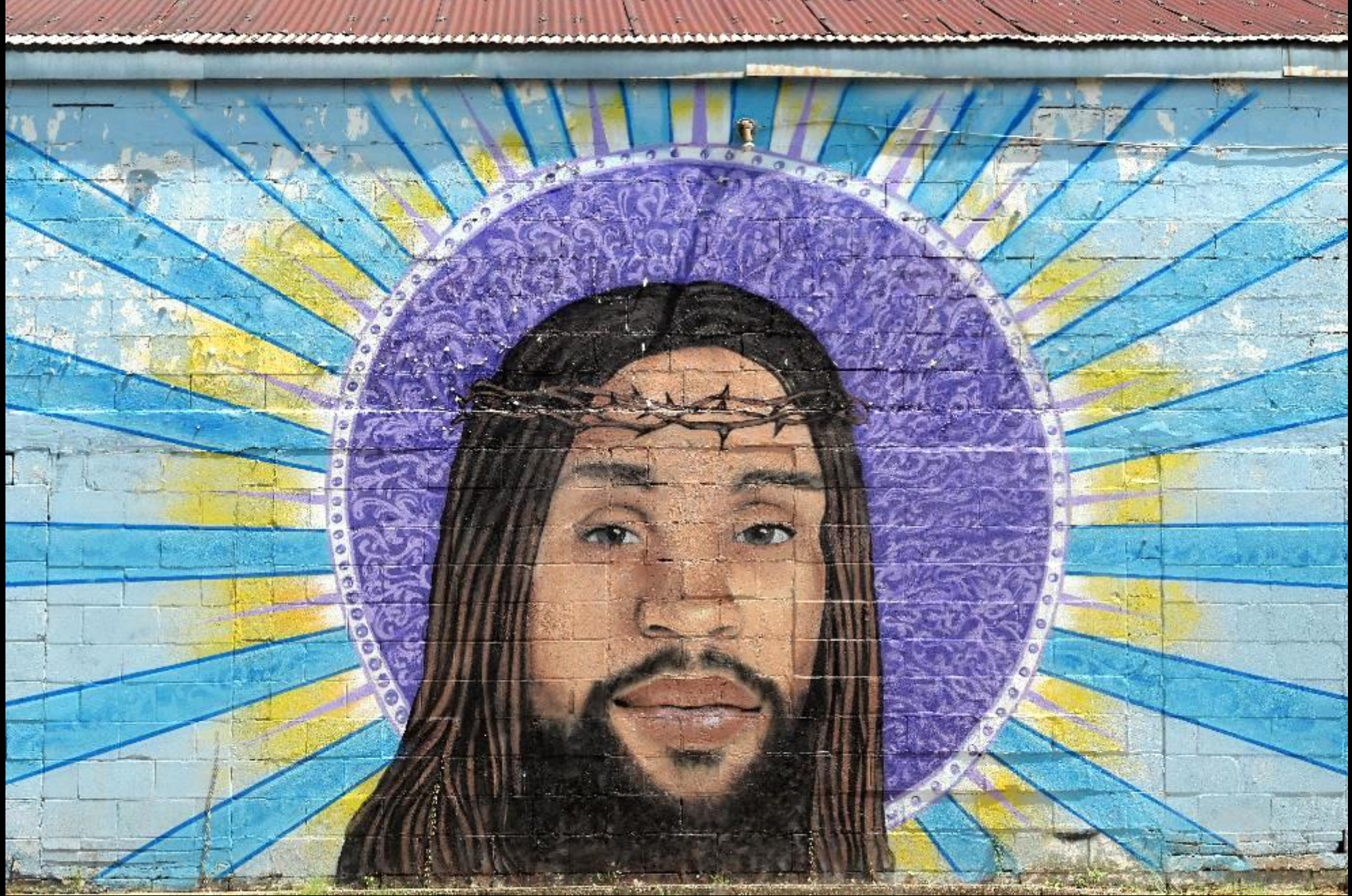
Jesus, the Holy Mural -- The Way Jesus Christ Christian Church, New Orleans