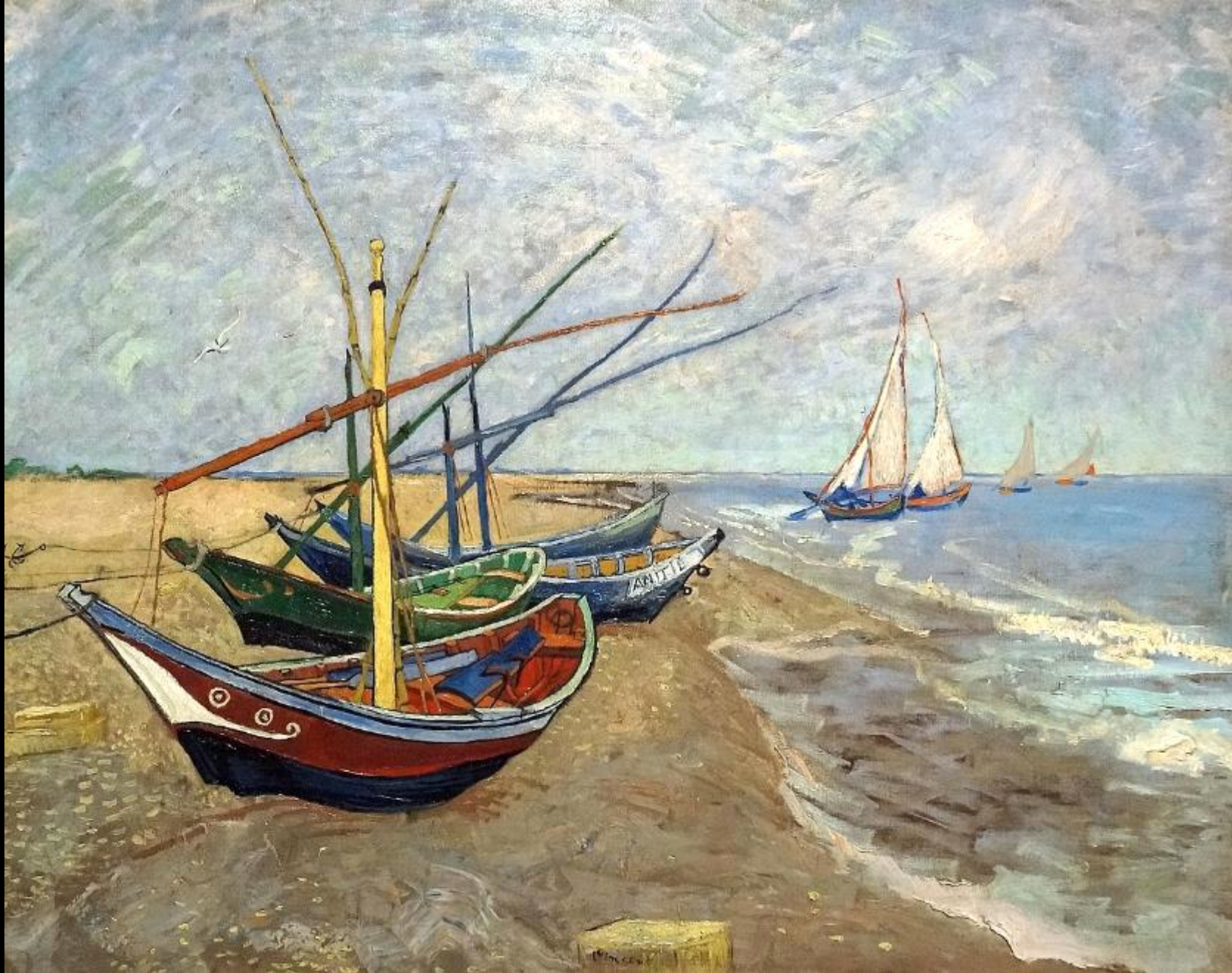
Fishing Boats on the Beach -- Vincent Van Gogh, Van Gogh Museum, Amsterdam