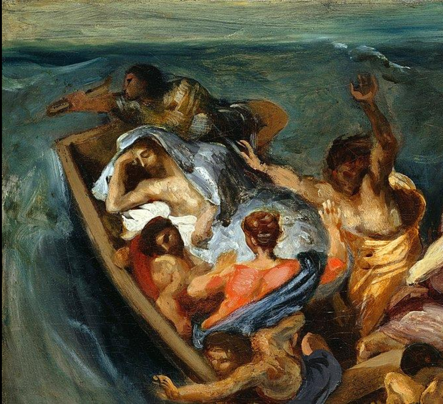
Christ on the Sea of Galilee, detail -- Eugene Delacroix, Nelson-Atkins Museum of Art, Kansas City, MO