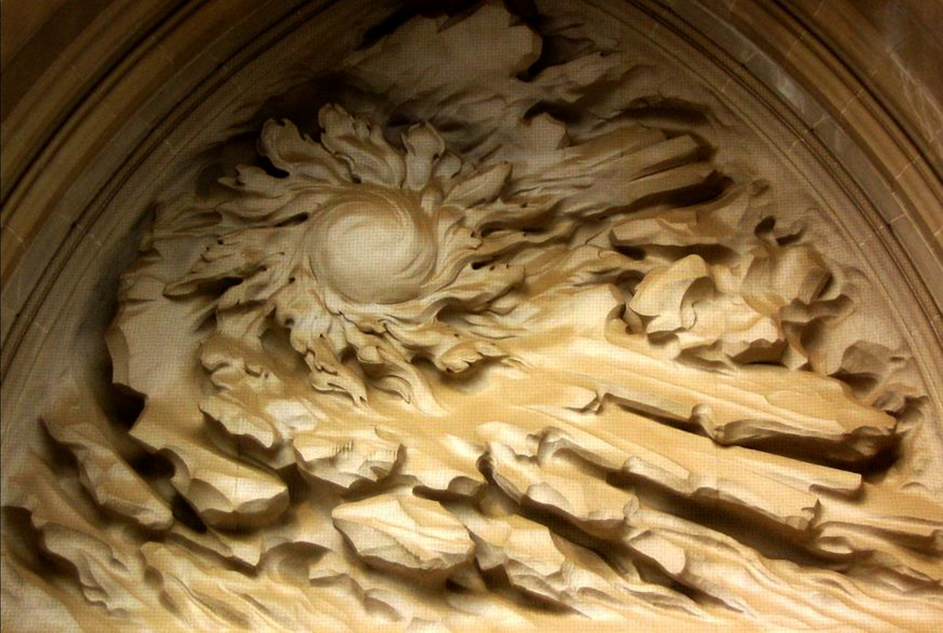
Separation of Light from Darkness -- Frederick Hart, National Cathedral, Washington, DC