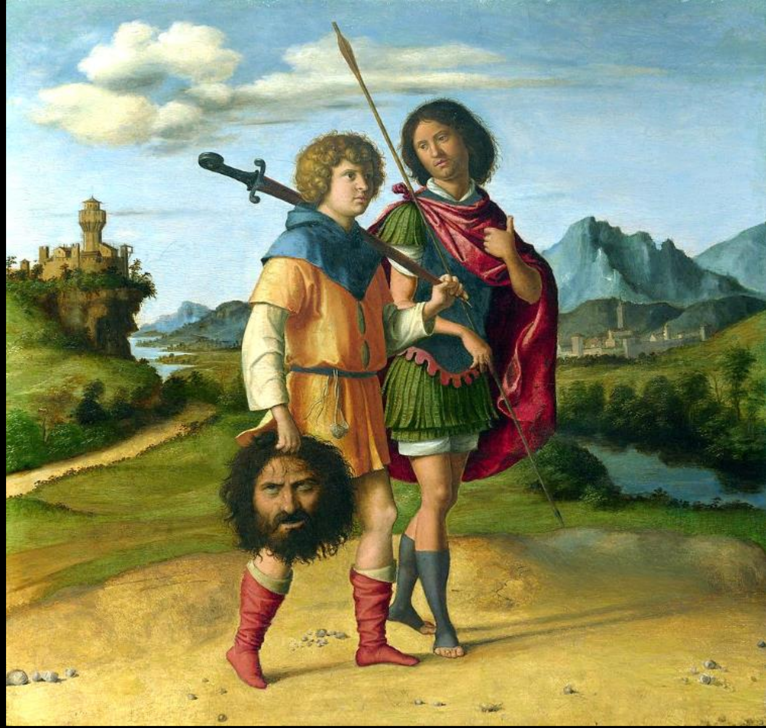
David and Jonathan Cima da Conegliano National Gallery London, England