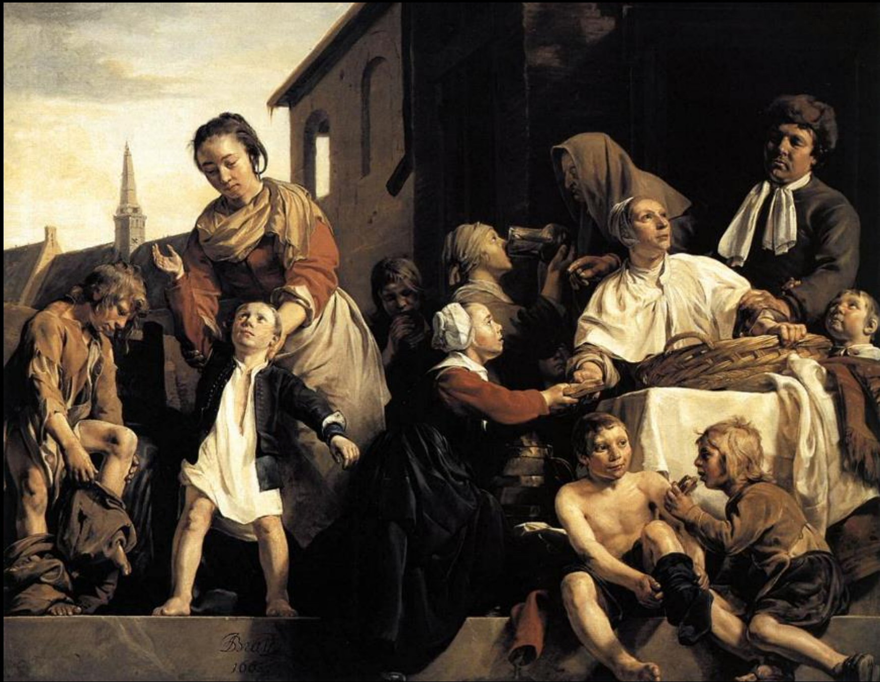
Tending Children at the Orphanage, Jan de Bray, Frans Hal Museum, Haarlem, Netherlands