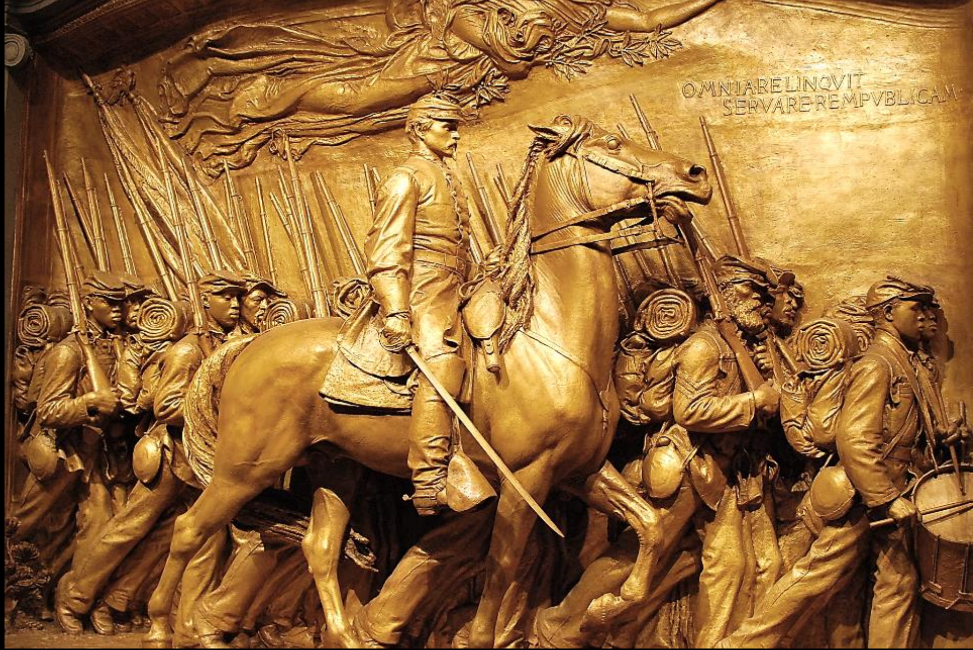
Shaw Civil War Memorial -- Augustus Saint-Gaudens, National Gallery of Art, Washington, DC