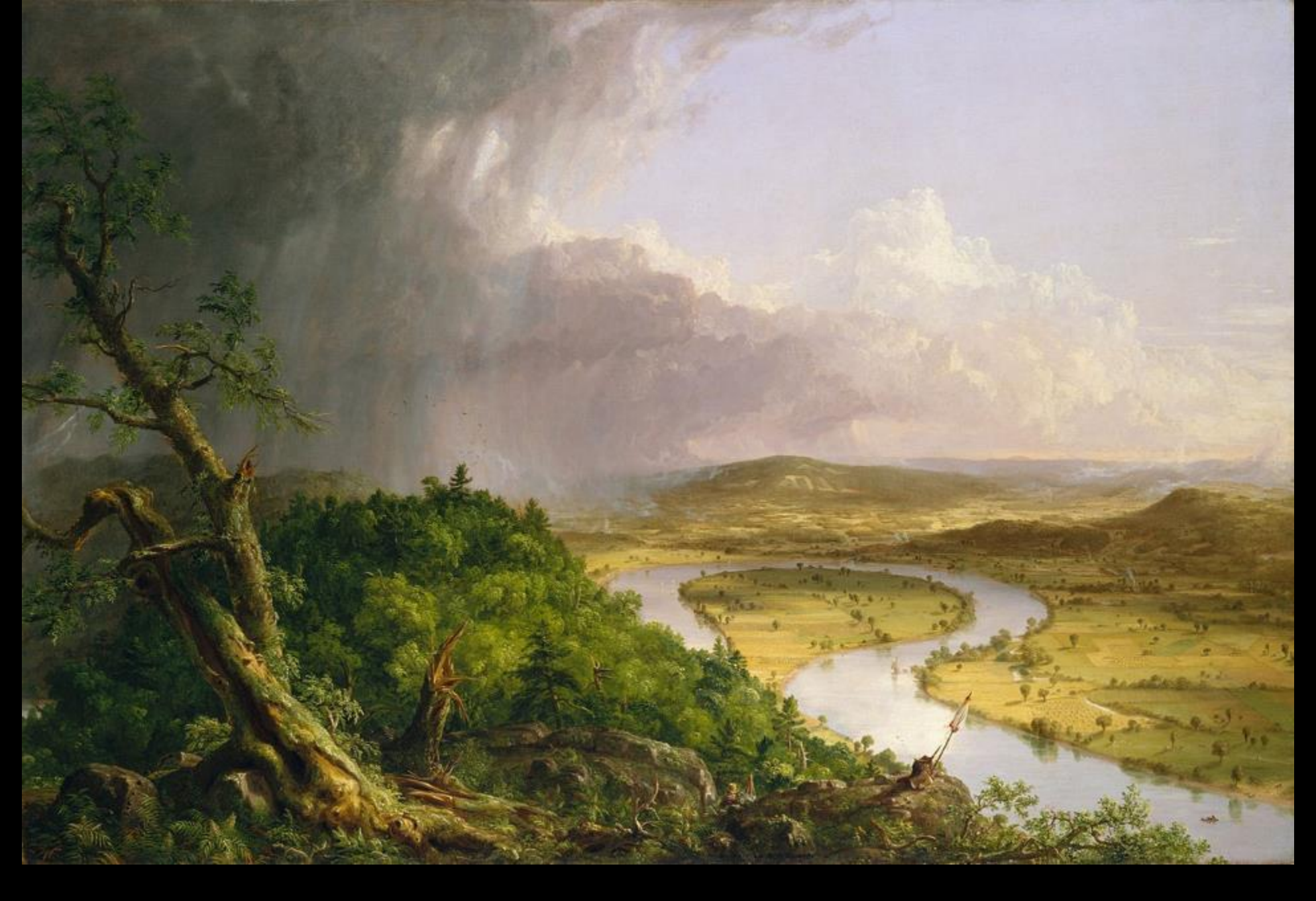
After the Thunderstorm - The Oxbow -- Thomas Cole, Metropolitan Museum of Art, New York, NY