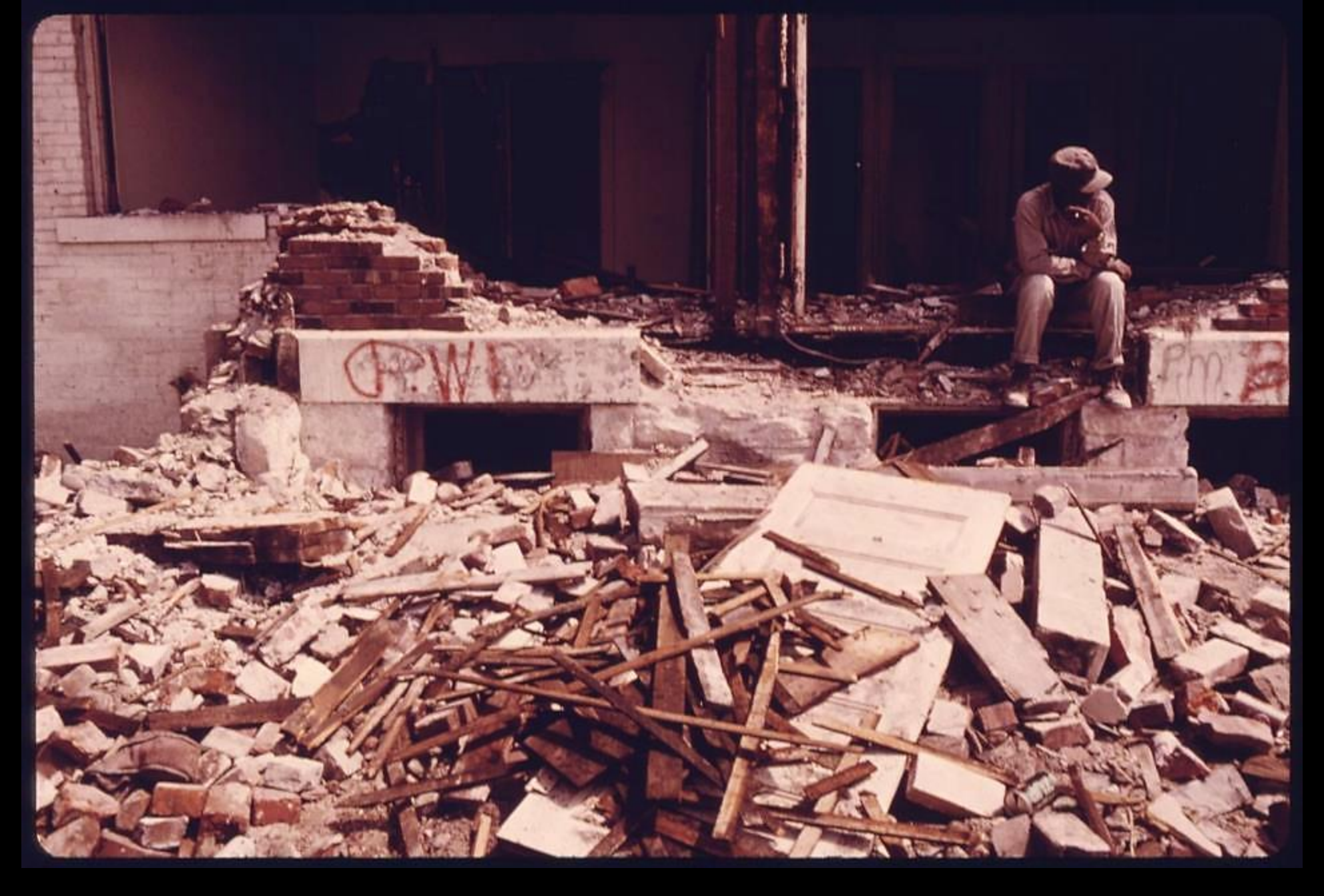
Demolition of Housing in Low Income Neighborhood -- Kenneth Palk, Kansas City, KS