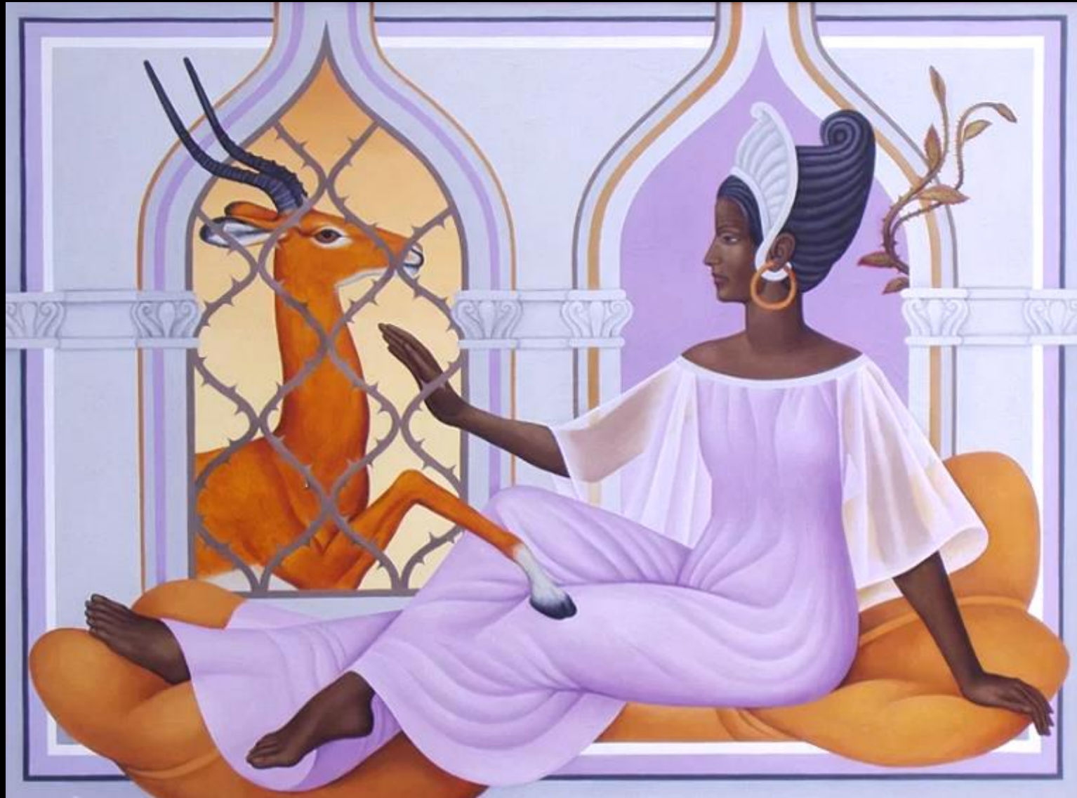
Lattice Window -- Peter Koenig