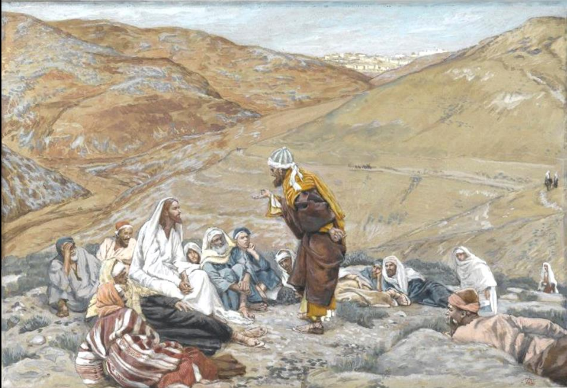
A Scribe Speaks to Jesus -- James Tissot, Brooklyn Museum, Brooklyn, NY