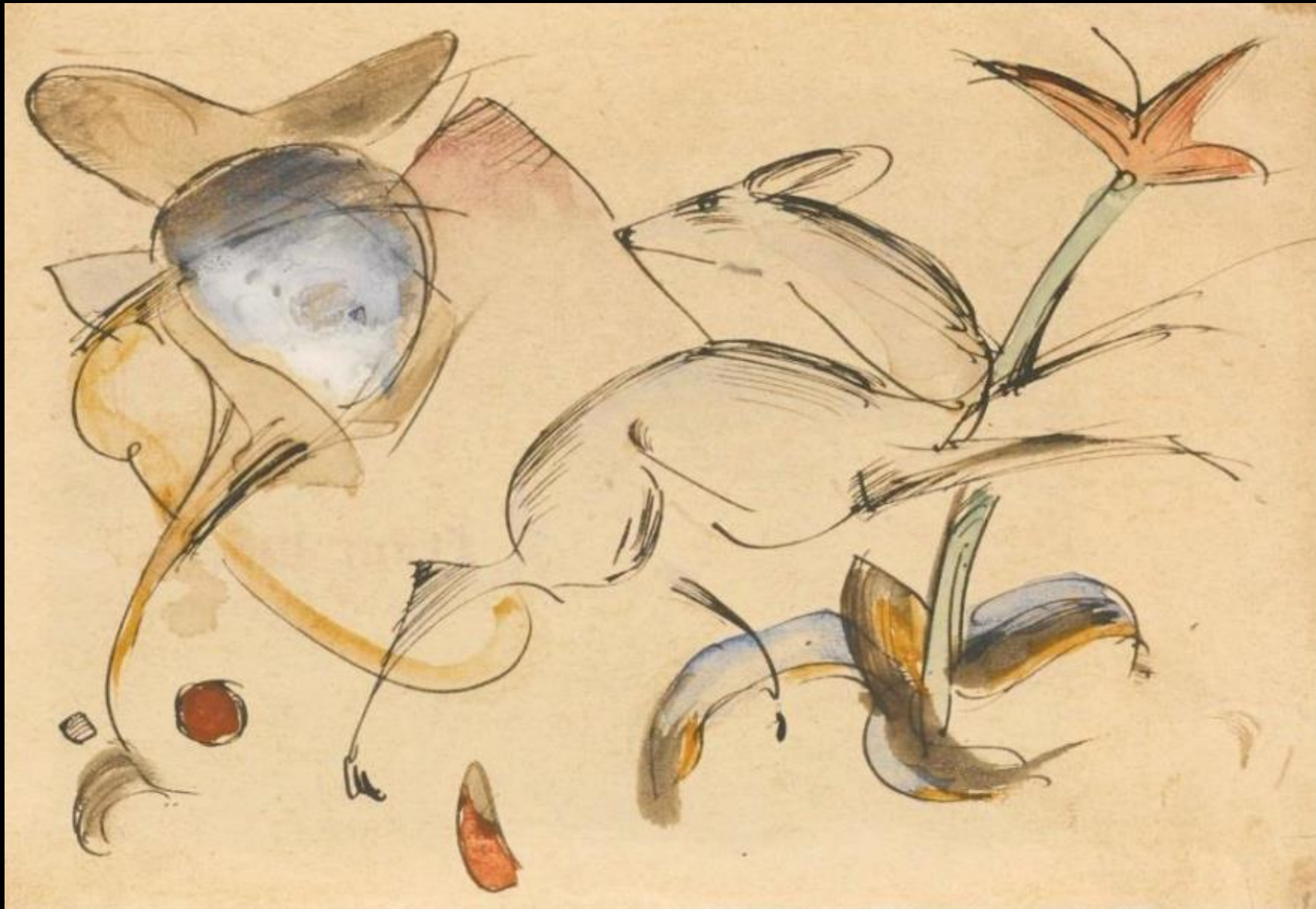
Deer Leaping Among Flowers – Franz Marc, 1912