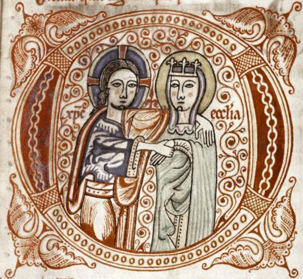
Christ and Ecclesia

Omnia precellit xpi dilectio pl Oscula qua signat que poscunt corda serena