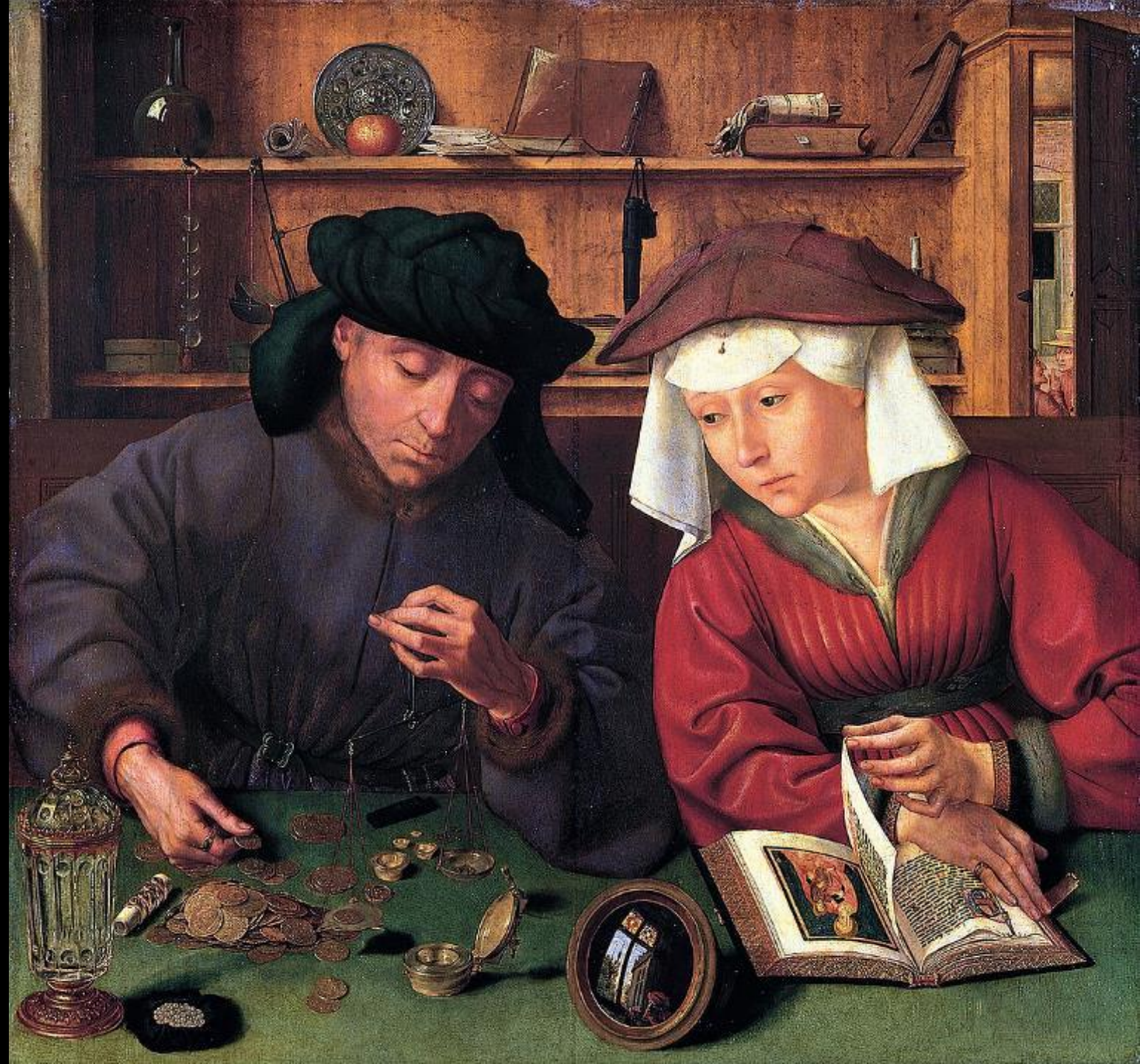
The Moneylender and his Wife

Quentin Matsys Louvre Museum Paris, France