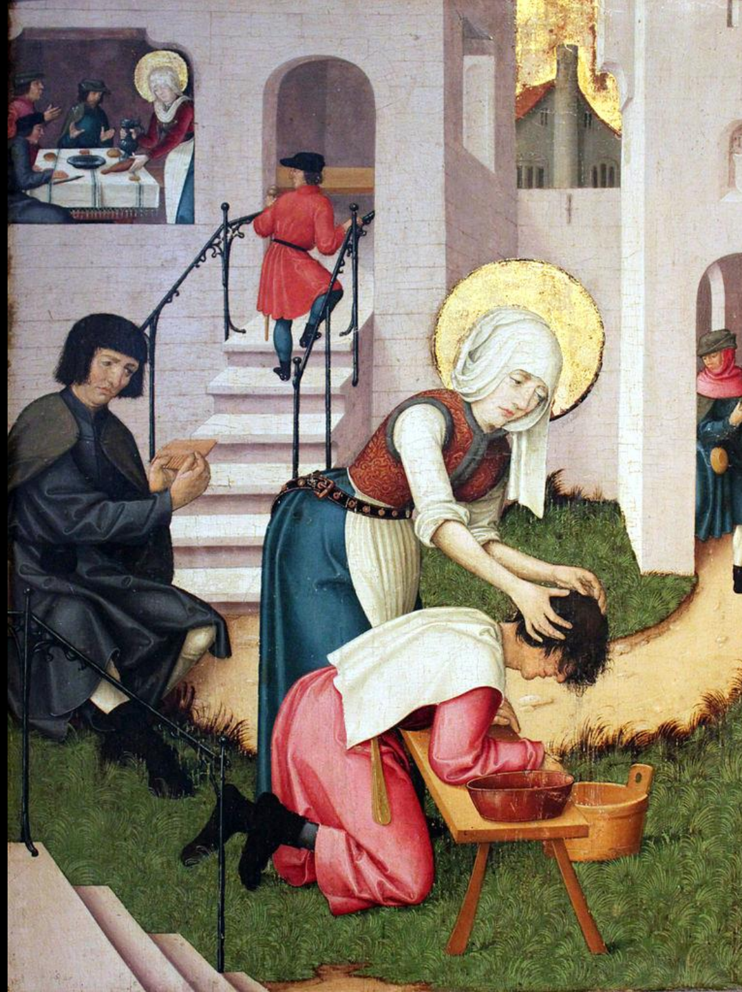
Saint Verena Washes the Hair of a Plague Patient

Landesmuseum Württemberg Württemberg, Germany