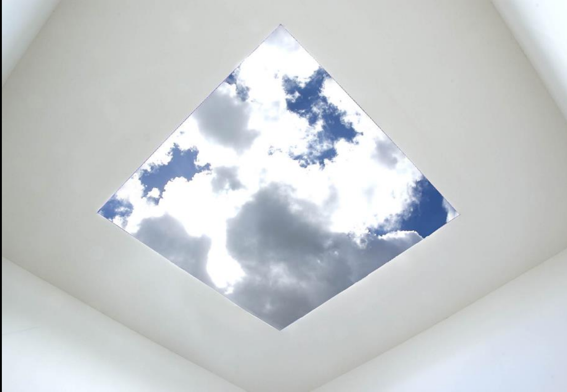
Skyspace -- James Turrell, Live Oak Meeting House, Houston, TX