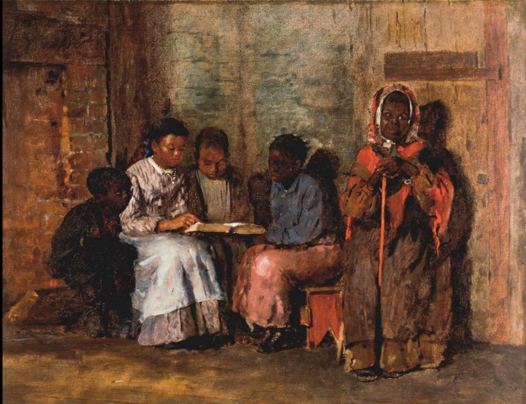
Sunday Morning -- Winslow Homer, Cincinnati Art Museum, Cincinnati, OH