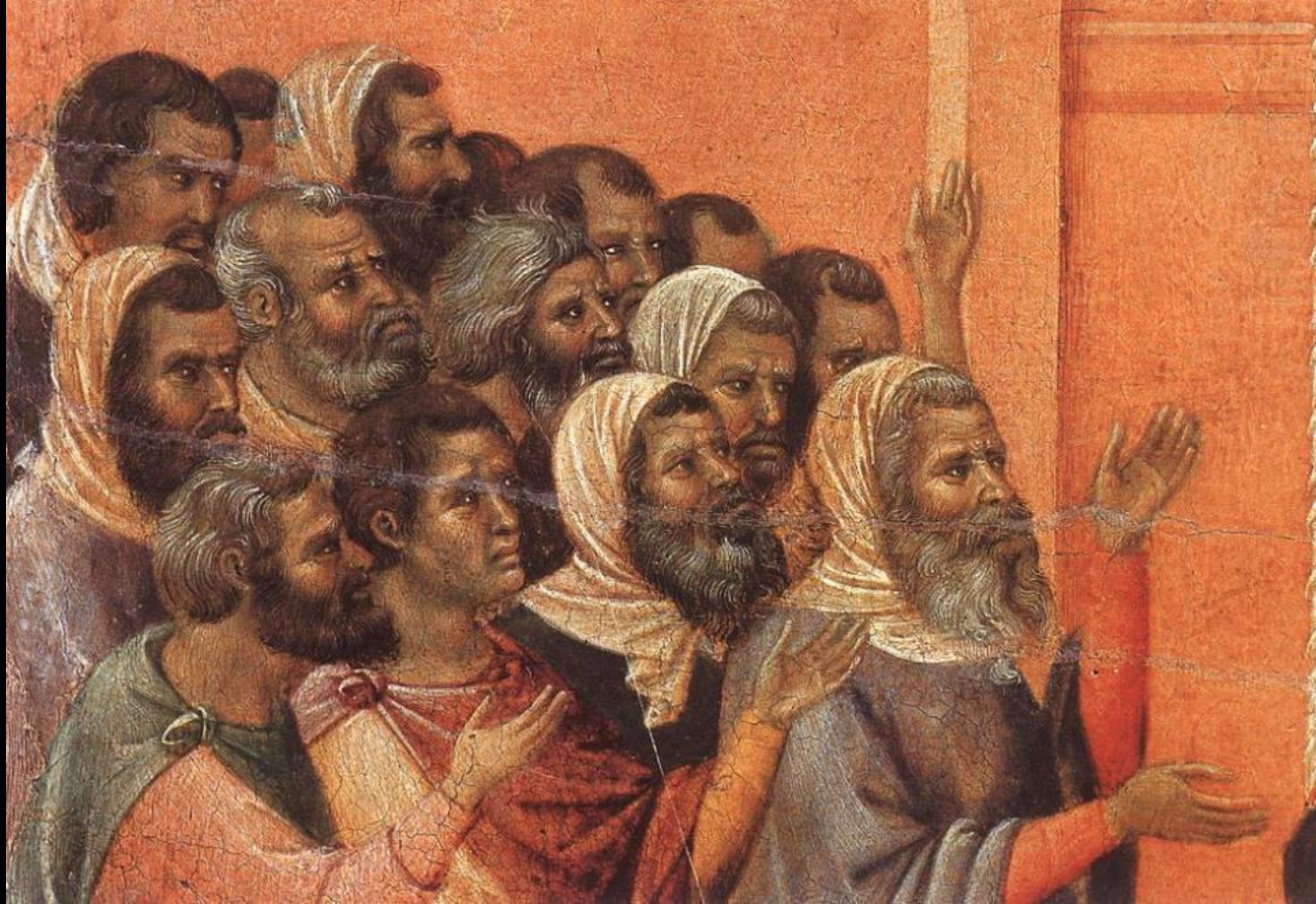
Christ Accused by the Pharisees -- Duccio, Museo dell'Opera del Duomo, Siena, Italy