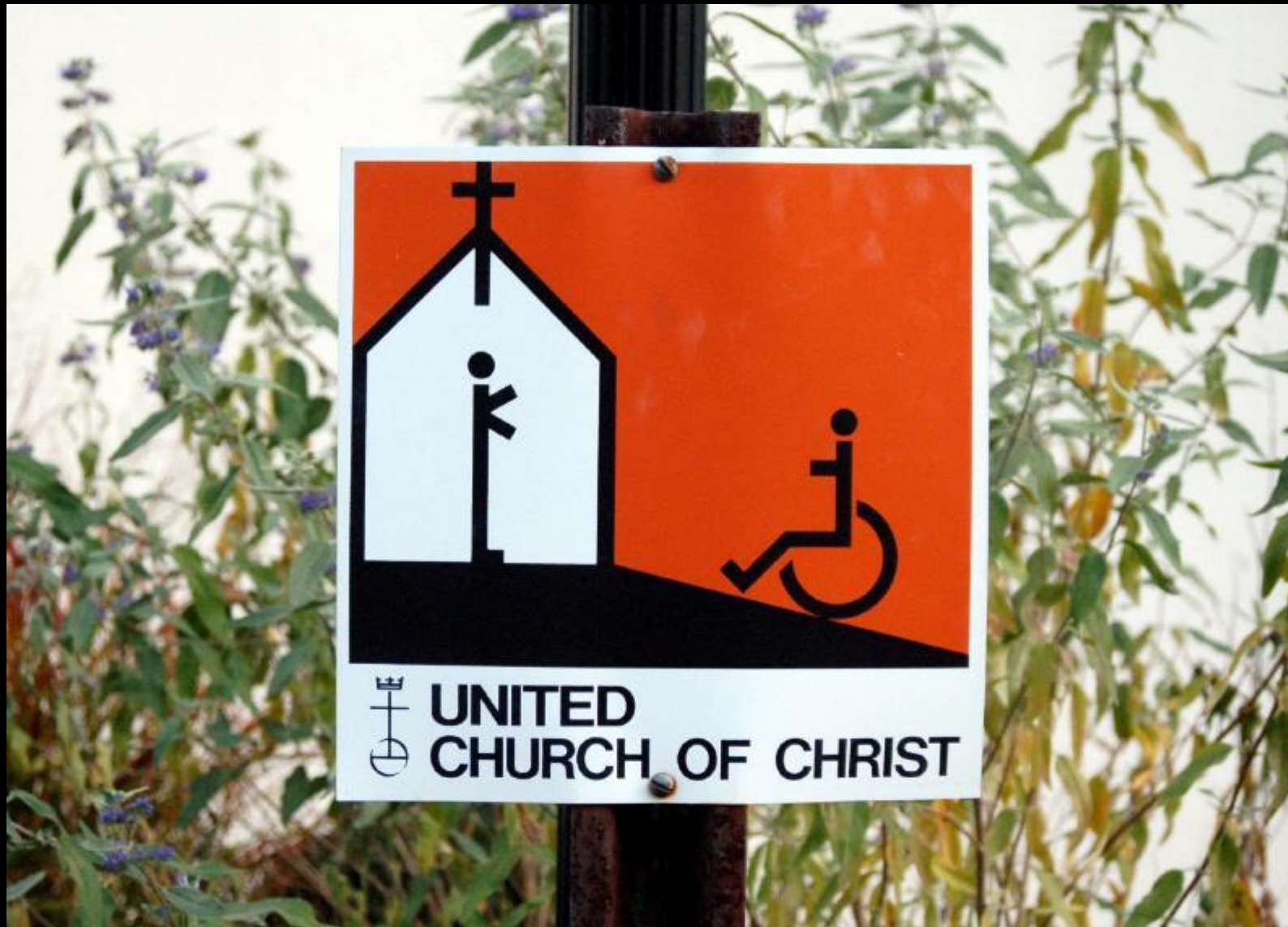
Welcome -- United Church of Christ