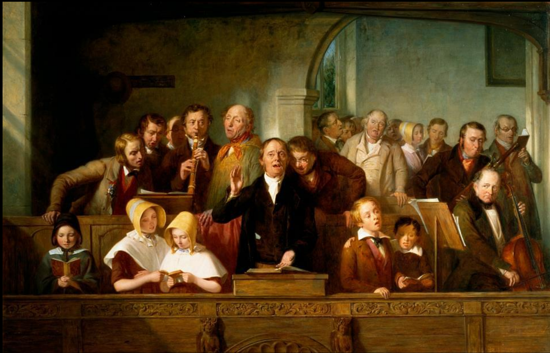
Village Choir -- Thomas Webster, Victoria and Albert Museum, London, England