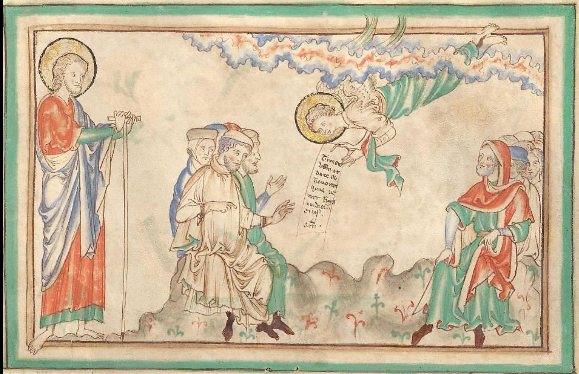
Angel with the Eternal Gospel -- 13 th c. Manuscript, Getty Center, Los Angeles, CA