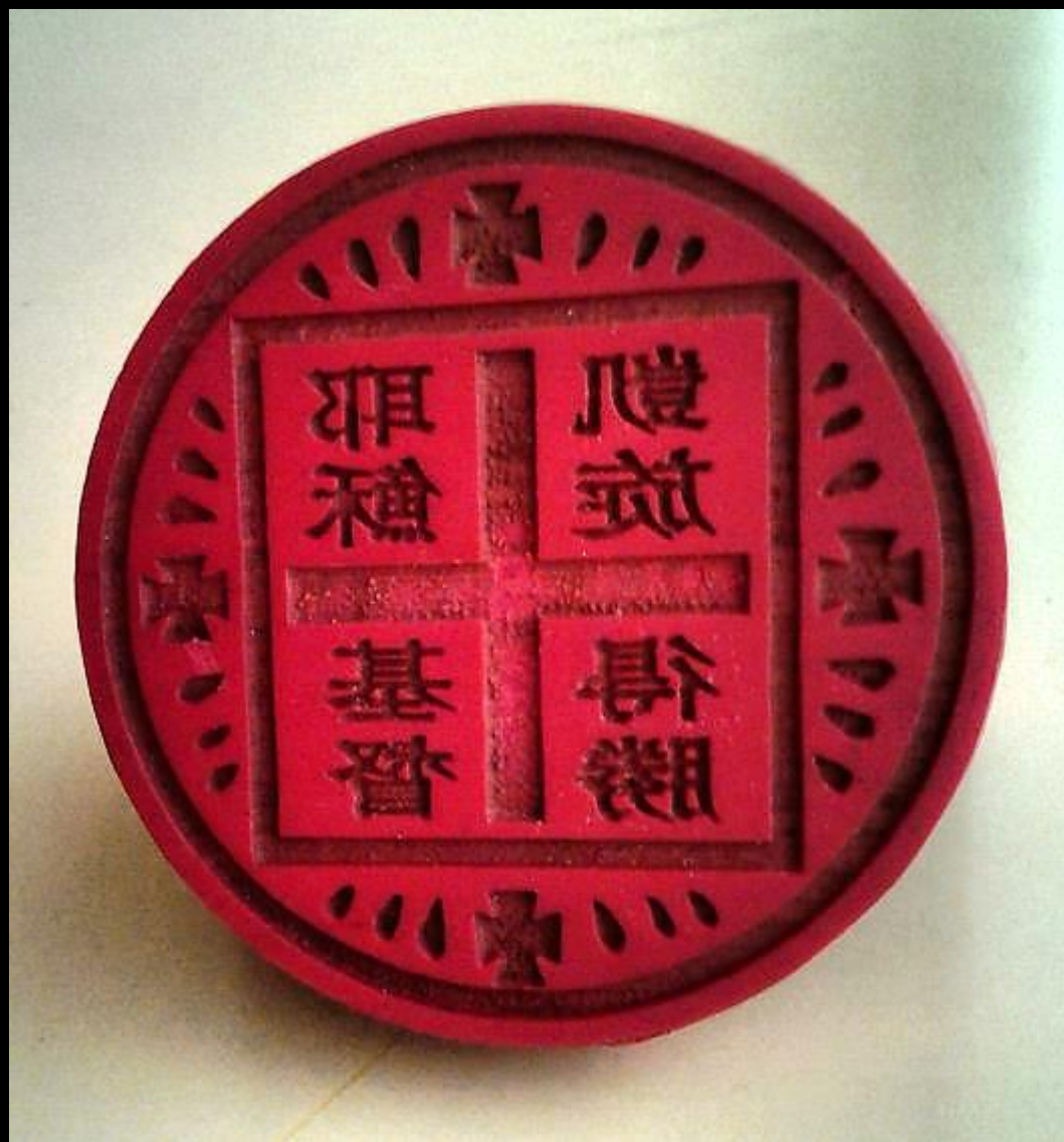
Chinese Orthodox Communion Bread Stamp -- Church of Apostles, Hong Kong China