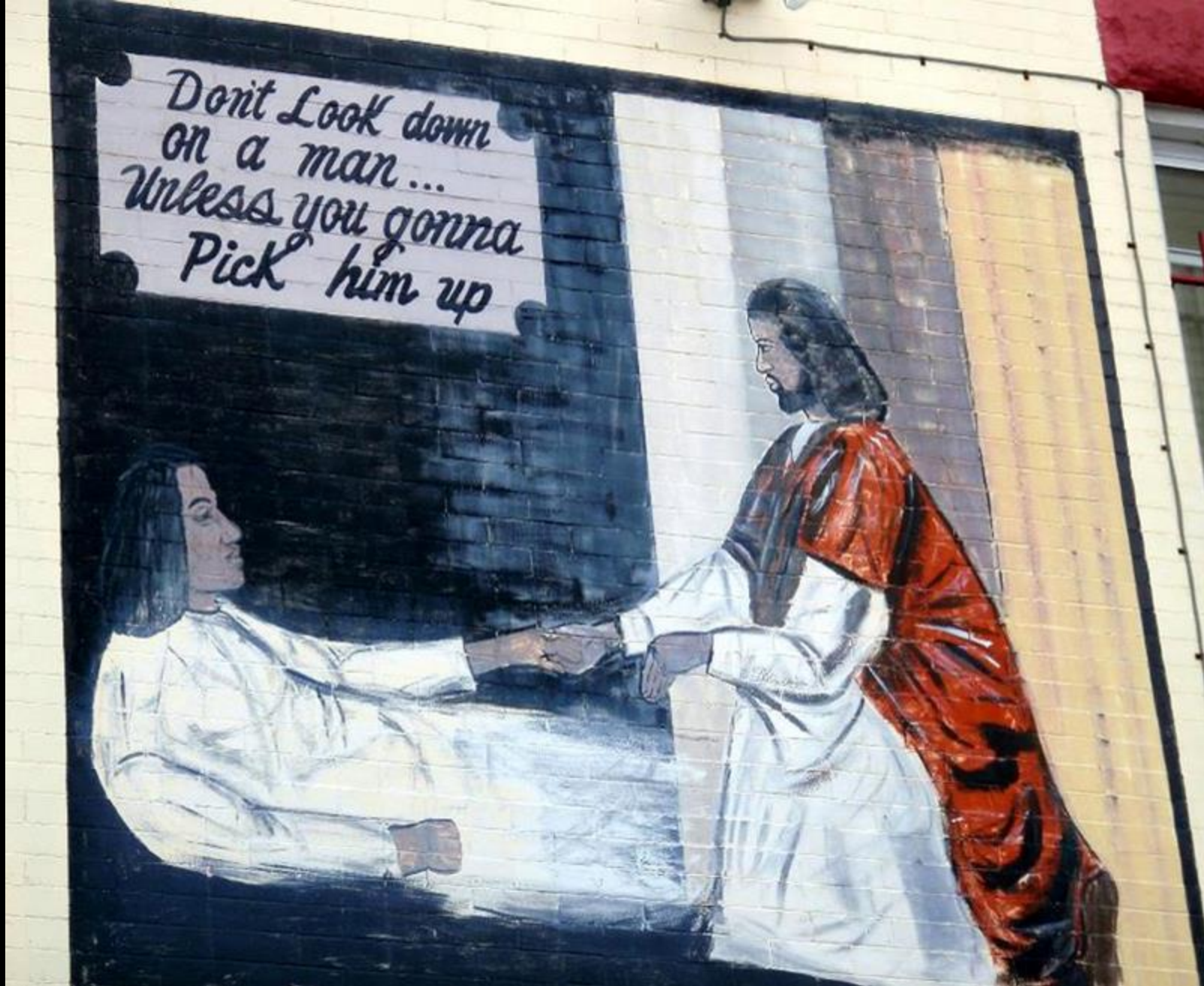
"Don't Look Down on a Man...Unless You Gonna Pick Him Up -- Mural, Washington, DC