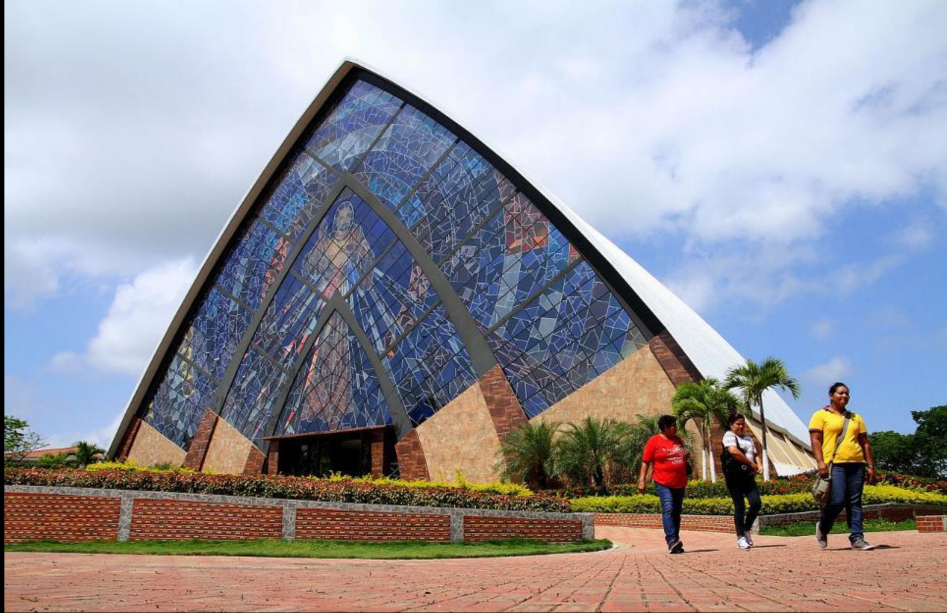
Sanctuary of the Divine Works of Mercy -- Guayaquil, Ecuador