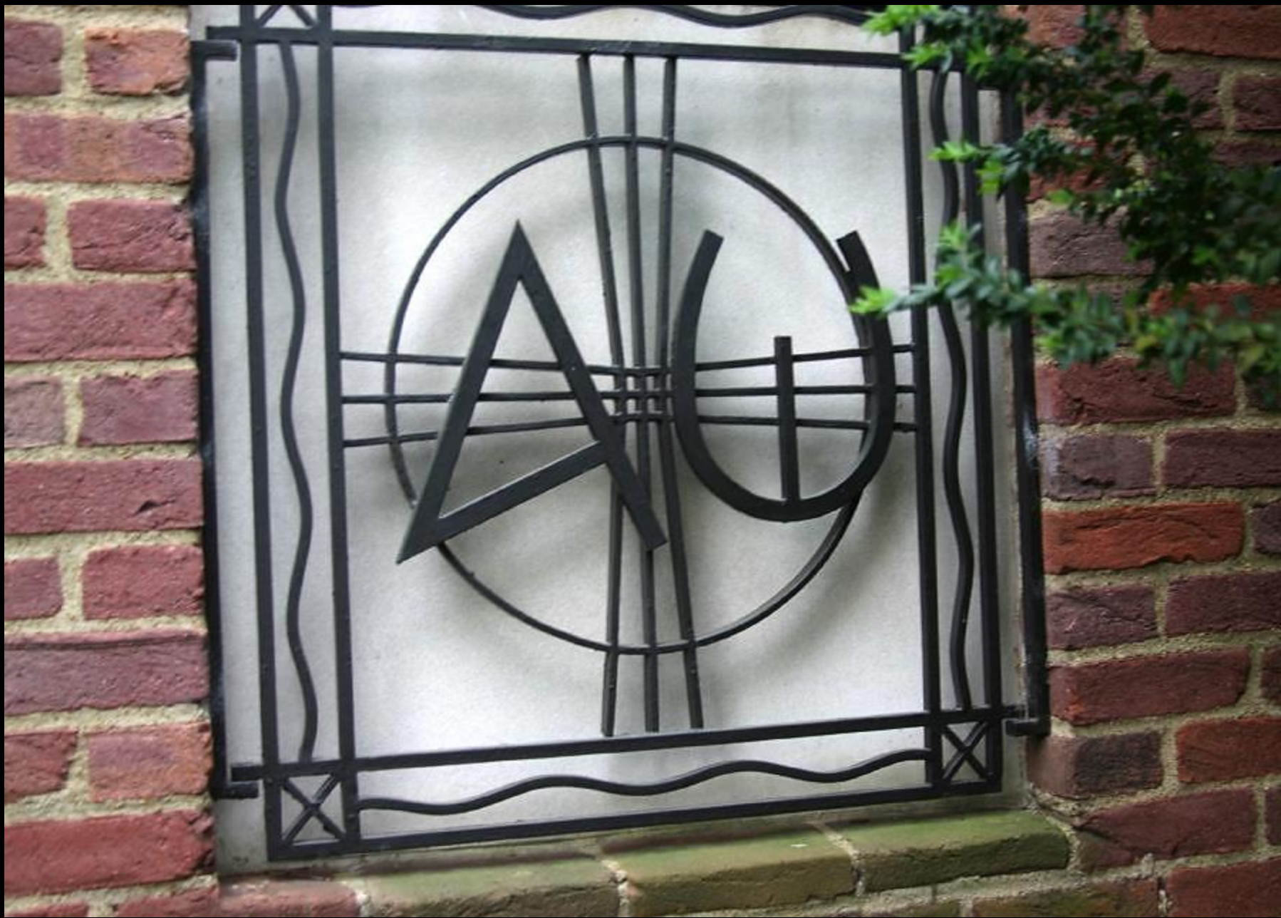
Alpha and Omega -- Metalwork, Benton Chapel, Vanderbilt University, Nashville, TN