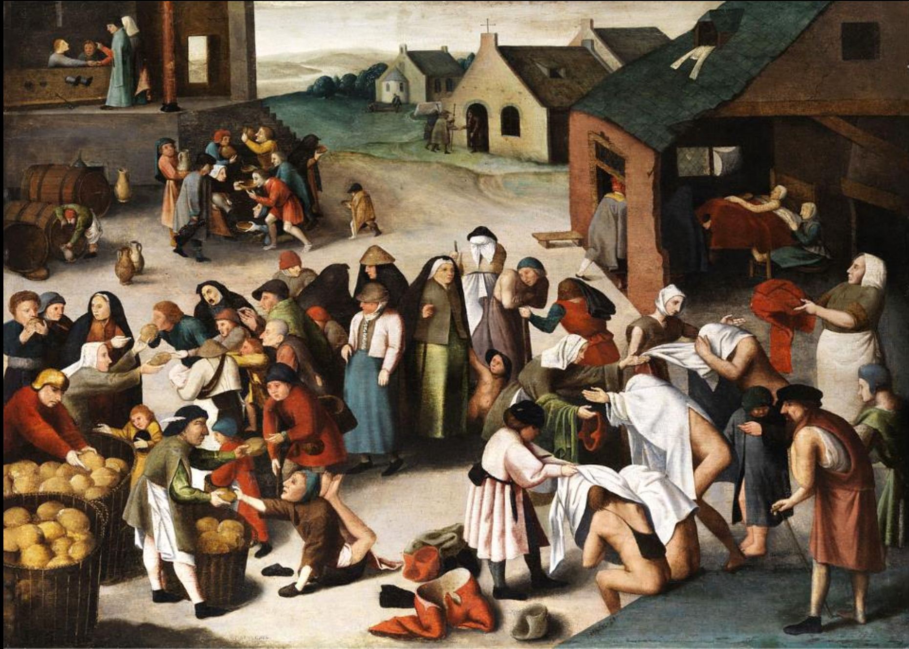
Works of Mercy -- Pieter Brueghel