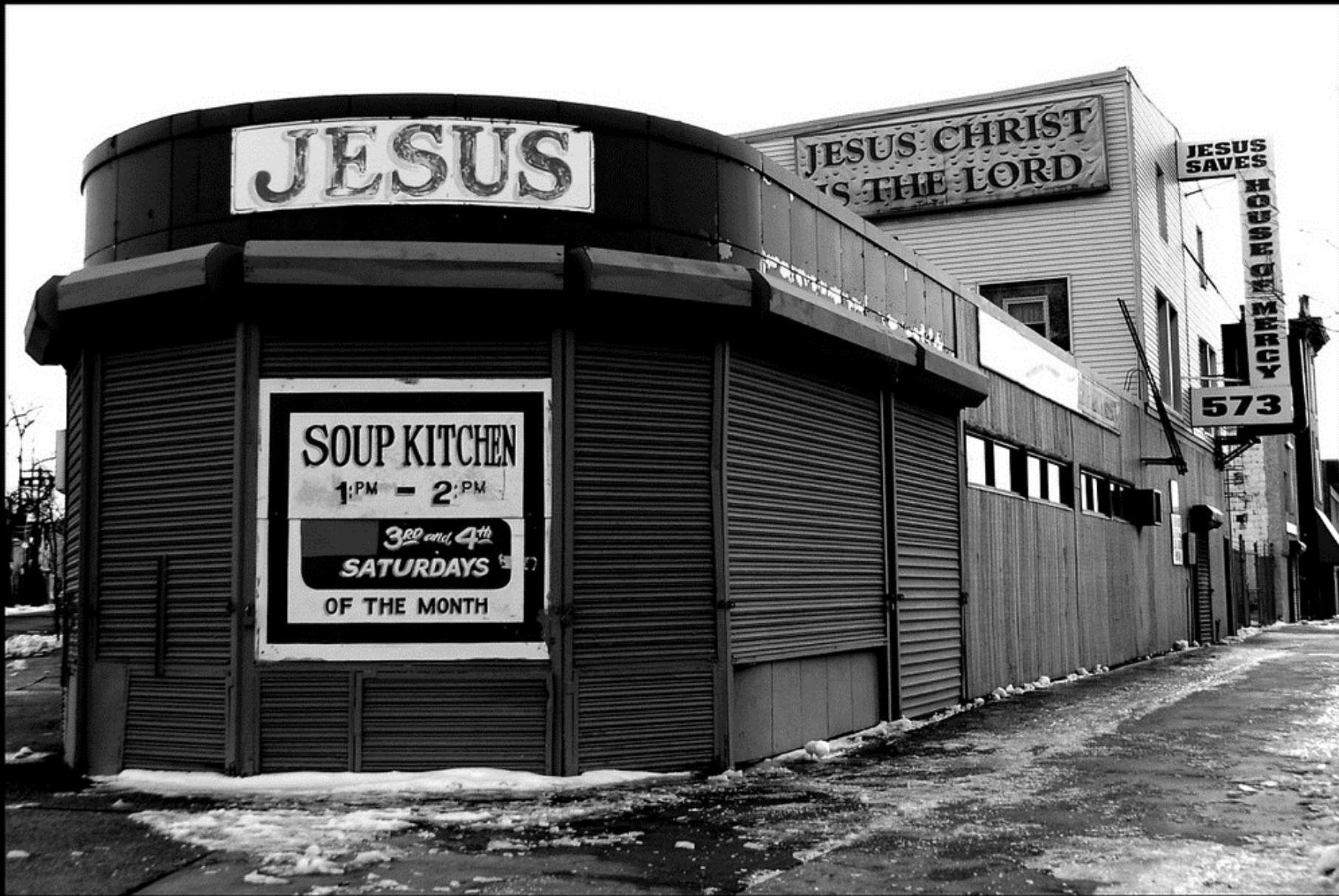
Soup Kitchen at the House of Mercy Church, Winter 2009