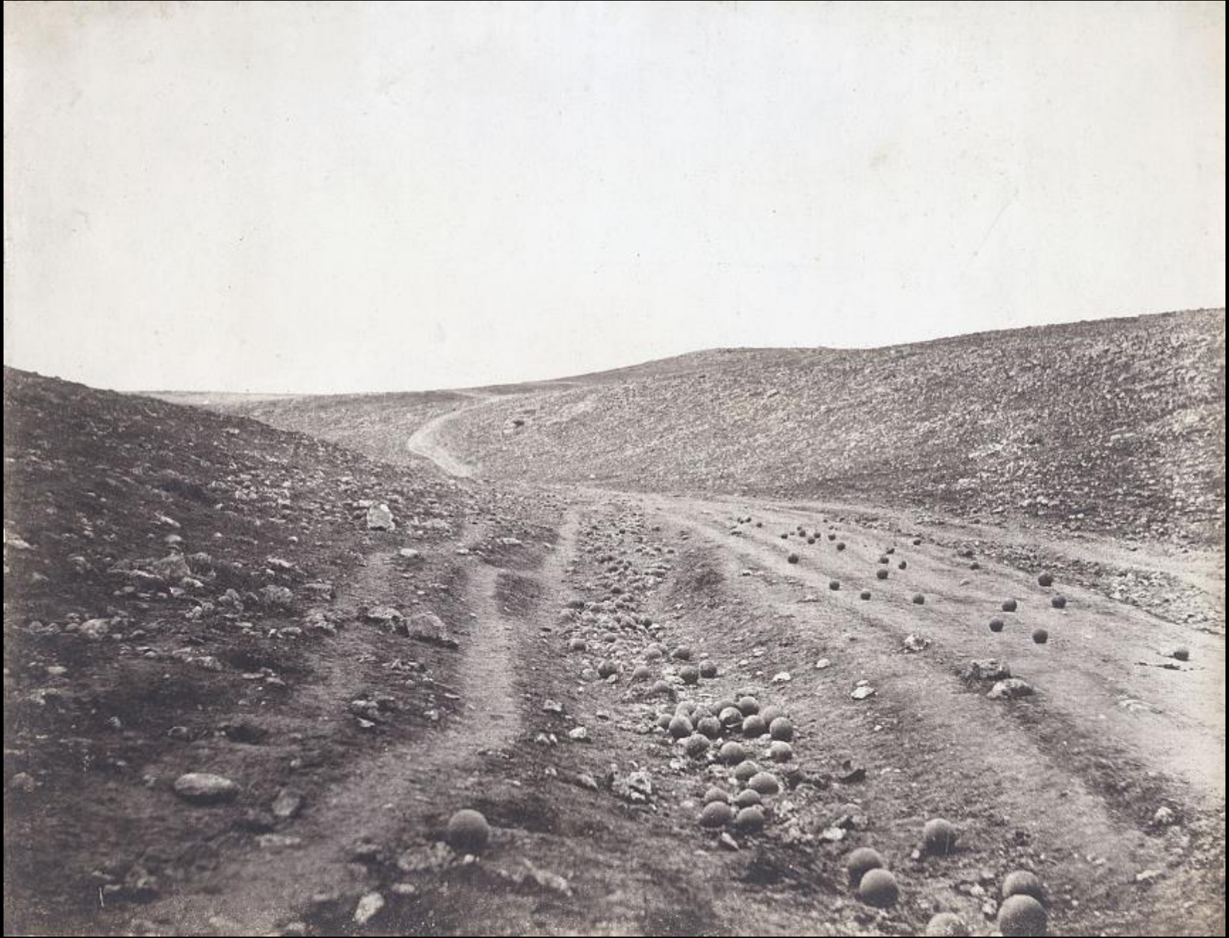
Valley of the Shadow of Death, Crimean War -- Roger Fenton, V&A Museum, London