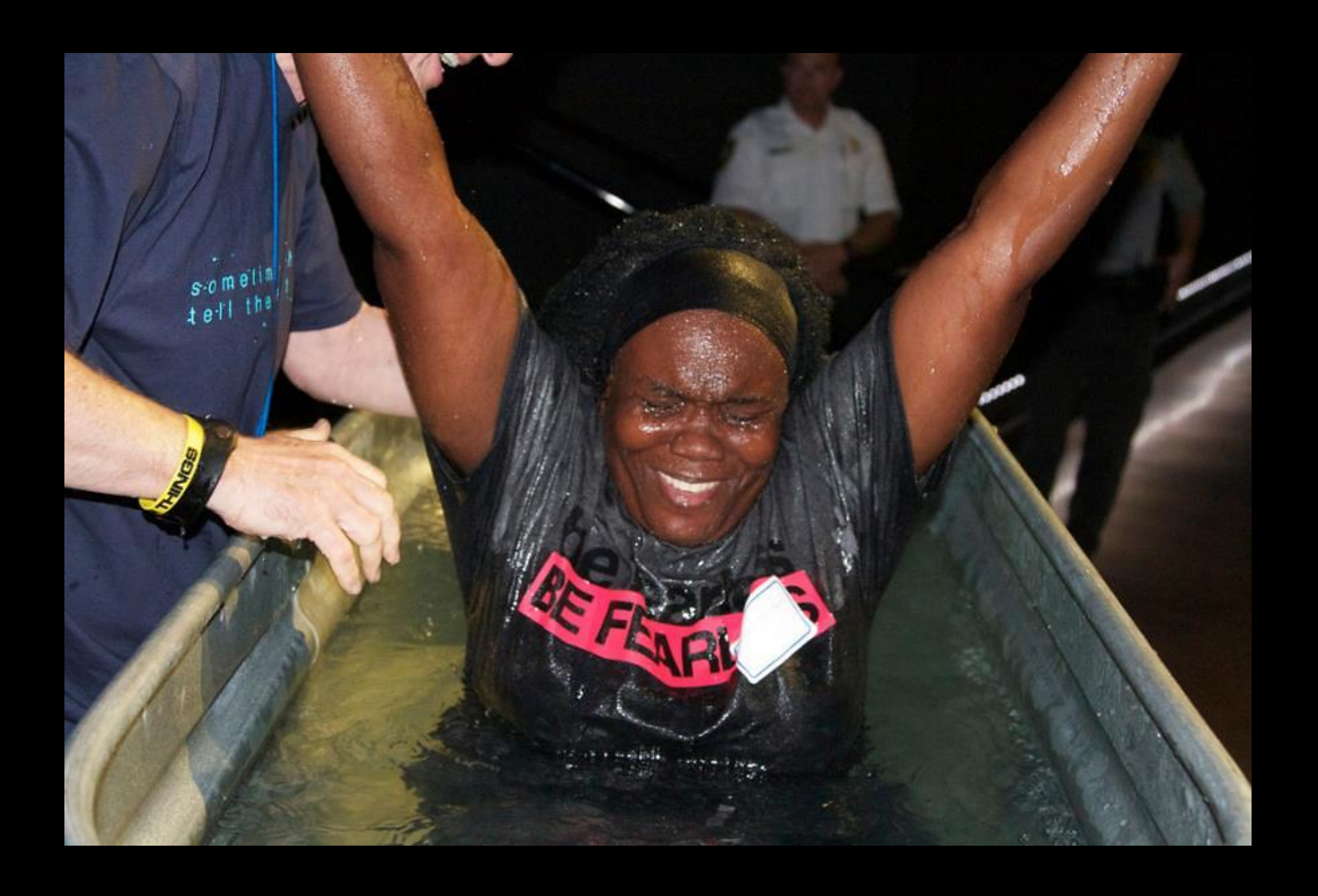
"She was Fearless and Joyful!" -- Church by the Glades, Coral Springs, FL