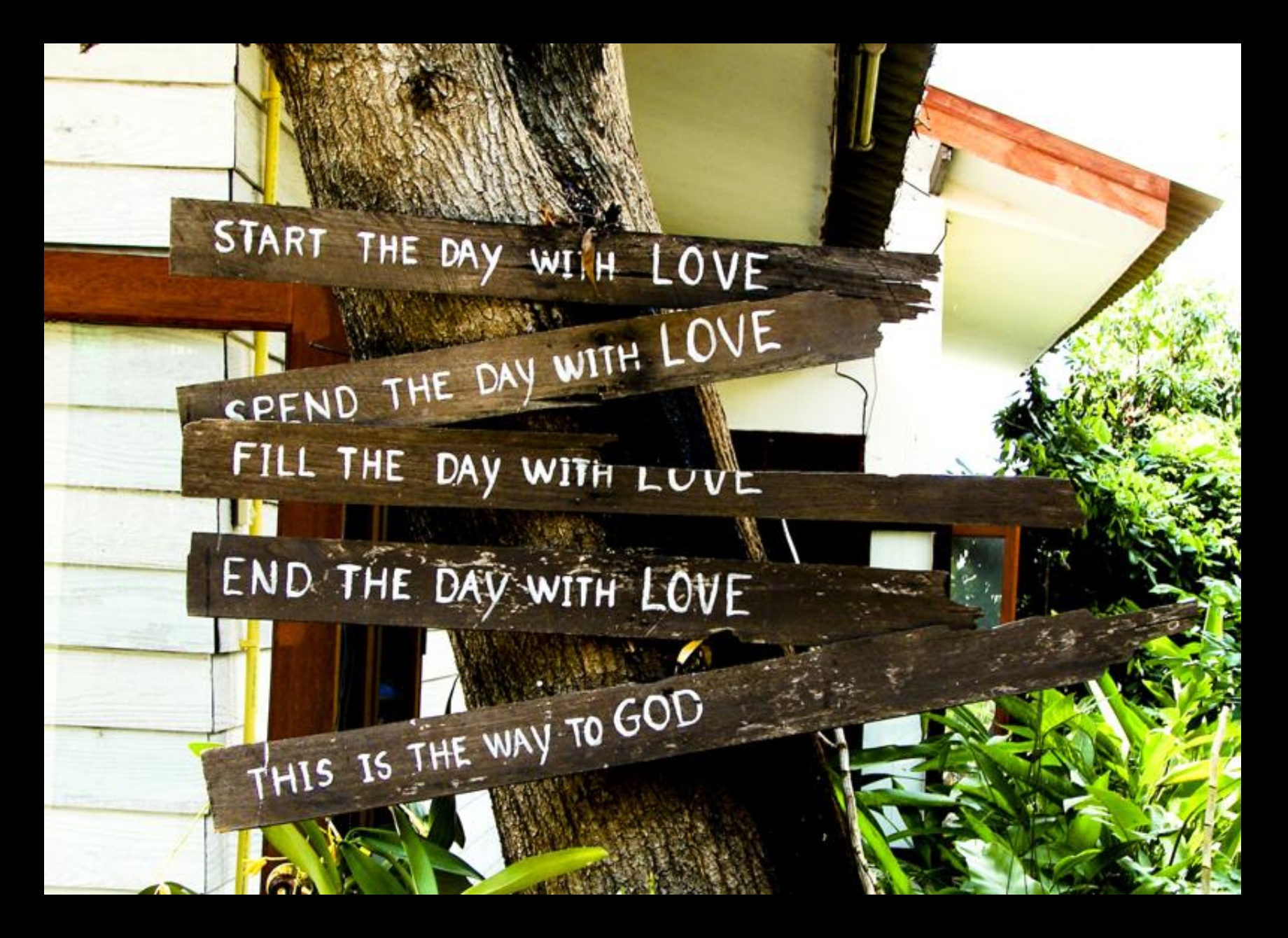
This is the Way to God -- Doi Inthanon National Park, Thailand