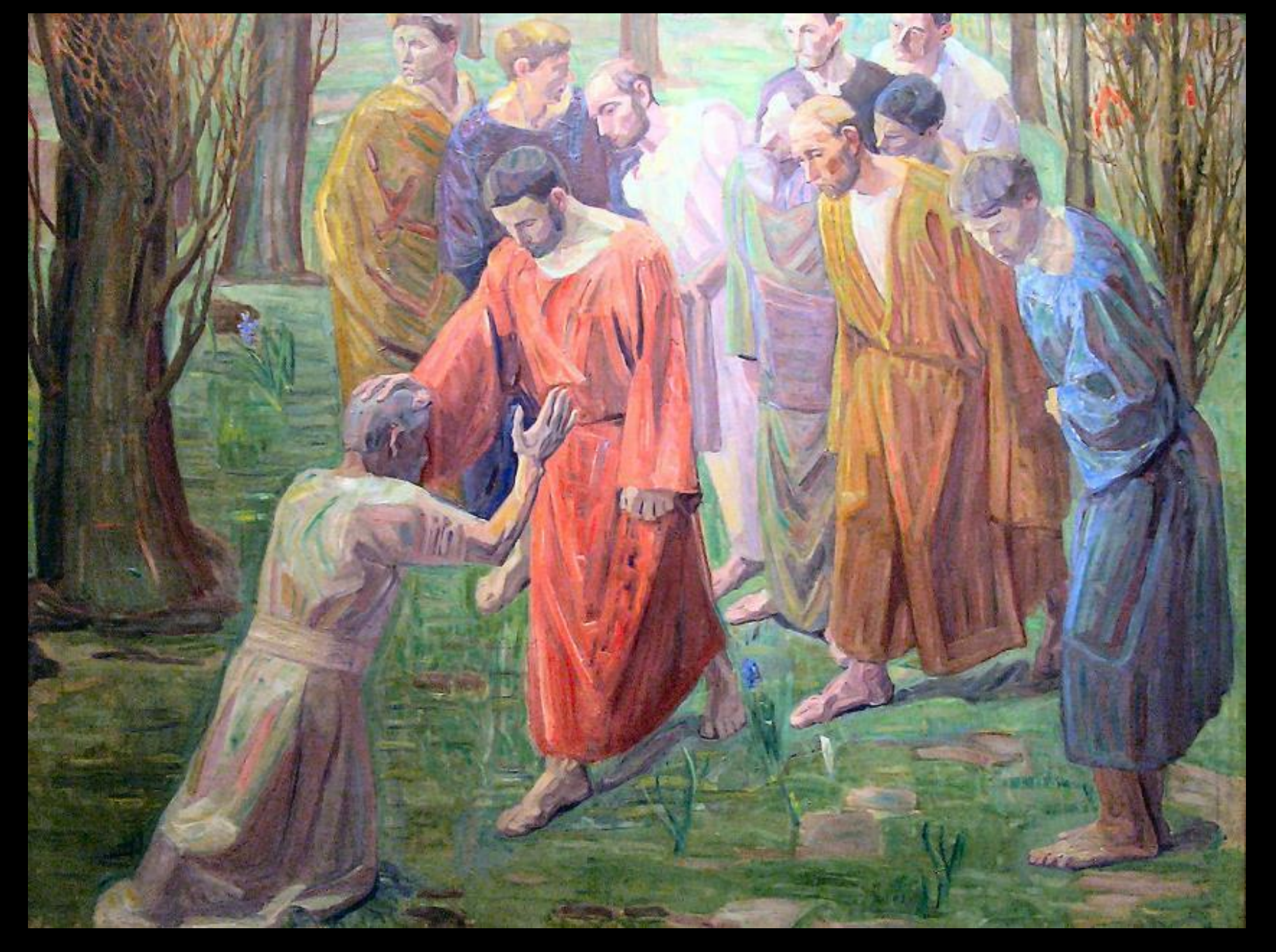
Healing of a Leper -- Niels Larsen Stevns, 1913