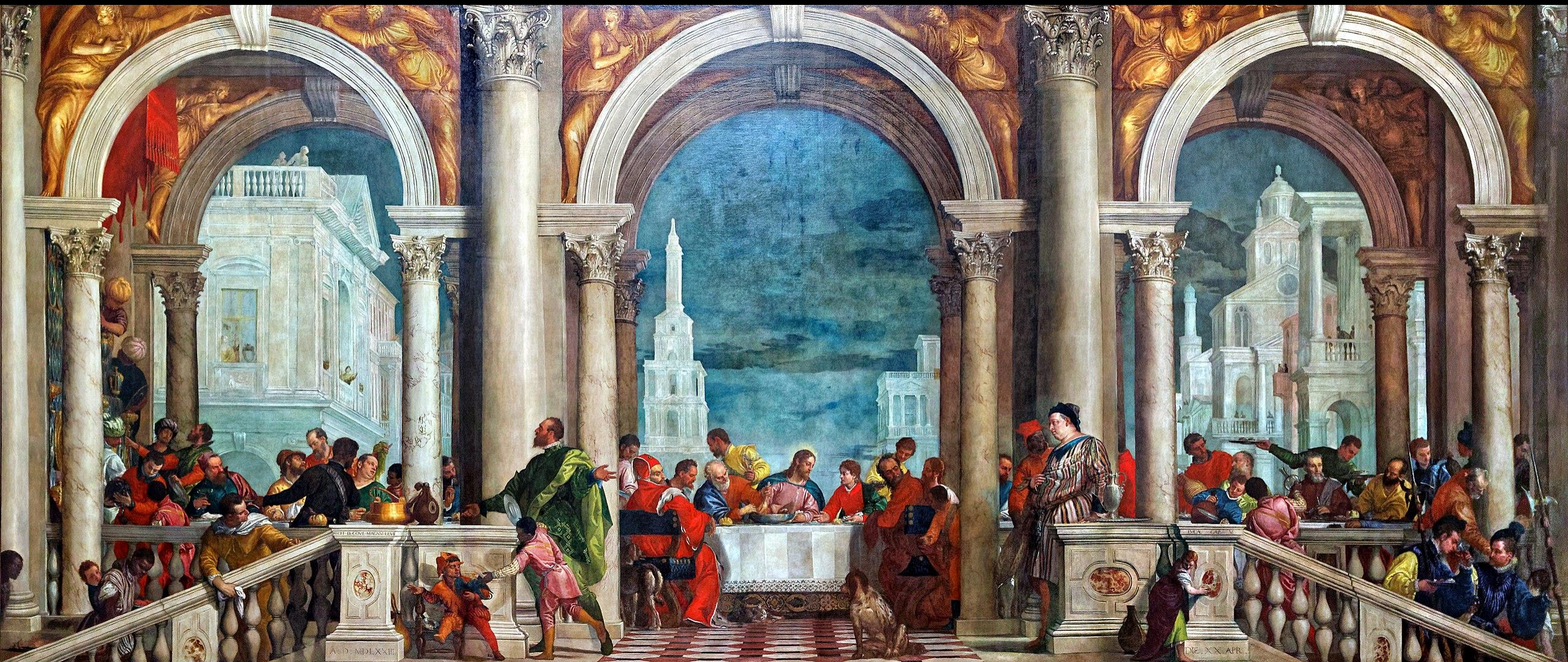
Feast in the House of Levi, Paolo Cagliari Veronese, 1573