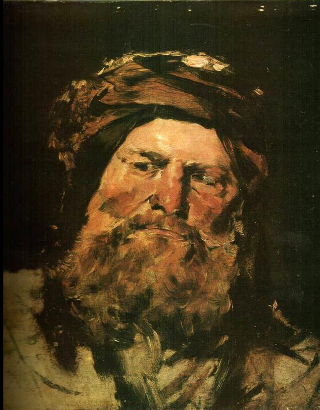
Head of a Pharisee Mihály Munkácsy, 1881