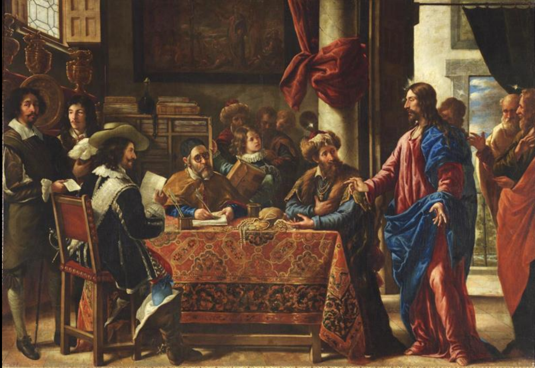
Vocation of Saint Matthew, Juan de Pareja, 1661