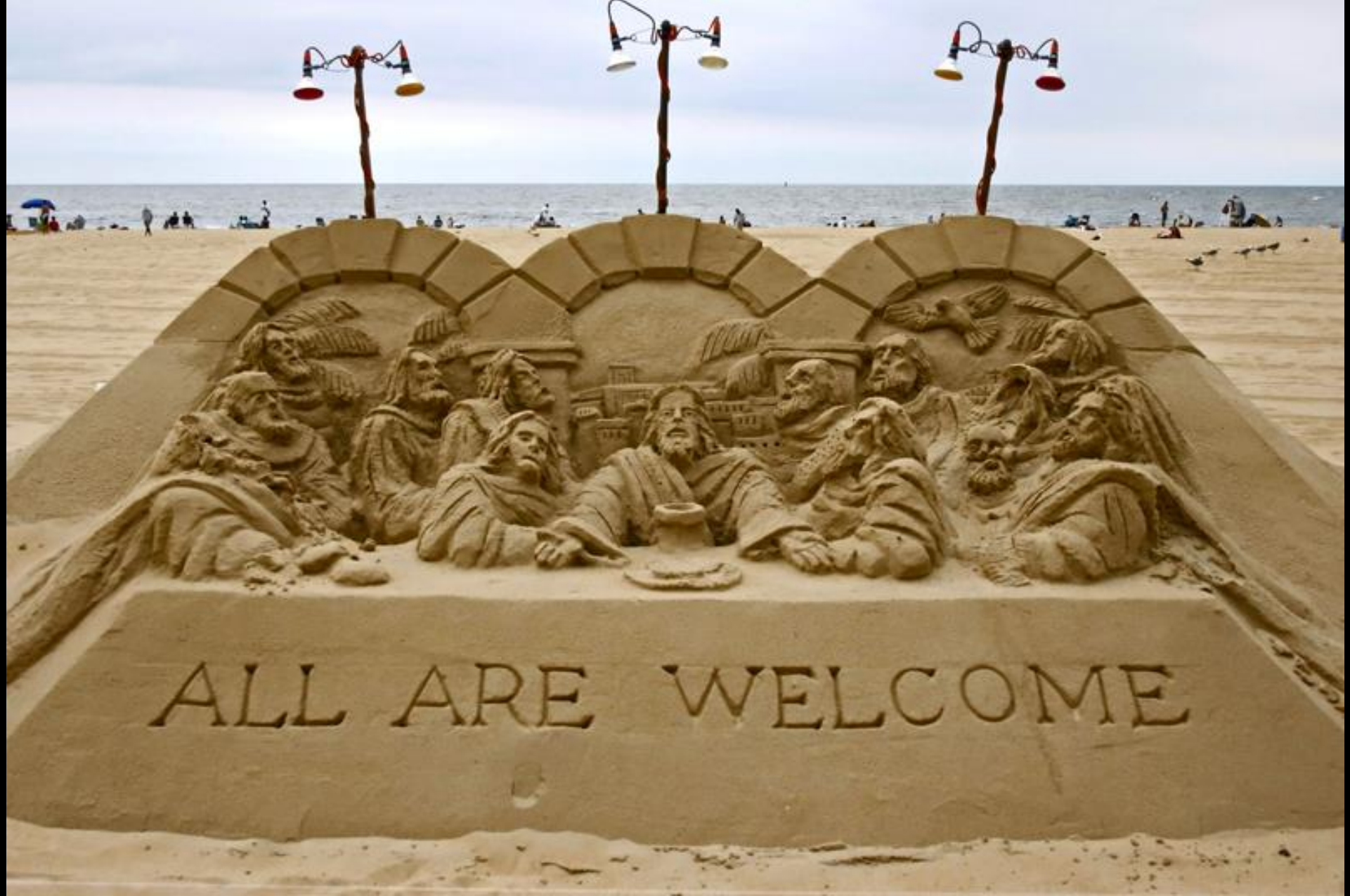
All Are Welcome in the Kingdom of God, Ocean City, Maryland, 2007