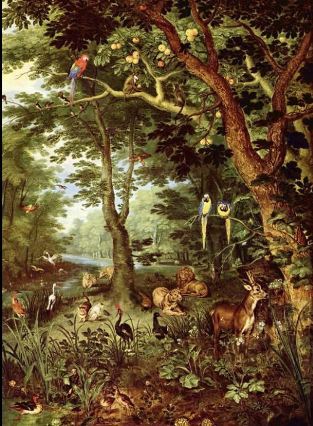
Paradise Jan Brueghel Gemaldegalerie Berlin, Germany