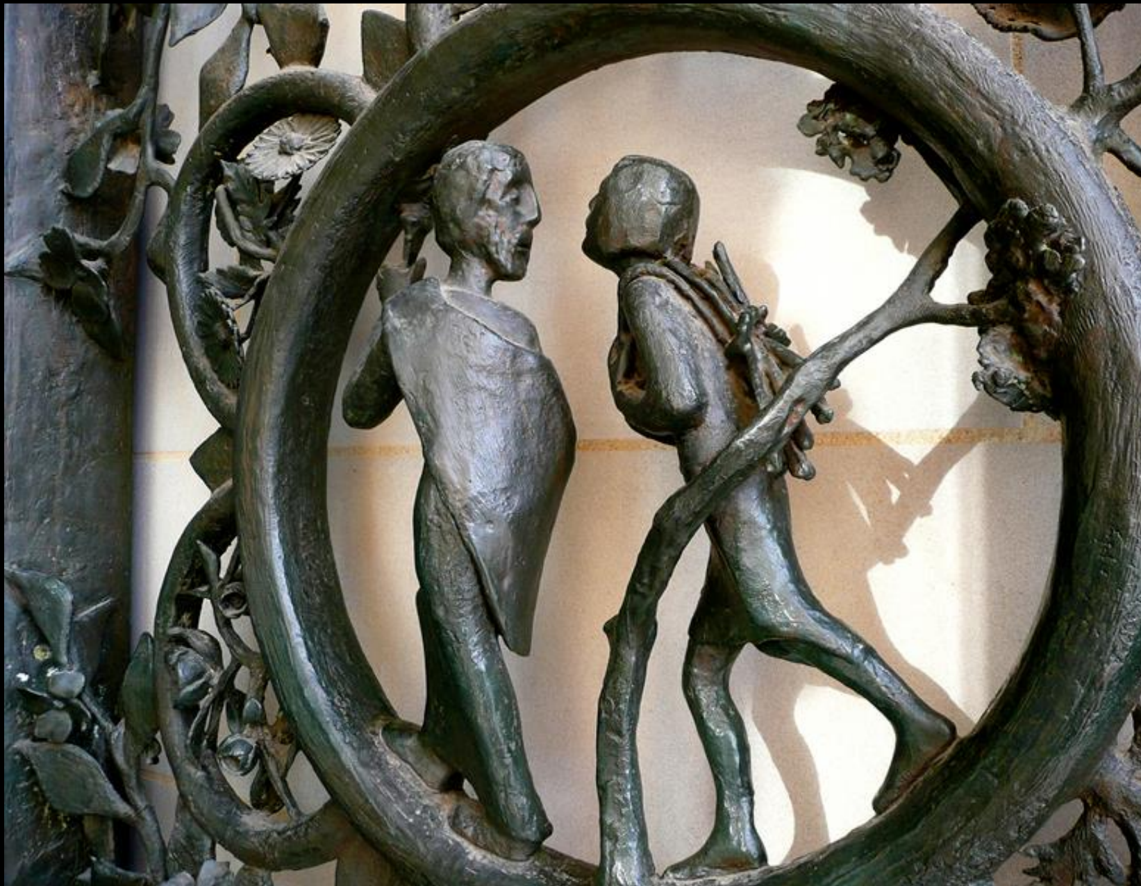
Sacrifice of Isaac -- Washington Cathedral, Washington, DC