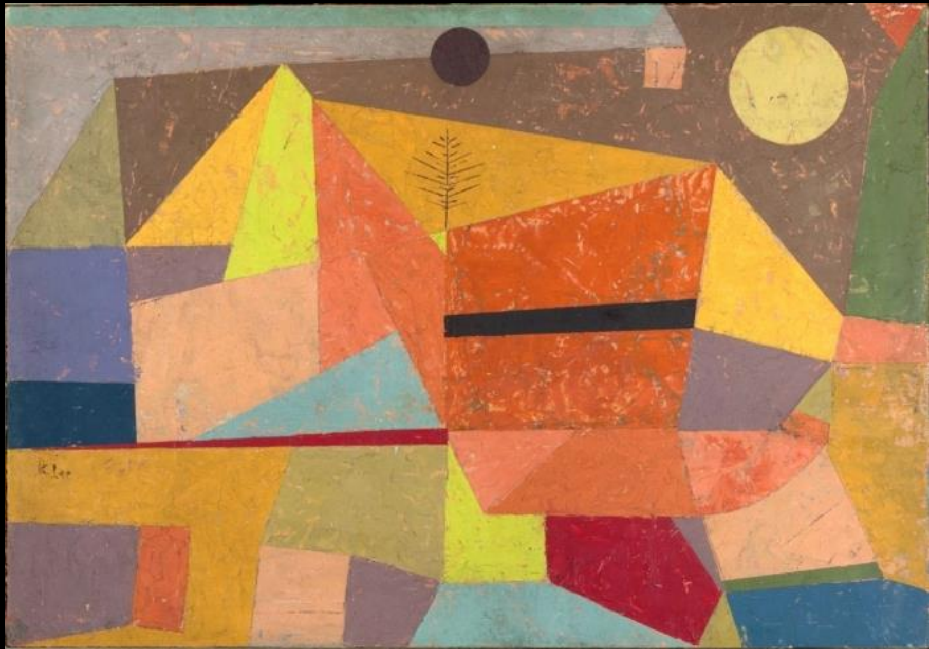
Joyful Mountain Landscape -- Paul Klee, Yale University Art Gallery, New Haven , CT