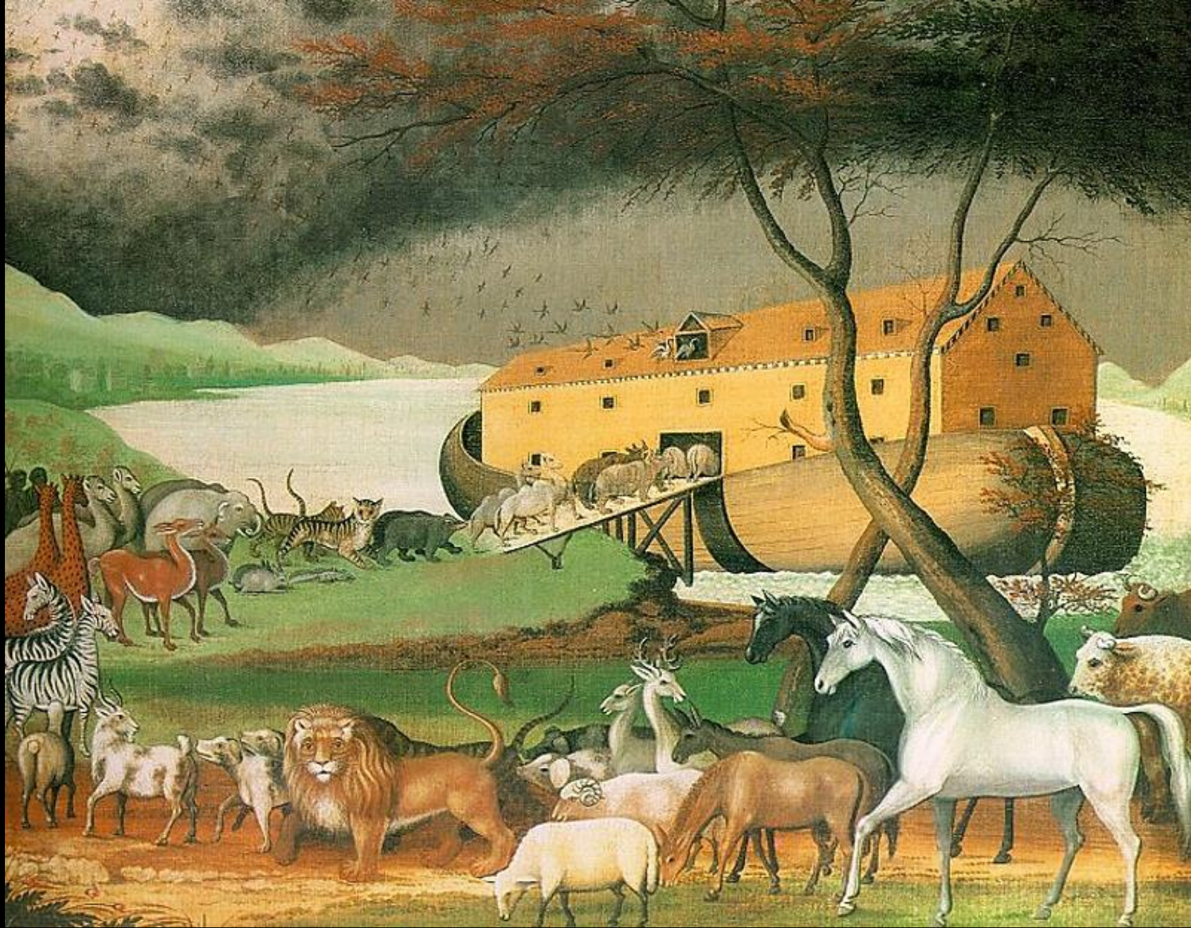
Noah's Ark -- Edward Hicks, Philadelphia Museum of Art, Philadelphia, PA