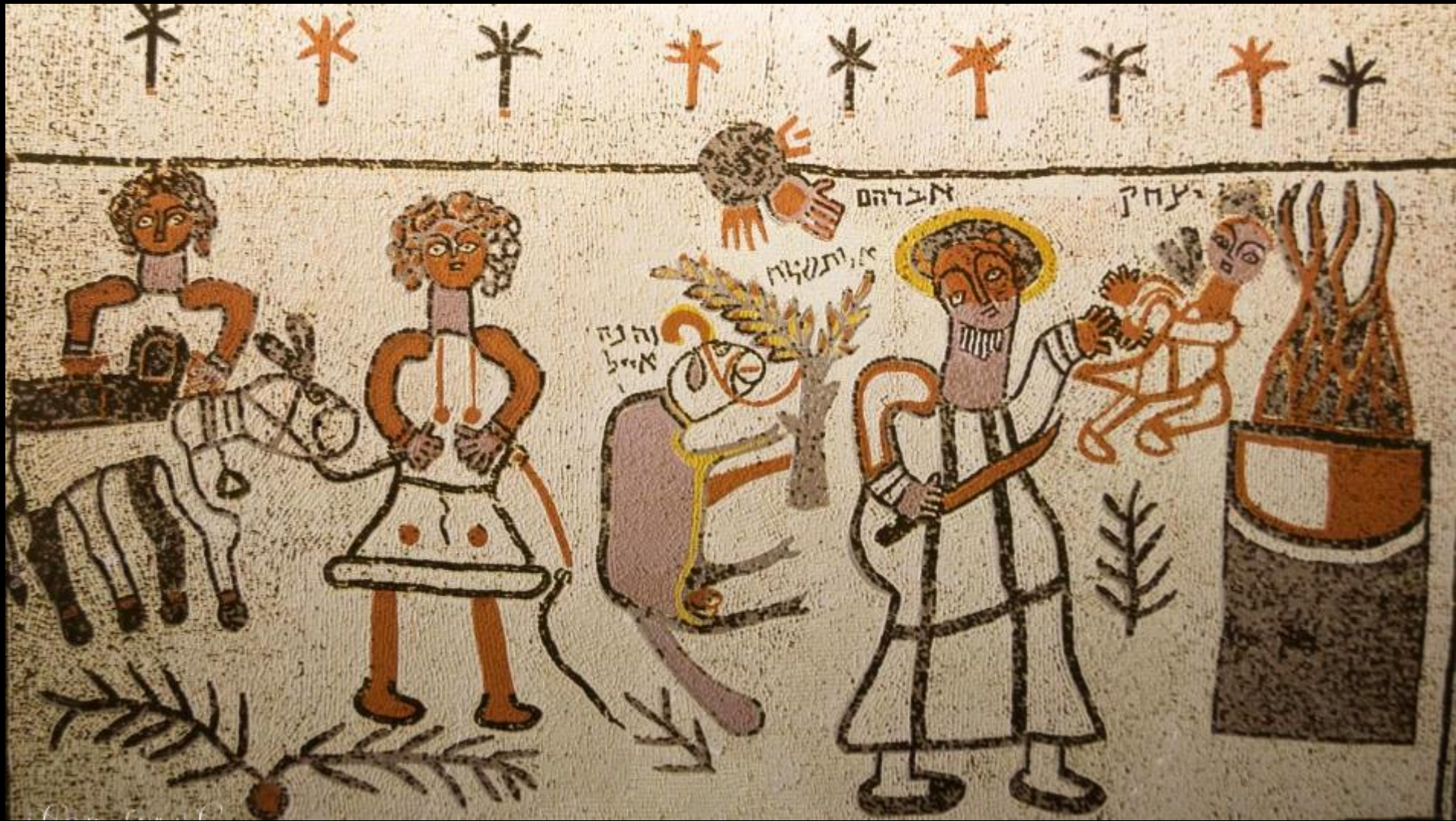
Bet Alfa Synagogue 5 th century floor mosaic -- Bet Alfa, Israel