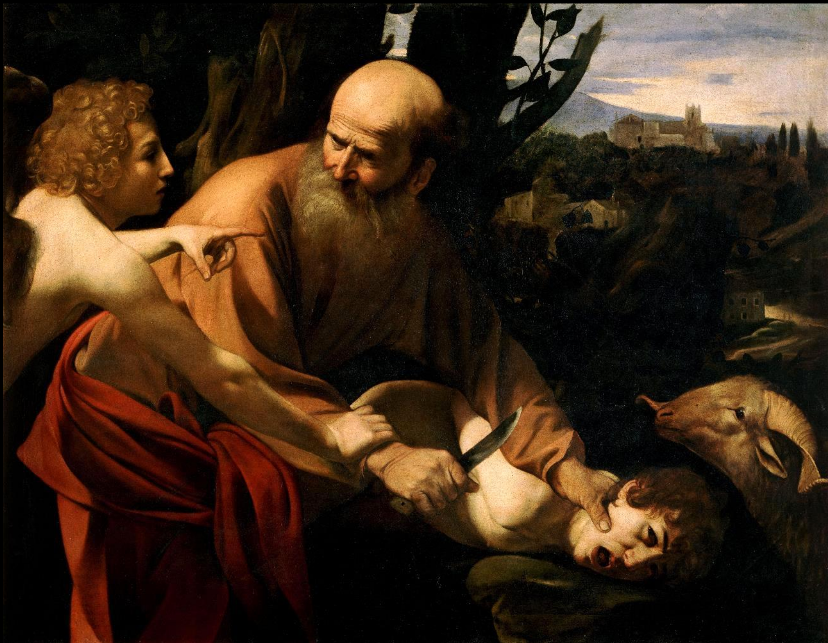
Sacrifice of Isaac – Caravaggio, Uffizi Gallery, Florence, Italy