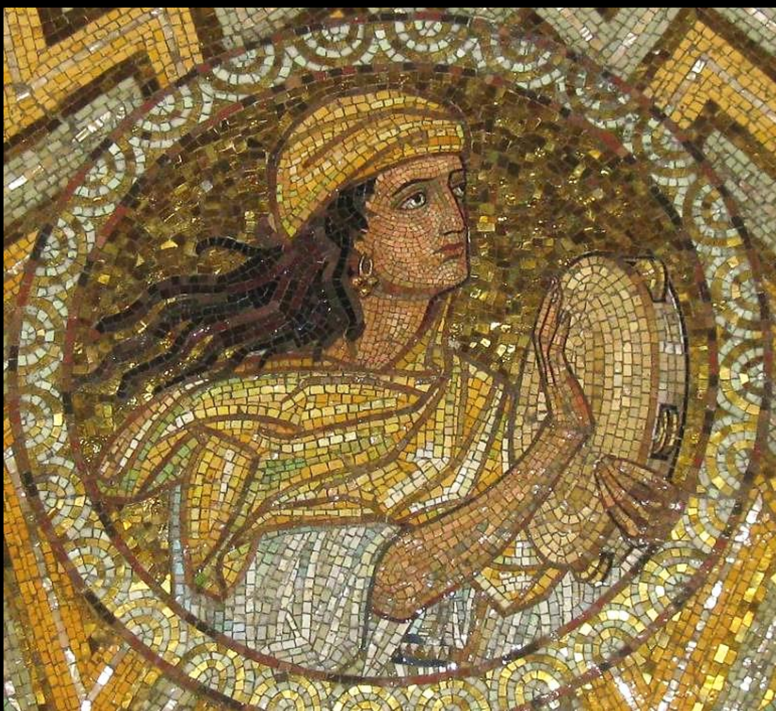
Miriam Dormition Church Mt. Zion, Jerusalem