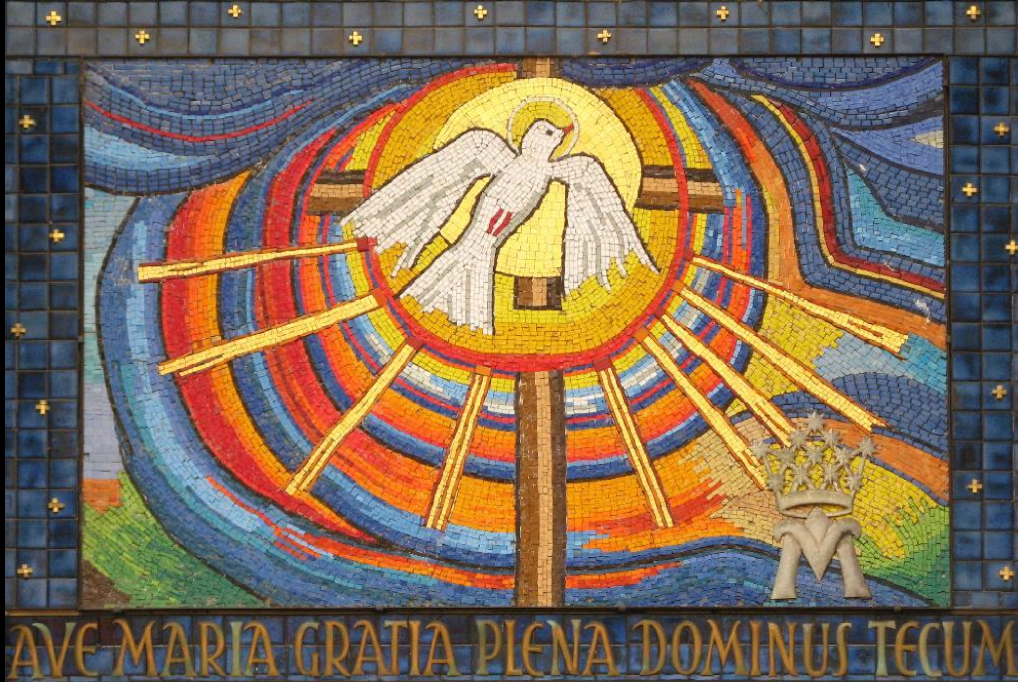
Pentecost -- Parish Church of the Mother of God, Vienna, Austria