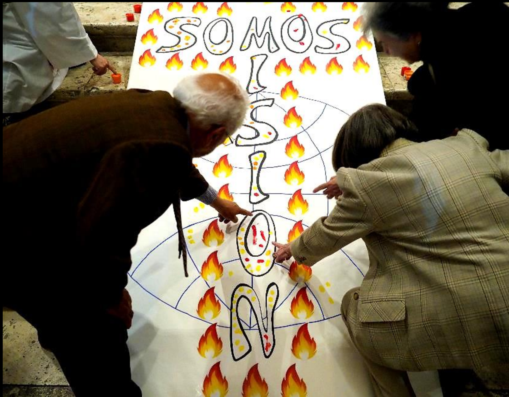
Pentecost -- Cathedral of Valladolid, Valladolid, Spain