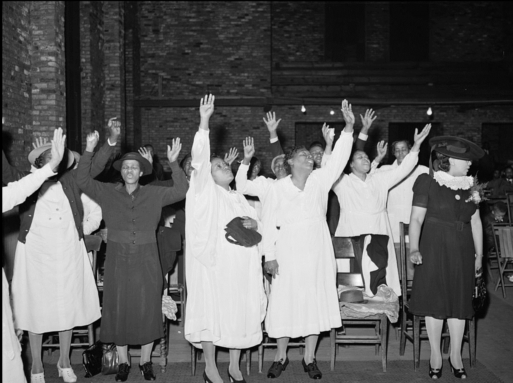
Pentecostal Worship --, Chicago, IL