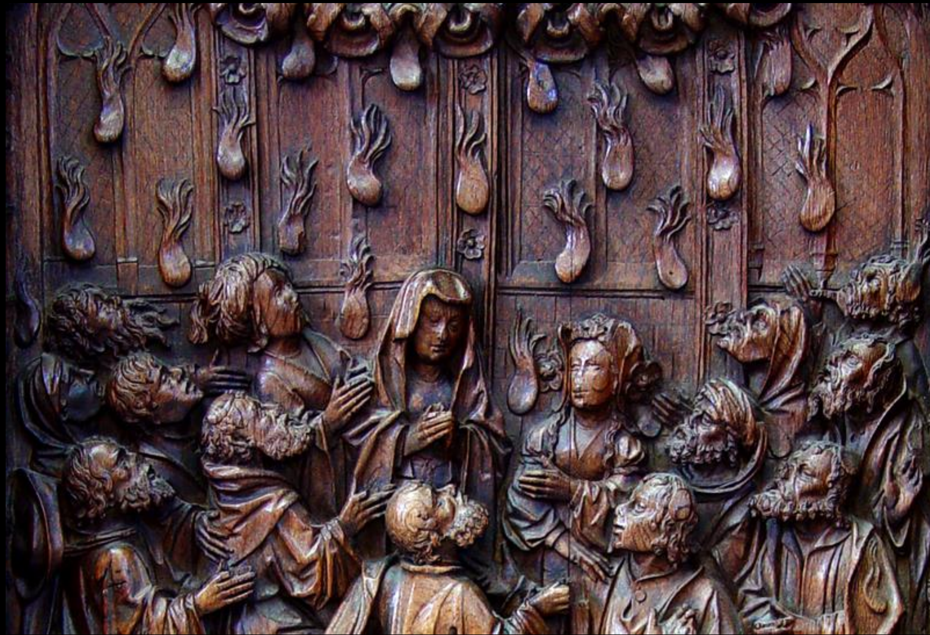
Pentecost -- Early 16 th century Choirstall, Amiens Cathedral, Amiens, France