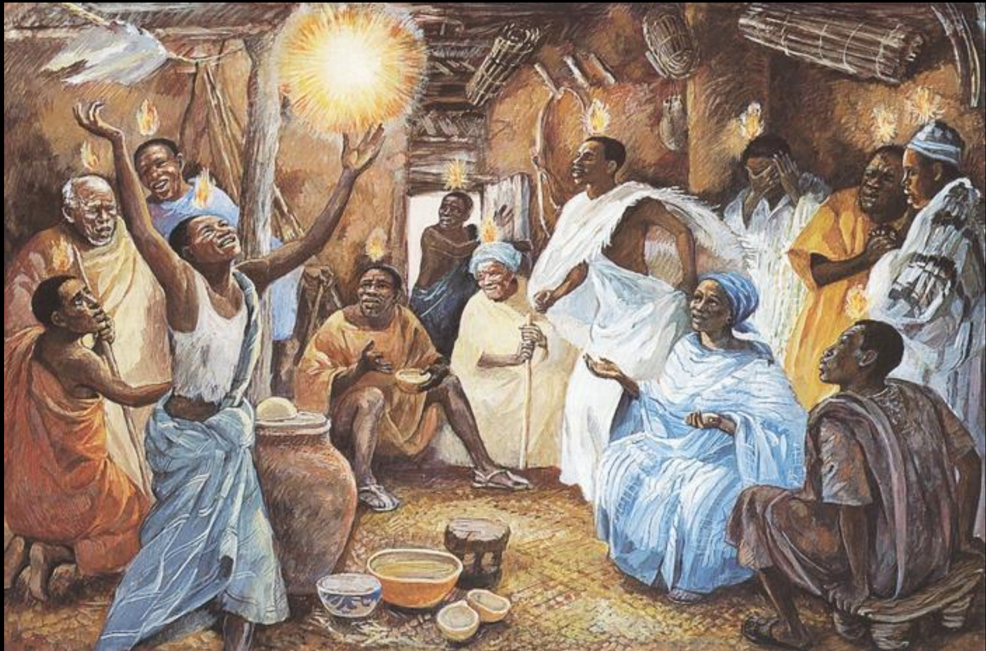
Pentecost -- JESUS MAFA, Cameroon