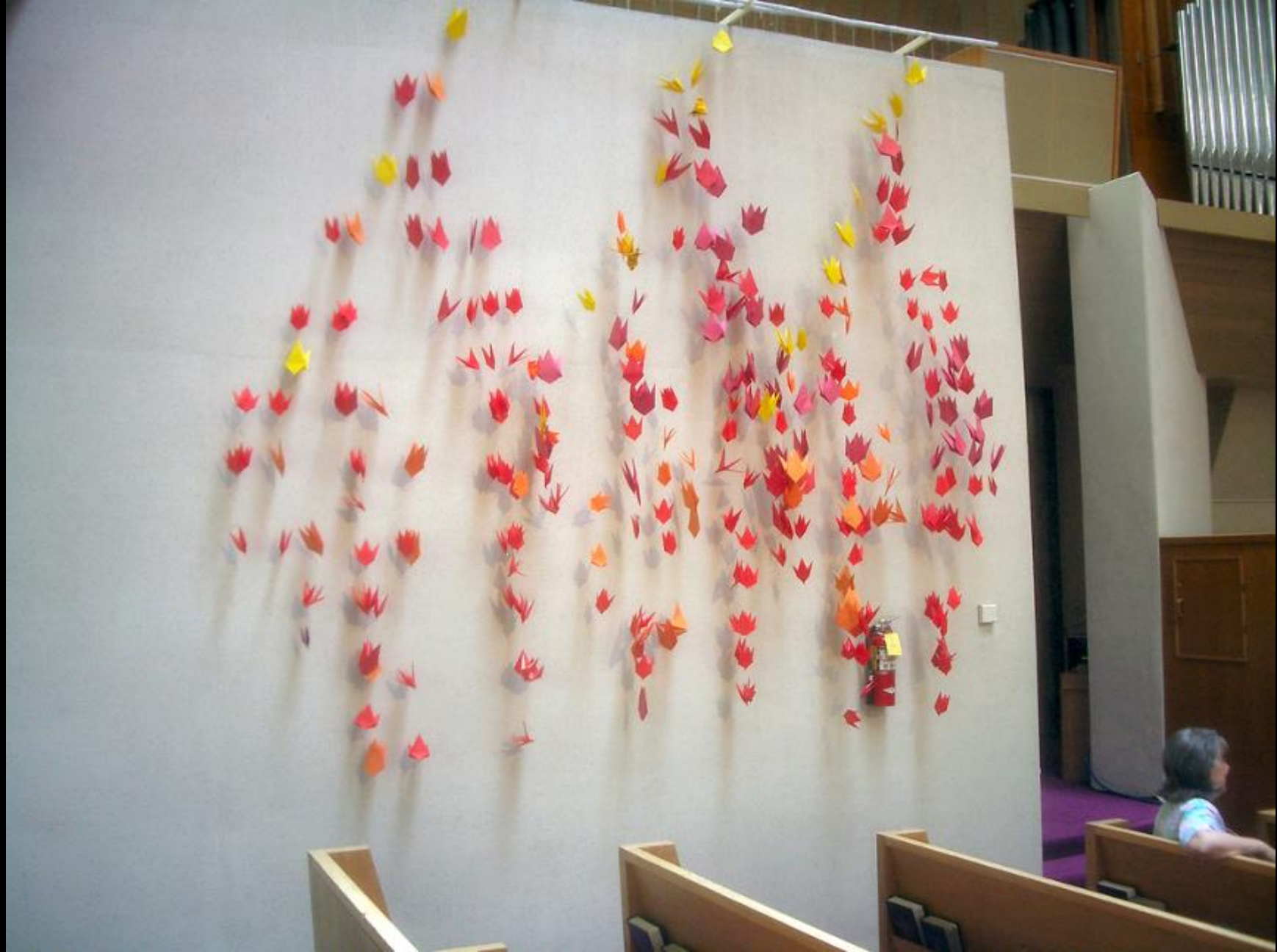
Pentecost -- First Presbyterian Church, Berkeley, CA