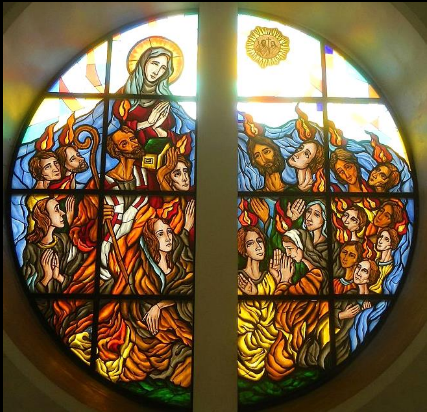
Pentecost Our Lady of Pentecost Catholic Church Quezon City, Philippines