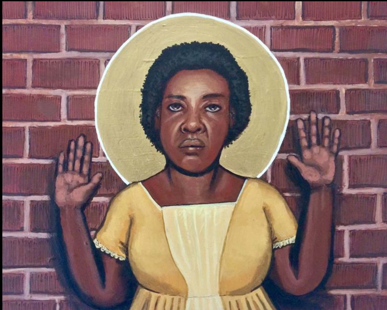
Fannie Lou Hamer, Civil Rights activist