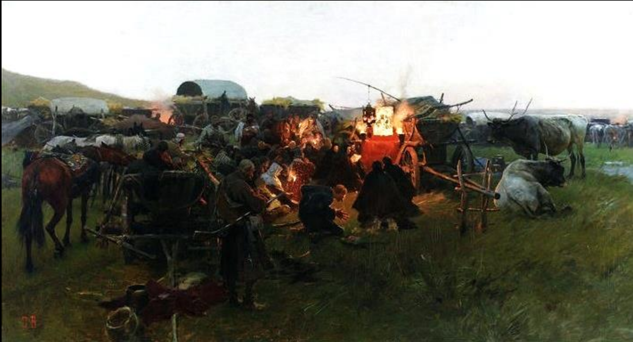
Prayer in the Steppe -- Jozef Brandt, National Museum, Warsaw, Poland