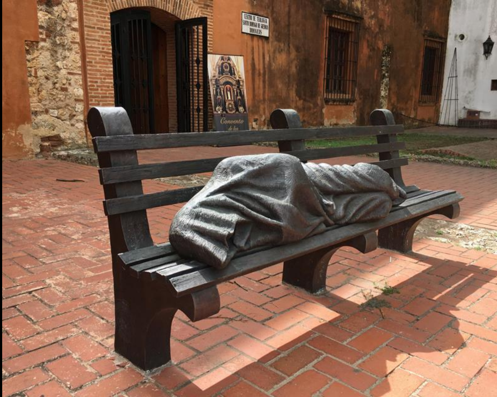
Homeless Jesus -- Timothy Schmalz, Dominican Convent, Santo Domingo, Dominican Republic