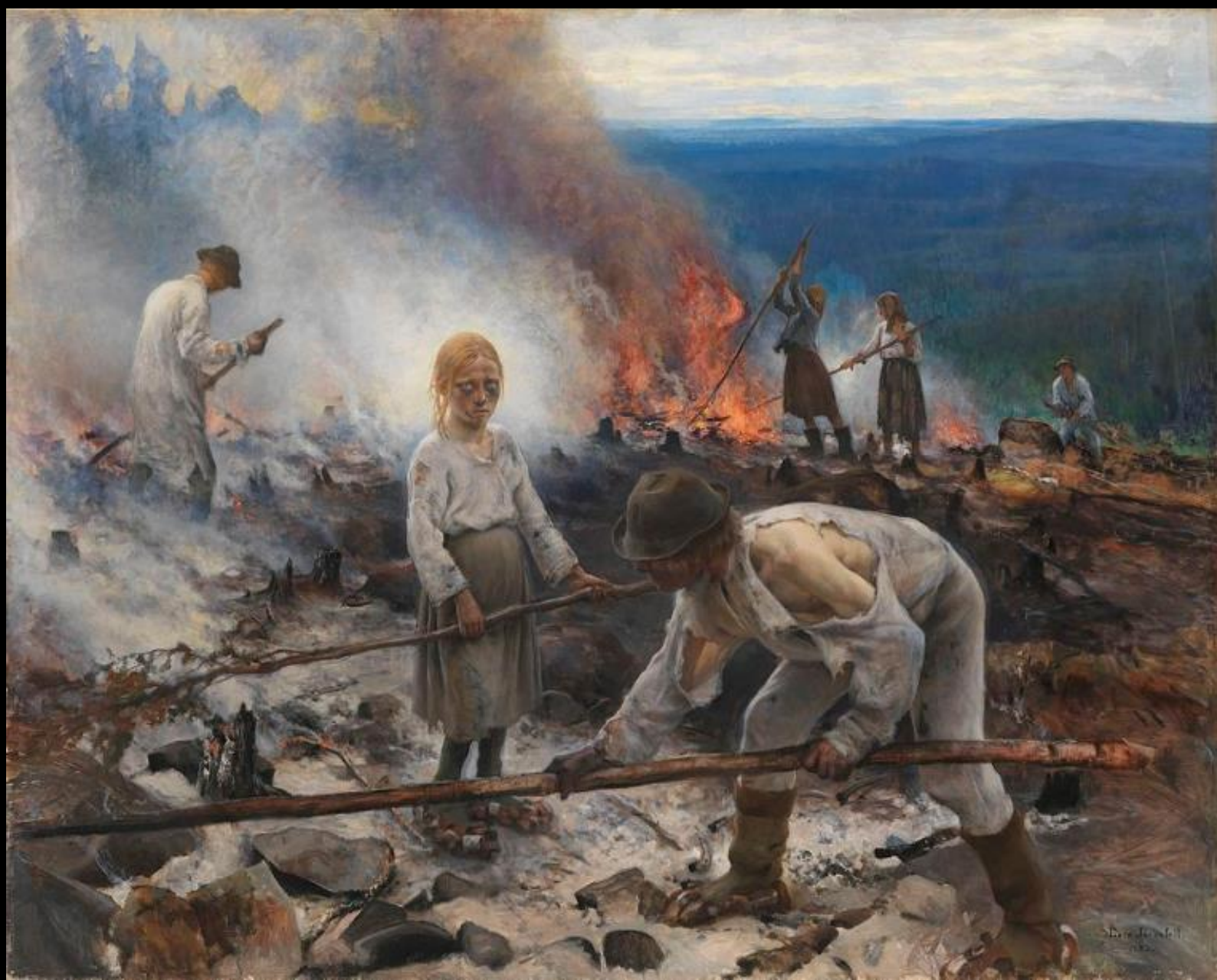
Under the Yoke -- Eero Järnefelt, Finnish National Gallery, Helsinki, Finland