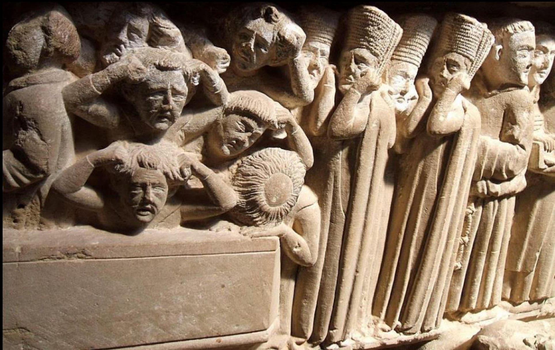
Sepulcher in Cistercian monastery -- Santa María del Salvador, Cañas, Spain