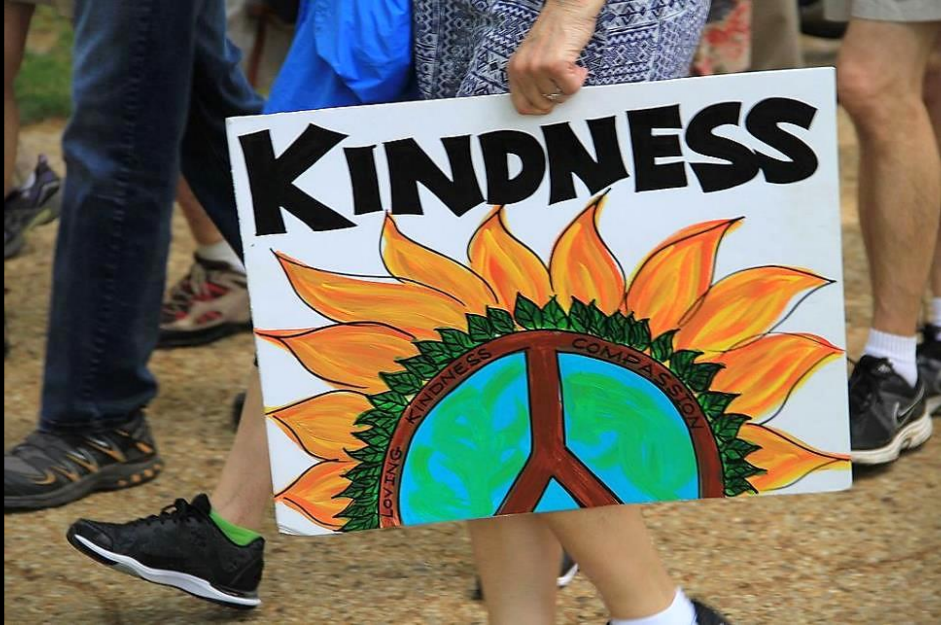
Kindness, Compassion, Peace -- People's Climate March, 2017