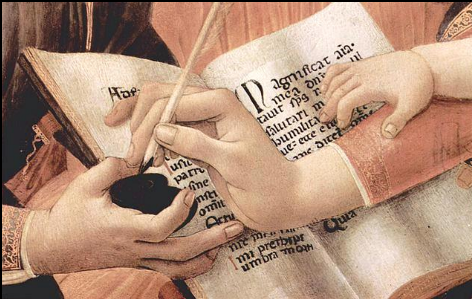
Madonna of the Magnificat (detail) -- Sandro Botticelli, Uffizi Gallery, Florence, Italy