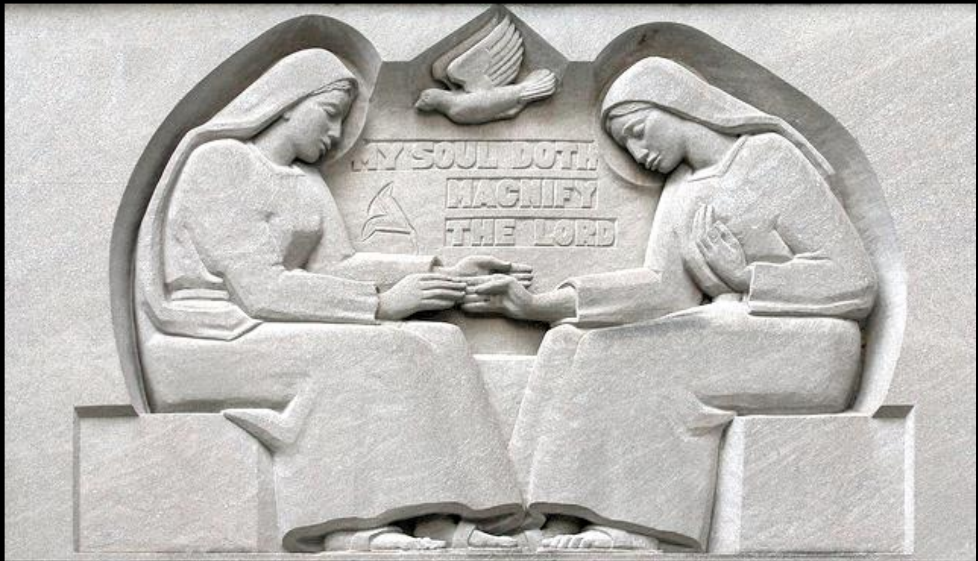
The Magnificat -- Baltimore Cathedral, Baltimore, MD