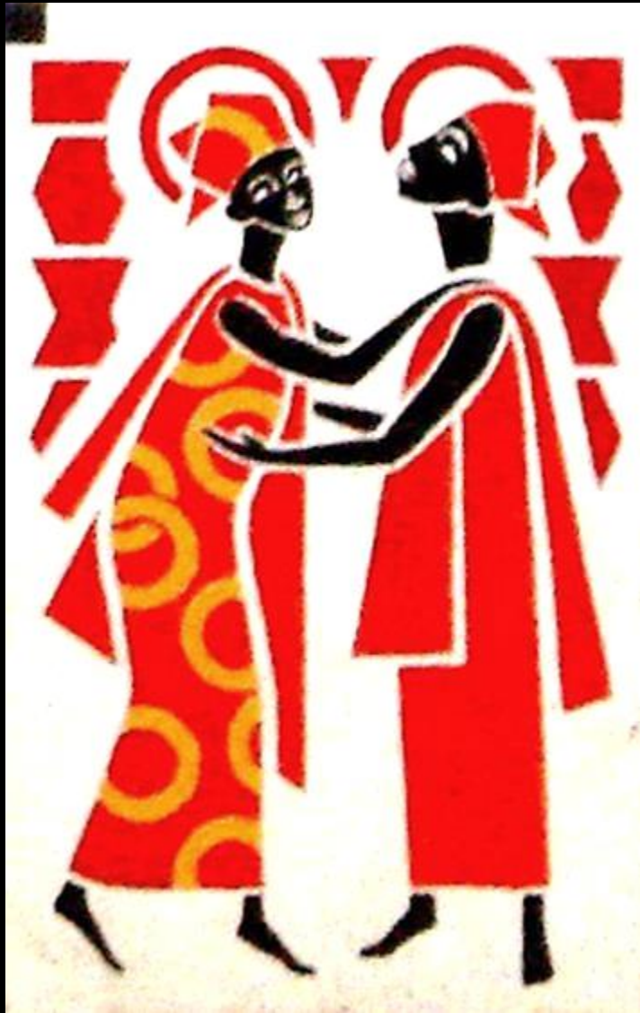
The Visitation -- Keur Moussa Abbey, Senegal