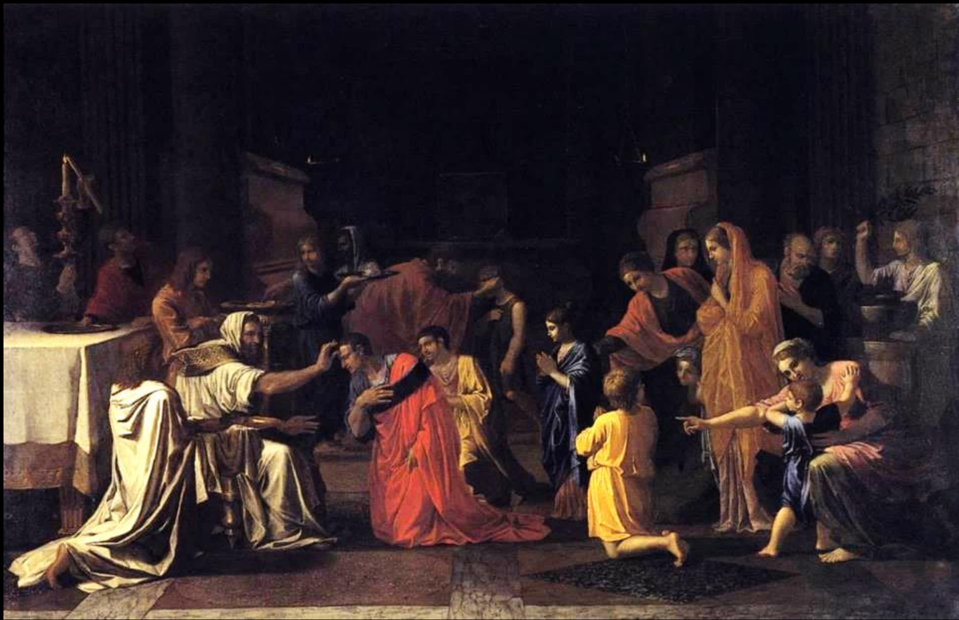
Confirmation -- Nicolas Poussin, Scottish National Gallery, Edinburgh, Scotland