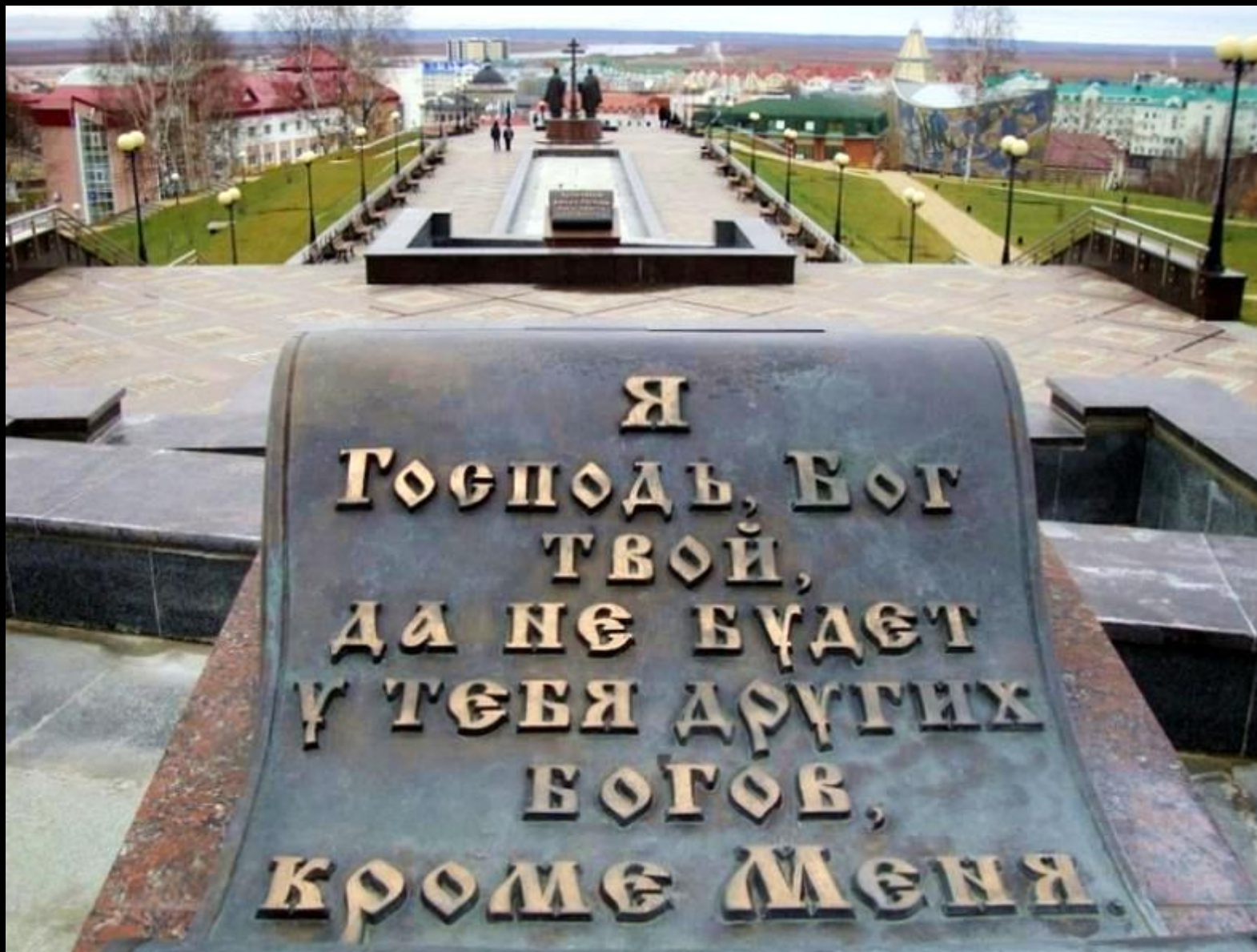
“I am the Lord Your God, You Shall Have No Other Gods Before Me.” Khanty-Mansiysk, Russia