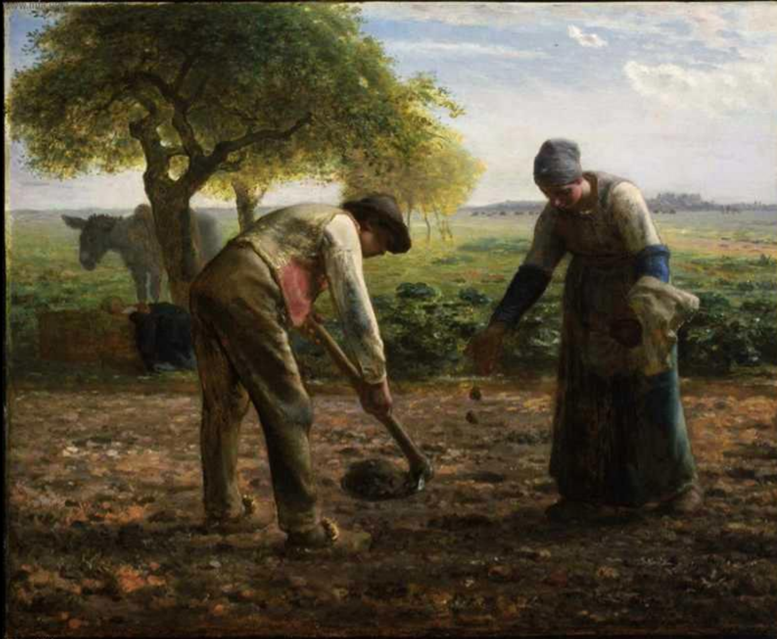
Potato Planters -- Jean Francois Millet, Museum of Fine Arts, Boston