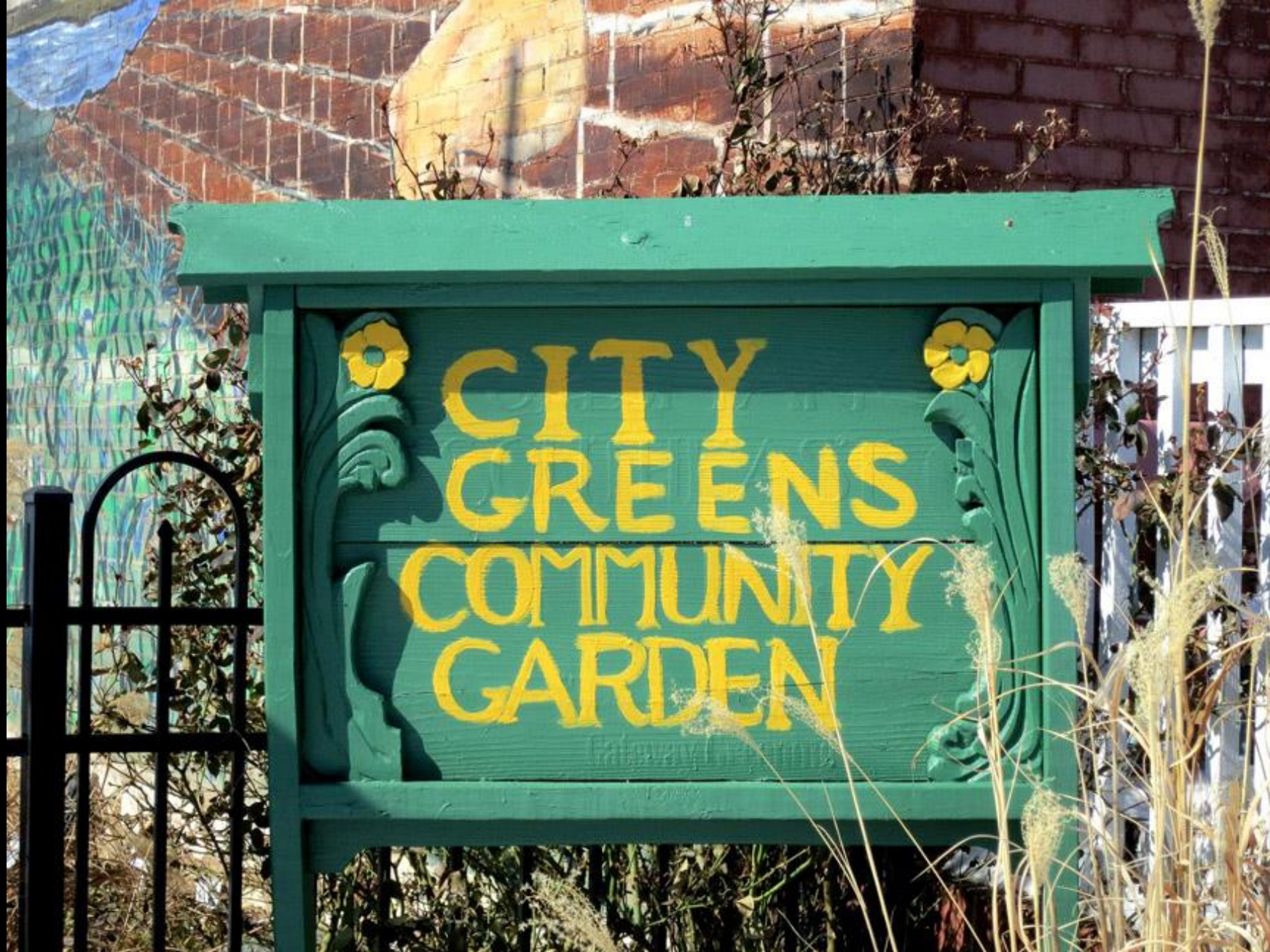
City Greens Community Garden -- City Greens, St. Louis, MO