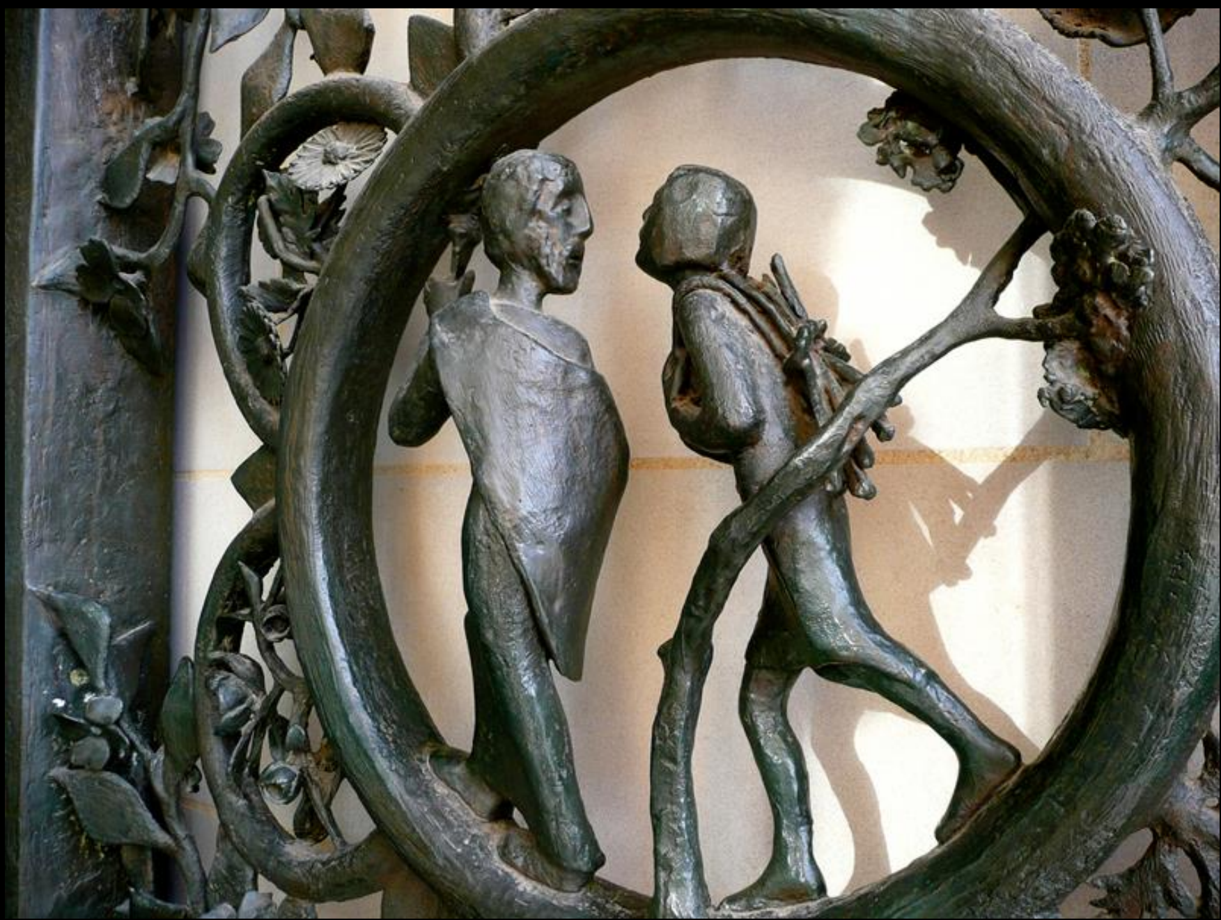
Sacrifice of Isaac -- Washington Cathedral, Washington DC