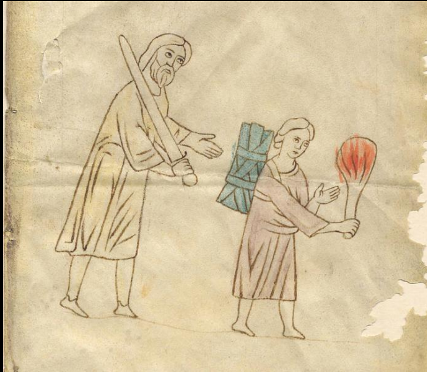
Sacrifice of Isaac -- Manuscript fragment, 14 th century