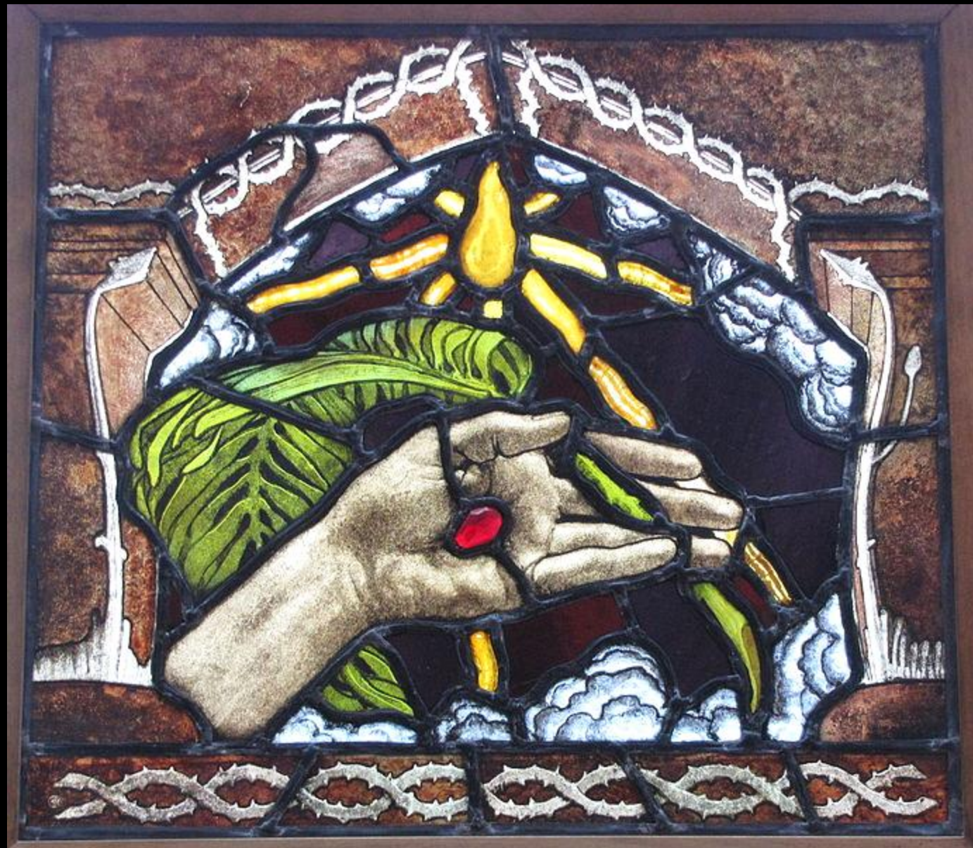
The Hand of Christ, The Palm of Peace -- Akseli Gallen-Kallela Museum, Espoo, Finland