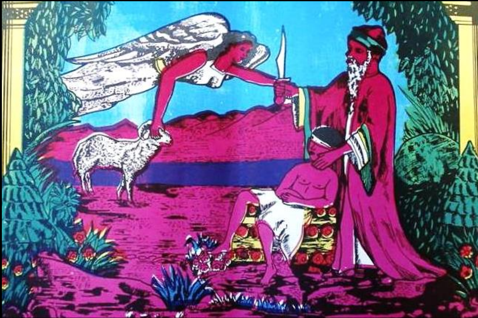
Attempted Sacrifice of Ishmael/Isaac, Chromolithograph, Kano, Nigeria