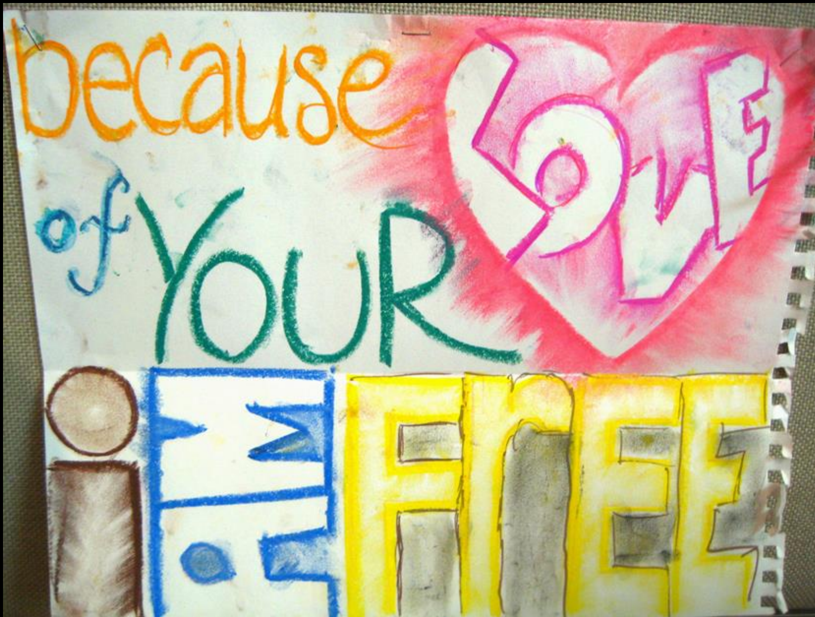
Because of Your Love -- Gateway Mission Camp, Lingnan University, Hong Kong, China