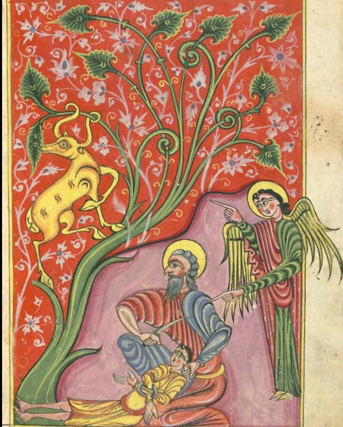
Sacrifice of Isaac Follow Gospels Walters Art Museum Baltimore, MD