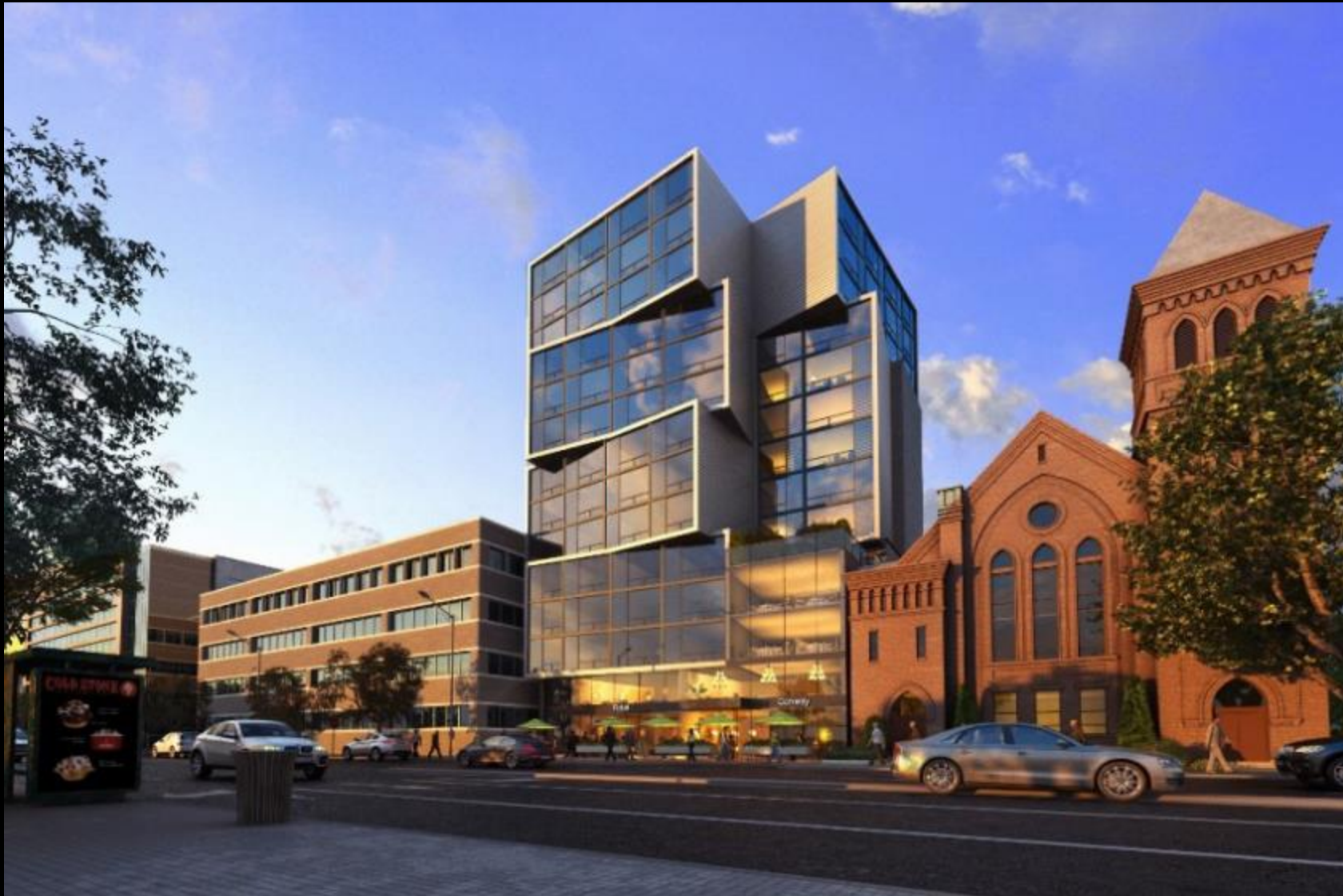
Ker Family Affordable Micro Homes for Veterans -- Sorg Architects, Washington, DC