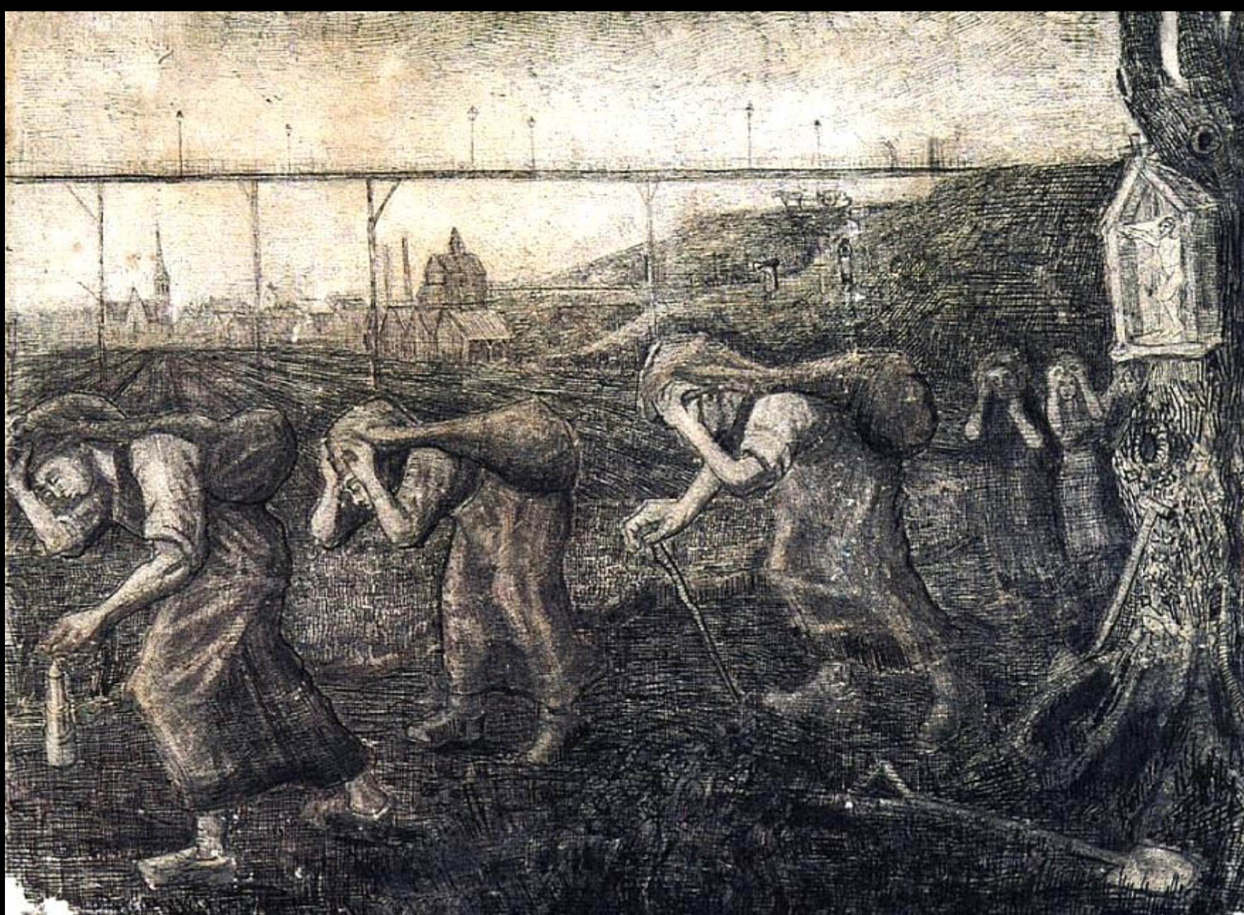
Miners and Women Carrying Sacks -- Bearers of the Burden Vincent van Gogh, Kroller-Muller Museum, Otterlo, Netherlands