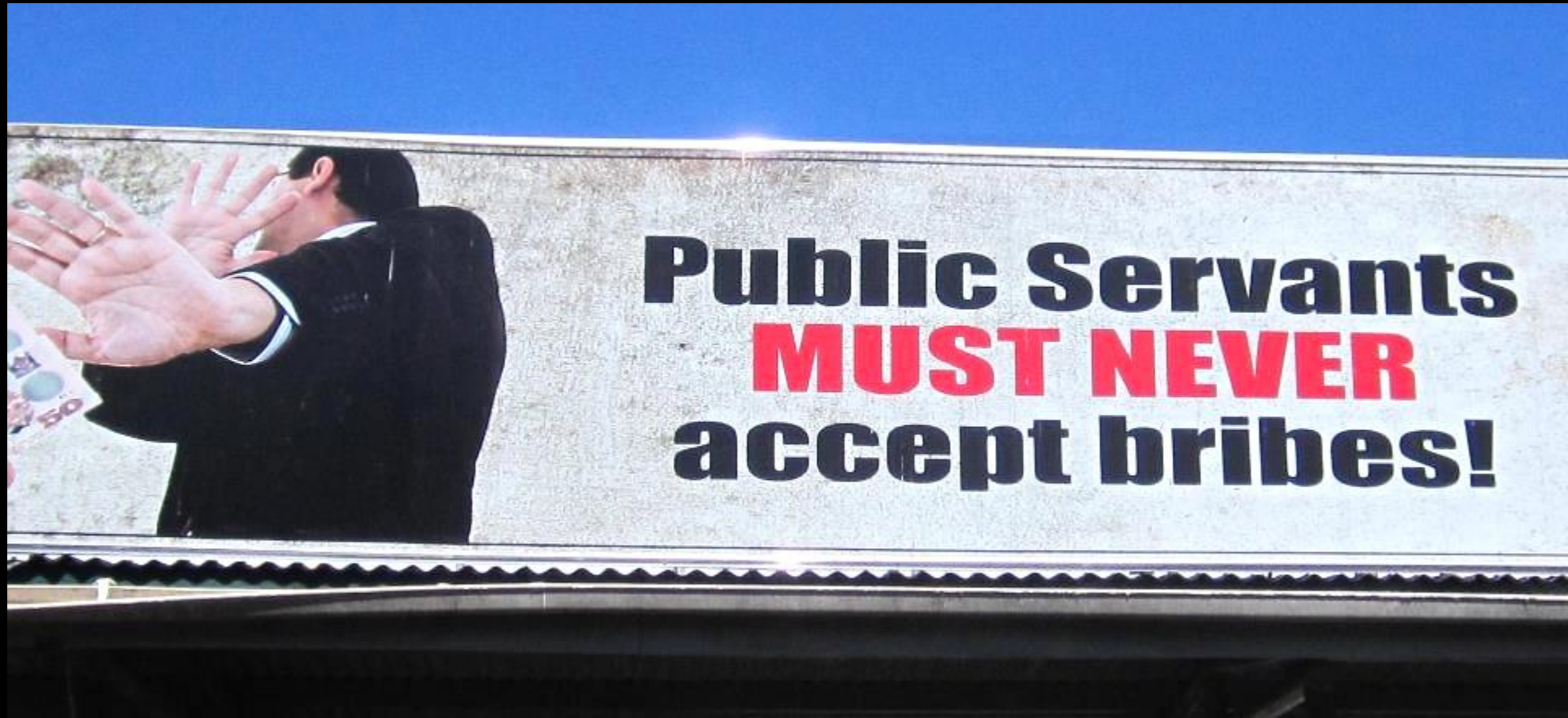
Billboard -- Sigatoka, Fiji