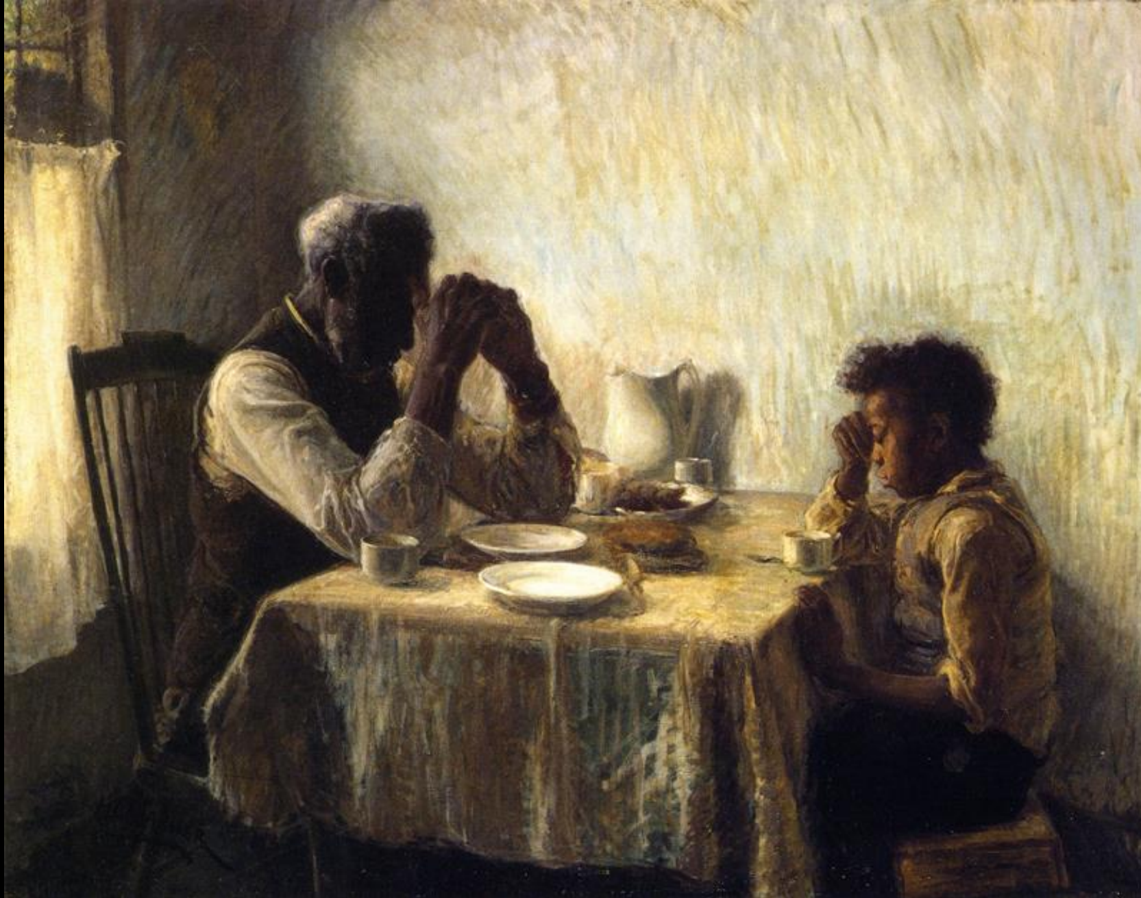
Thankful -- Henry Ossawa Tanner