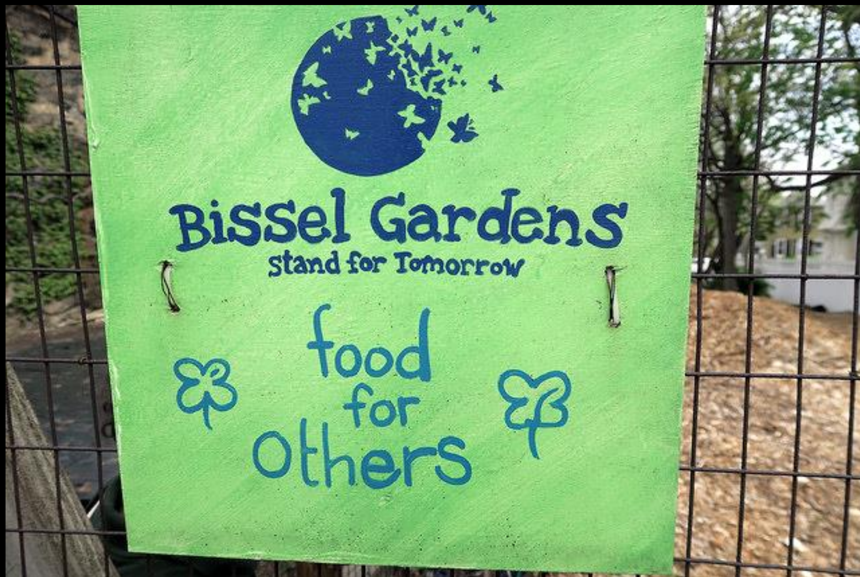
Bissel Community Gardens -- Bronx, New York, NY