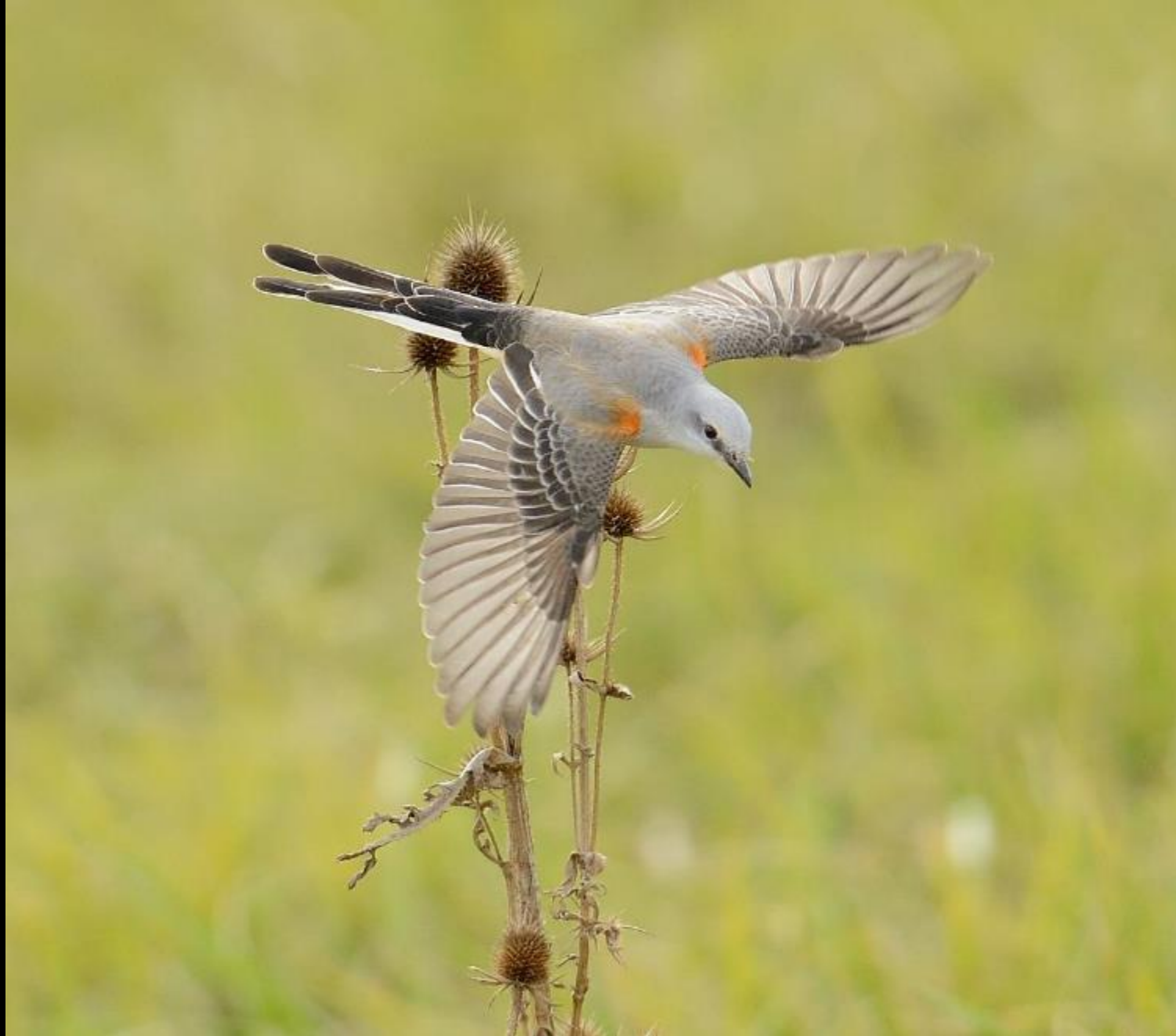
Scissor-tailed Flycatcher -- Former Landfill, Techny Overlay District, Northbrook, IL