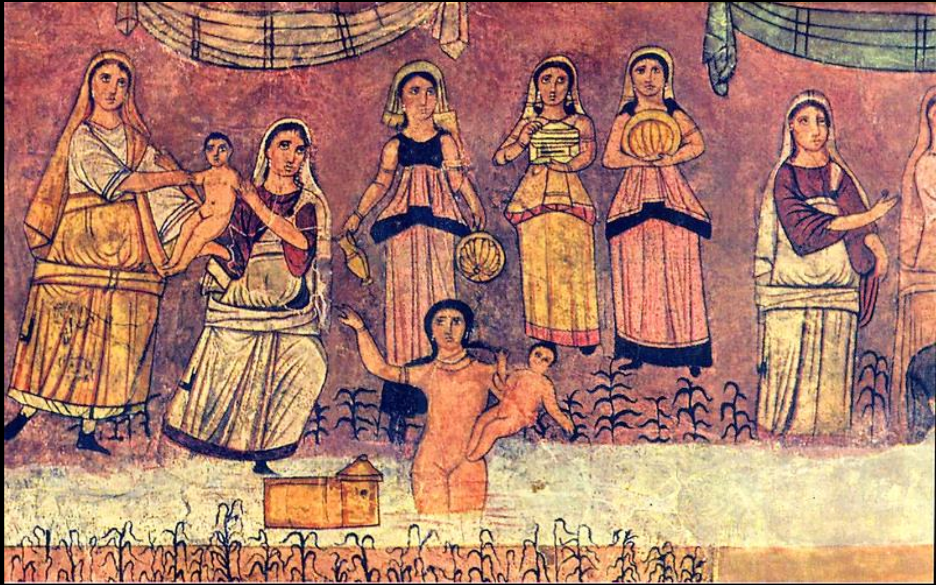
Shiphrah, Puah, Jocheved, Miriam, Pharoah's Daughter, and the infant Moses – Dura Europos