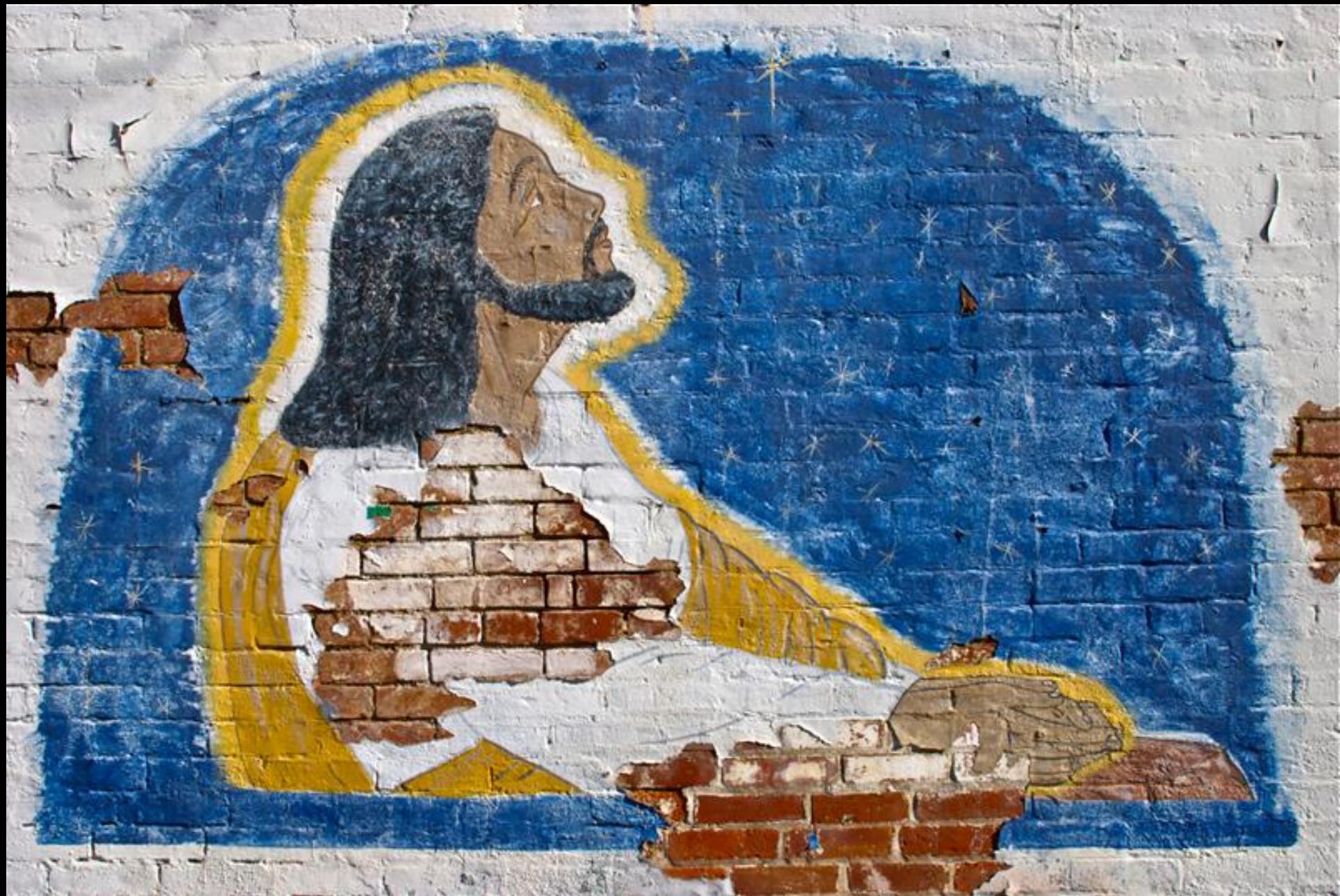
Jesus Praying -- Mural, Louisville, KY