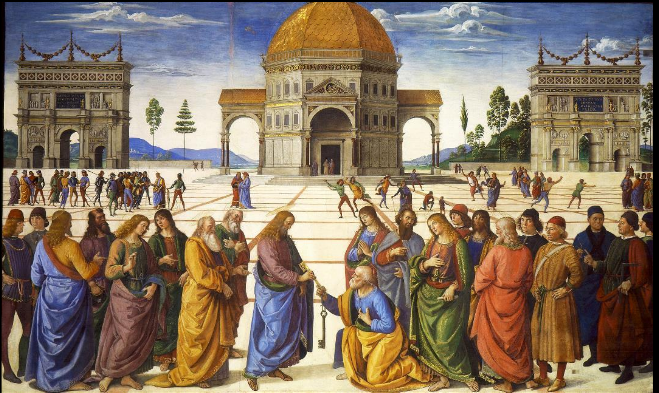
Christ Gives Keys of Kingdom to Peter -- Perugino, Sistine Chapel, Vatican City