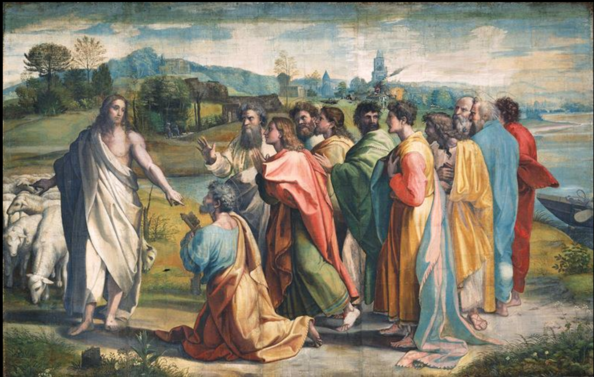
Peter Proclaims the Christ -- Raphael, Victoria and Albert Museum, London, England