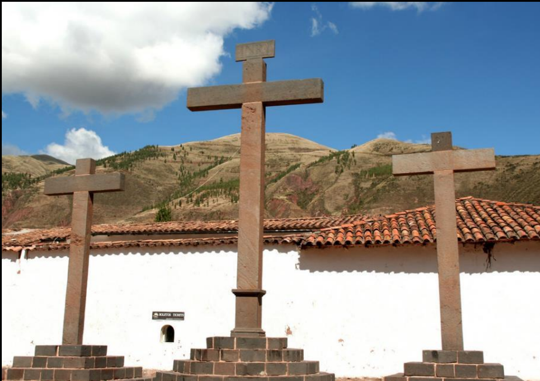
Church of St. Peter and St. Paul -- Andahuaylillas, Peru