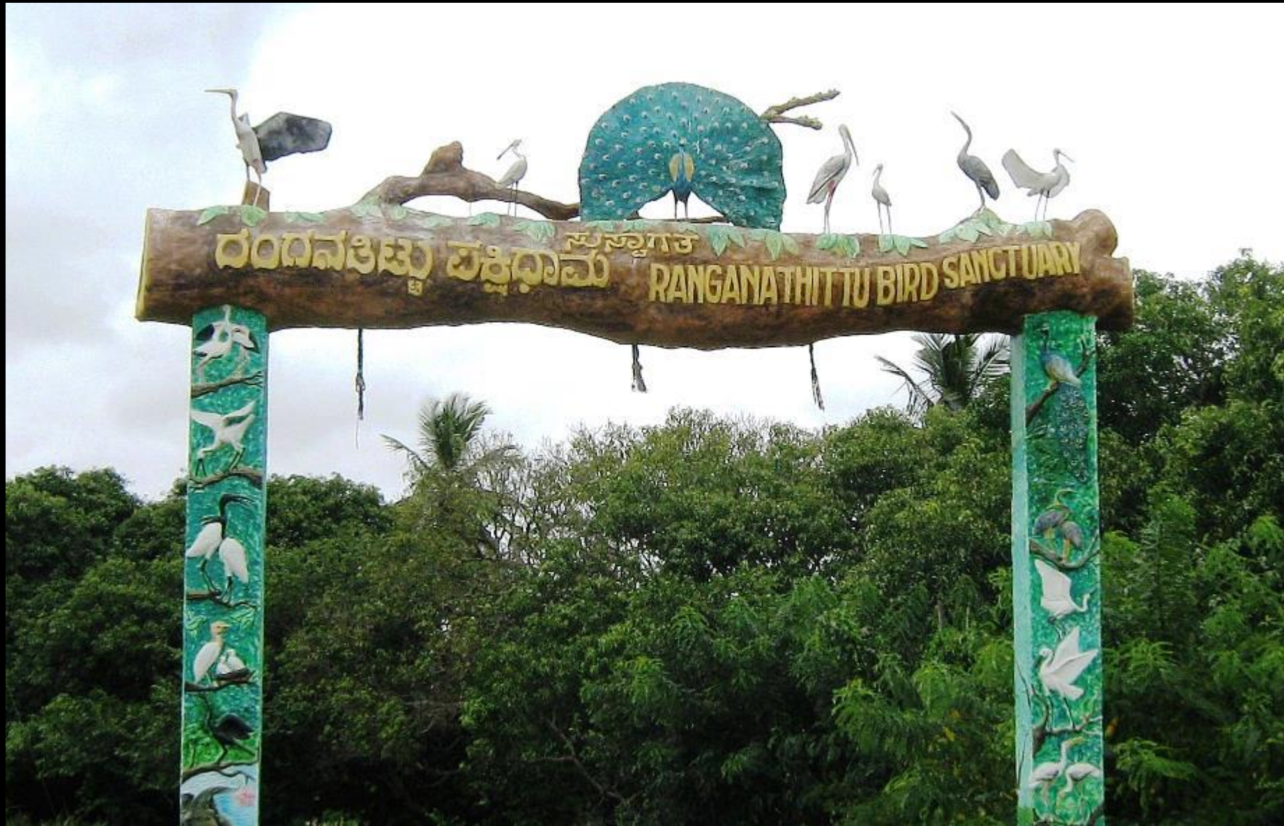
Ranganthittu Bird Sanctuary, Mysore, India