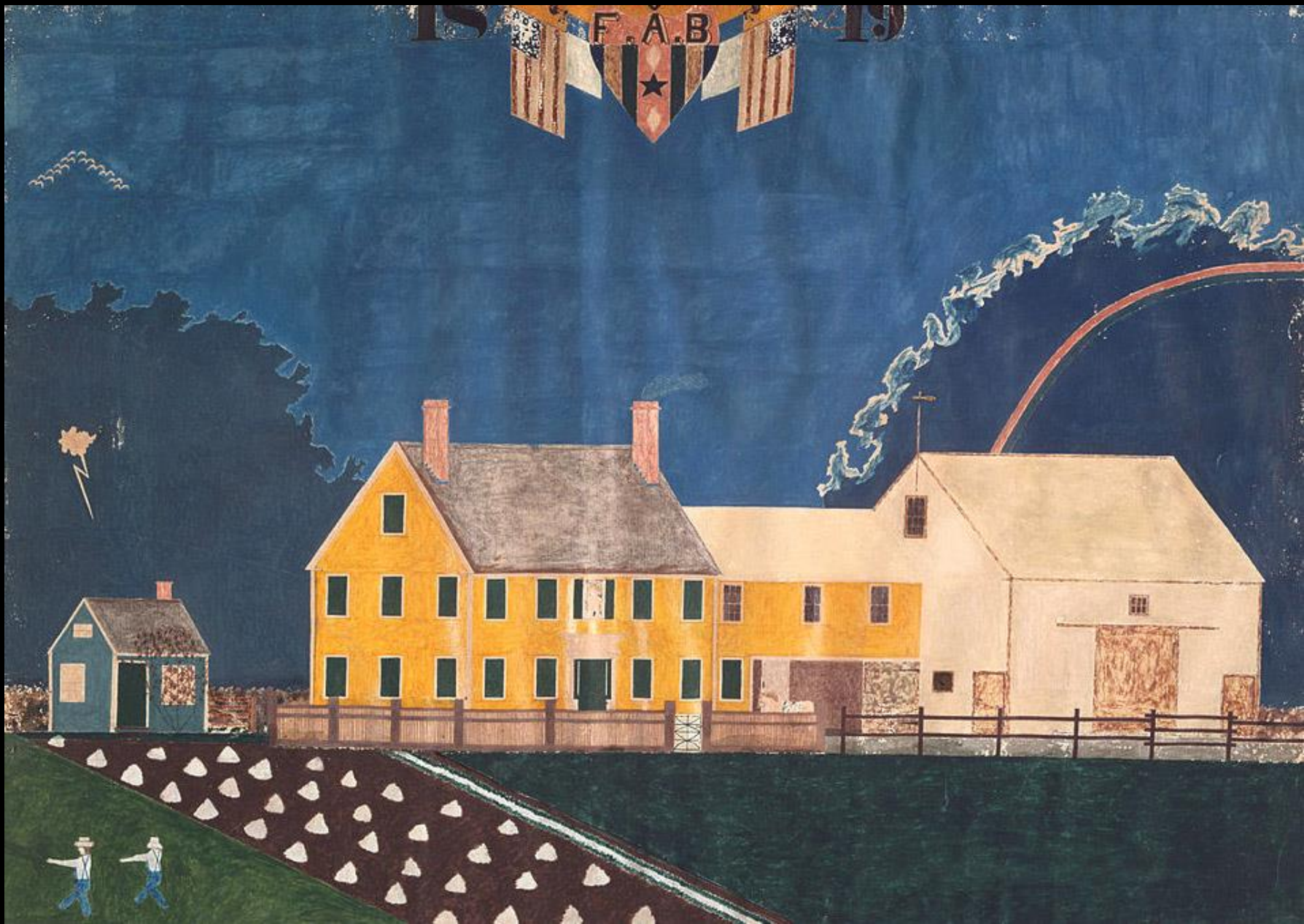
Farmstead in a Passing Storm -- unidentified artist, Museum of Fine Arts, Boston