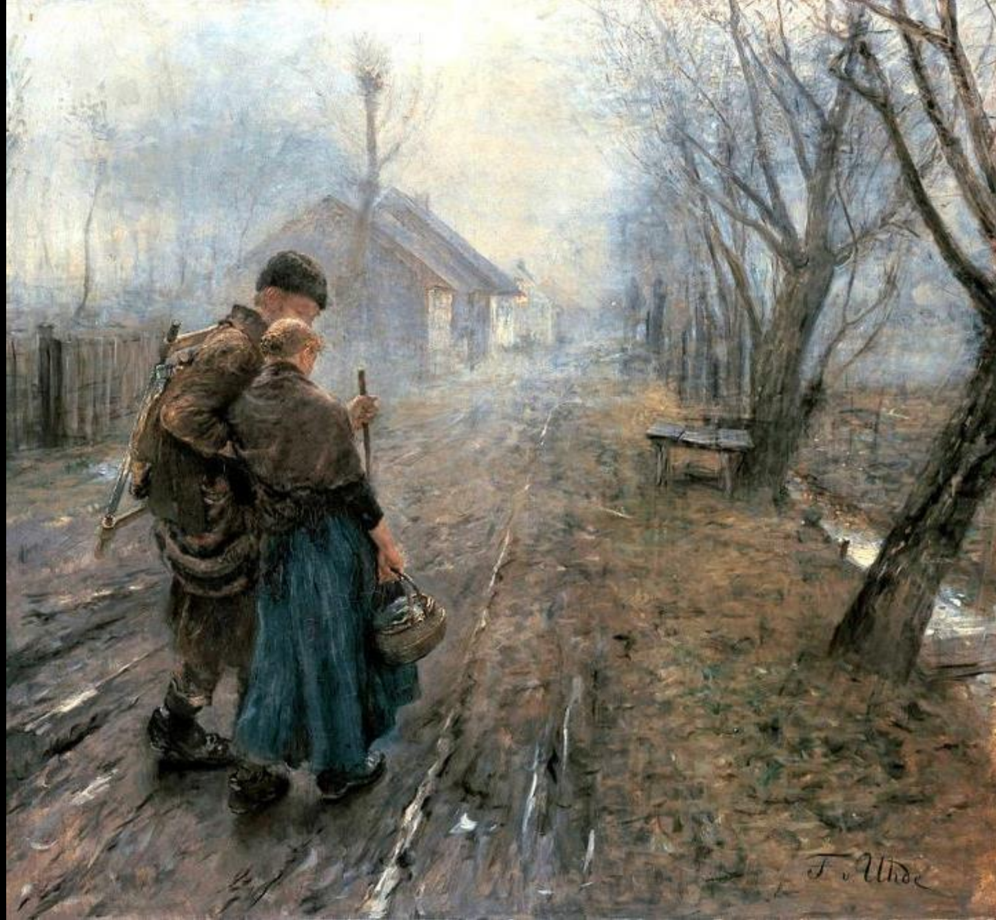
Difficult Journey – Transition to Bethlehem – Fritz von Uhde, Neue Pinakothek, Munich, Germany