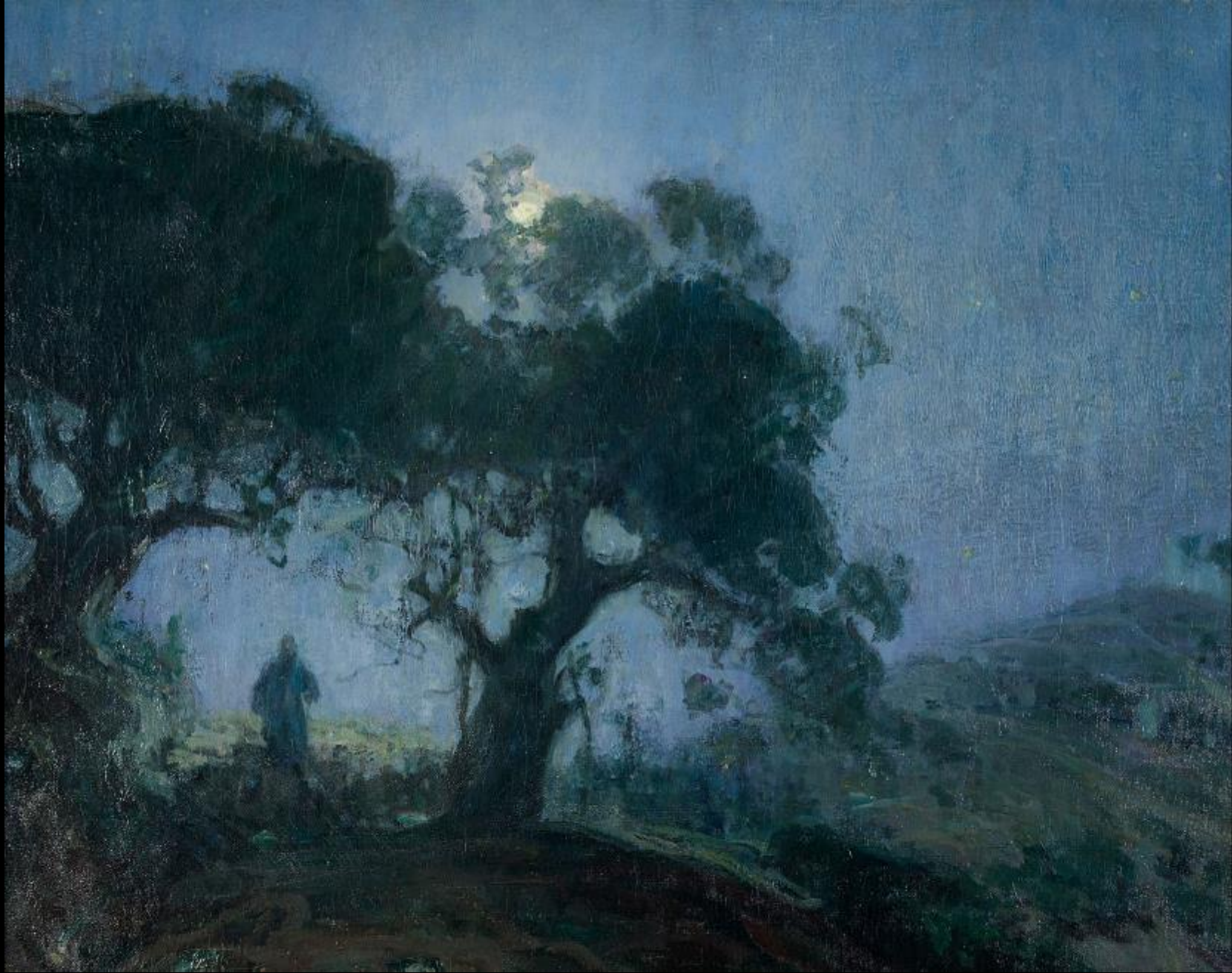
The Good Shepherd -- Henry Ossawa Tanner, Zimmerli Art Museum, Rutgers, NJ