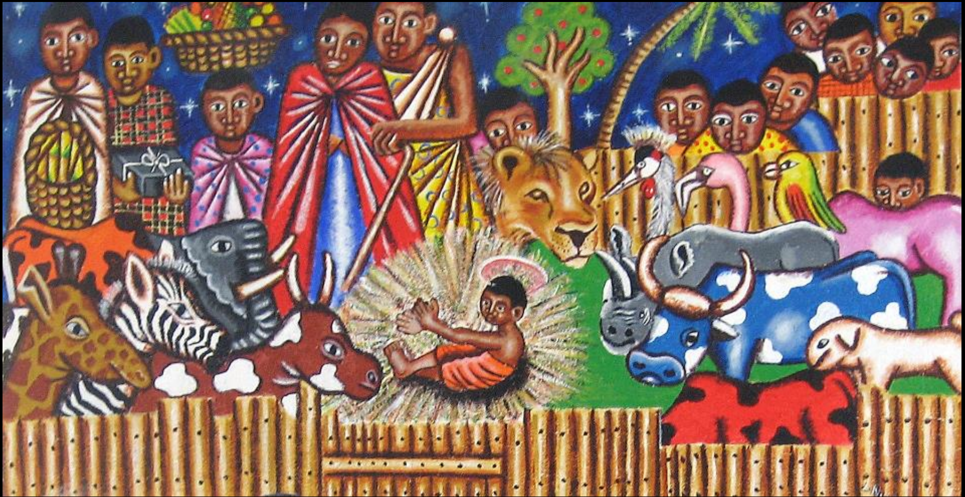
Nativity from a church in Kenya