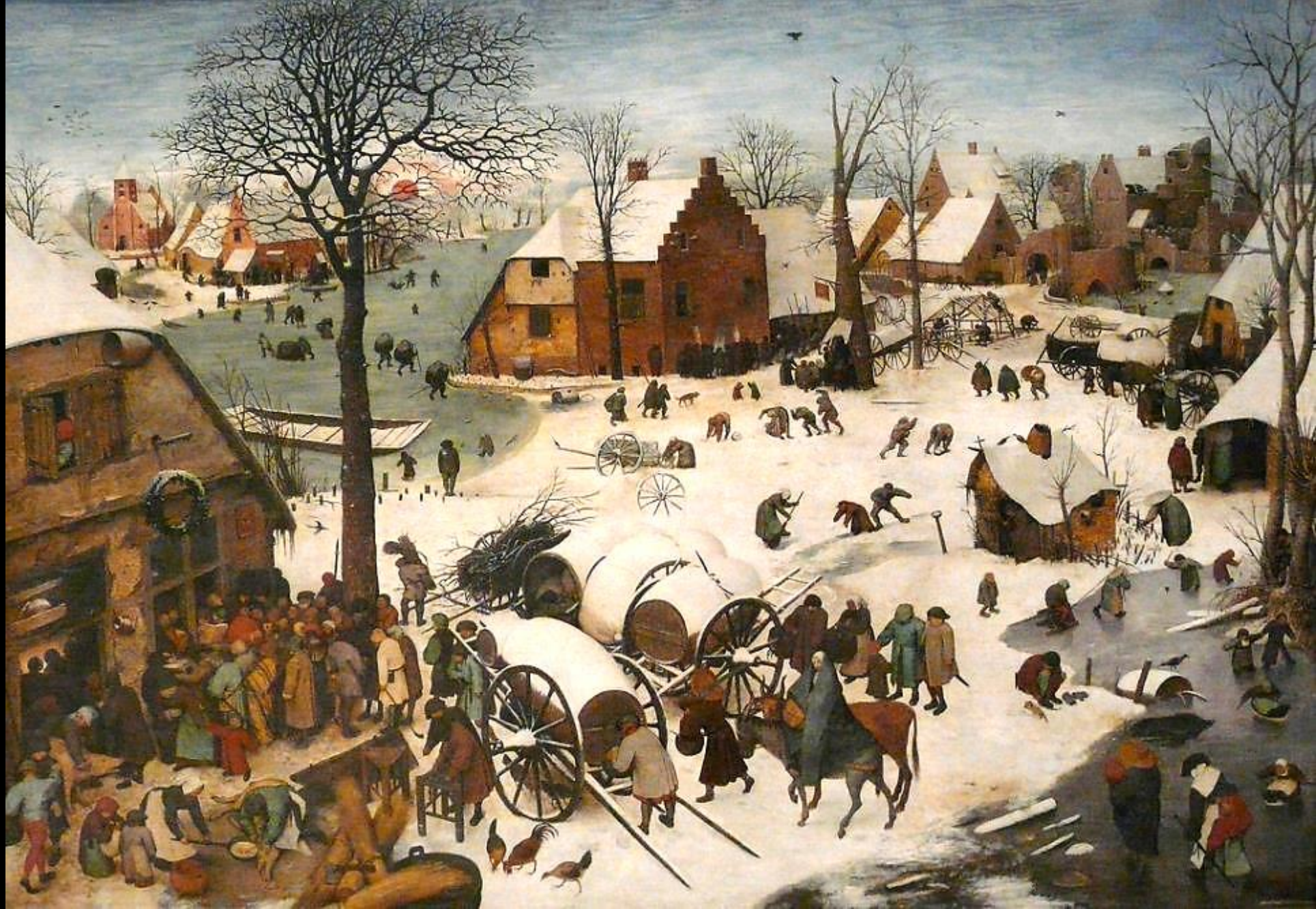
The Census at Bethlehem -- Pieter Brueghel the Elder, Brussels Museum of Fine Arts, Brussels, Belgium