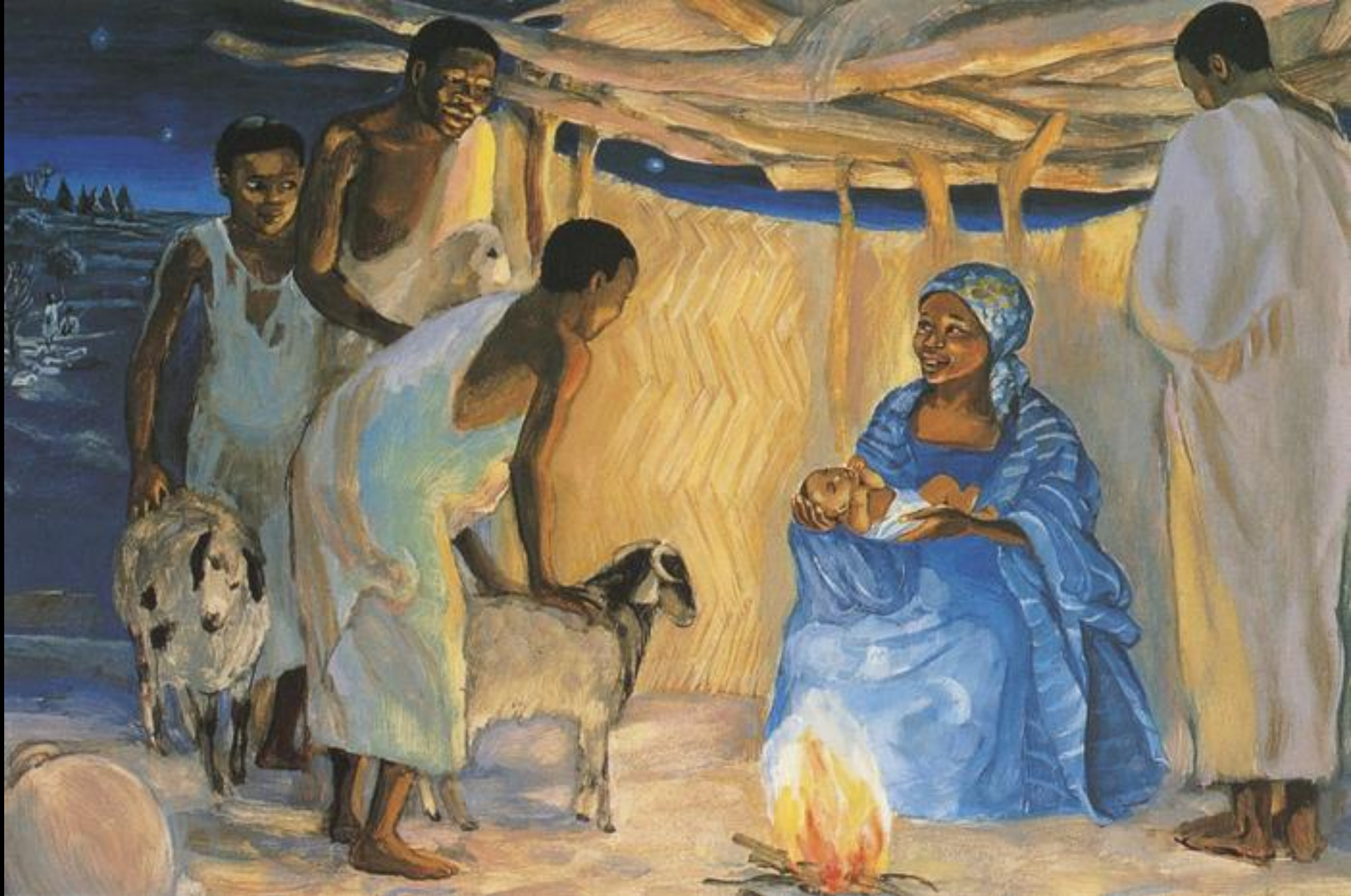
Birth of Jesus with the Shepherds -- JESUS MAFA, Cameroon