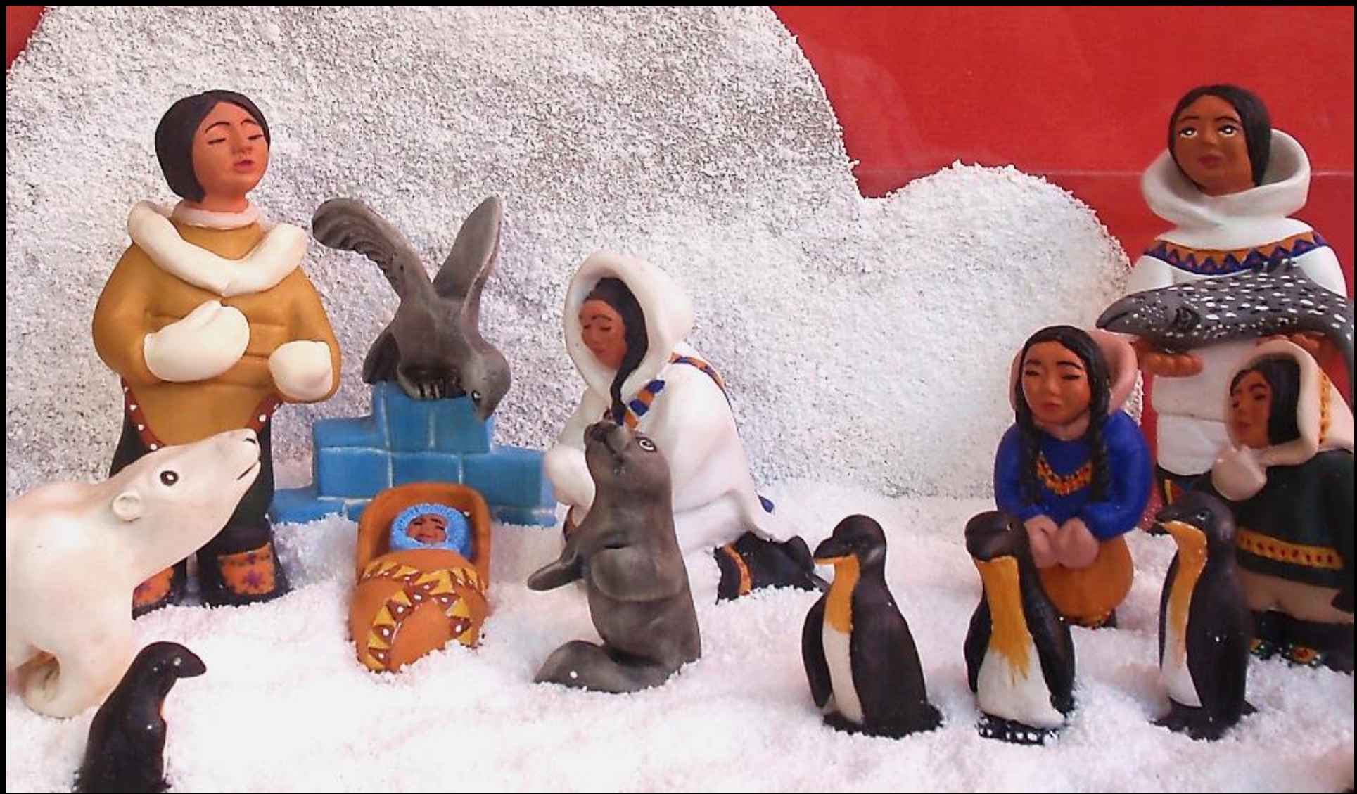
Inuit Nativity -- Padron House Museum, Galdar, Spain