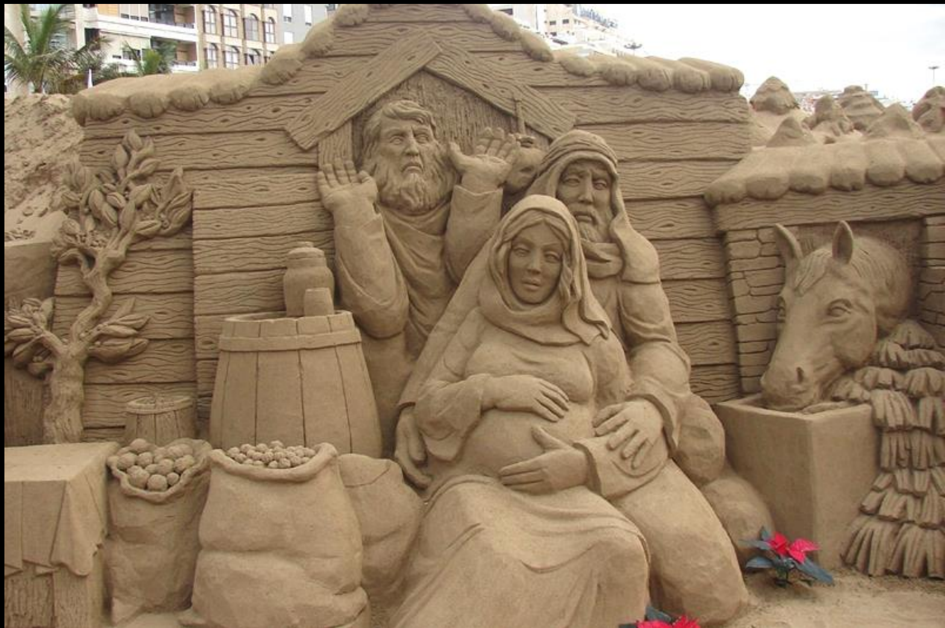
No Room in the Inn -- Peter Busch, Sand sculpture, Canary Islands, Spain