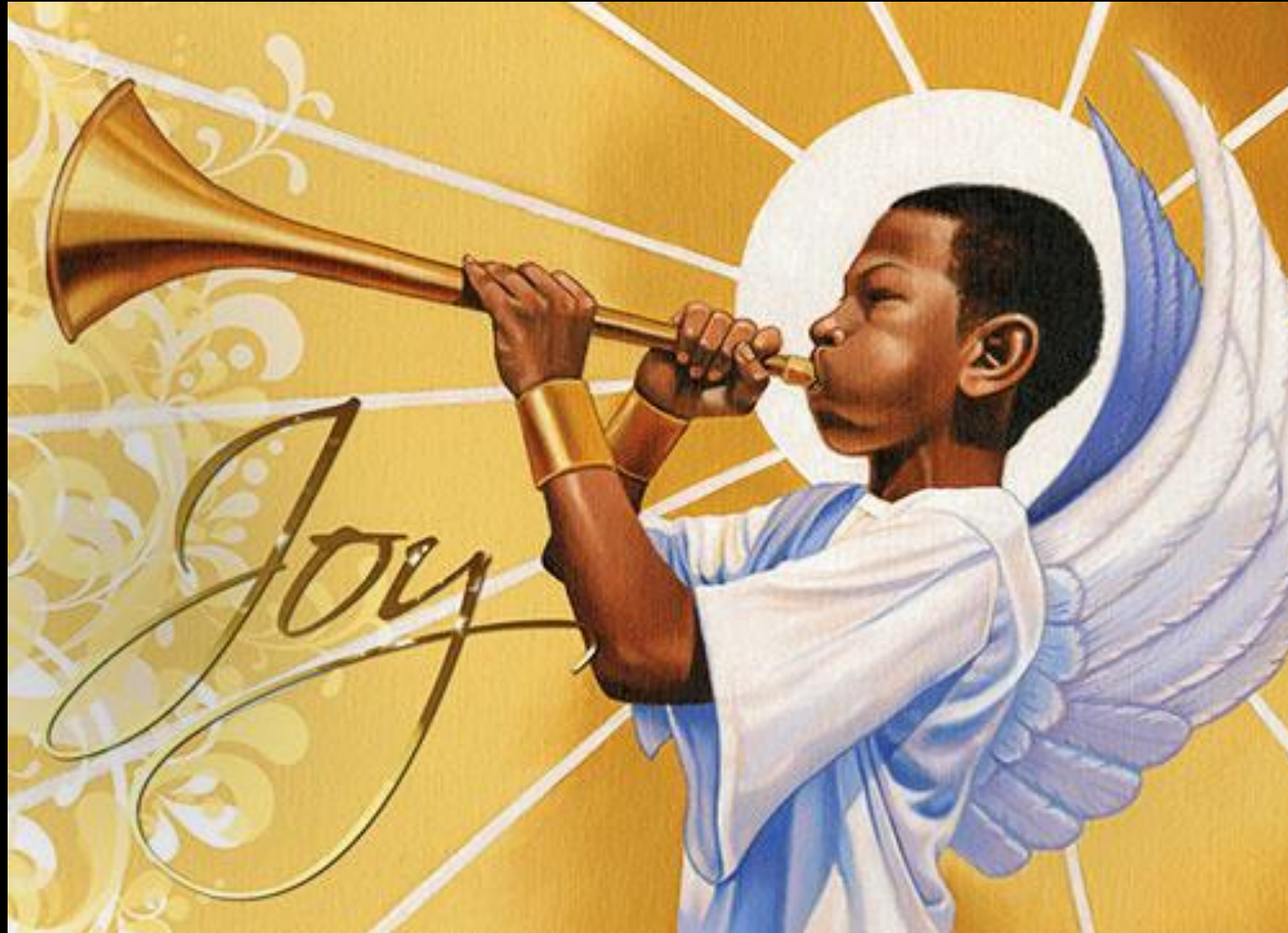
Joy to the World, the Lord is Come -- Illustration from Dem. Republic of Congo