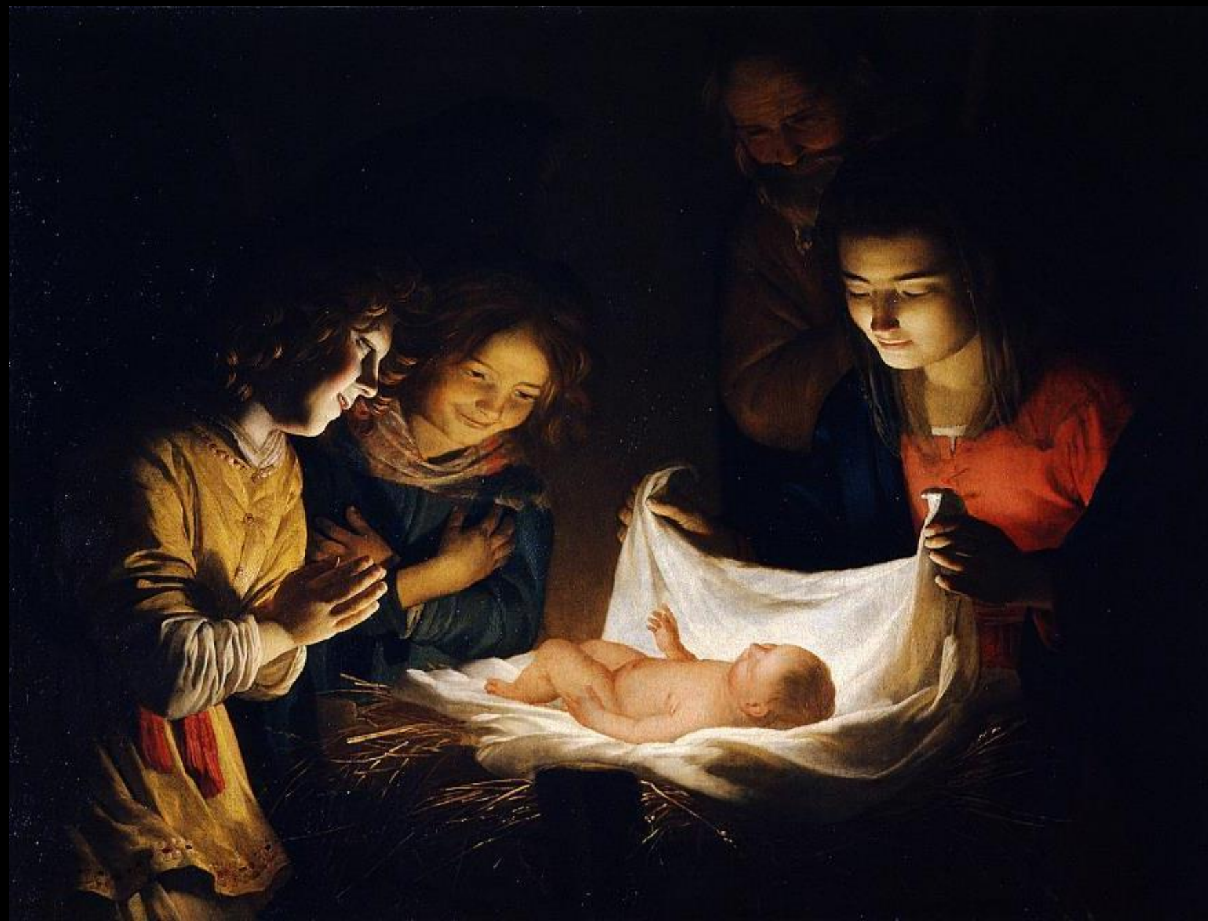
Adoration of the Child -- Gerard van Honthorst, Uffizi Gallery, Florence, Italy