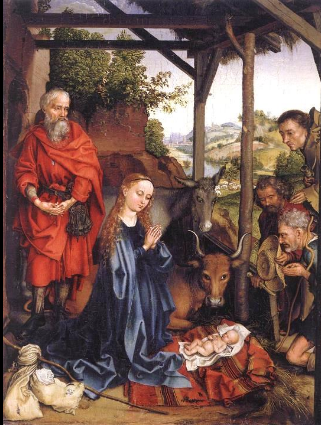
Birth of Christ Martin Schongauer Gemaldegalerie Berlin, Germany