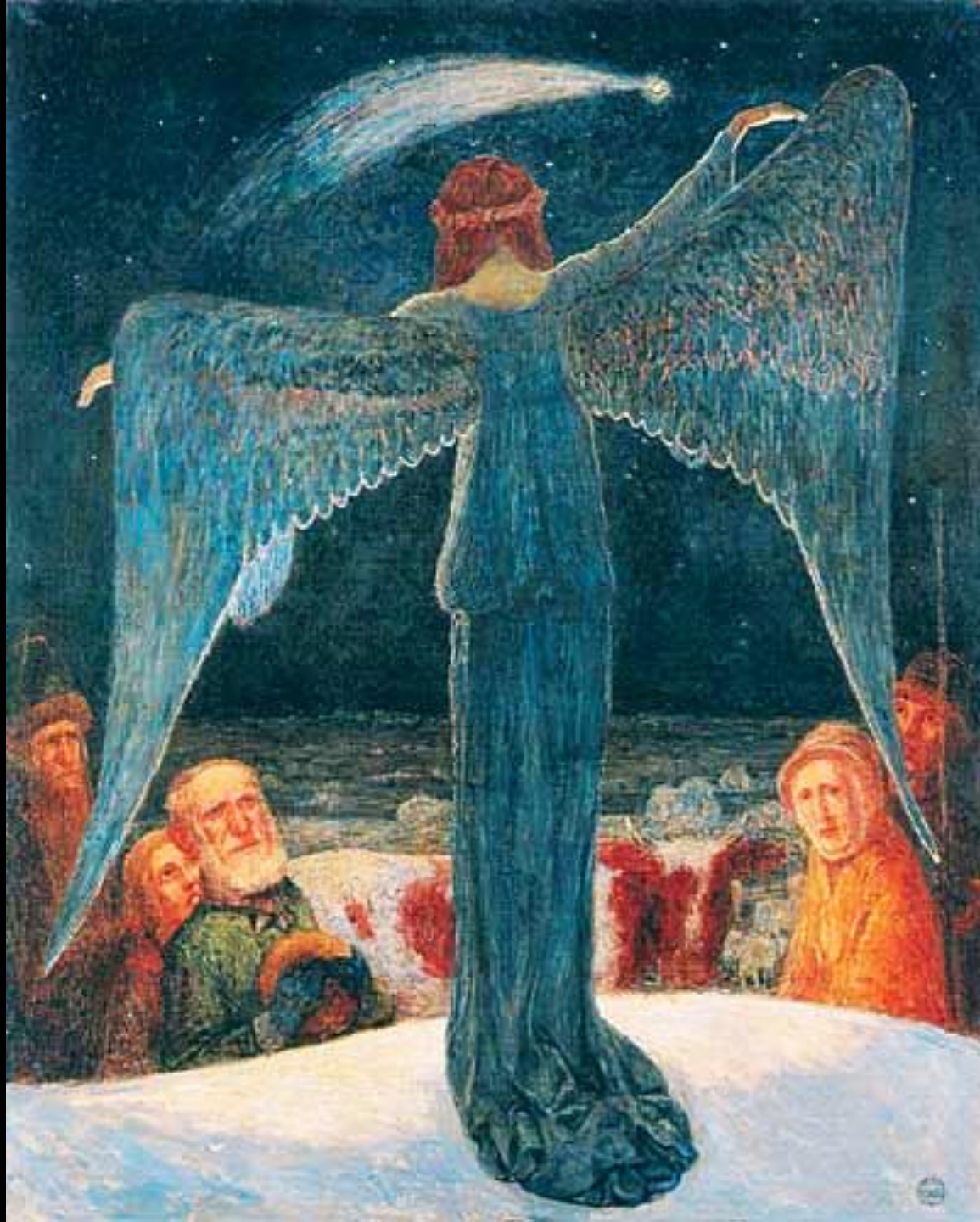
Annunciation to the Shepherds