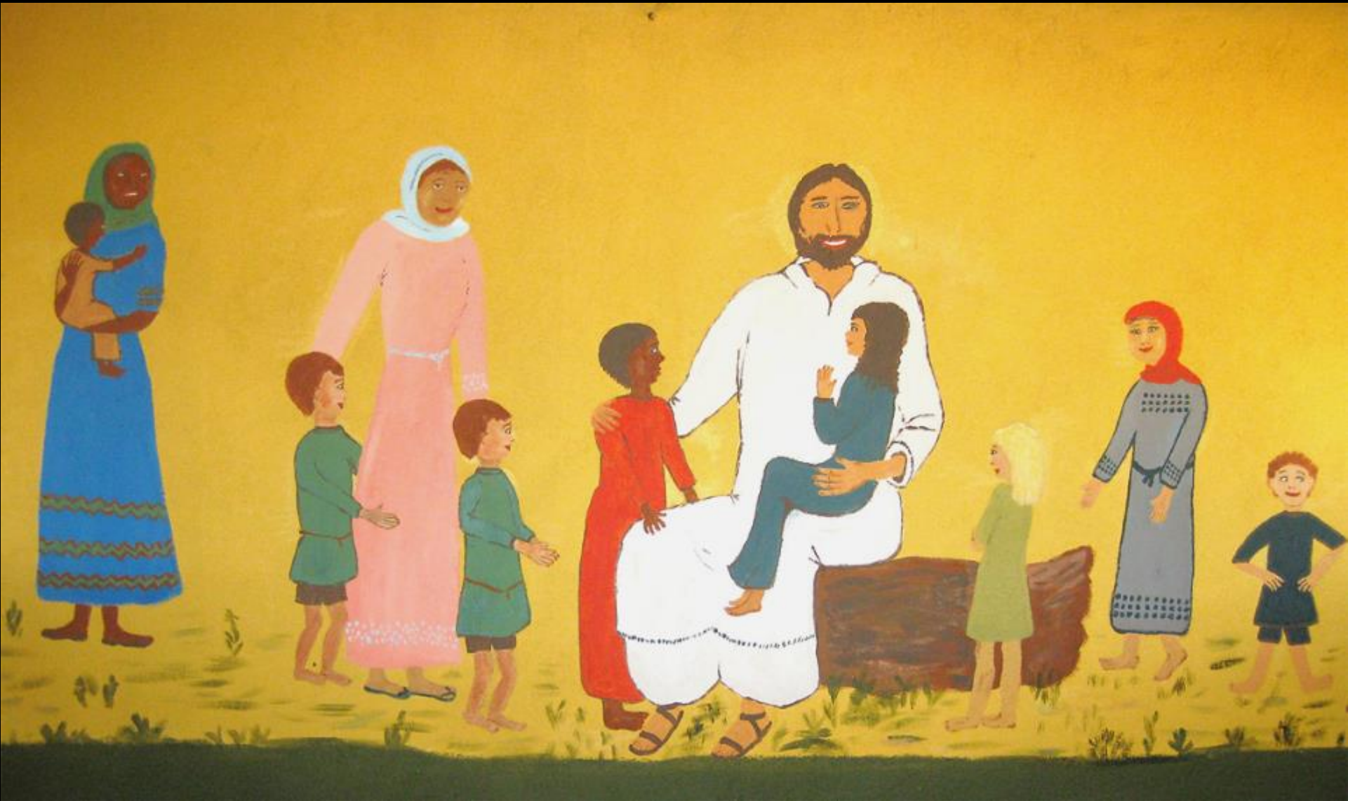
Jesus Welcomes All -- Church Mural, Sudan