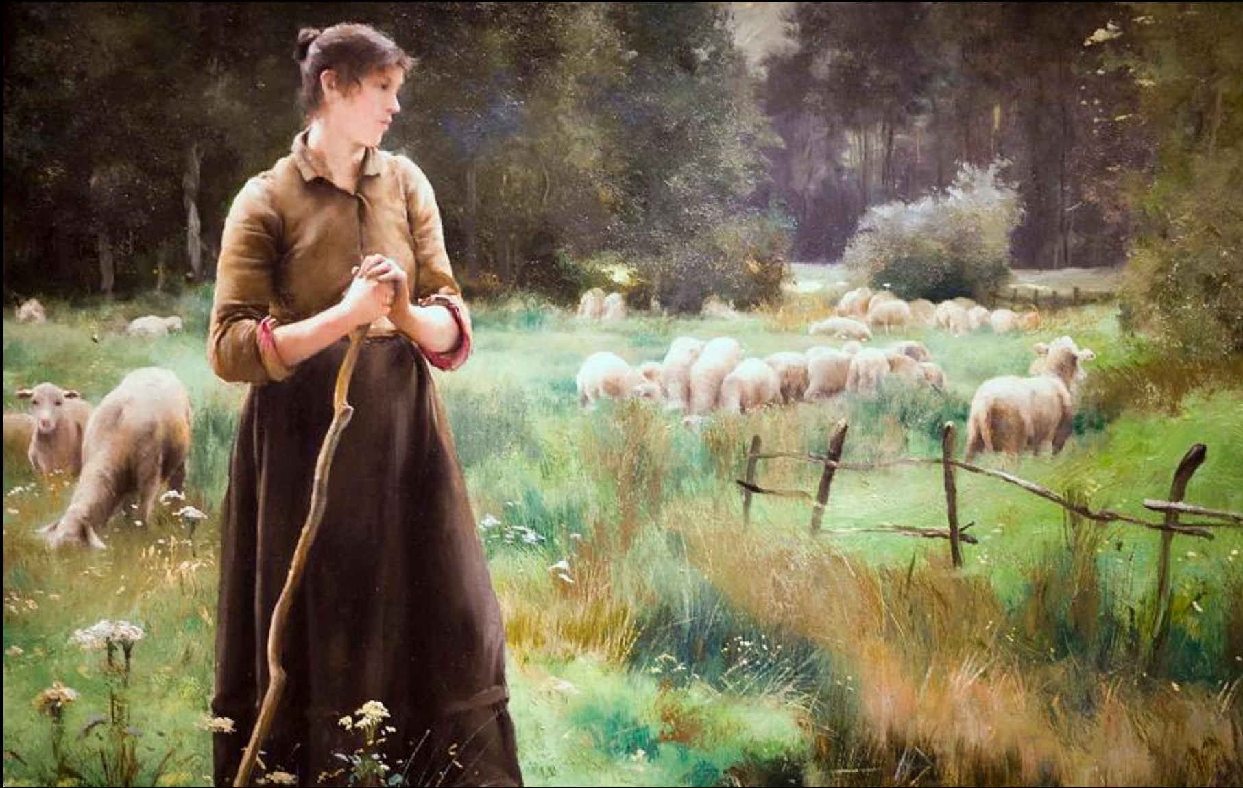
The Good Shepherd -- Julien Dupre, Legion of Honor Museum, San Francisco, CA