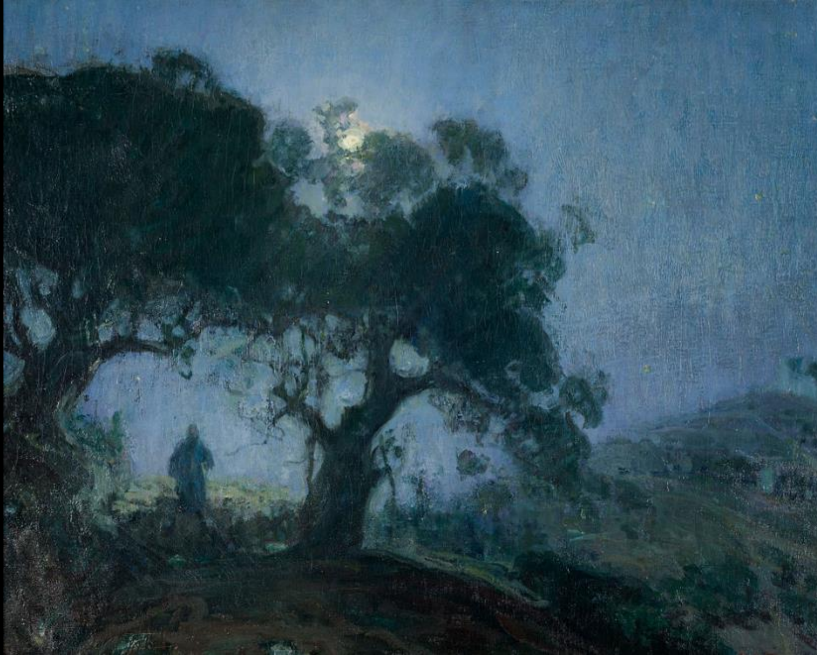
The Good Shepherd -- Henry Ossawa Tanner, Zimmerli Museum, Rutgers, NJ