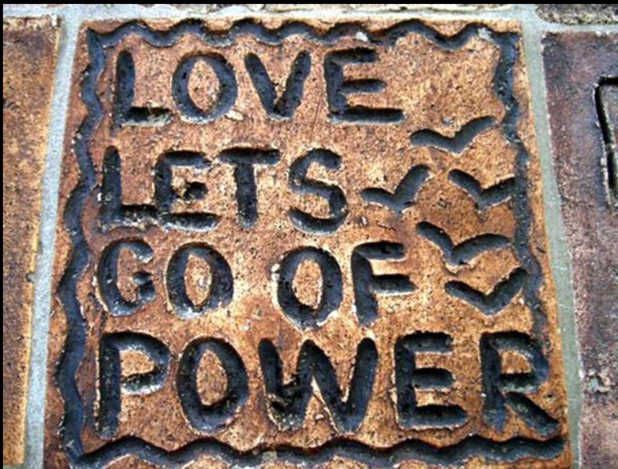
Tile from Peace Wall, Hamilton, New Zealand