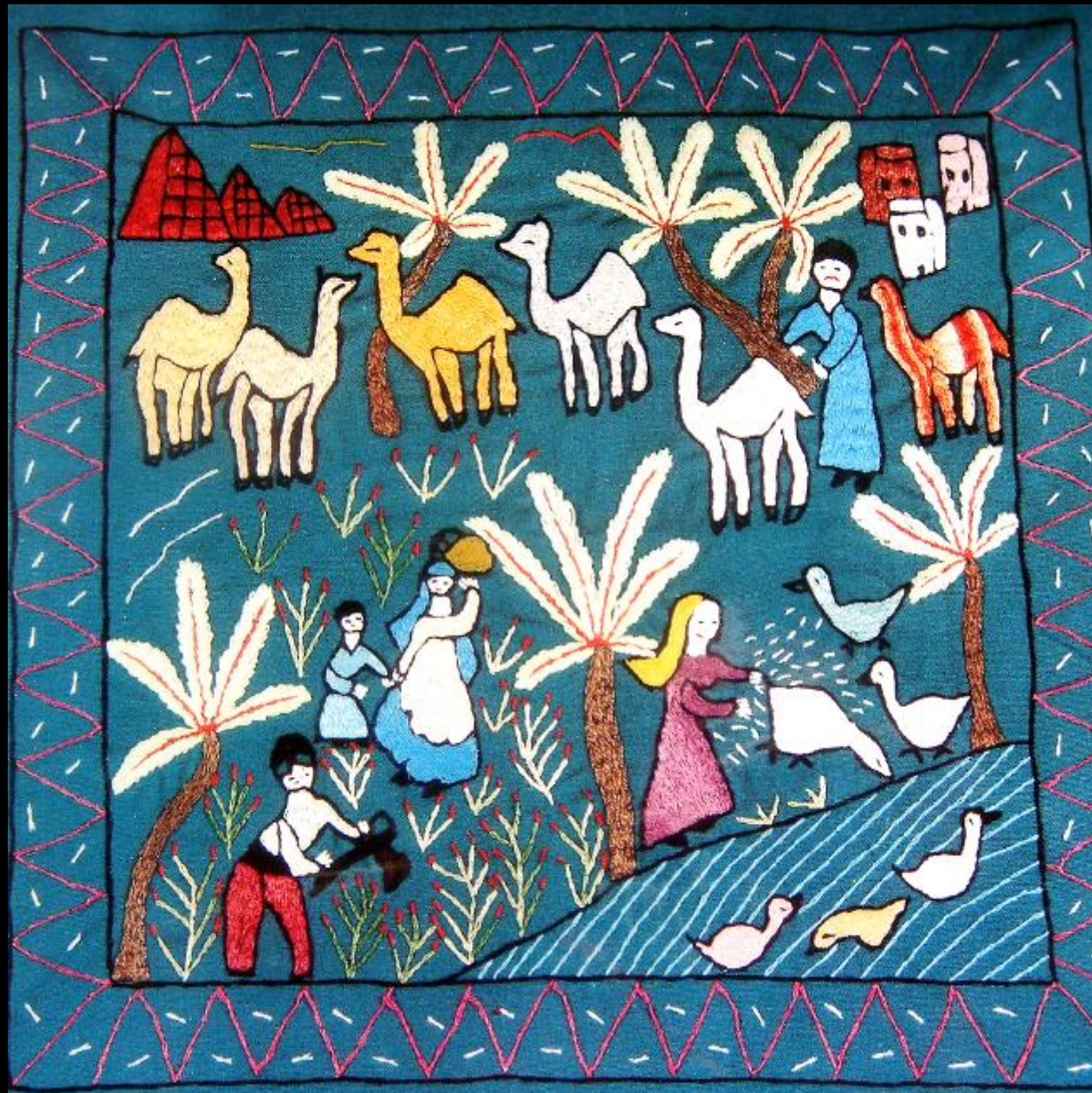
Daily Life -- Mottamadya Women's Association, Cairo, Egypt