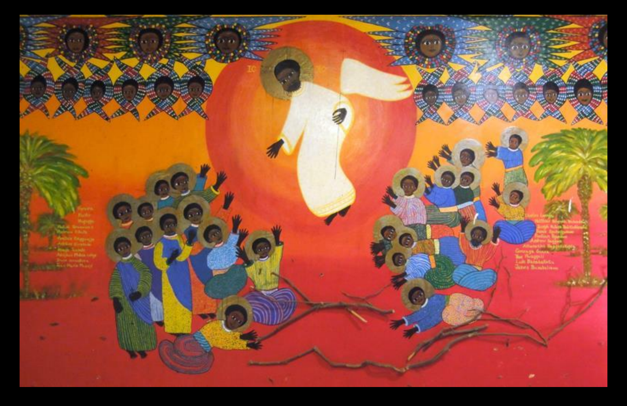
Martyrs of Uganda -- Emmaus House, Kampala, Uganda