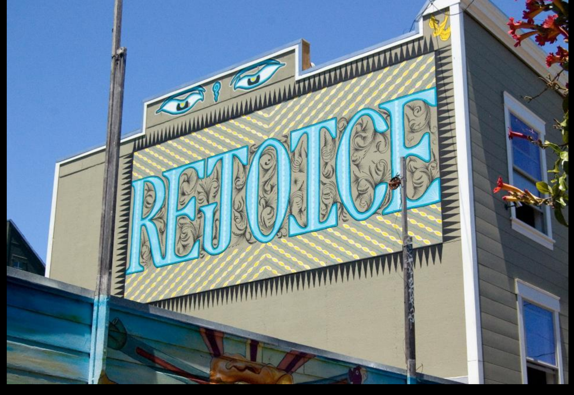
Rejoice! -- Mural in Mission District, San Francisco, CA