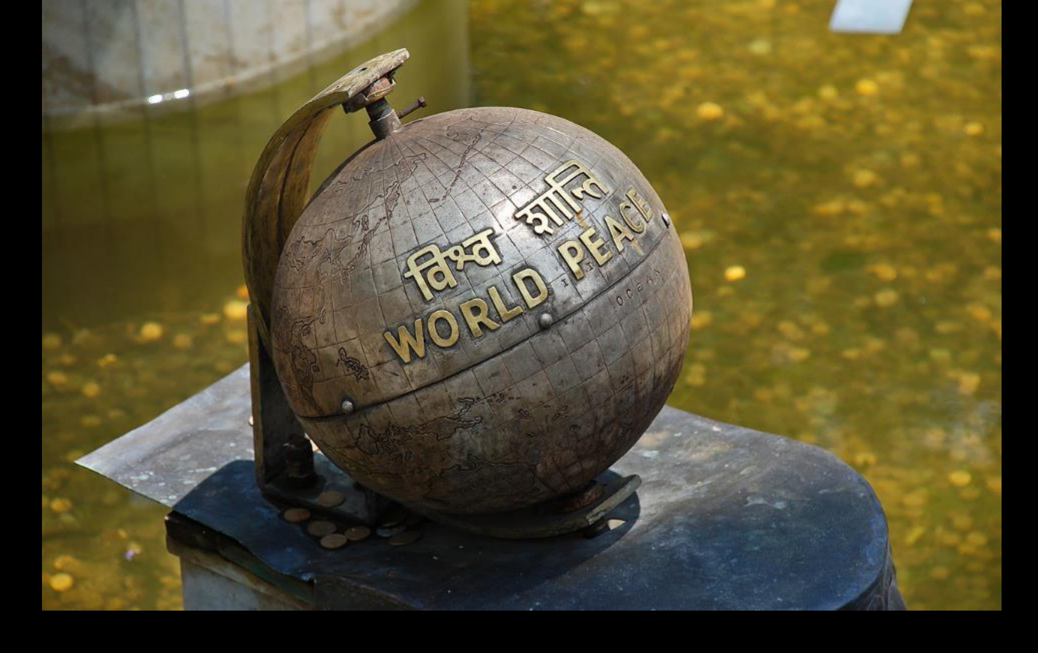
World Peace Monument -- Swayambhunath Temple Garden, Kathmandu, Nepal