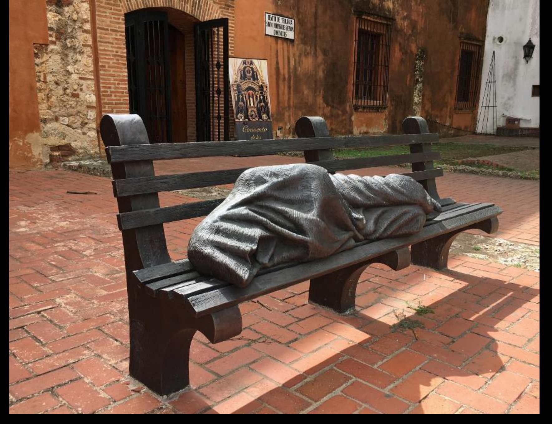
Homeless Jesus -- Timothy Schmaltz, Dominican Convent, Santo Domingo, Dominican Republic