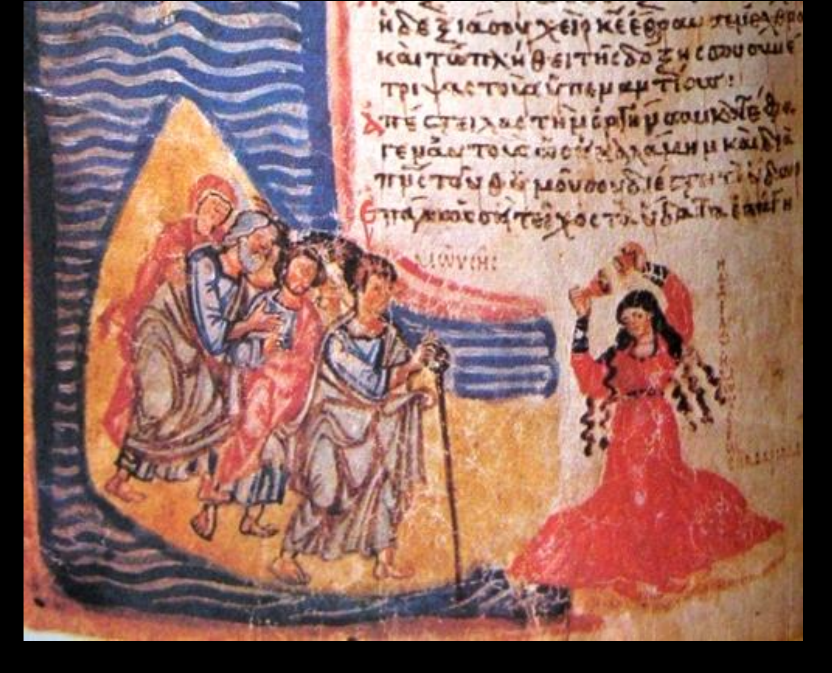
Dance of Miriam upon Crossing the Red Sea -- Chludov Psalter, State Hist. Museum, Moscow