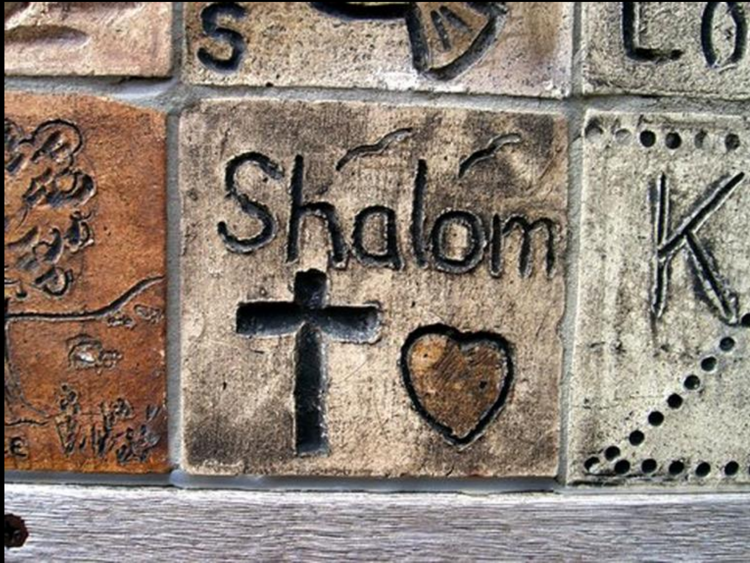
Shalom – Peace Wall -- Hamilton, New Zealand