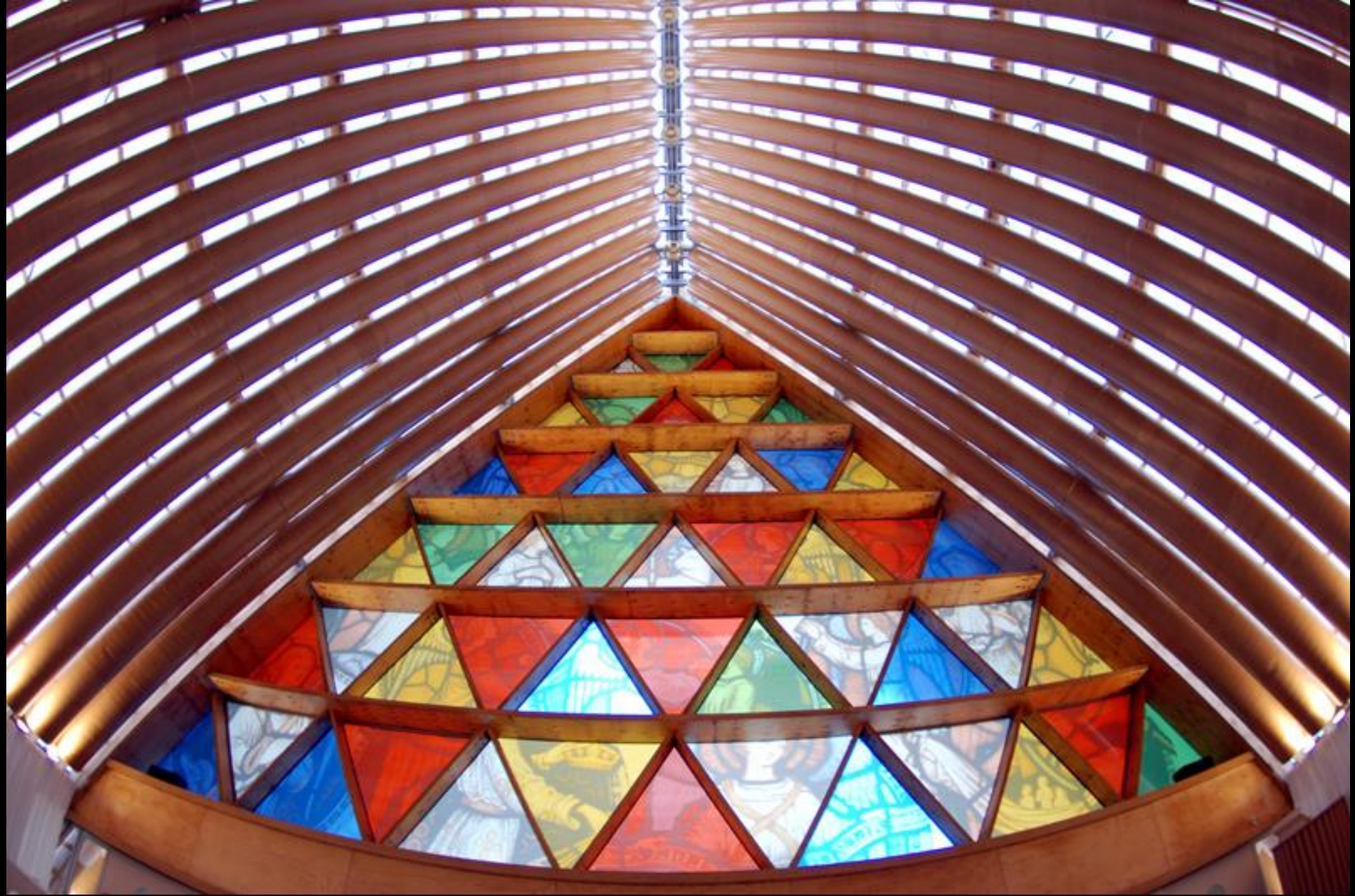
Cardboard Cathedral – Shigeru Ban, Christchurch, New Zealand