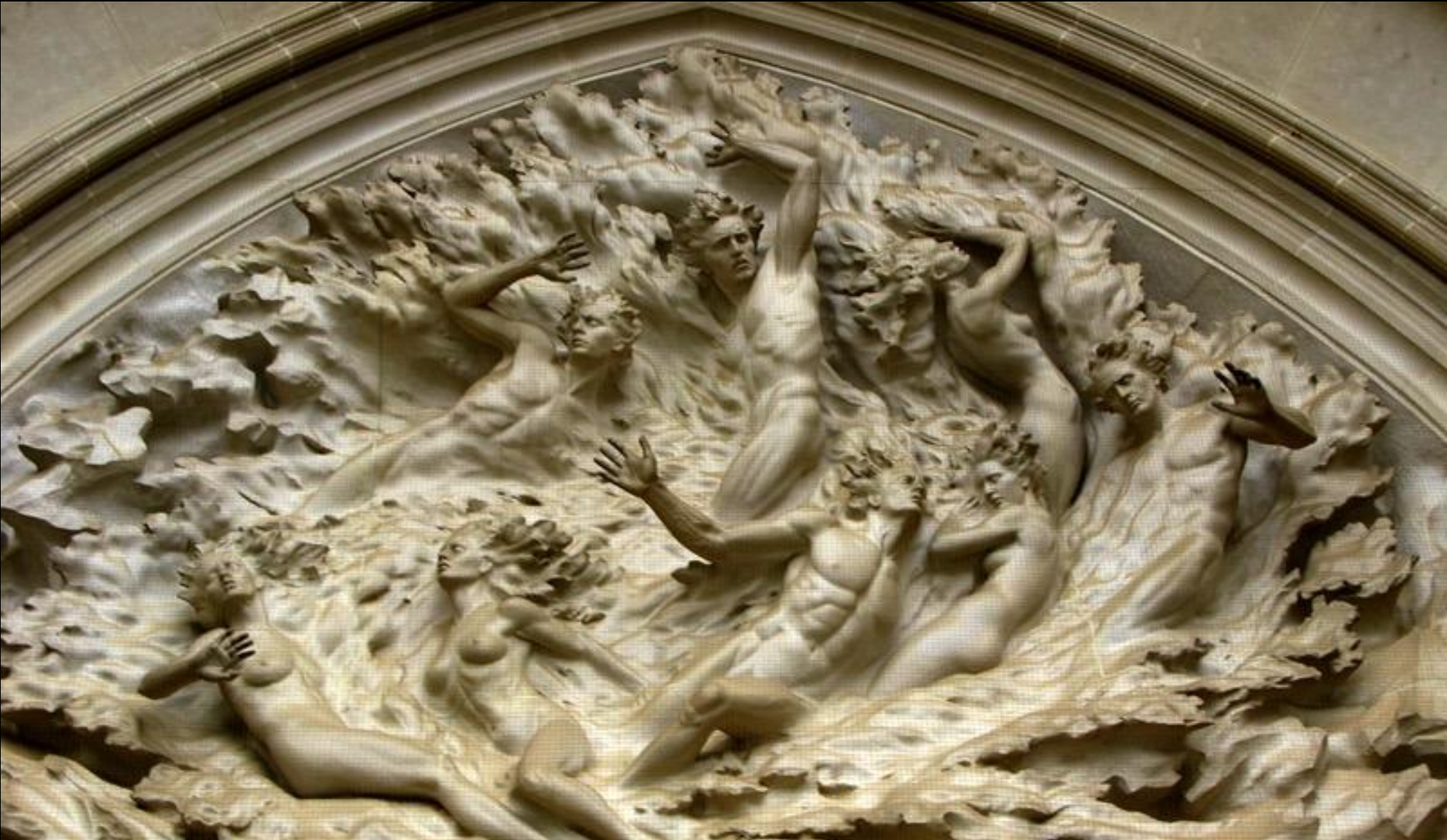
The Deluge -- Frederick Hart, Washington National Cathedral