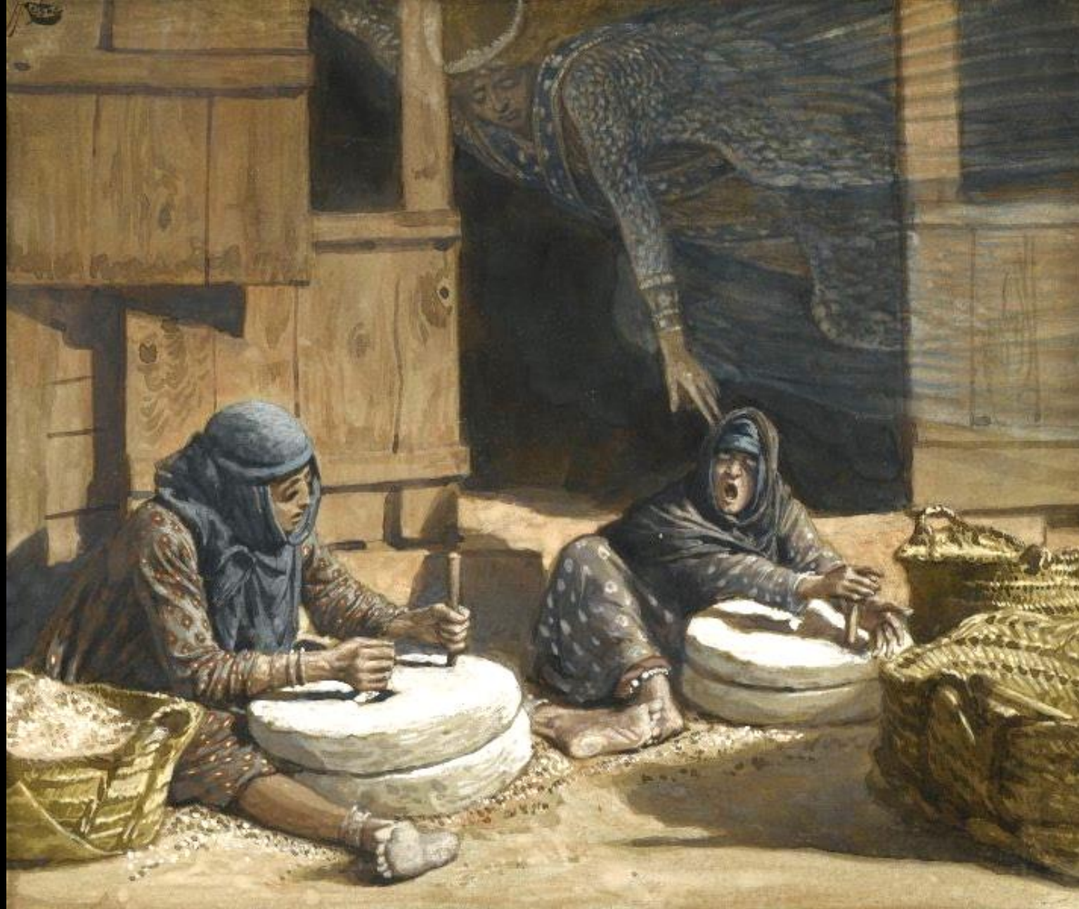
Two Women at the Mill -- James Tissot, Brooklyn Museum