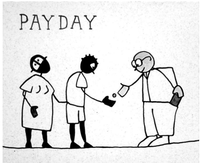
THE BIG DIVIDE, Eden Project, Kernow, Cornwall, UK, ca. 2010

marriage be held in honor by all, and let the marriage bed be kept undefiled; for God will judge fornicators and adulterers. Keep your lives free from the love of money, and be content with what you have; for he has said, "I will never leave you or forsake you." So we can say with confidence, "The Lord is my helper; I will not be afraid. What can anyone do to me?" Remember your leaders, those who spoke the word of God to you; consider the outcome of their way of life, and imitate their faith. Jesus Christ is the same yesterday and today and forever. Through him, then, let us continually offer a sacrifice of praise to God, that is, the fruit of lips that confess his name. Do not neglect to do good and to share what you have, for such sacrifices are pleasing to God.