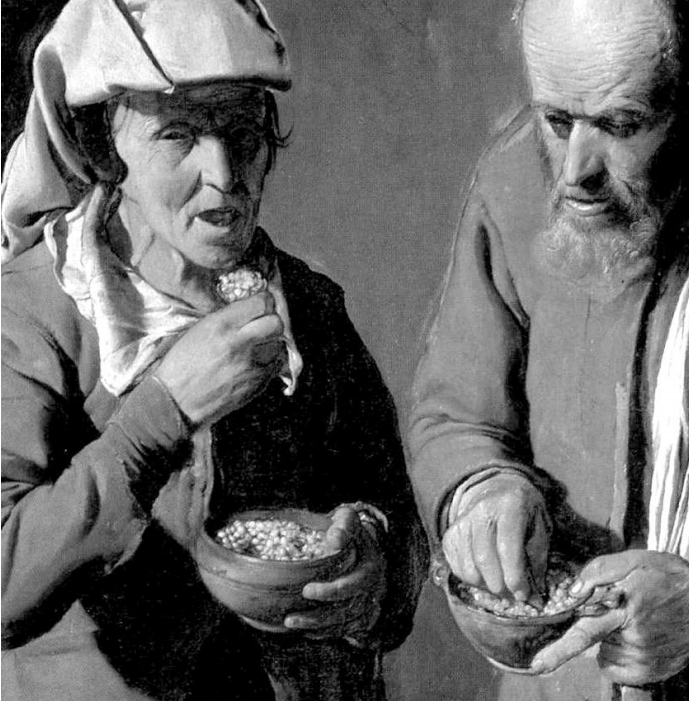
Peasant Couple Eating (detail)

George de la Tour, Gemaldegalerie, Berlin, Germany, ca. 1620.